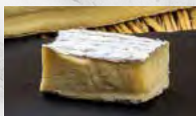
BRIE DE MEAUX (50g)