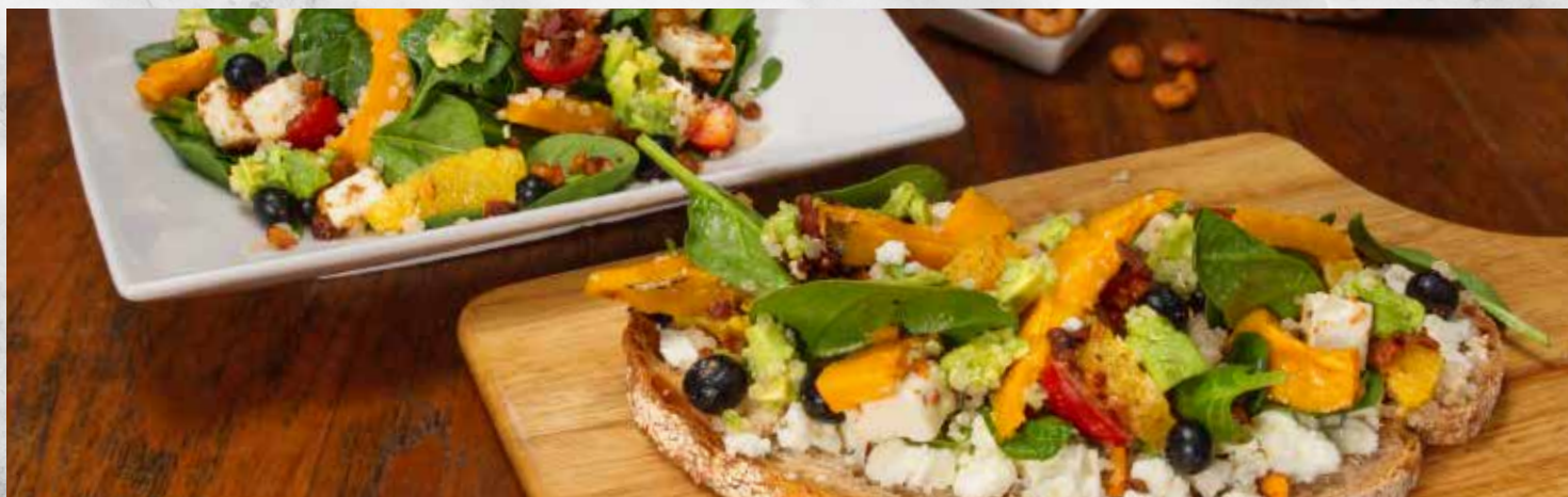
Superfood Salad or Tartine 🌱