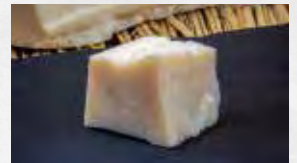
PARMIGIANO REGGIANO (50g)