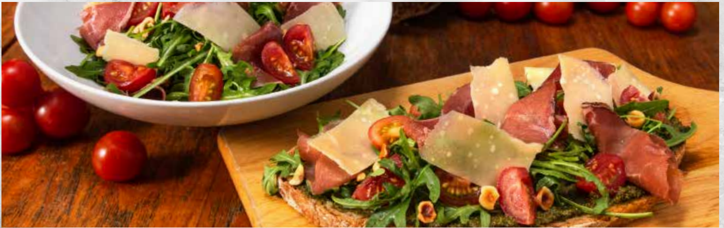
Italian Salad or Tartine