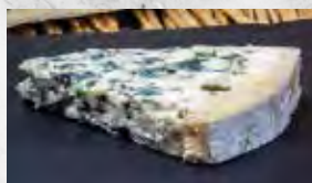
BLEU D'AUVERGNE (50g)