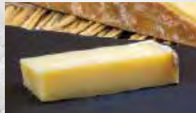
CANTAL "ENTRE DEUX" (50g)

Raw cow milk Powerful, dense and mild spicy