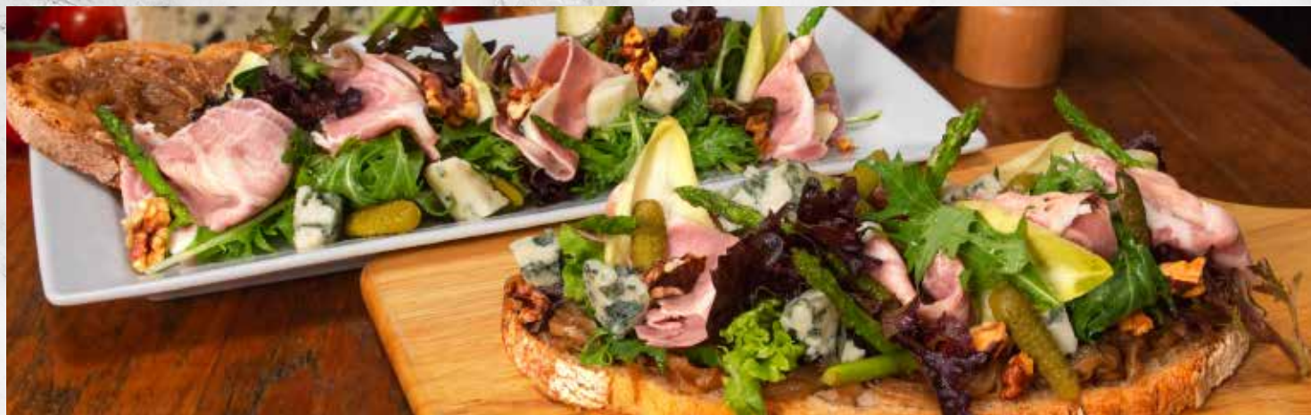
French Salad or Tartine

Super! Packed with Iron, Fiber, Vitamins and Antioxidants dressed with tangy sweet honey lemon dressing for the body's everyday needs.