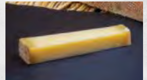
COMTE 18 MONTHS (50g)

Pasteurised cow milk Aged, musky and powerful