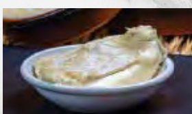
SAINT FELICIEAN CREMIER (45g)