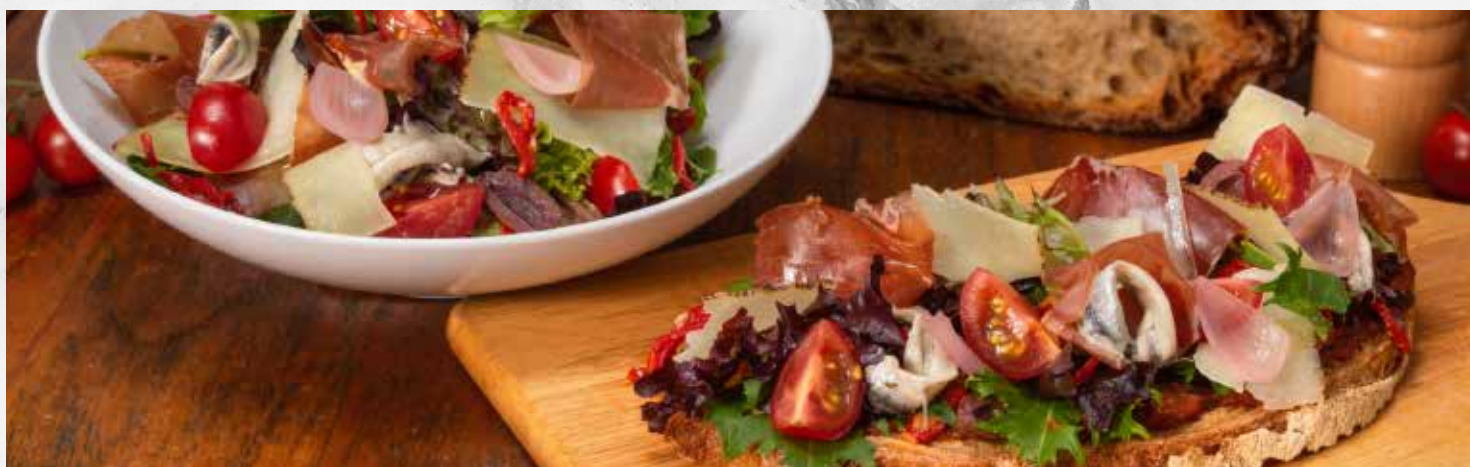
Spanish Salad or Tartine

Fresh mixed salad tossed in classic French dressing, topped with Roquefort cheese, toasted walnut, Thai asparagus, cooked ham and gherkins.