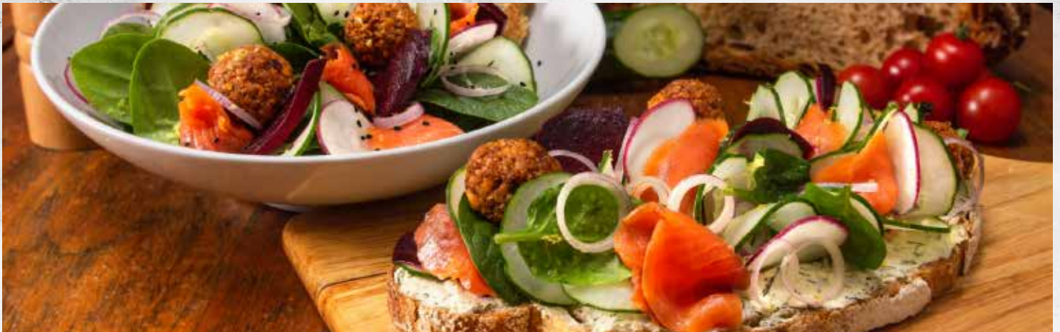
Nordic Salad or Tartine

Freshly sliced Dry-Aged Beef rested upon a mixture of peppery arugula salad, cherry tomato, classic Italian pesto, topped with grated Parmeggiano and crushed hazelnuts.