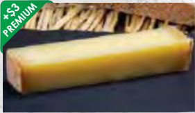
GRUYÈRE 12 MONTHS (50g)