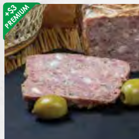
HOMEMADE TERRINE (60g) (contains pork)

WINE PAIRING - Sangiovese, Tempranillo, Chardonnay