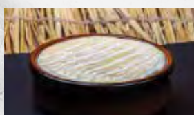
SAINT MARCELLIN (40g)

Pasteurised cow milk Creamy, soft and fermented