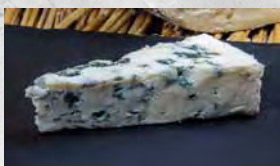
FOURME D'AMBERT (50g)

Raw cow milk Smooth and creamy, strong and lactic