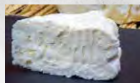
DELICE DE BOURGOGNE (50g)

Pasteurised cow milk Crumbly, fruity and mushroomy