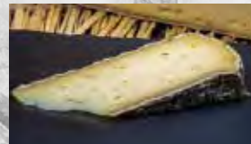
TOMME DE SAVOIE (50g)