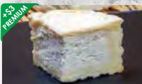
L'AFFINE AU CHABLIS (50g)

Raw cow milk Strong and ripe, washed with alcohol