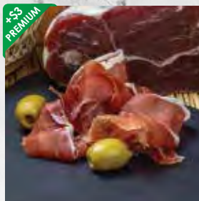
SERRANO HAM (40g)