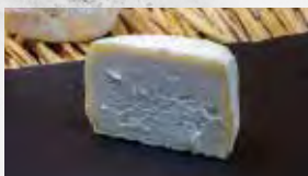
CROTTIN DE CHEVRE (30g)