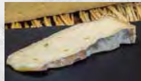
SAINT NECTAIRE (50g)