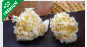
TÊTE DE MOINE (50g)

Raw cow milk Balanced, milky and complex