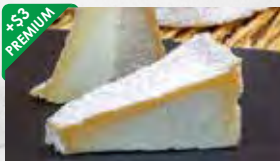
POULLIGNY ST PIERRE (40g)

Pasteurised goat milk Smooth, pleasant and lightly sweet