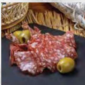
FRENCH ROSETTE (45g)