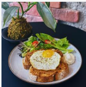
Pulled Pork Toast

Freshly fried shoestring fries topped with our homemade mentaiko mayo sauce and we flame torch it to bring out the umami