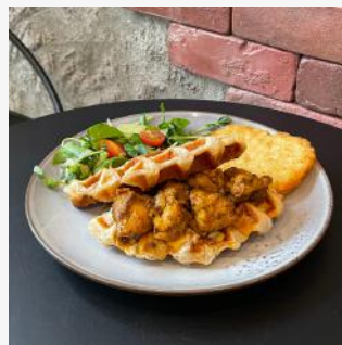
Chicken Rendang Croffle

Chicken stew with coconut milk and mix of spices and top it on buttery croffle, served with hasbrown and side salad.