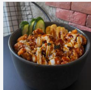
Crispy Chix Don