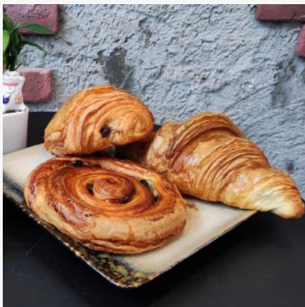
Croissant | Pain Au Chocolat | Raisin Roll