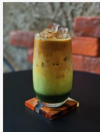
Matcha Coffee Latte

*All prices are before 10% service charge