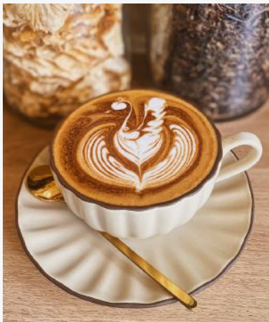
Toffee Nut Latte