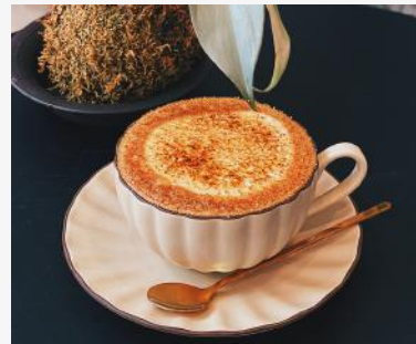
Brown Sugar Latte