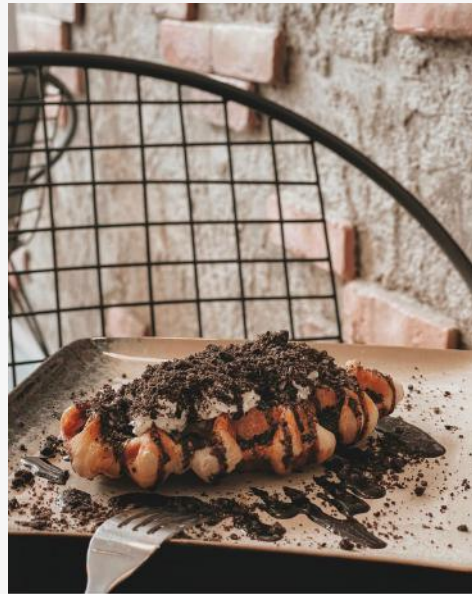
Cookies and Cream Croffle