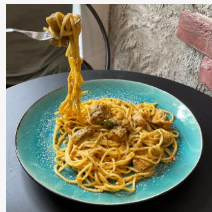
Cheesy Curry Chicken Rendang