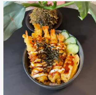
Tempura Prawn Don