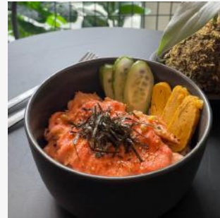
Aburi Mentaiko Salmon Don

Freshly fried tempura prawn, crispy on the outside and tender on the inside. Drizzled with teriyaki and tartar sauce, Topped with roasted seaweed and furikake.