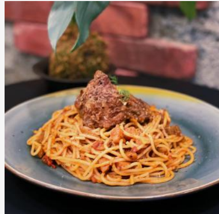
Beef Cheek Pasta

Spicy, galicky and taste of the sea. Full of umami!