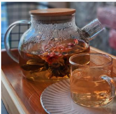
Rose Blooming Tea