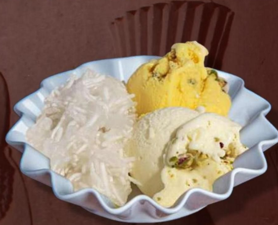
FALOODEH WITH PERSIAN ICE CREAM