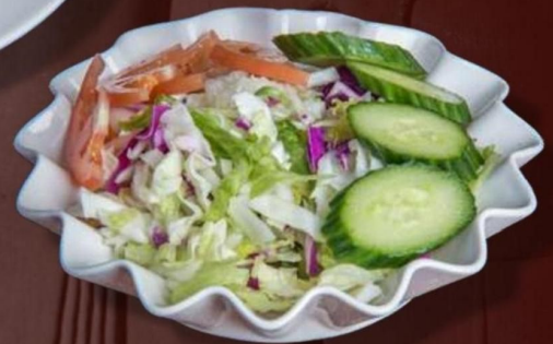
FRESH GREEN SALAD