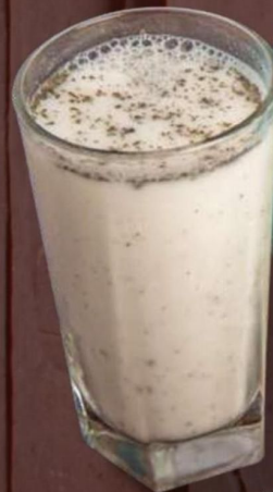
DOUGH (SALTY LASSI)