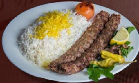
CHELO KEBAB KOOBIDEH