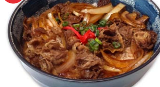
Gyudon - Beef Rice Bowl £9.20