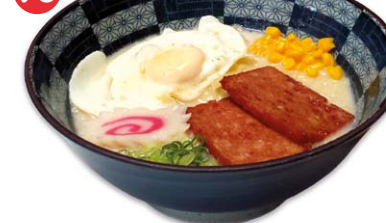
Tonkotsu Ramen (Pork bone broth, luncheon meat, egg, sweetcorn, spring onion with ramen and soup) £11.80