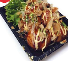
Takoyaki - Octopus Balls (5pcs) £5.00