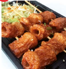
Chikuwa – Fish Skewers (3pcs) £4.80