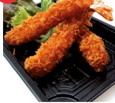
Ebi Fry – Fried King Prawn (3pcs) £5.20