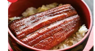
Unadon - Eel Rice Bowl £14.00