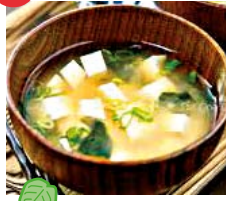
Miso Soup £2.60