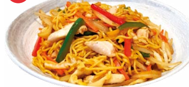
Chicken yakisoba £9.50