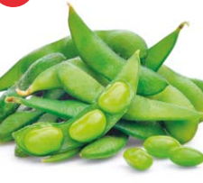
Edamame – Soya Beans £3.50