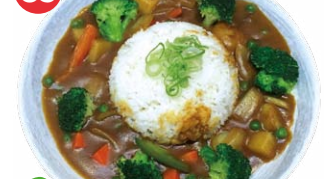
Vegetable Curry contains nuts £8.20