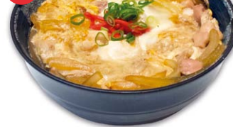
Oyakodon - Free Range Chicken and Egg Rice Bowl £8.90