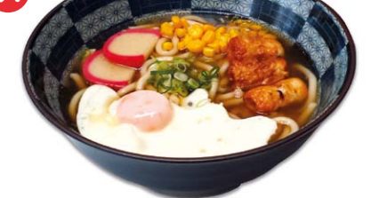
Chikuwa Udon Noodle Soup (Fish Roll, egg, sweetcorn, spring onion with thick white noodle and soup) £11.80

Yakisoba: Thin, wheat flour noodles - Udon: Thick, white wheat noodles