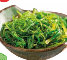
Seaweed Salad £4.80