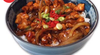
Chicken Teriyaki Rice Bowl £8.90