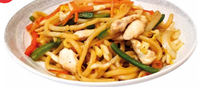
Chicken udon £9.50