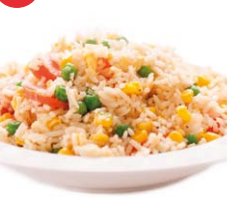
Japanese Fried Rice £4.20