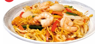
Seafood yakisoba £9.90