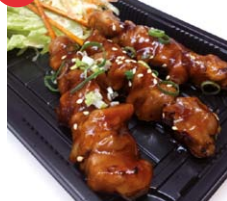
Yakitori – Chicken Skewers (3pcs) £4.30