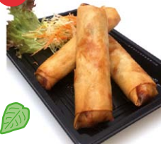
Vegetable Spring Rolls (3pcs) £3.50