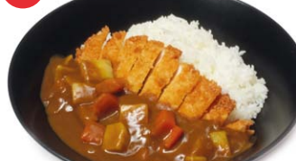
Chicken Katsu Curry contains nuts £8.90