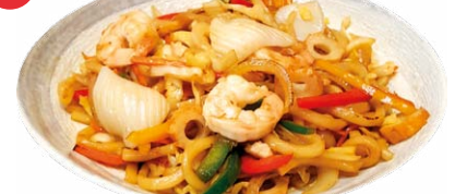
Seafood udon £9.90