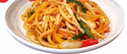
Vegetarian udon £8.90