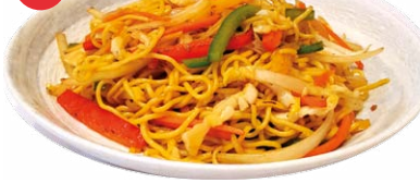
Vegetarian yakisoba £8.90