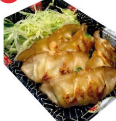
Chicken Gyoza – Chicken Dumpling (5pcs) £5.50