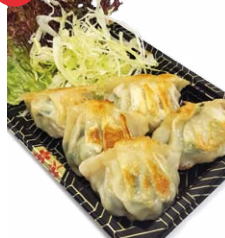
Prawn Gyoza – Prawn Dumpling (5pcs) £6.20