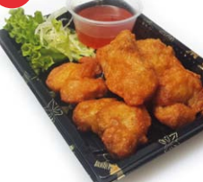
Chicken Karaage - Japanese fried chicken (5pcs) £4.50