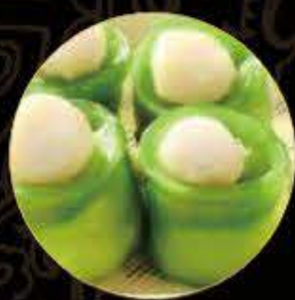
帶子餃 Scallop Dumpling (3)