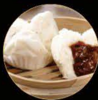
懷舊叉燒包 BBQ Pork Bun (3)