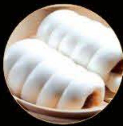
臘腸卷 Steamed Chinese Sausage Roll (2)