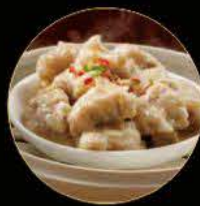
豉汁蒸排骨 Pork Rib with Black Bean Sauce