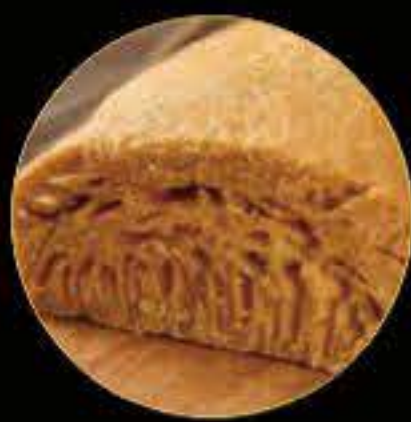
馬拉糕 Steamed Sponge Cake