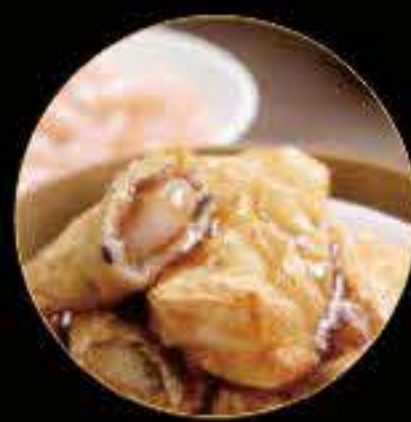
海鮮腐皮卷 Seafood Beancurd Skin Roll (3)