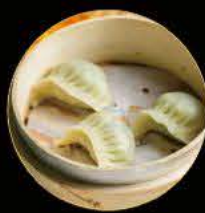
素餃 Steamed Vegetarian Dumpling (3)