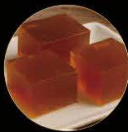
馬蹄糕 Water Chestnut Pudding (3)