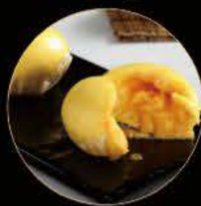
流沙包 Salted Egg Custard Bun (3)