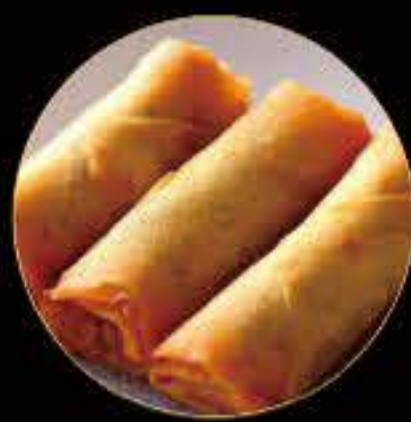
海鮮春卷 Seafood Spring Roll (3)