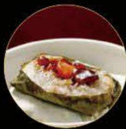
糯米雞 Sticky Rice in Lotus Leaf (2)