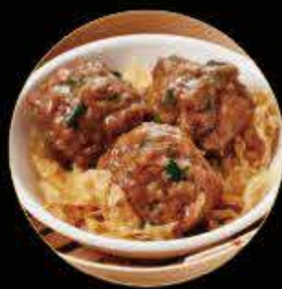
山竹牛肉球 Steamed Beef Ball (3)