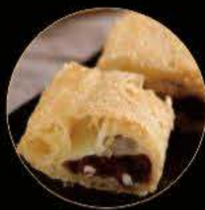
紅豆餅 Red Bean Cake (3)

Disclaimer: All pictures are for reference only. Presentation can be changed without prior notice. Dishes may contain traces of nuts, gluten and seafood product. Management holds no responsibility for allergy issues.