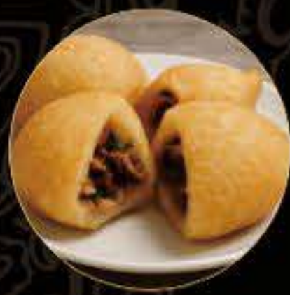
鹹水角 Deep Fried Savoury Pork Dumpling (3)