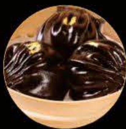
黑松露蝦餃 Black Truffle Shrimp Dumpling (3)