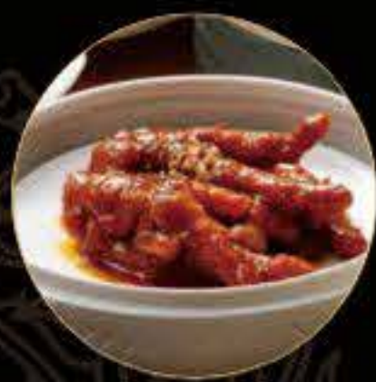
豉汁蒸雞爪 Chicken Feet with Black Bean Sauce