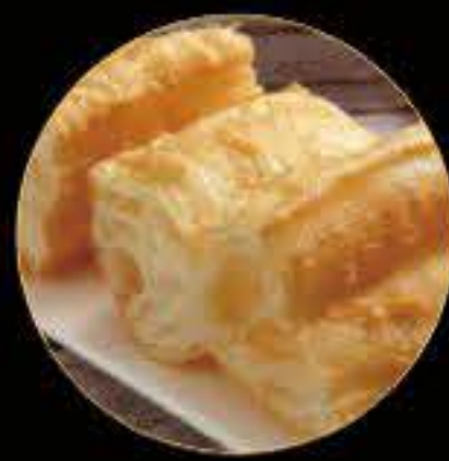
油條 Chinese Fried Dough Sticks