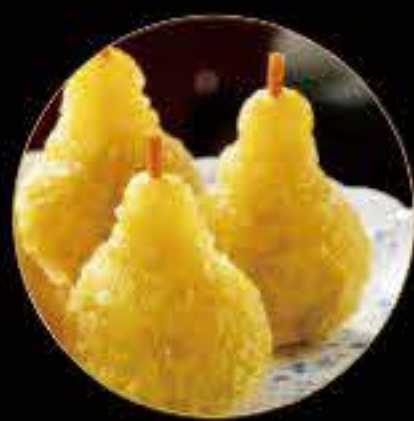
蓮蓉雪梨 Lotus Pears (3)