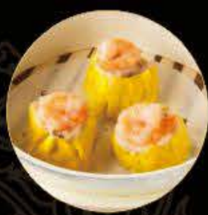
燒賣 Pork and Shrimp Dumpling (3)