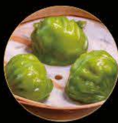
藤椒蝦餃 Sichuan Pepper Shrimp Dumpling (3)