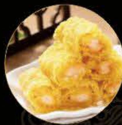
香脆蝦卷 Deep Fried Shrimp Roll (3)