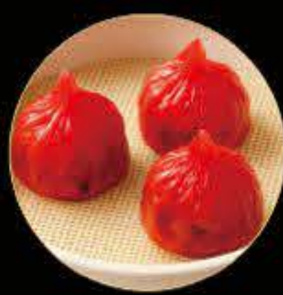
菌菇魚餃 Mushroom Fish Dumpling (3)