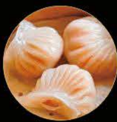
蝦餃皇 Prawn Dumpling (3)