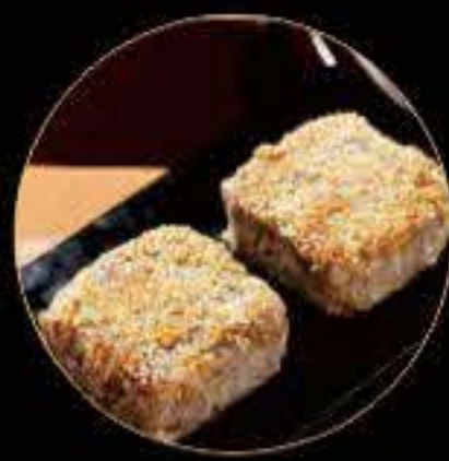
芋絲糕 Taro Cake (3)