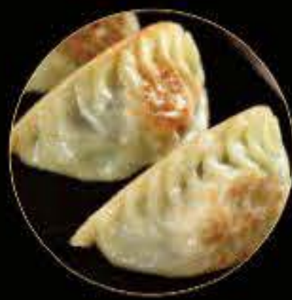
韭菜煎餃 Pan Fried Chive Dumpling (3)