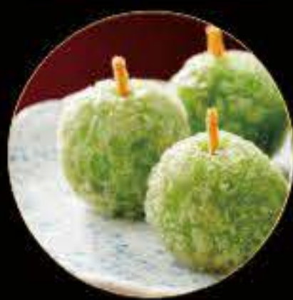
豆沙青蘋果 Red Bean Apple (3)