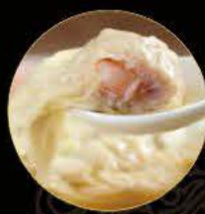
鮮蝦雲吞 Shrimp Wonton (3)