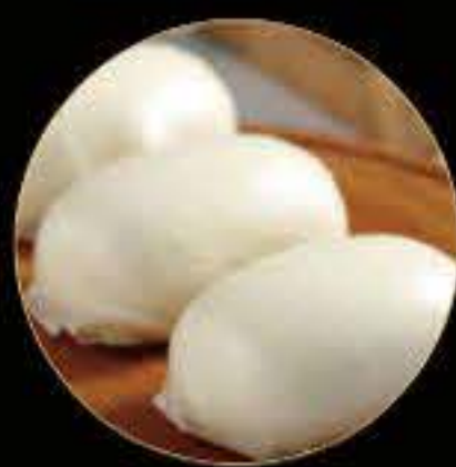
奶香饅頭 Steamed Milk Bun (3)