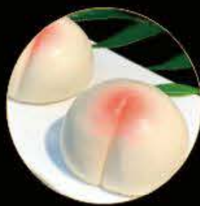
壽桃包 Longevity Peach Bun (3)