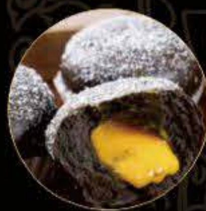
黑金流沙包 Black Salted Egg Custard Bun (3)