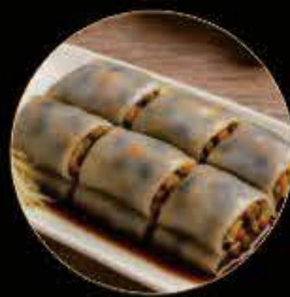
羅漢齋腸粉粉 Steamed Vegetarian Rice Noodle Roll