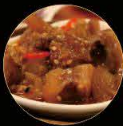
柱侯牛筋 Steamed Beef Tendon