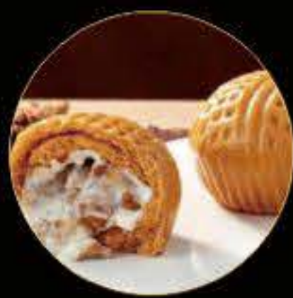
核桃包 Walnut Bun (3)