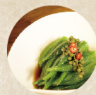
Iced Okra 冰镇秋葵