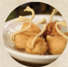
Swan-Shaped Durian Cake 天鹅酥