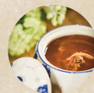
Braised Chicken Soup with Cordyceps Flowers 虫草花炖鸡