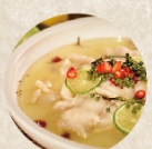
Hot and Sour Barramundi with Lime 红头青柠酸菜鱼 (盲曹)