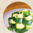
Cucumber with Minced Garlic 蒜泥黄瓜卷