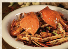
Corn Kernel Crab 金沙玉米蟹 $58.9