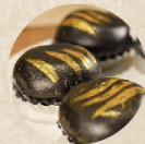
Chinese Steamed Custard Buns 金丝流沙包