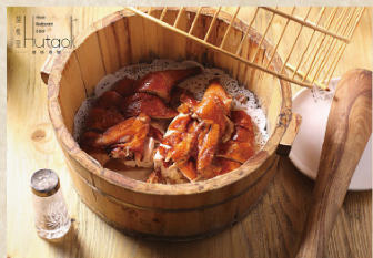
HUTAOLI Signature Roasted Free-Ranged Chicken 胡桃里招牌烤鸡 (走地鸡) $29.9 Half 半只 / $58.9 Whole 一只