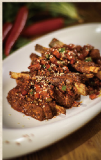
HUTAOLI Signature Roasted Lamb Chops 胡桃里焗烤小羊排 $29.9