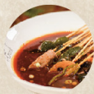
Assorted Skewers in Chilli & Pepper Sauce 上上签