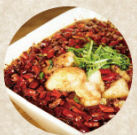
Boiled Fish Slices with Celery in Hot Chilli Oil 霸王沸腾鱼