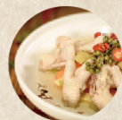
Chicken Feet in Pickled Chilli Sauce 泡椒凤爪