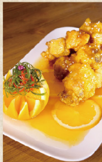
Orange Flavoured Pork Ribs 橙花酒香排骨 $32.9