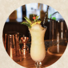
Pina Colada 椰林飘香