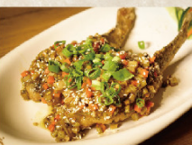
Crispy Yellow Croaker with Sichuan Pepper 椒麻酥黄鱼 $28.9