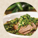
Sliced Beef Marinated in Rice Wine 烧椒酒香牛肉