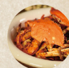
Deep Fried Shrimp and Crab in Chilli and Sichuan Pepper 虾兵蟹将