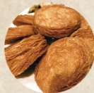
Red Bean Cakes 红豆金丝饼