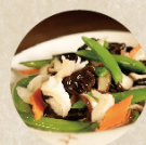
Stir Fried Shrimps and Seasonal Vegetables 四季小炒