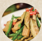
Sauteed Eggplant with Long Bean 茄香豆角