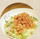
Braised Chinese Cabbage with Egg Crisp 蛋酥白菜