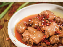
Slow Cooked Pig's Feet 旺旺猪手 $23.9