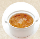
Stewed White Fungus Soup with Osmanthus and Peach Gum 桃胶银耳羹