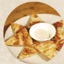
Fried Scallion Pancake 葱油饼