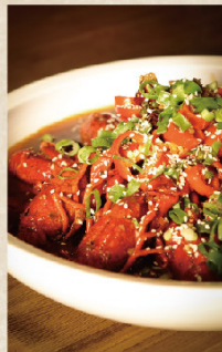
Crayfish in Deep Chilli 麻辣小龙虾 $39.9 Regular 小份 / $88.9 Large 大份