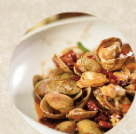
Fried Pepe in Chilli Sauce 辣子花蛤