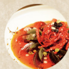
Century Egg Served with Sliced Capsicum 烧椒皮蛋