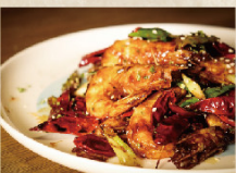
Deep Fried Spicy Crispy King Prawn 吮指皇帝虾 $32.9