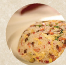
Fried Rice in Hutaoli Style 胡桃里爱马仕炒饭