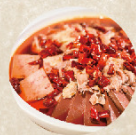
Tripe, Blood Curd, Beef and Luncheon in Hot Sauce 胡桃里毛血旺