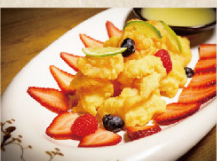
HUTAOLI Signature Deep Fried Fruity Prawn 胡桃里水果虾球 $36.9