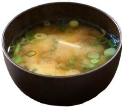
1. Miso Soup