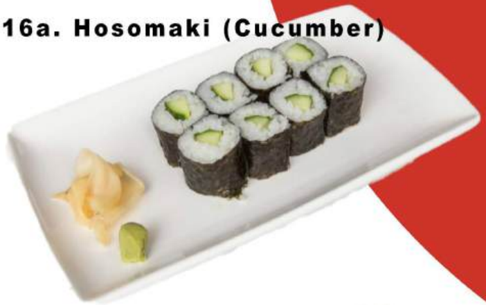
16a. Hosomaki (Cucumber)