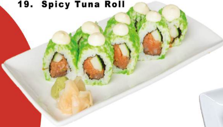
19. Spicy Tuna Roll