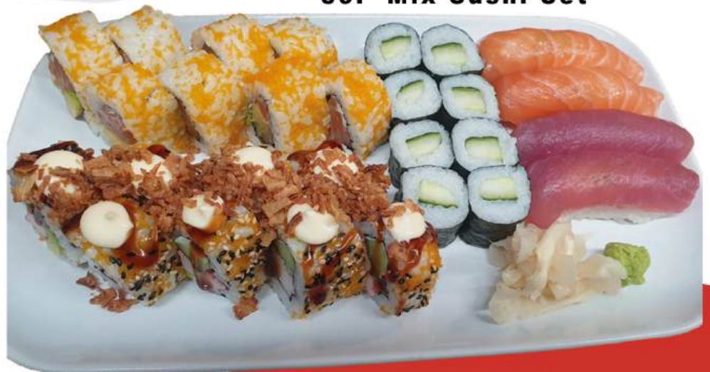
39. Mix Sushi Set