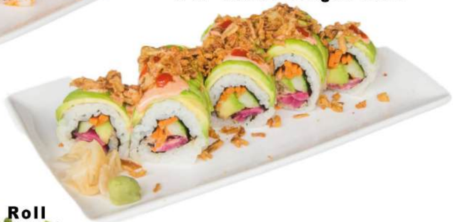
31. Yasai Dragon Roll