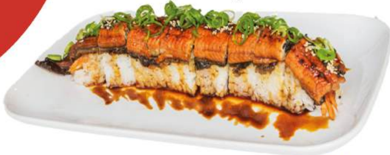
29. Unagi Dragon Roll