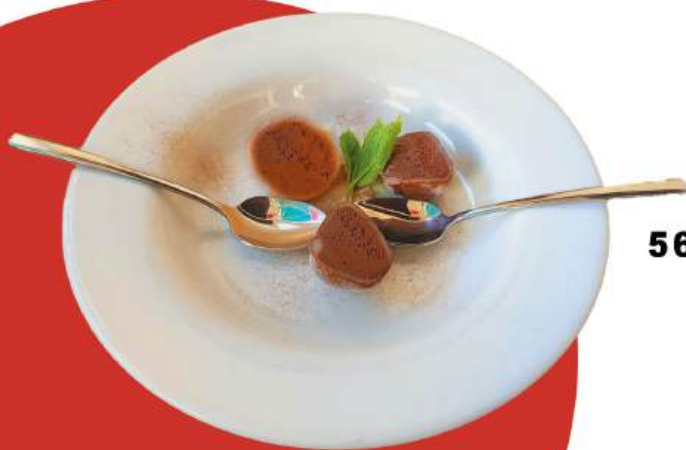
56. Chocolate Mochi (2 pieces)