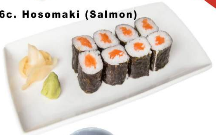
16c. Hosomaki (Salmon)