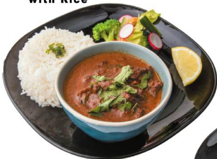
46. Himalayan Mutton Curry with Rice