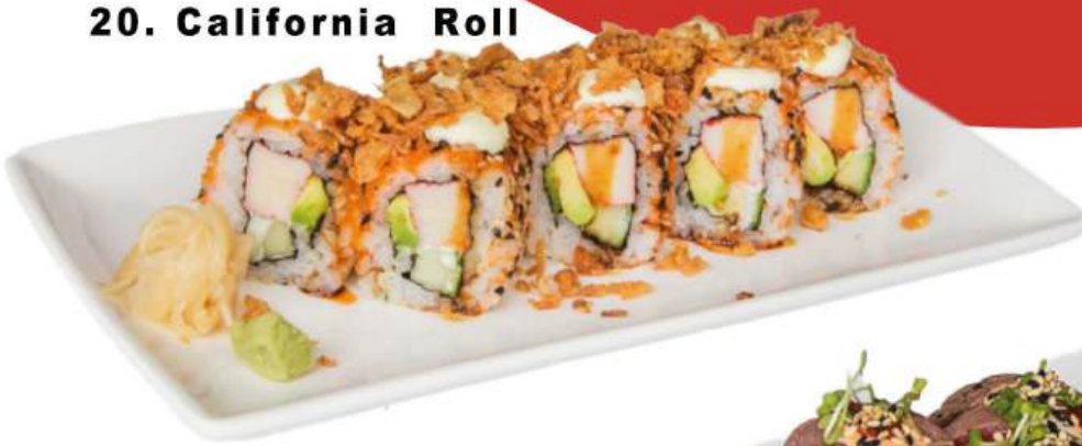
20. California Roll