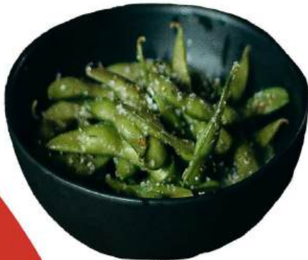
2. Edamame Beans