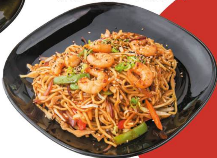
32c. Prawn Yakisoba