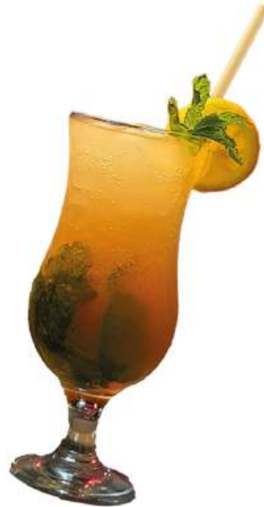
1. Virgin Mango Mojito