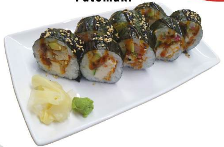
25. Spicy Chicken Futomaki