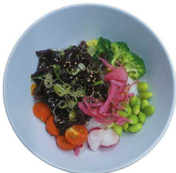
35c. Beef Donburi Rice Bowl