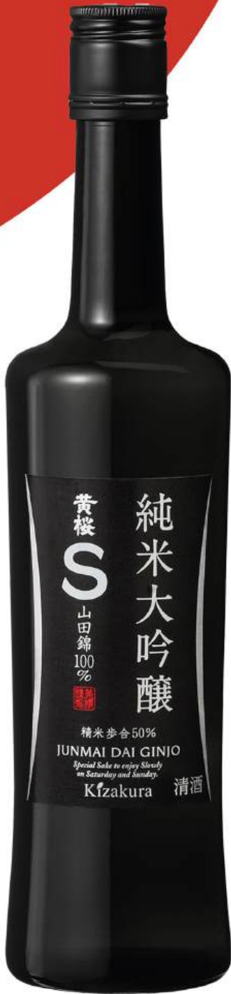
31. Premium Sake Kizakura Junmai Daiginjo 500 ml