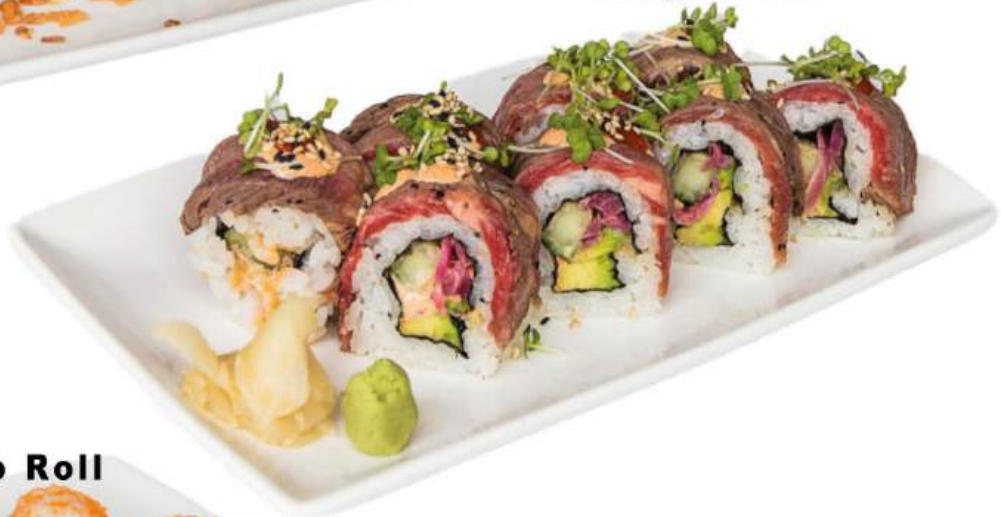
30. Konnichiwa Beef Dragon Roll