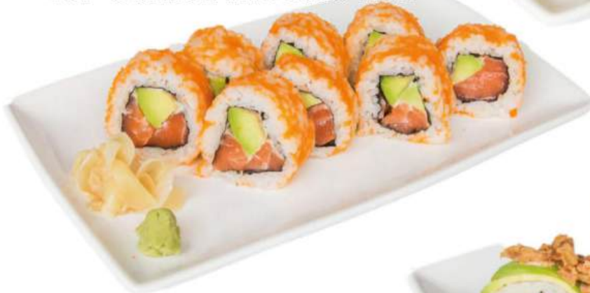
18. Salmon Avocado Roll