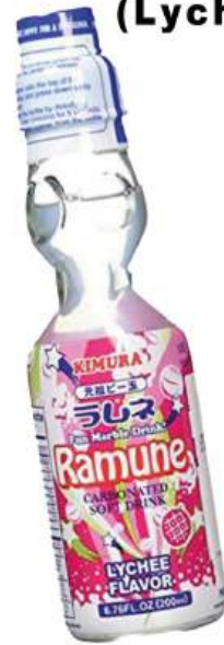
11. SK Ramune (Lychee)