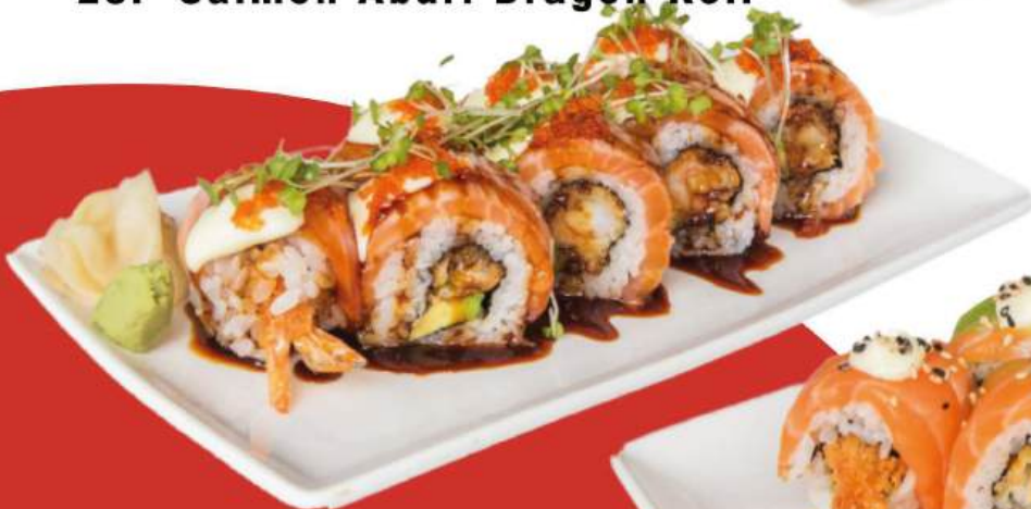
28. Salmon Aburi Dragon Roll