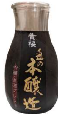
30. Kizakura Tsu No Honjzo 180ml