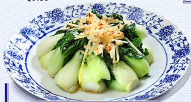
E6 蒜茸奶白/小芥兰 Fried Chinese Mustard / Baby Kai Lan