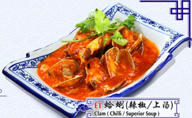
E1 蛤蜊(辣椒/上汤) Clam (Chilli / Superior Soup)