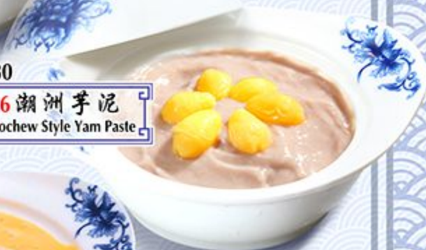
H6 潮州芋泥 Teochew Style Yam Paste