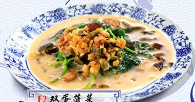
E2 双蛋菠菜 Chinese Spinach with Century Egg and Salted Egg