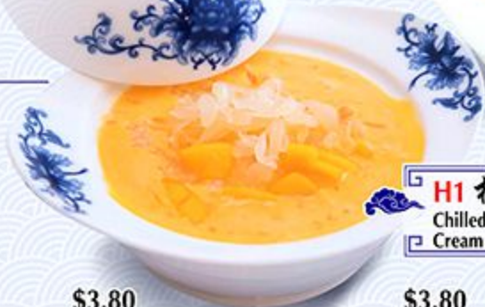
H1 杨枝甘露 Chilled Mango Sago Cream with Pomelo