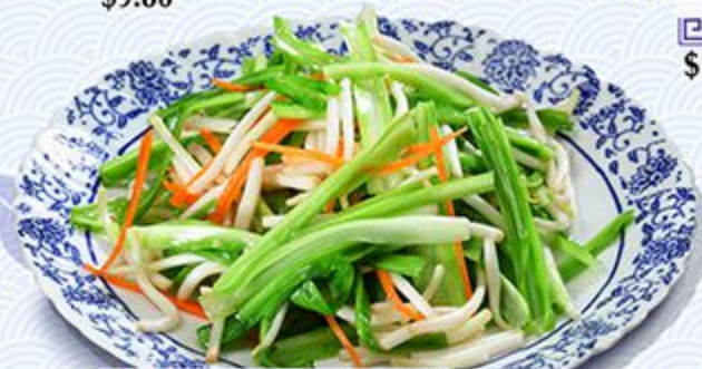
E4 清炒青龙菜 Fried 'Qing Long' Vegetable