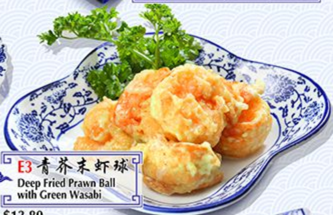
E3 青芥末虾球 Deep Fried Prawn Ball with Green Wasabi