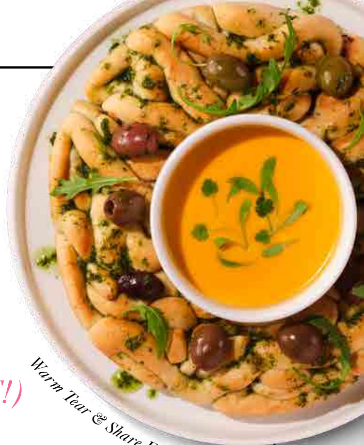
Warm Tear & Share Focaccia Bread

GRAB A PLATE AS A QUICK SNACK OR MIX THEM UP FOR A MEAL. WE RECOMMEND 3 PER PERSON. PERFECT FOR SHARING (OR NOT!)