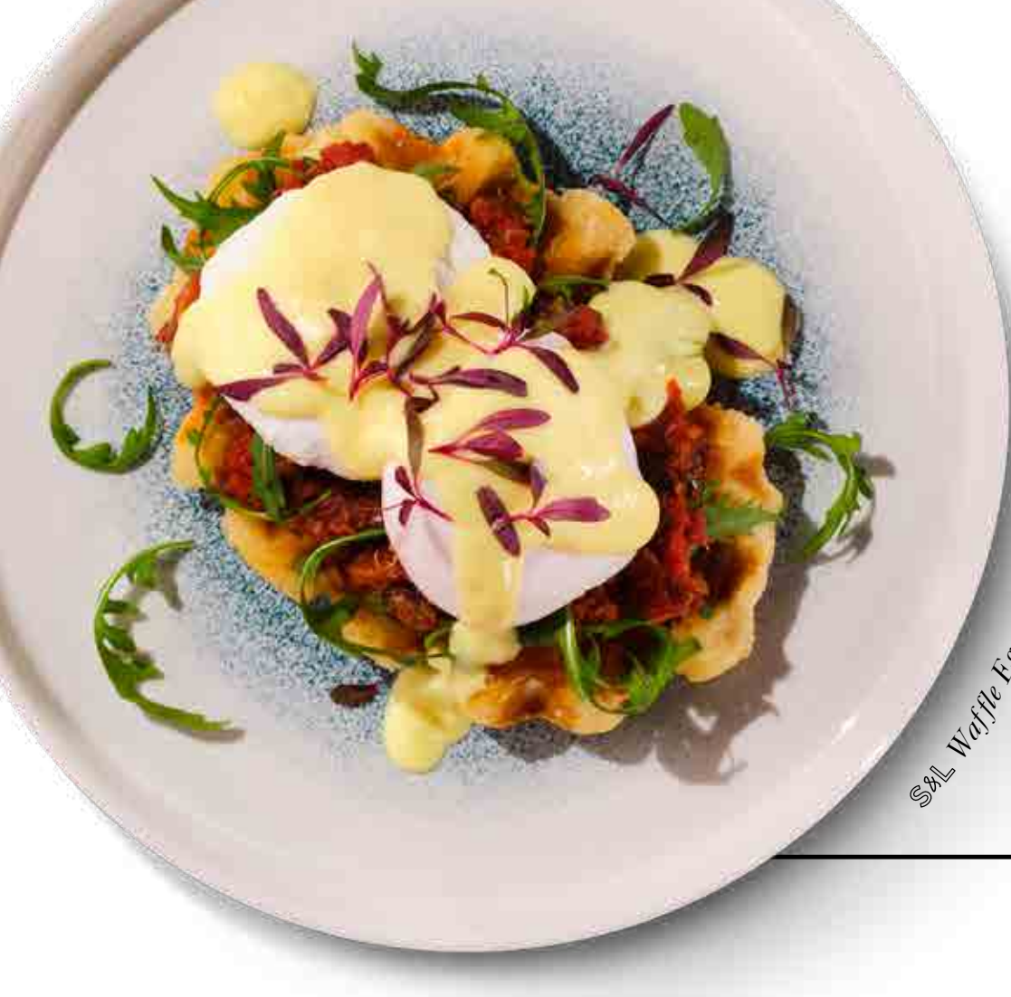
S&L Waffle Eggs