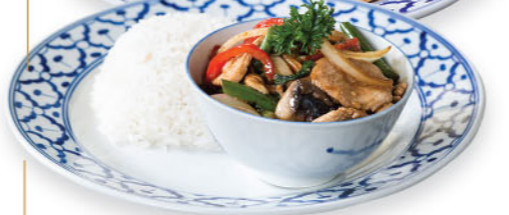
Garlic & Pepper Stir-Fried