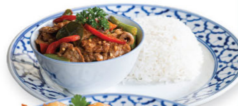
Basil & Chilli Stir-Fried