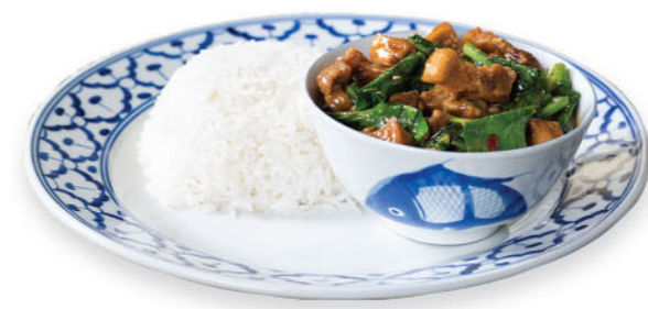
Roasted Duck with Rice 15.00