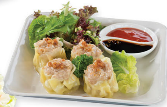
Steamed Pork Dim Sim 7.00