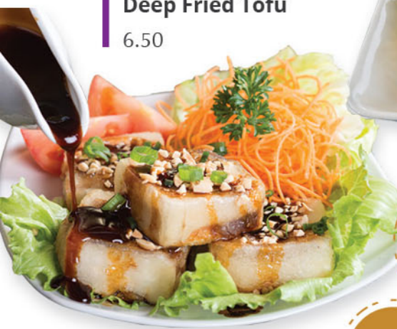
Deep Fried Tofu 6.50

+$2 to mains over 10.0 for a can of soft drink Coke, Diet Coke, Sprite