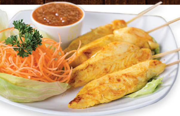
Grilled Satay Chicken 7.00