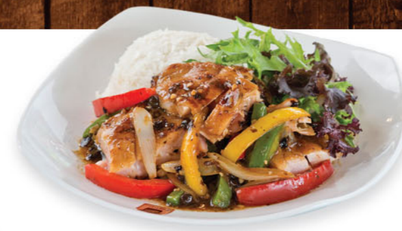
Black Bean Stir-Fried with Vegetable 12.00 with Chicken / Beef 13.00 With Prawn 15.00