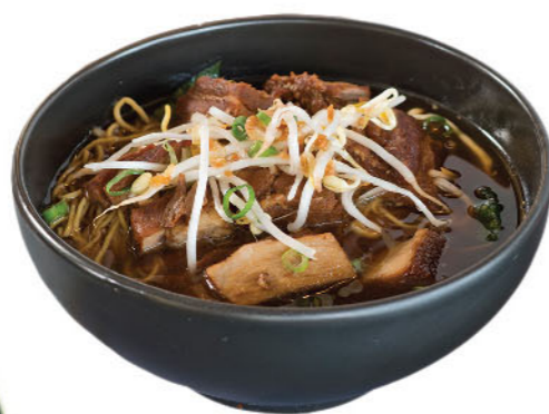
Duck Noodle Soup 15.00