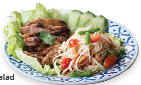
Paw-Paw Salad with BBQ Chicken 12.00