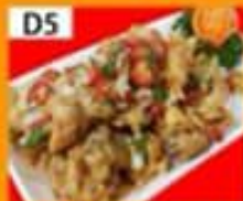
D5 椒盐软壳蟹 (CS) Salt & Pepper Soft Shell Crab