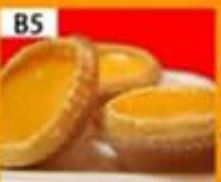
B5 香滑蛋挞 (M) Egg Tart

(XS)$5.00 (XL) $8.30 (S)$5.60 (XXL) $10.80 (M)$6.80 (CS) $13.80 (L)$7.60