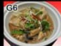
G6 Fish wing Tofu in Claypot 鱼翼豆腐煲 $38