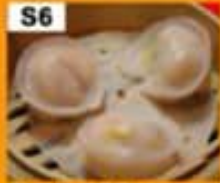
S6 带子饺 Scallop & Prawn Dumplings (L)