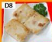
D8 煎萝卜糕 (S) Pan Fried Radish Cake