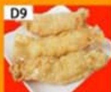
D9 腐皮虾卷 (L) Bean Curd Pwam Rolls