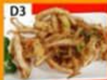
D3 椒盐鱿鱼须 (XXL) Salt & Pepper Squid Tentacle