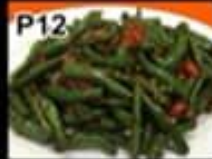
P12 Sambal Green Beans $16 三巴四季豆