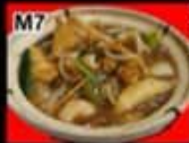
M7 Seafood Tofu in Claypot $22 海鲜豆腐煲