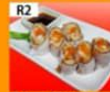
R2 脆皮虾肠粉 (L) Crispy Prawn Rice Flour Rolls