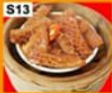
S13 金钱肚 Steamed Beef Belly (M)