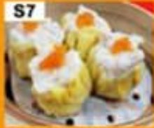
S7 鲜虾烧卖 Pork & Prawn Dumplings (M)