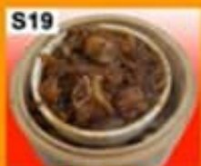
S19 牛仔骨 (XL) Beef Ribs