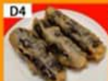
D4 紫菜卷 (M) Seaweed Rolls