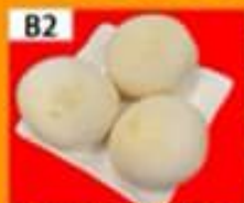
B2 烤流沙包 (M) Baked Salted Egg Yolk Bun