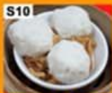
S10 鱼丸 (M) Steamed Fish Balls