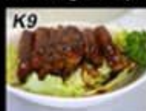
K9 Pickled Vege Pork Belly $24 梅菜扣肉