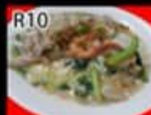
R10 Cantonese Ho Fun $14 滑蛋河粉