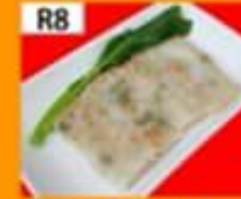
R8 煎虾米肠粉 (M) Dried Shrimp Rice Flour Rolls