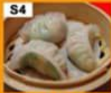
S4 韭菜饺 Chive & Prawn Dumplings (L)