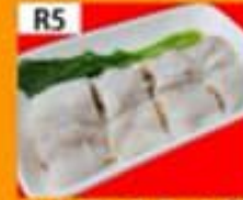
R5 软壳蟹肠粉 (XXL) Soft Shell Crab Rice Flour Rolls