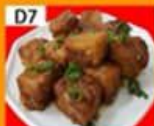
D7 X0 萝卜糕 (L) XO Fried Radish Cake