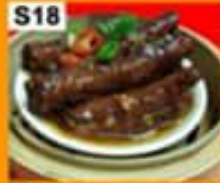
S18 特汁凤爪 Steamed Chicken Feet (M)