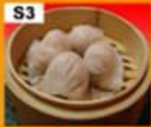
S3 品味虾饺王 Prawn Dumplings (L)