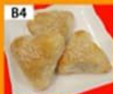
B4 香脆叉烧酥 (M) BBQ Pork Puff