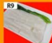
R9 香肠粉 (XS) Plain Rice Flour Rolls