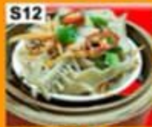
S12 姜葱牛百叶 Steamed Beef Tripe (M)