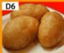
D6 咸水角 (xs) Deep Fried Meat Dumplings