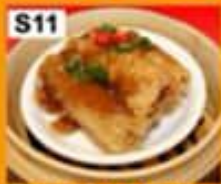
S11 绝汁鲜竹卷 Bean Curd Rolls in Oyster Sauce (M)