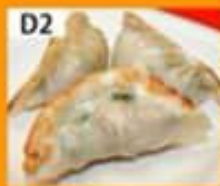
D2 香煎锅贴 (M) Pan Fried Pork Dumplings