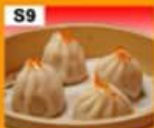
S9 上海小笼包 (M) Shanghai Dumplings