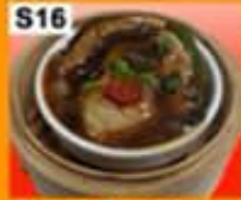
S16 煎酿三宝 Three Types Stuffed (L)