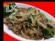
L7 Beef with Ginger Spring Onion $16 姜葱牛肉 Beef Rendang $16 仁当牛肉