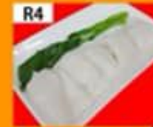
R4 带子肠粉 (XXL) Scallop Rice Flour Rolls