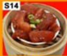
S14 沙爹牛筋 Satay Beef Tendon (M)