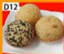
D12 三式芝麻球 (XS) Three Types Sesame Seed Balls