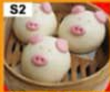
S2 招牌流沙包 Steamed Custard Bun (M)