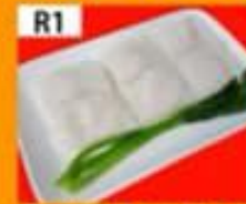
R1 鲜虾肠粉 Prawn Rice Flour (L) Rolls