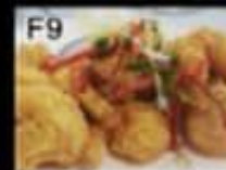
F9 Golden Prawn 黄金虾 $28