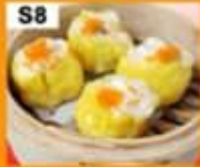
S8 带子虾卖王 (XL) Pinn's Scallop Dumplings