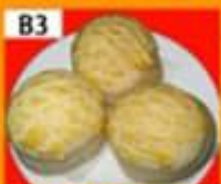
B3 烤菠萝包 (M) Baked Pineapple Custard Bun