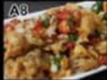
A8 Soft Shell Crab 椒盐软壳蟹 $13