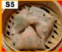
S5 香菜饺 Coriander & Prawn Dumplings (L)