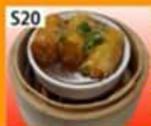
S20 绝汁鱼翅卷 (XL) Prawn Roll With Abalone Sauce