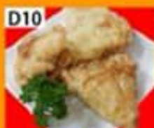
D10 蟹米 (M) Seafood Nuggets