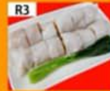
R3 炸两肠粉 (L) Crispy Pastry Rice Flour Rolls