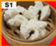
S1 蜜汁叉烧包 Steamed BBQ Pork Bun (M)