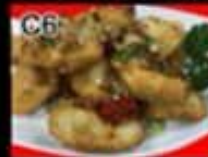
C6 Salt & Pepper Squid 椒盐鲜鱿 $16