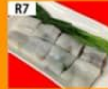
R7 牛肉肠粉 (M) Beef Rice Flour Rolls