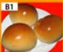
B1 烤叉烧餐包 (M) Baked BBQ Pork Bun