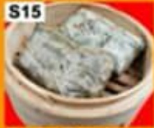
S15 糯米鸡 Sticky Rice in Lotus Leaf (M)