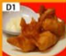
D1 明虾炸虾角 (L) Deep Fried Prawn