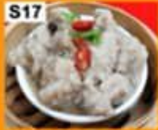
S17 清蒸排骨 Steamed Spare Ribs (M)