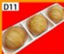
D11 榴莲酥 (XL) Duriang Puff