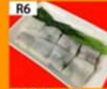
R6 叉烧肠粉 (M) BBQ Pork Rice Flour Rolls