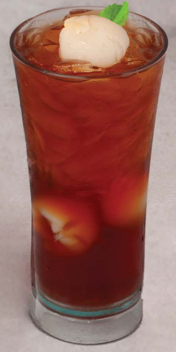
Iced Lychee Tea