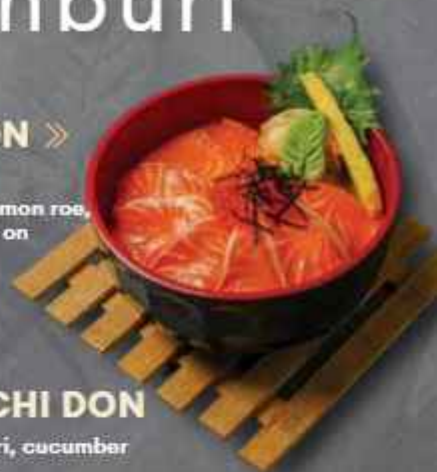
303 | HAMACHI DON hamachi sashimi, nori, cucumber topped on sushi rice $18.00