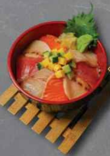
◀ 301 | CHIRASHI DON assorted sashimi, tamago, cucumber, nori topped on sushi rice $18.00