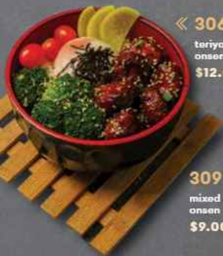
◀ 306 | TSUKENE DON teriyaki glazed chicken meatballs, onsen egg, broccoli, tomato, nori $12.00