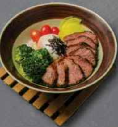
◀ 304 | GYU STEAK DON slow cooked beef, onsen egg, broccoli, tomato, nori $14.50