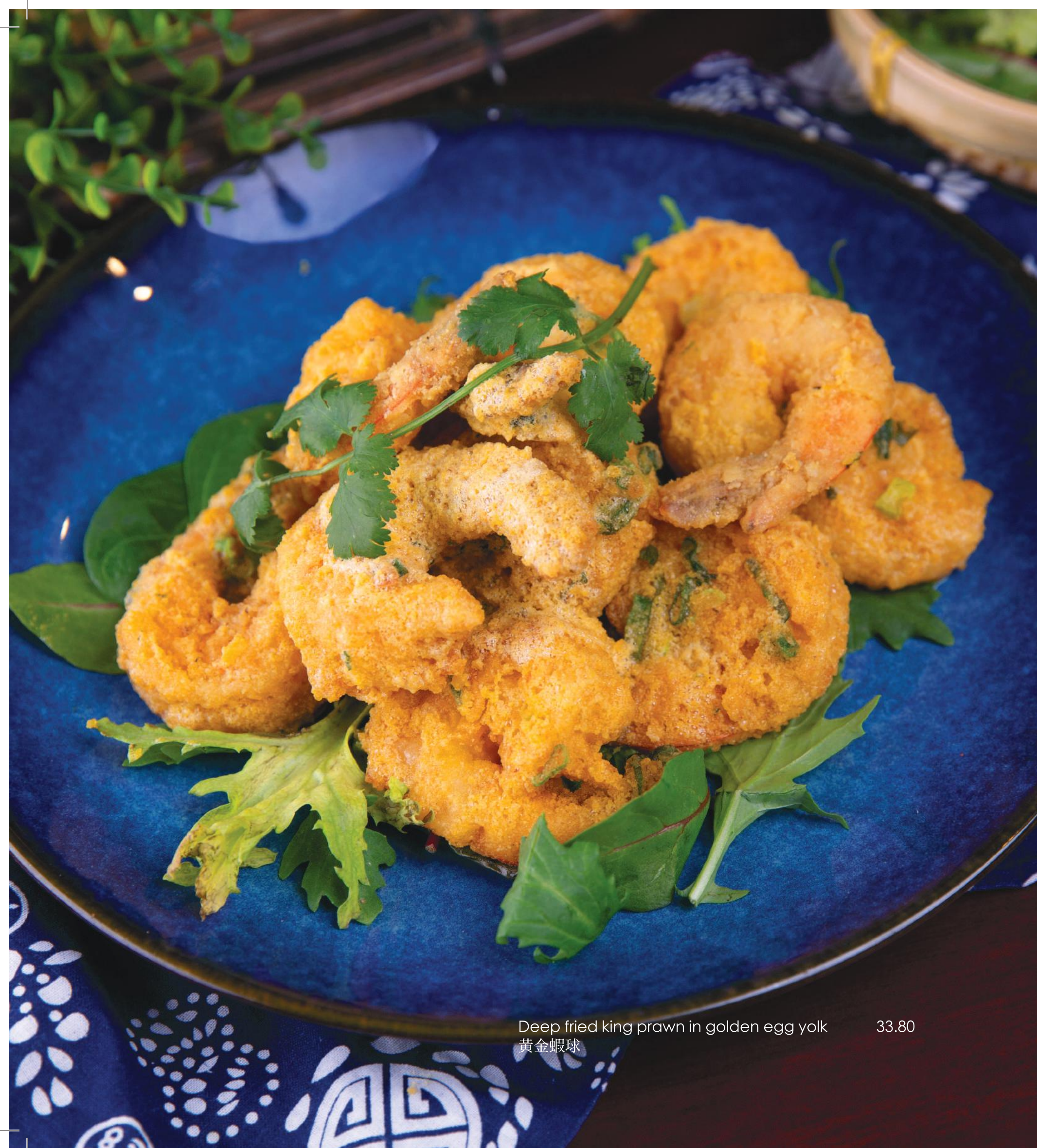
Deep fried king prawn in golden egg yolk 黃金蝦球