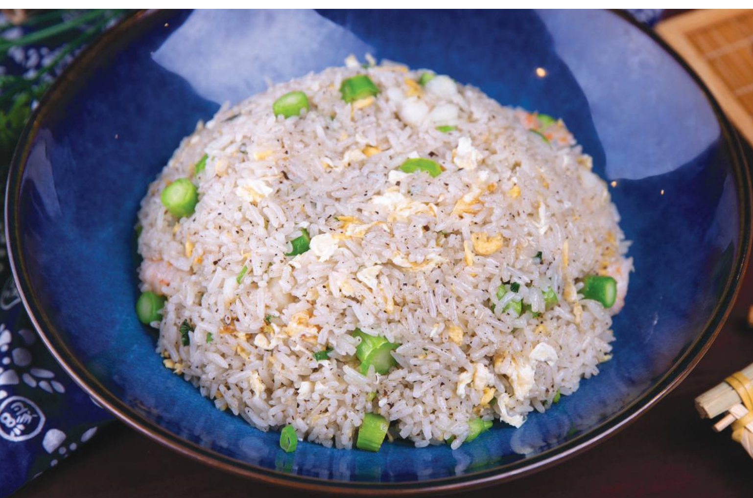
Black truffle seafood fried rice 黑松露海鮮粒炒飯