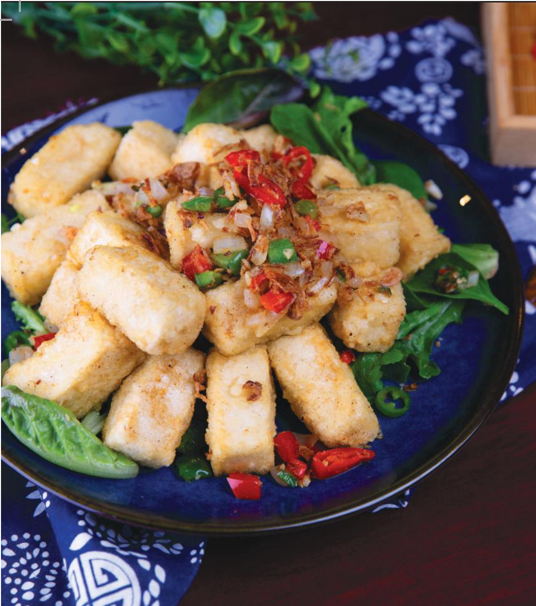
Deep fried bean curd in spicy salt and pepper 24.80 椒鹽豆腐