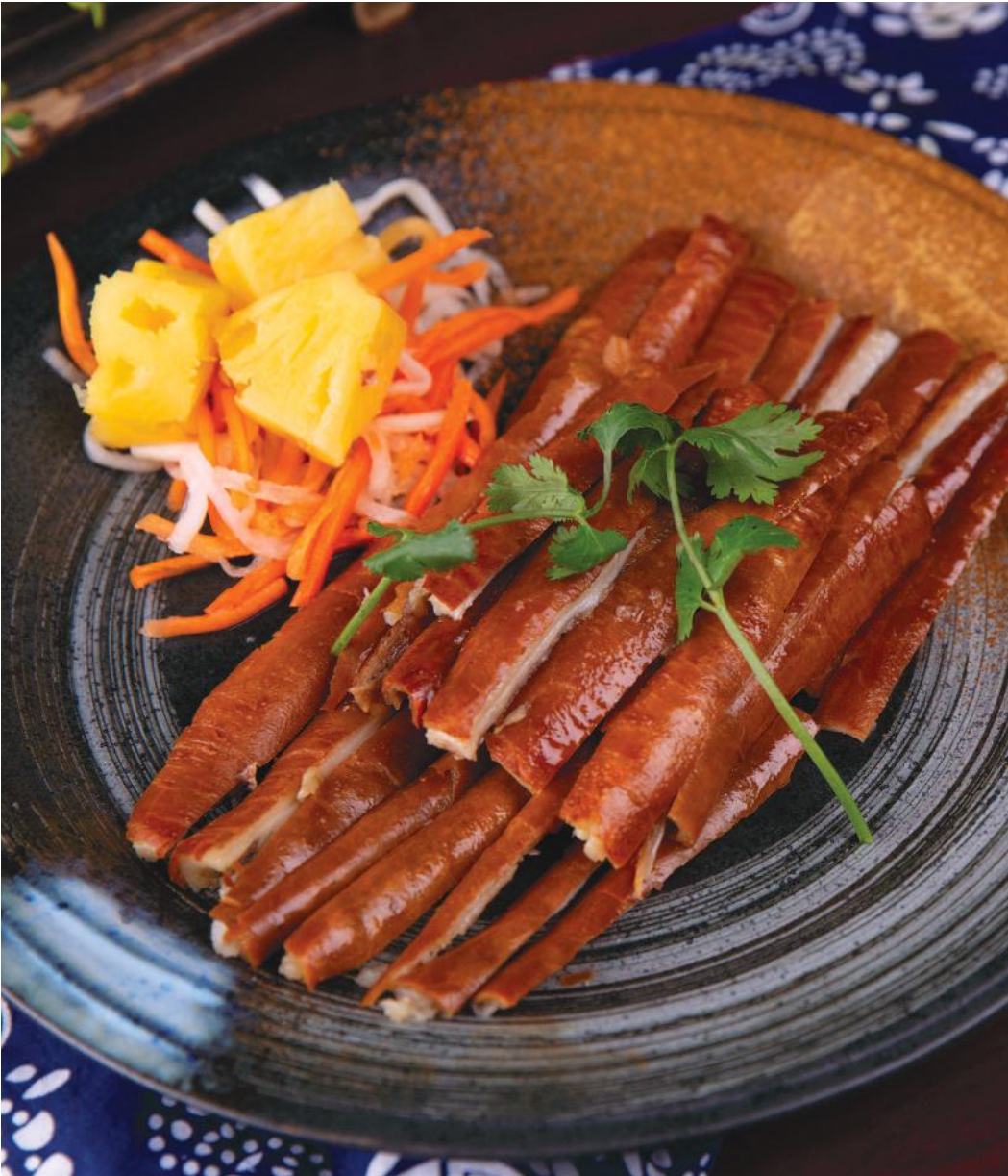
Deep fried pork offal 脆皮炸大腸 29.80