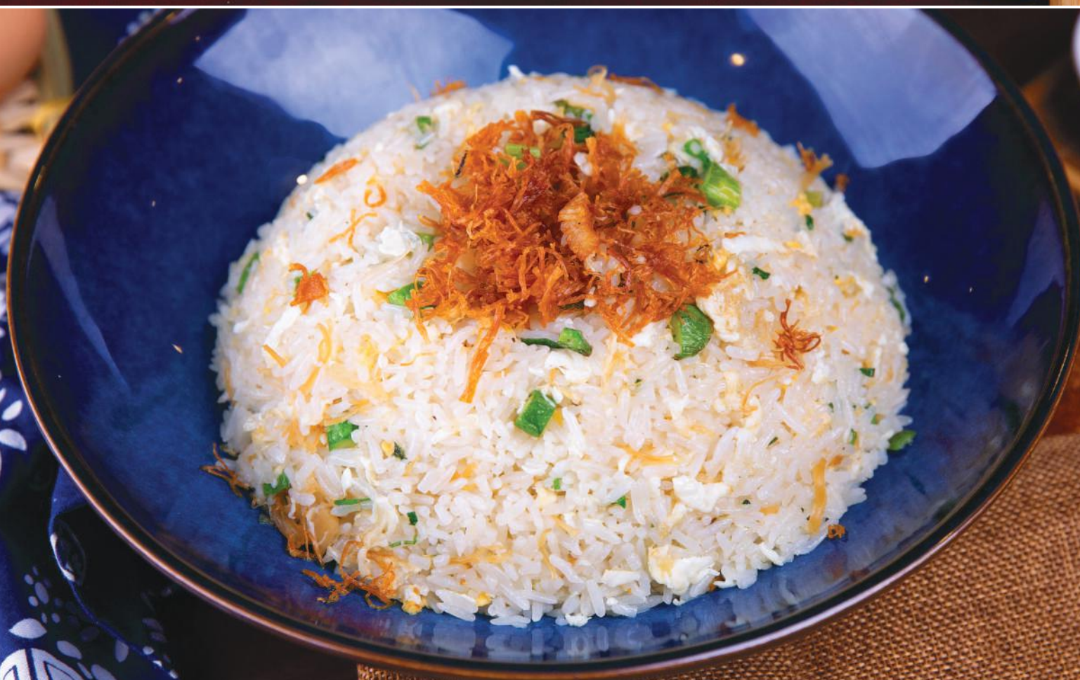
Dried scallop and egg white fried rice 瑤柱蛋白炒飯