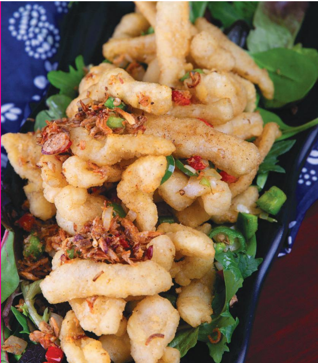
Deep fried calamari in spicy salt and pepper 26.80 椒鹽鮮魷