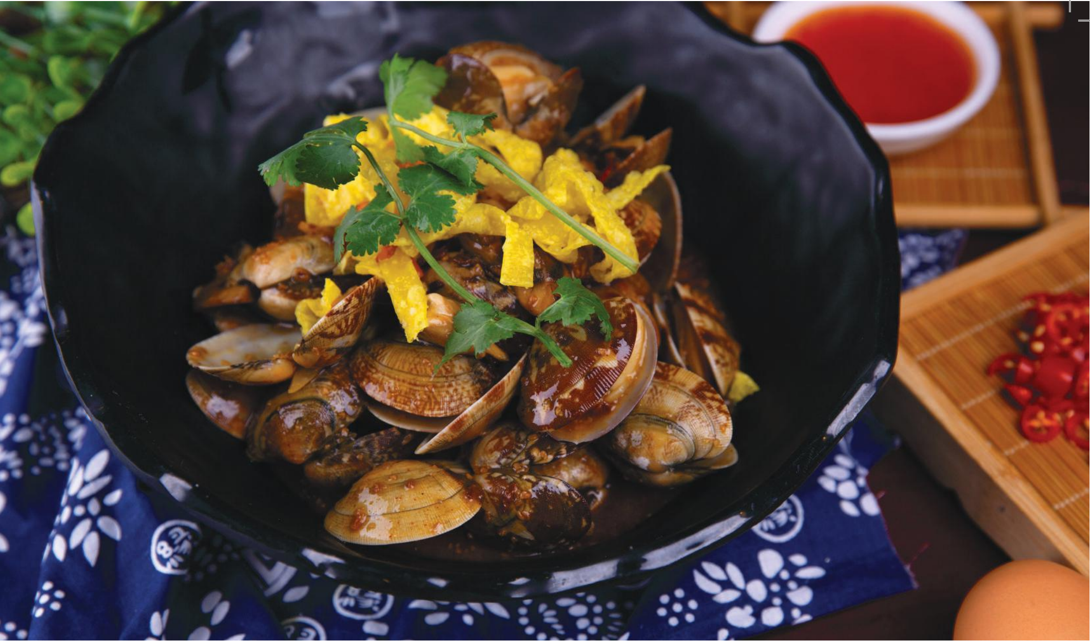
Stir fried clam in x.o. sauce X.O. 炒蜆 25.80