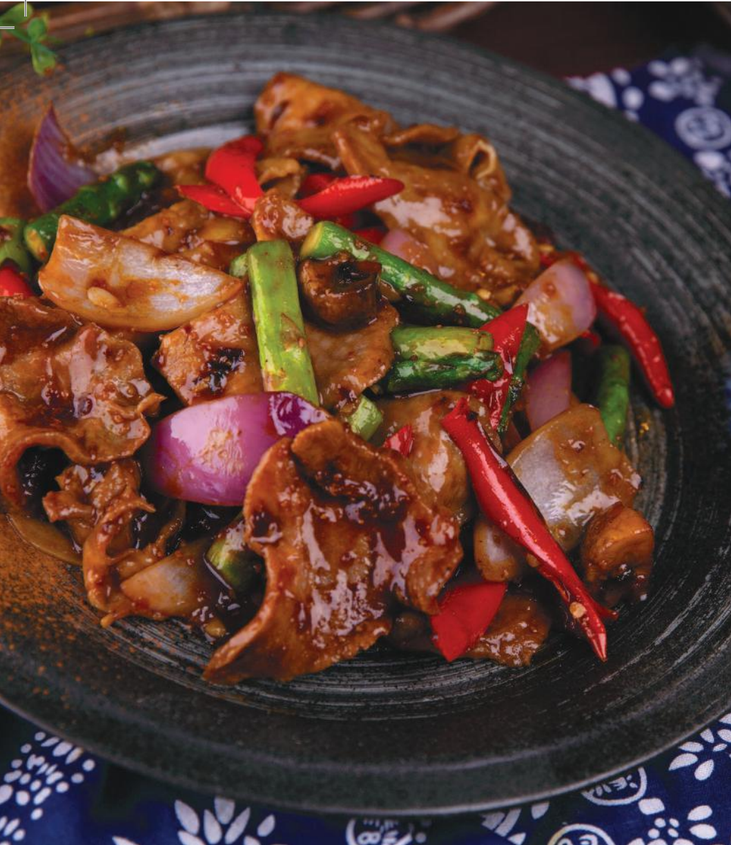
Stir fried beef tongue with x.o. sauce XO炒牛爽 32.80