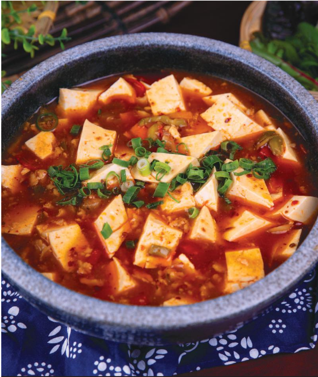
Mapo tofu 24.80 麻婆豆腐