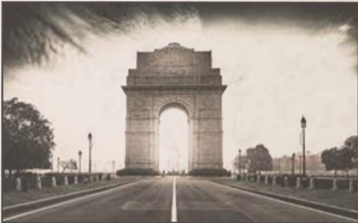
The India Gate is a war memorial located astride the Rajpath, on the eastern edge of the "ceremonial axis" of New Delhi, formerly called Kingsway

RICE Plain Rice - £4. 00 Jeera Rice - £4. 50