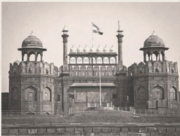
The Red Fort or Lal Qila is a historic fort in Old Delhi, Delhi in India that served as the main residence of the Mughal Emperors. Emperor Shah Jahan commissioned construction of the Red Fort on 12 May 1638, when he decided to shift his capital from Agra to Delhi

Gulab Jamun Cheesecake £8. 00 Kulfi Pistachio £7. 00 Misti Dohi £7. 00 Rasmalai £7. 00 Gulab Jamun £6. 50