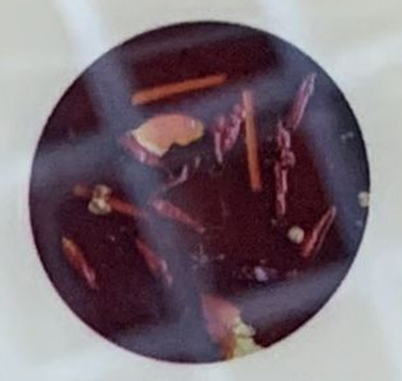
麻辣清油锅 Spicy Vegetable Oil Soup Base