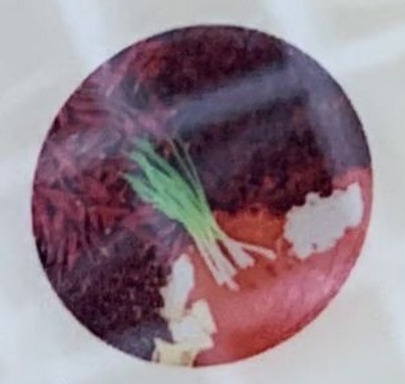
香辣牛油锅 Spicy Beef Oil Soup Base

人数 NO. Of People _____ 桌号 Table No. _____