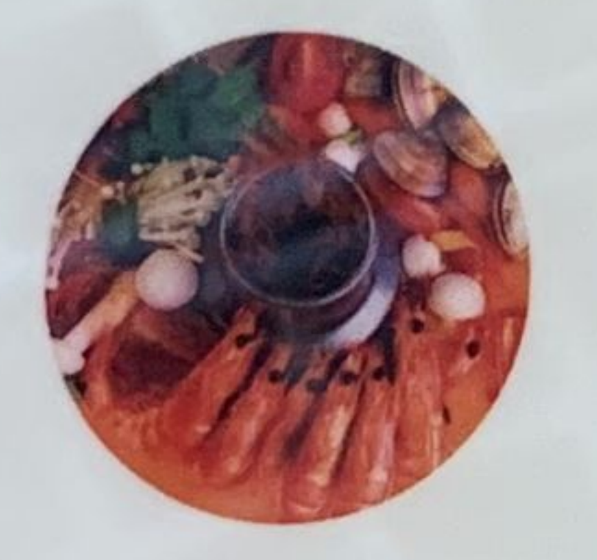
开胃冬炎汤 Tom Yang Soup Base