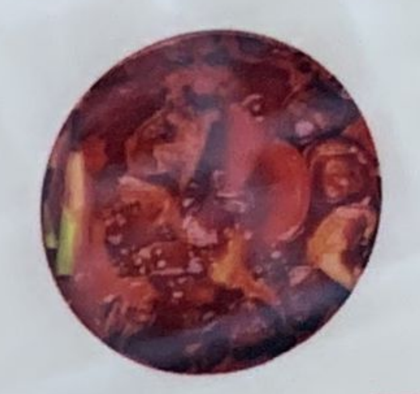
养颜番茄汤 Tomato Soup Base