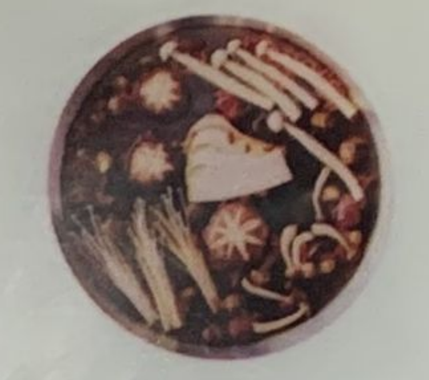
山珍菌菇汤 Mushroom Soup Base