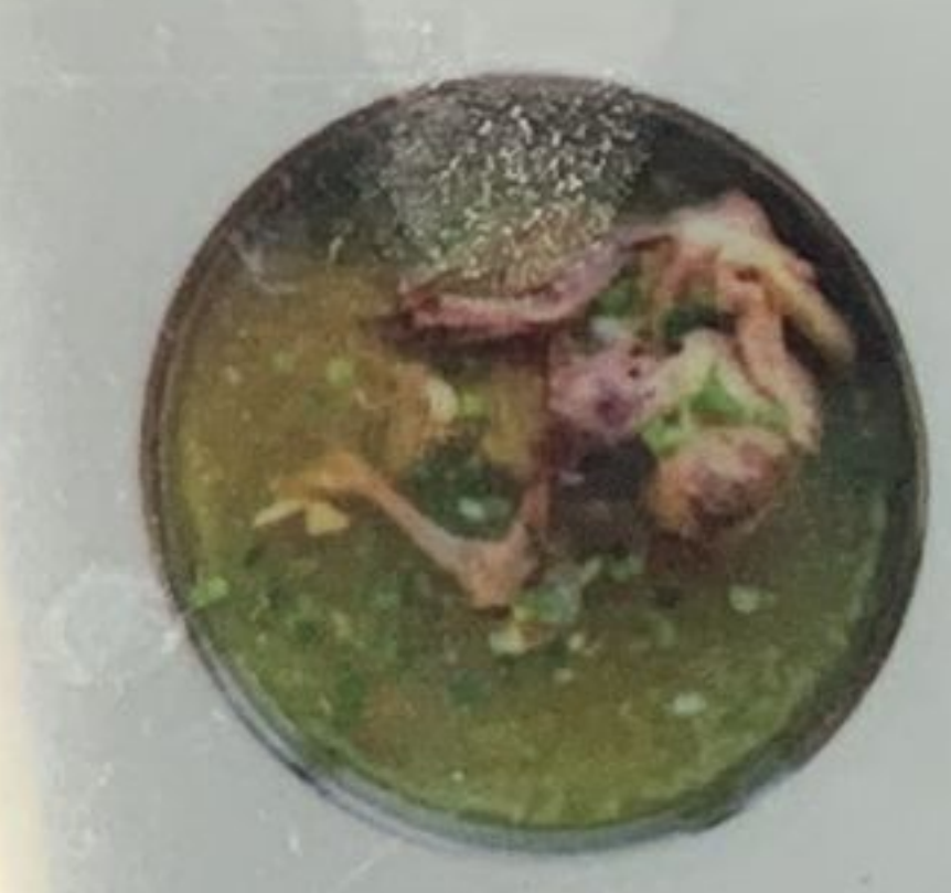
滋补鸡汤锅 Heabal Chicken Soup Base