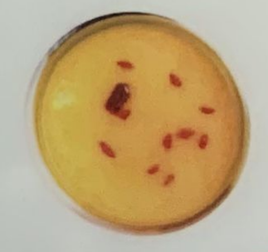
开胃酸汤锅 Sauerkraut Soup Base

注意：儿童价不包含汤底(加锅底另收费 $2/锅) 90分钟限时/90mins limit Noted: Childs Price do not include the Soup Base, separate charge for adding/charging soup base $2/soup