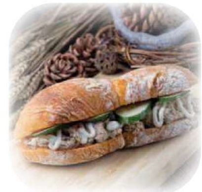
TUNA SANDWICH - 7.50

CIABATTA, STREAKY BACON, ROCKETS, TOMATO