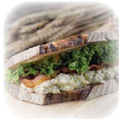
BACON EGG MAYO - 9.50

PAIN AUX TOMATES, TUNA MAYO, CHEDDAR, JAPANESE CUCUMBER