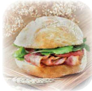
BACON SANDWICH - 7.50

HERBACEOUS CIABATTA, LEMON CHICKEN MAYO, LETTUCE, EMMENTAL, BASIL LEAVES