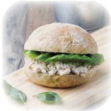
LEMON CHICKEN - 7.50

HERBACEOUS CIABATTA, LEMON CHICKEN MAYO, LETTUCE, EMMENTAL, BASIL LEAVES