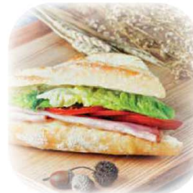
JAMBON FROMAGE - 8.50

CAMPAGNE BREAD, STREAKY BACON, EGG MAYO, CHEDDAR, LETTUCE, TOMATO