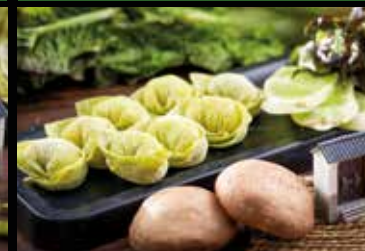
E 高筍鮮冬菇 OmniPork 素豬肉餃 Omnipork Vegetarian Pork Dumplings with Celtuce & Mushroom