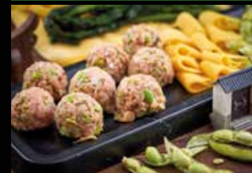
D 毛豆百頁 OmniPork 素豬肉丸 Omnipork Vegetarian Pork Balls with Green Peas, Beancurd Sheet & Snow Cabbage