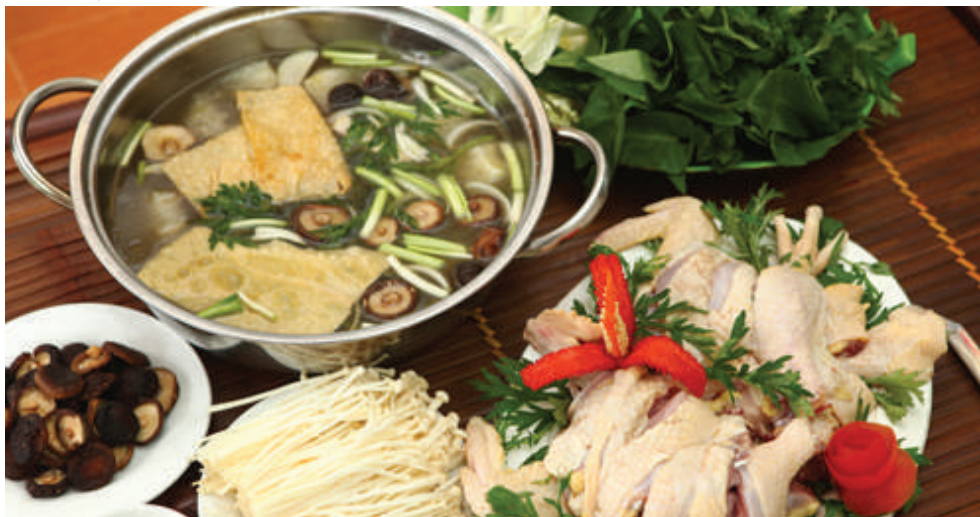
K7 - Lẩu gà chua cay

Spicy and sour tamarind broth chicken hot pot