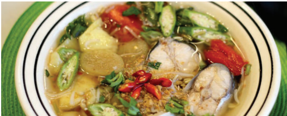
J1 - Canh chua cá bông lau Sour fish soup with vegetable $ 12.90