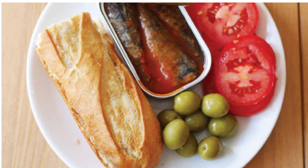
C3 - Bánh mì cá hộp