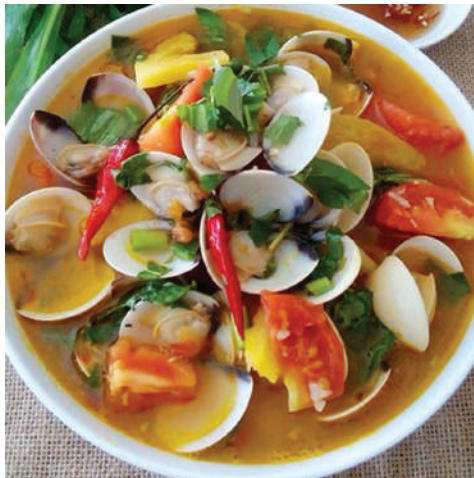
K4 - Canh nghêu nấu chua cay $ 12.00 Hot and sour clams soup