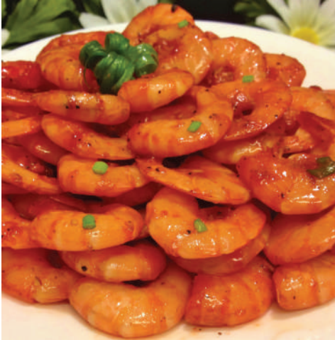
K1 - Tôm rim nước dừa $ 15.00 Braised prawn with young coconut