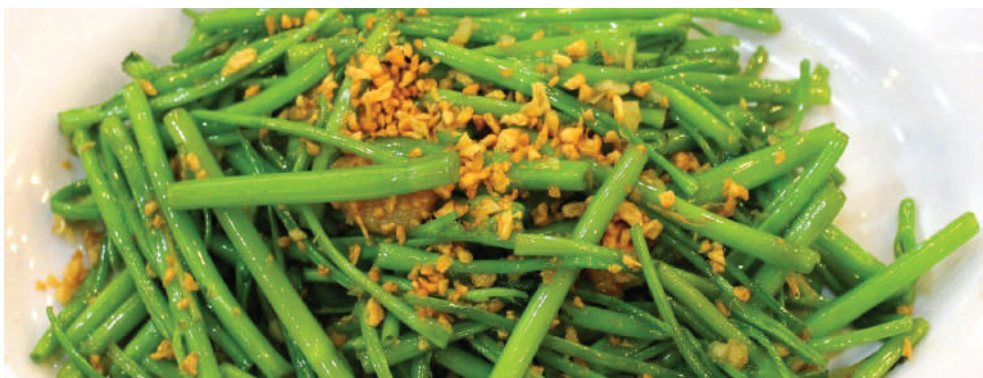
J4 - Rau muống xào tỏi Stir-fried kangkong with garlic $ 7.50