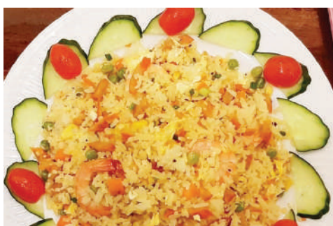
L3 - Cơm chiên hải sản $ 8.90