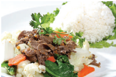
L1 - Cơm xào bò/Cơm gà xào $8.90

Stir-fried slice beef/chicken and veggies serve with steam rice