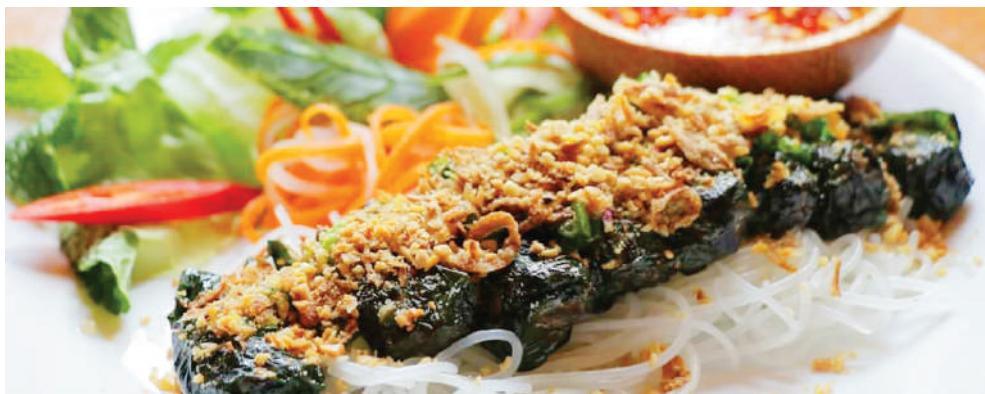
A5 - Bò lá lốt Wild betel leaf wrapped with minced beef $ 9.50/8pcs