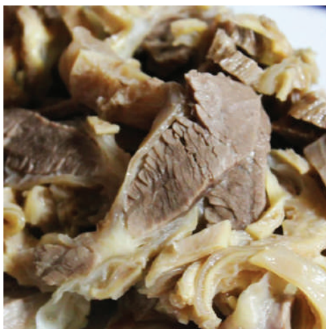
E6 - Soup bò nạm $6.90 Beef Brisket soup (without noodle)