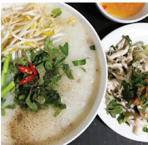
K10 - Cháo gà ăn kèm gỏi gà bắp cải

Chicken porridge served with cabbage salad