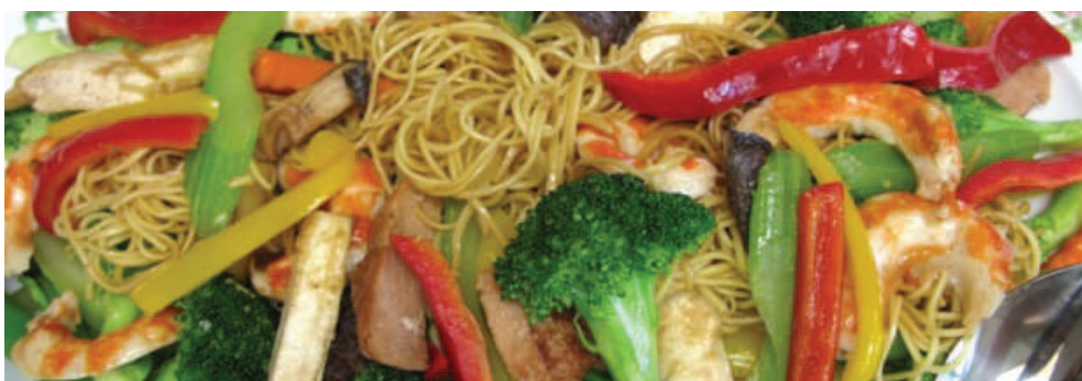
H2 - Mì xào nấm và rau củ

Stir-fried instant noodle with Mushroom, tofu and mix veggie