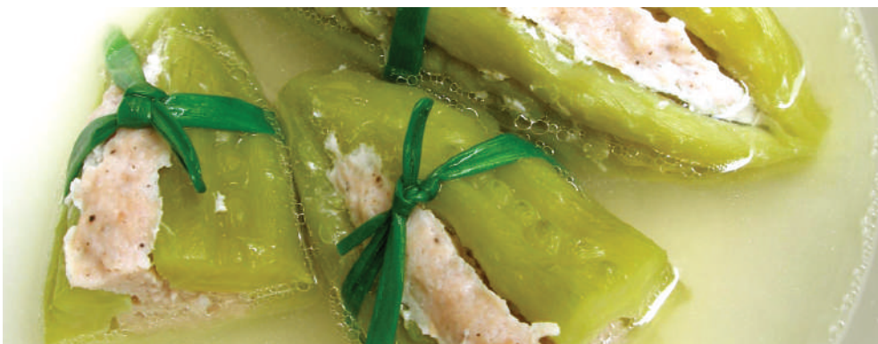
J3 - Canh khổ qua nhồi Bitter melon soup $ 12.50