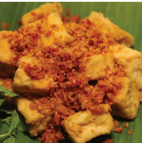
K5 - Đậu hủ chiên xả ớt $ 8.50 Stir-fried tofu with lemon grass