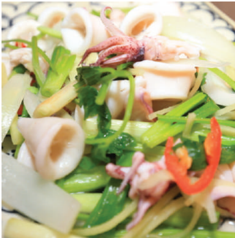
K3 - Mực hấp gừng $ 12.00 Fresh sotong steam with ginger