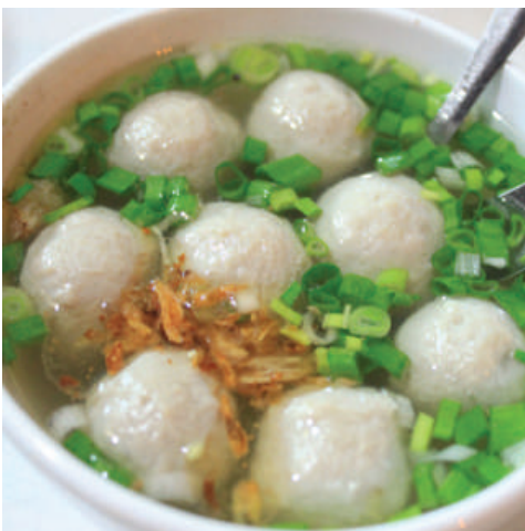
E5 - Soup bò viên $6.50 Beef balls soup (without noodle)