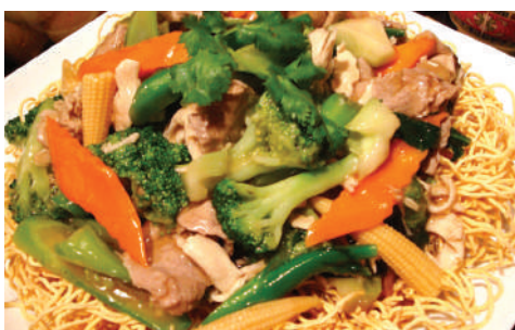
G2 - Mì xào bò/hải sản/gà $ 8.90

Stir-fried instant noodle with beef/ seafood/chicken