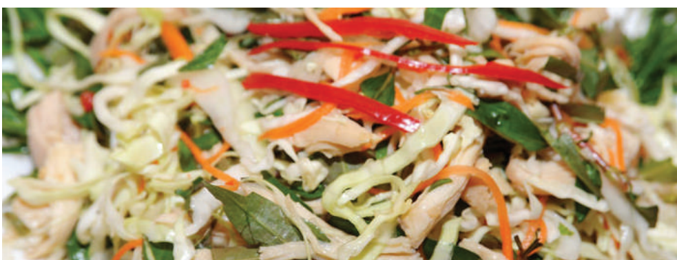
B3 - Gỏi gà bắp cải Shredded chicken meat with cabbage salad $ 7.90