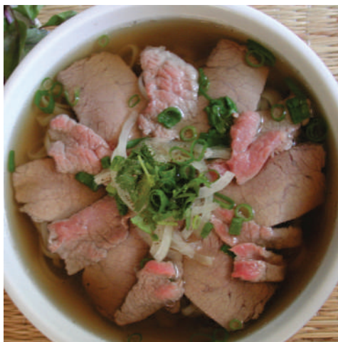
E4 - Soup bò tái $6.50 Slice Beef soup (without noodle)