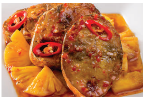
L5 - Cơm cá ngừ kho khóm $ 8.90

Braised fish in claypot serve with steam rice