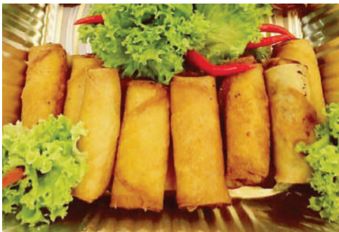
A2 - Chả giò hải sản $ 6.50/3pcs Crispy seafood spring rolls