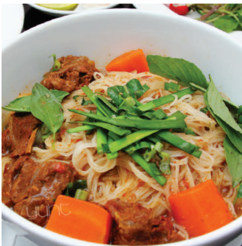
F2 - Hủ tiếu bò kho