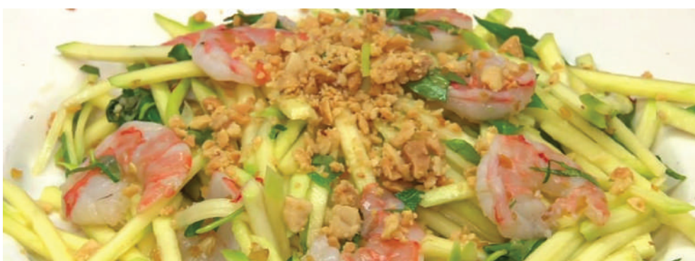
B2 - Gỏi xoài