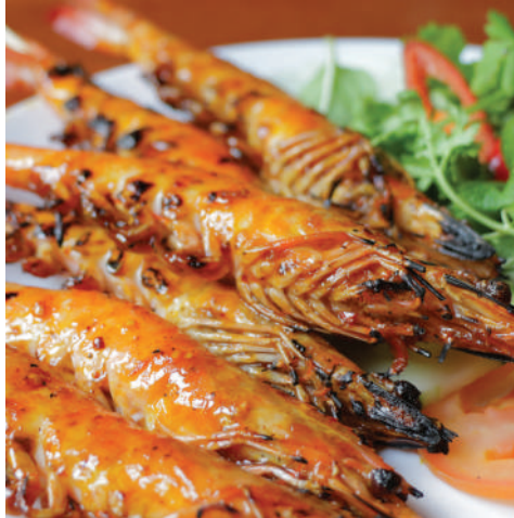
K2 - Tôm nướng muối ớt $ 15.00 BBQ prawn with salty and spicy sauce