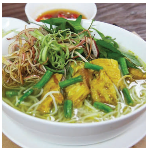
F5 - Bún cá miền tây

Hot and sour seafood with rice vermicelli