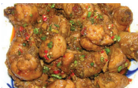
L7 - Cơm gà kho xả ớt $ 8.90

Braised black pepper chicken in claypot serve with steam rice