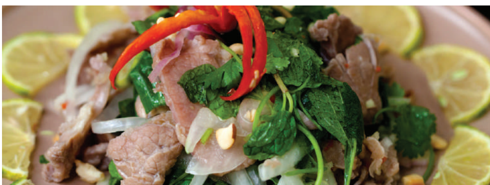
B4 - Gỏi bò bóp thấu