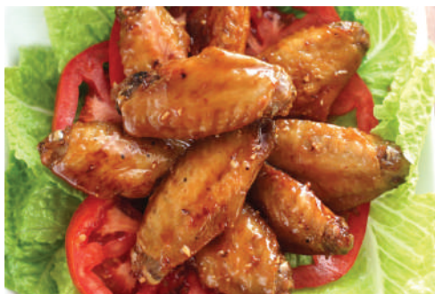
A6 - Cánh gà chiên nước mắm $ 12.50/8pcs Chicken wings fried with fish sauce