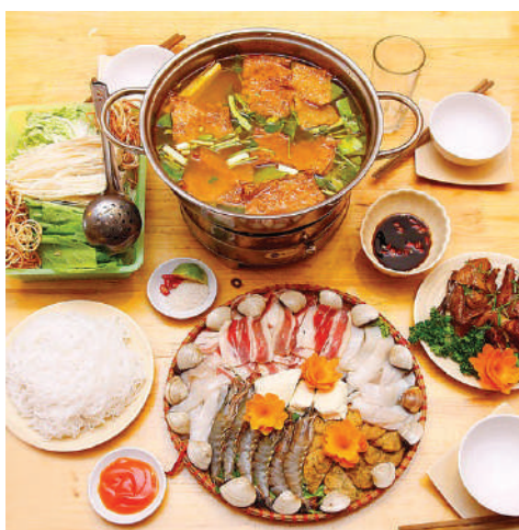
K8 - Lẩu thập cẩm

Mixed seafood, slice beef and chicken hot pot