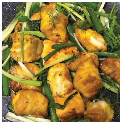
K11 - Chả cá lã vọng