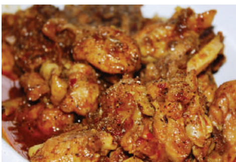
L6 - Cơm gà kho tiêu $ 8.90

Braised fish with pipeapple in claypot serve with steam rice