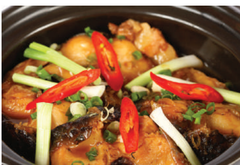
L4 - Cơm cá bông lau kho tộ $ 9.90

Braised fish in claypot serve with steam rice