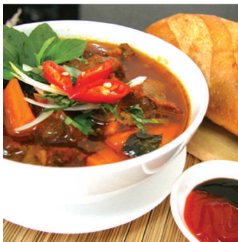
F3 - Bò kho bánh mì