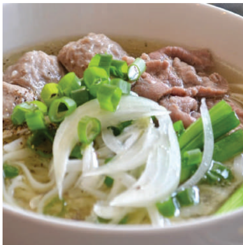
E2 - Phở bò tái viên $10.90 Slice beef & beef ball PHO