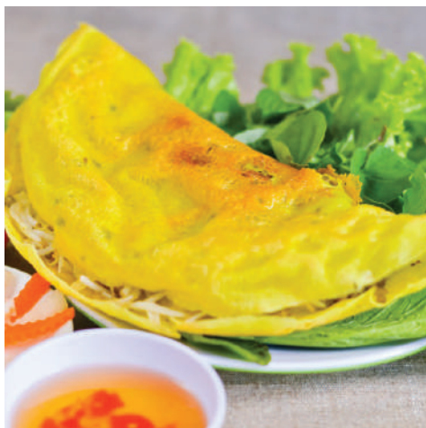
K6 - Bánh xèo $ 9.80 Vietnamese Pancake