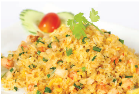
L2 - Cơm chiên dương châu $ 8.50

Stir-fried slice beef/chicken and veggies serve with steam rice