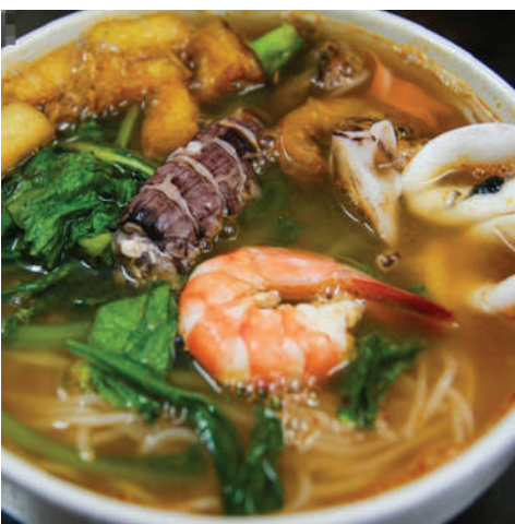
F4 - Bún hải sản chua cay