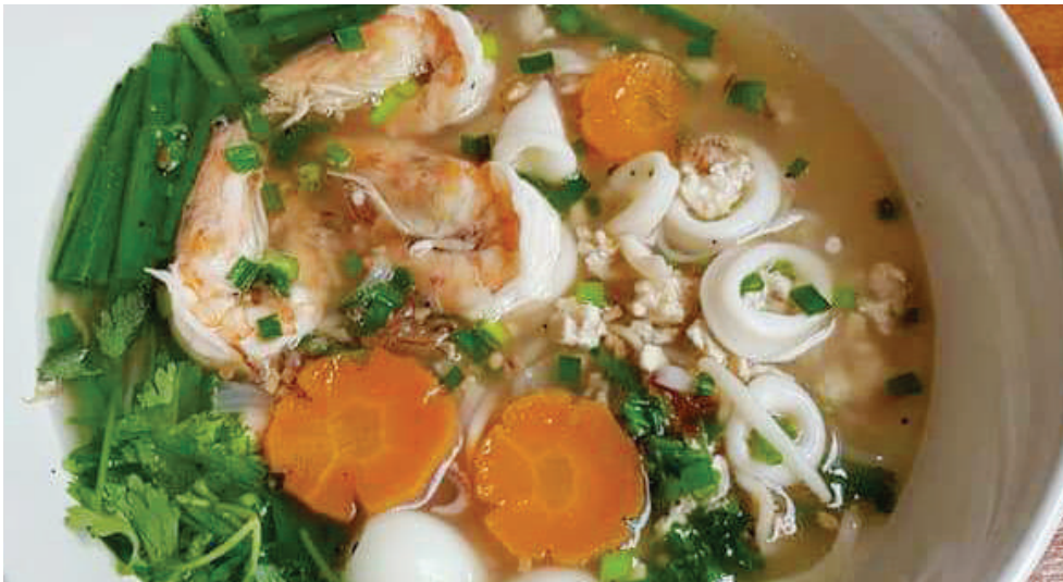
F1 - Hủ tiếu hải sản