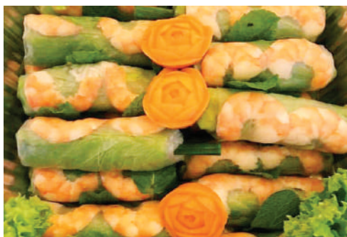
A3 - Gỏi cuốn $ 6.50/3pcs Fresh spring rolls