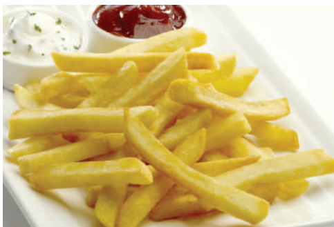
A7 - Khoai tây chiên $ 6.50 French fries