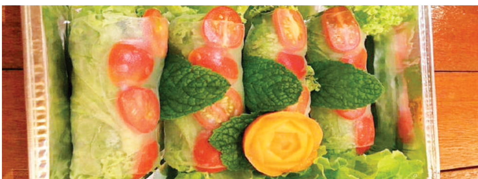
H1 - Gỏi cuốn chay