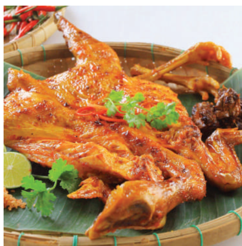
K9 - Gà nướng