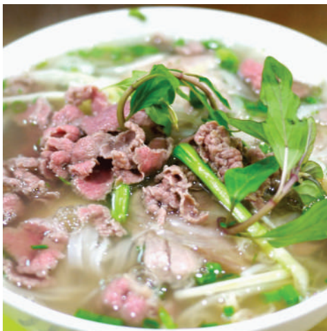
E1 - Phở bò tái $9.90 Traditional Vietnamese Slice beef PHO