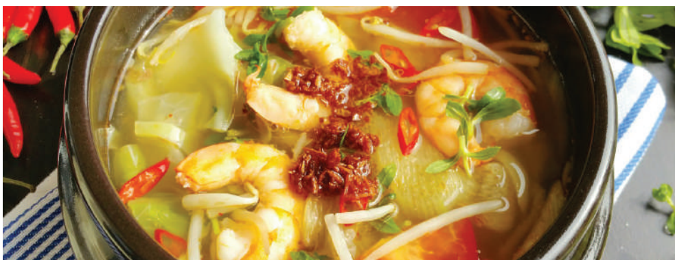
J2 - Canh chua tôm Sour prawn soup with vegetable $ 12.90