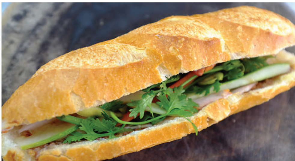
C2 - Bánh mì gà xé