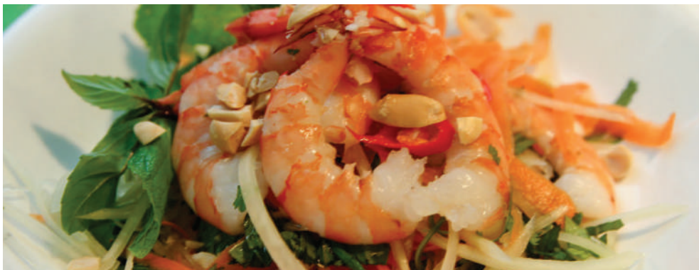
B1 - Gỏi đu đủ