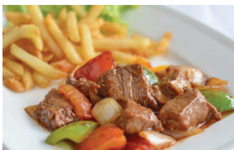
G3 - Bò lúc lắc khoai tây $ 10.90

Stir-fried instant noodle with beef/ seafood/chicken