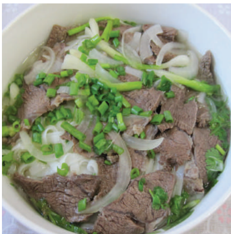
E3 - Phở bò tái nạm $10.90 Slice beef and brisket PHO