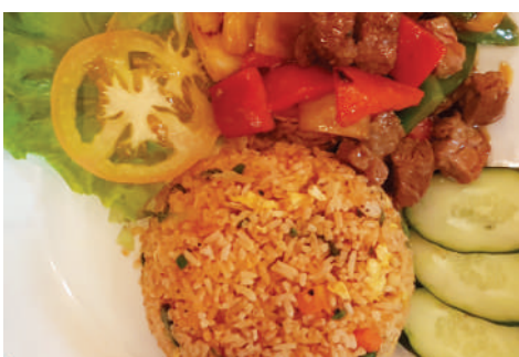
L8 - Cơm chiên bơ bò lúc lắc $9.90

Braised chicken with lemon grass and chili in claypot serve with steam rice