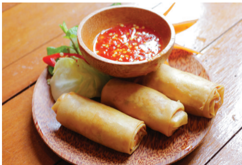
A1 - Chả giò gà $ 5.90/3pcs Crispy chicken spring rolls