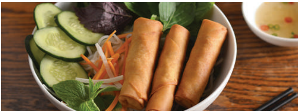
G1 - Bún chả giò Fried spring rolls with Rice vermicelli