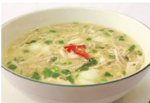
A4 - Soup cua $ 7.50 Crab soup