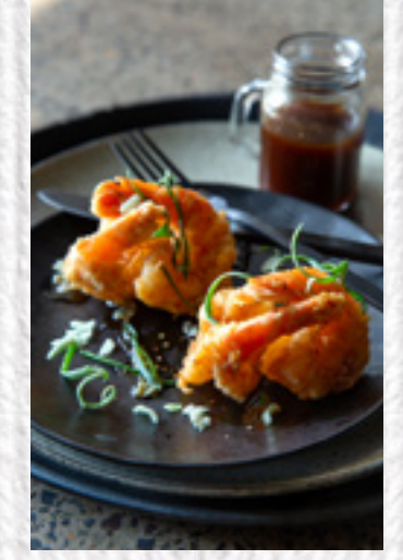
TANGY PRAWN (4) $12.9 A DELICIOUS LIGHTLY BATTERED PRAWNS COAT WITH A GORGEOUS "PEPPER SEEDS" TAMARIND BLEND SAUCE ... PERFECT SWEET & SOUR FLAVOUR.