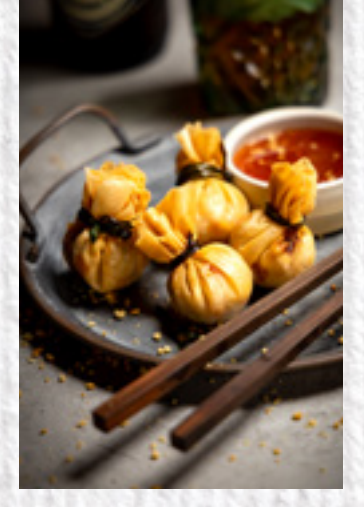
MONEY BAG (4) $9.9 AN ADORABLE AND DELICIOUS CRUNCHY GOLDEN SACKS, FILLED WITH PEANUTS, CHICKEN MINCE AND VEGETABLES.

CURRY PUFF (4 - vegetarian) $8.9 CRISPY GOLDEN PILLOWS