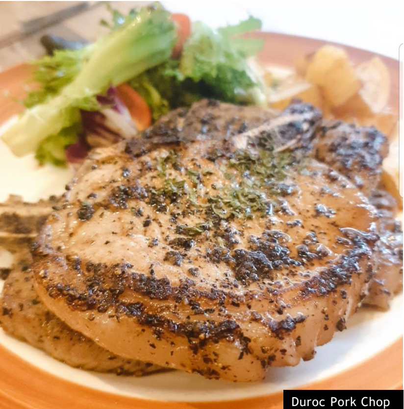
Duroc Pork Chop