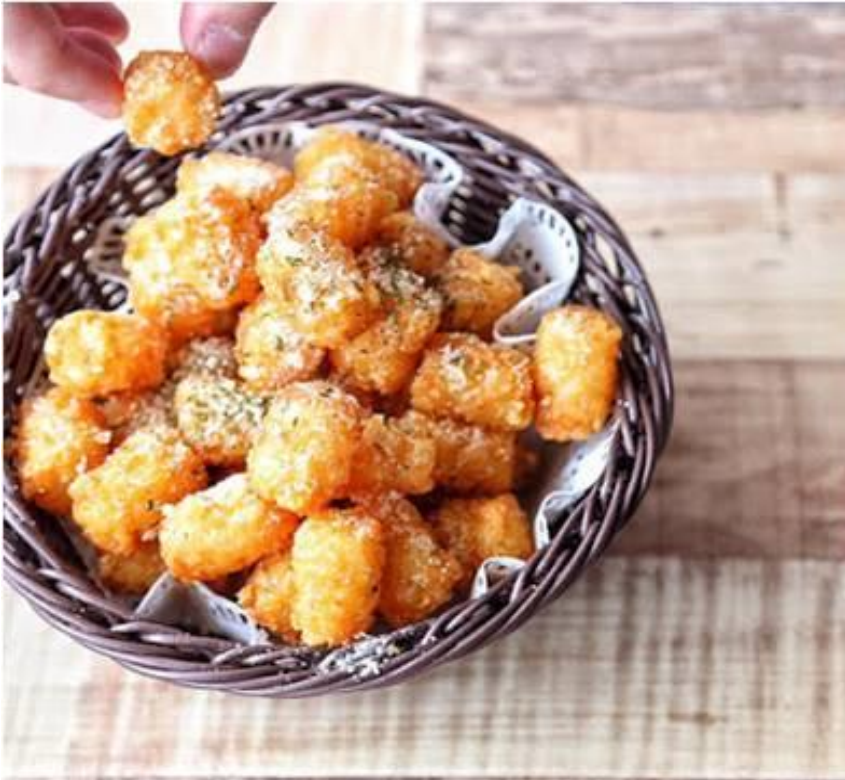
Truffle Tater Tots