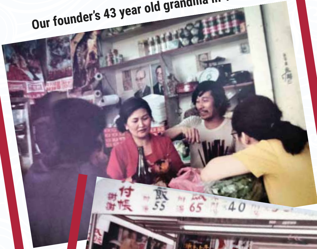
Our founder's 43 year old grandma in 1980~