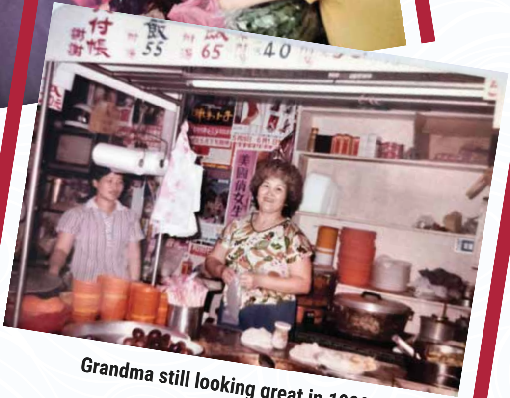
Grandma still looking great in 1998~