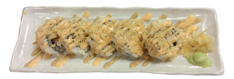
50 CHICKEN KATSU ROLL

Deep fried soft shell crab, Iceberg lettuce, mayonnaise and cucumber. Topped with tobiko, black sweet sauce and chilli mayo