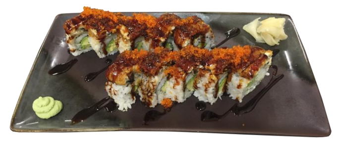
54 UNAGI ROLL

Chicken katsu, mayonnaise, cucumber and tamago. Topped with Katsu mayo, chilli mayo and tempura flakes