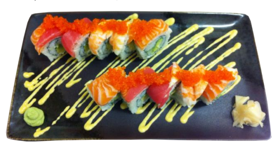
52 RAINBOW ROLL

Mayonnaise, avocado and cucumber. Topped with torch salmon, cheese with azuki sauce and black sweet sauce