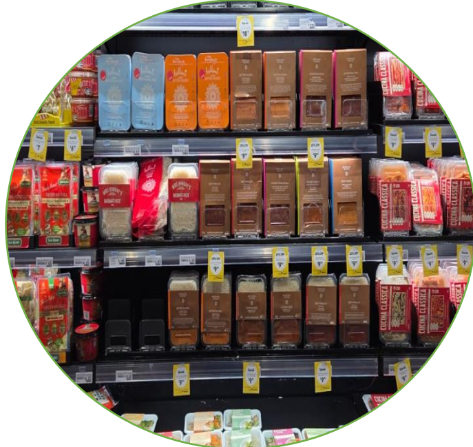
Pre-packed meals in Supermarkets