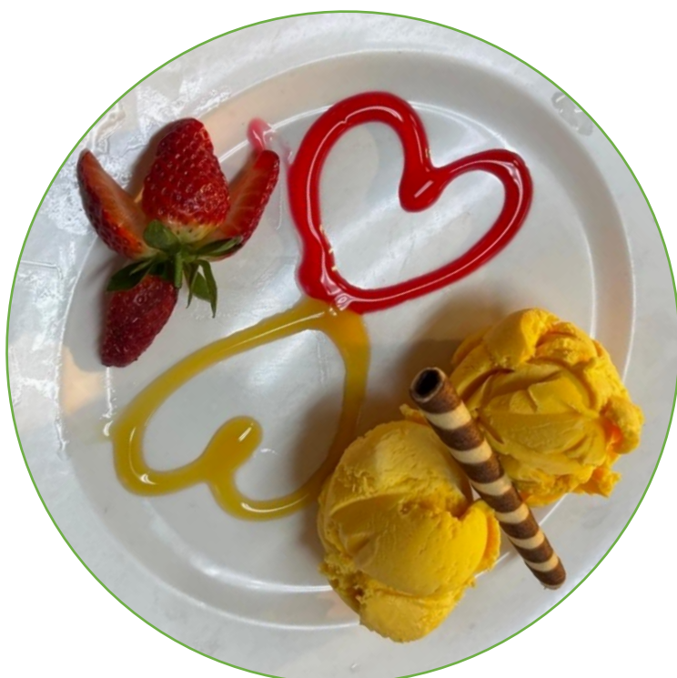
Mango Ice cream

Mango or Vanilla Ice cream two scoops 7.90