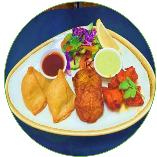
Platter for 2

Grilled Barramundi in a light marination of ginger garlic, turmeric, tomato and ajwain