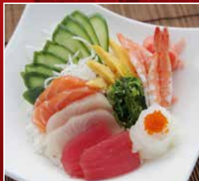
41. Chirashi $10.50 Sliced raw fish, prawn, Omelette, mushroom, Shred fish & pickles over sushi rice