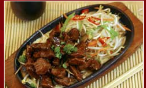
132. WAFU STEAK $19.80 Grilled eye fillet with Japanese steak sauce