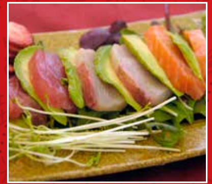
14. Kaisen Sashimi Salad (s) $8.80 Raw fish and avocado salad with Japanese style dressing