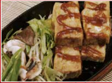
120. Tofu Steak $12.80 Bean curd cooked in teriyaki sauce with mushroom and onion served on hot plate