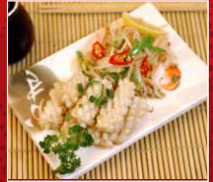
27. Ika Yaki $7.80 Grilled squid with butter garlic sauce