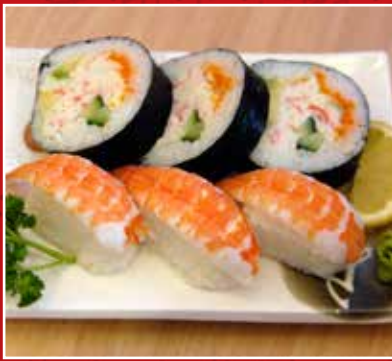
12. Mixed Sushi $8.80 Assorted California & Nigiri Sushi Mixed