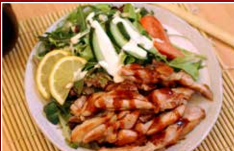
127. Tori No Teriyaki $15.80 Grilled chicken fillet in teriyaki sauce served with salad