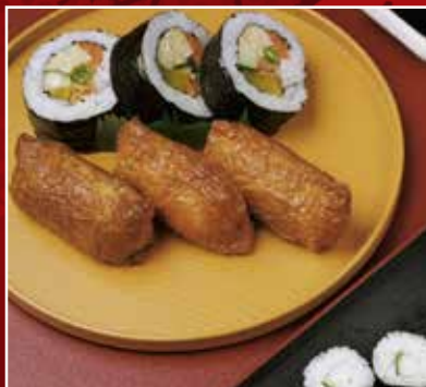
40. Sakuroku (6 pcs) $8.80 Futo maki & inari mixed