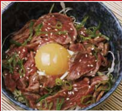
15. Gyu No Tataki $8.80 Raw beef slices with garlic and wine sauce