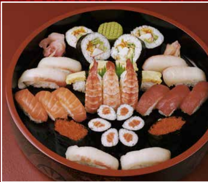
71. Sushi Combo