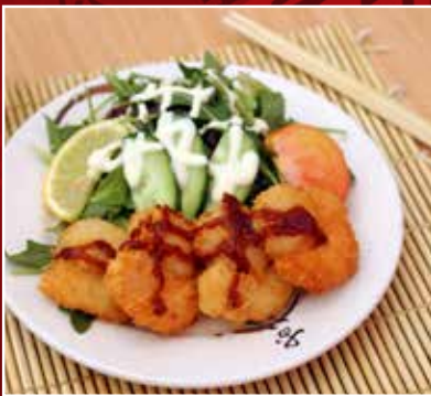
28. Hotate Fry $8.80 Fried crumbed scallops With Japanese BBQ sauce