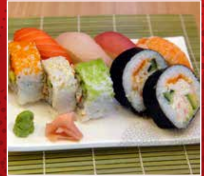
39. Chef's Choice (9 pcs) $10.80 Nigiri Sushi & Maki Mixed