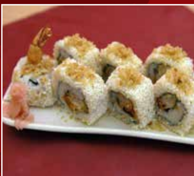
43. Crunchy Tempura roll (8 pcs) $13.80 Our famous roll containing a crispy tempura prawn with flying fish roe & mayonnaise