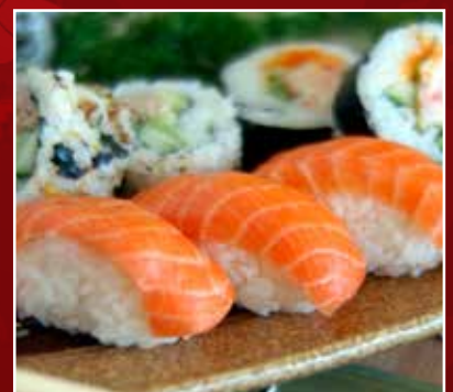
45. Chef's Special (7 pcs) $8.80 Our selection of salmon nigiri sushi, inside out roll & California rolls