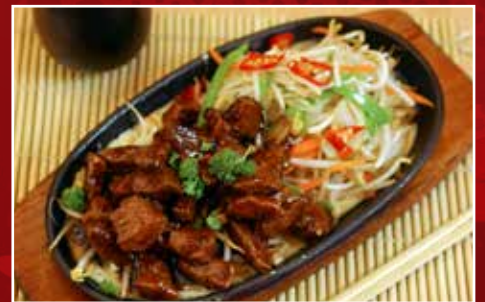
129. Gyu No Teriyaki $19.80 Grilled eye fillet with teriyaki sauce on hot plate