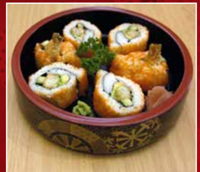
42. Ebi Sun Flower Roll (6 pcs) $12.50 Inside out rolls with crumbed prawn, avocado, cucumber & Mayonnaise