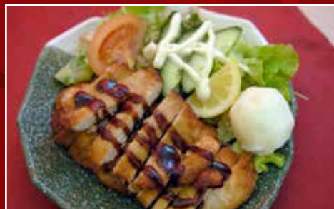
131. Tonkatsu $16.80 Fried crumbed pork served with salad and Japanese BBQ sauce