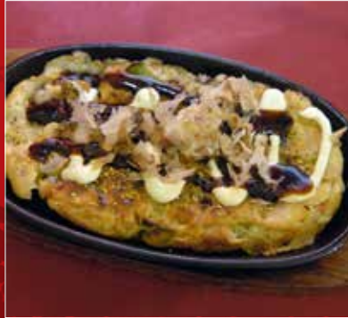
26. Okonomiyaki Entree $7.80 (seafood or vege) Main $12.80 Japanese style seafood & vegetable pancake