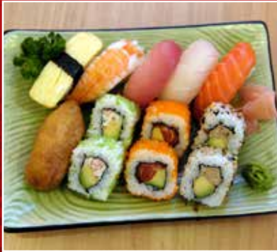
37. Sushi Deluxe (12 pcs) $10.80 Nigiri and small inside out rolls mixed