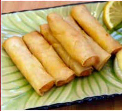
25. Harumaki (6pcs) Vege $6.00 Seafood $6.50 Japanese style mini vege/seafood spring rolls