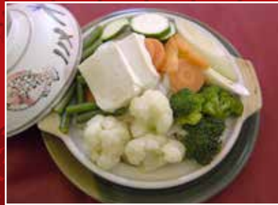
124. Vegetable Udon $11.80 Seasonal Vegetables cooked in soup and served in a hot pot