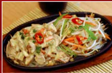
128. Tori No Garlicyaki $15.80 Chicken fillet cooked in special chilli & garlic cream sauce served on hot plate