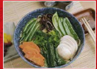
122. Yasai Ramen $10.80 Seasonal vegetable in thin noodle soup