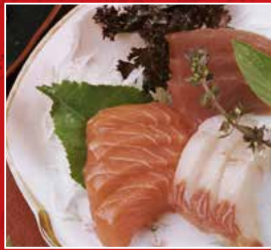
13. Sashimi (GF) $10.80 Fresh raw fish slices served with wasabi & soy