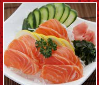
17. Salmon Sashimi $9.80 Fresh raw salmon slices served with wasabi & soy