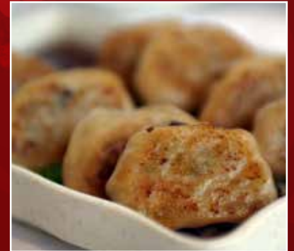
21. Gyoza (8pcs) Meat $7.80 Prawn $8.80 Pan fried Japanese style dumping with pork/prawn and cabbage