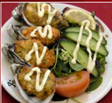
31. Kaki Fry $8.80 Deep Fried crumbed oysters with Japanese tartare sauce