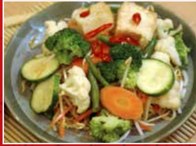
121. Yasai Itame $11.80 Stir fried mix vegetable with tofu