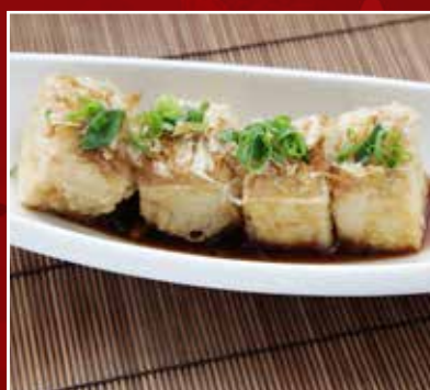
20. Agedashi Tofu (V) $5.50 Fried bean curd with light soya & ginger sauce with bonito flakes on top