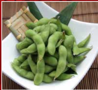
29. Edamame (V, GF) $6.80 Boiled and lightly salted young soybeans in their pods