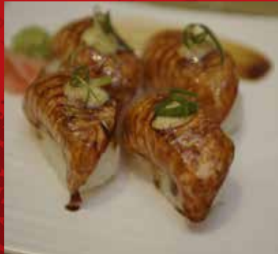
16. Salmon Nigiri $7.80 Sushi Rice Ball Topped with Grilled Salmon with Teriyaki