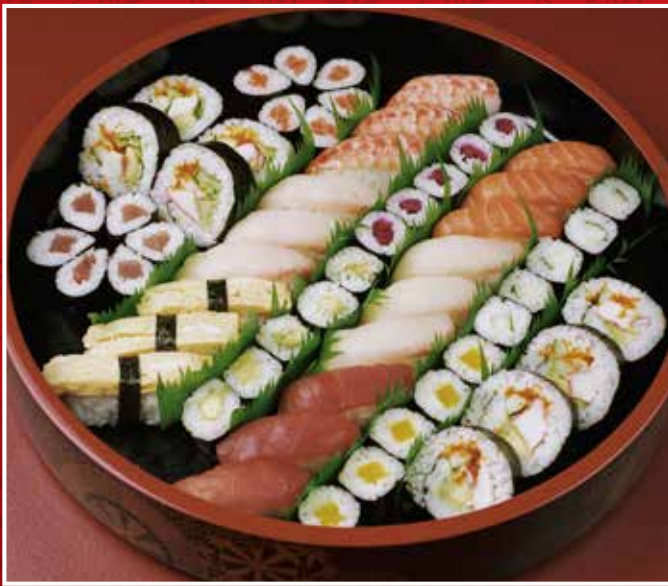
69. Combination Sushi Platter