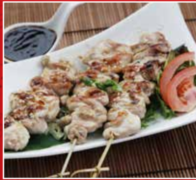
23. Yakitori (3 sticks) $7.00 Grilled chicken skewers with teriyaki sauce