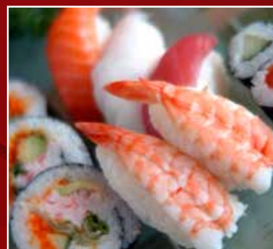
44. The Dream Team (10 pcs) $11.80 Our selection of nigiri sushi, California rolls & hosotate maki