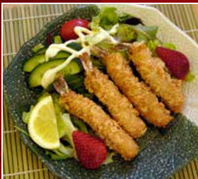
19. Warm Prawn Tempura Salad (s) $9.80 Green Salad with warm prawn tempura & Japanese style dressing