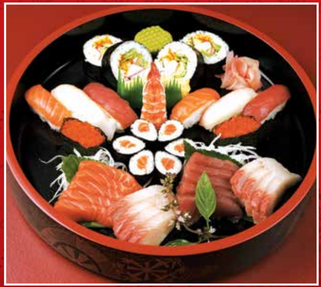
70. House Special