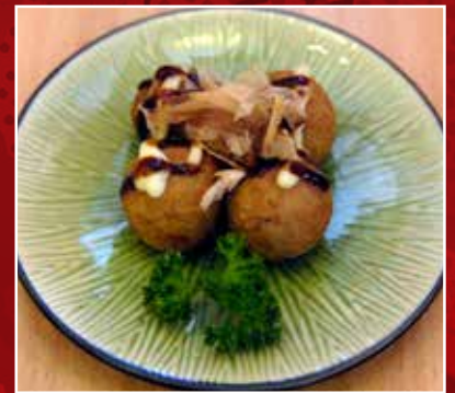
30. Takoyaki $4.80 Light egg dumplings with an octopus centre served with dipping sauce