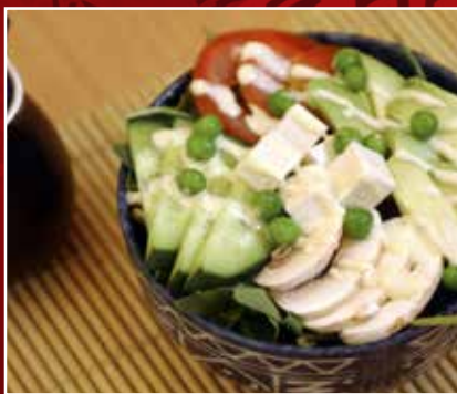
18. Nama Yasai (V) (S) $6.80 Green salad with vinegared dressing