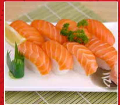
36. Salmon Nigiri Sushi (8pcs) $9.80 Salmon nigiri