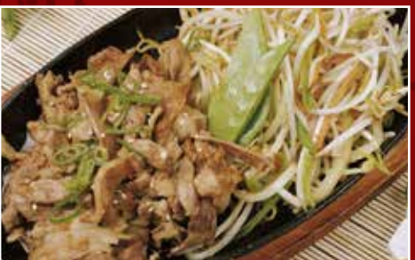
130. Butashoga teppanyaki $19.80 Sliced pork in ginger sauce served on hot plate