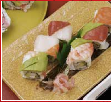
35. Aya Maki (6pcs) $11.50 Variety fish on top of inside out California rolls