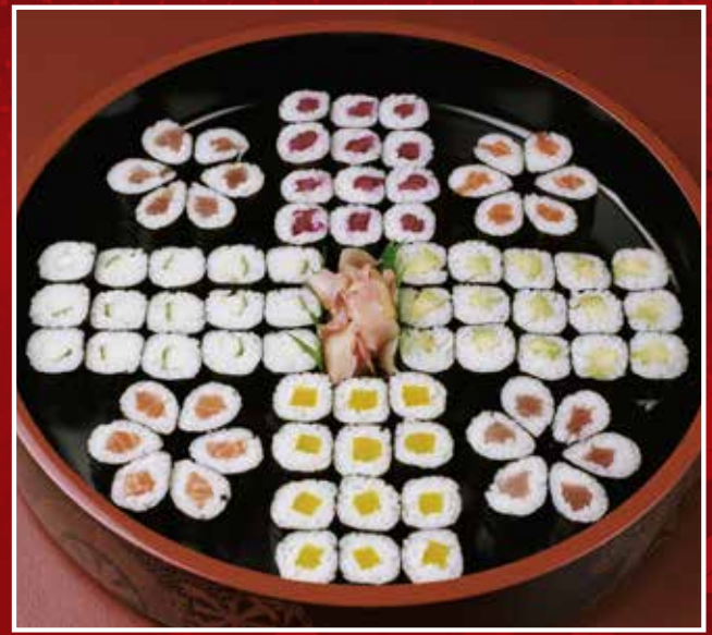
72. Hosomaki Platter