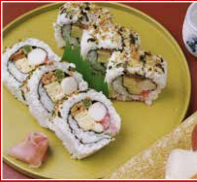
34. Hana Maki (8pcs) $11.50 Inside out roll with crabmeat, shred pork, egg, cucumber, mushroom, bean

The Actual presentation may vary (V) Vegetable (GF) Gluten Free