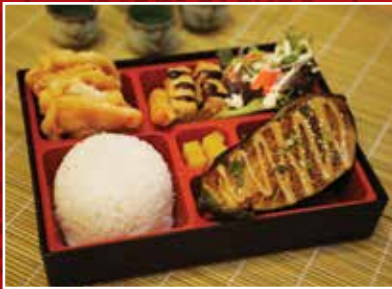
123. Vegie Bento $15.50 Fried eggplant, tempura vegie, tofu, vegie harumaki served in traditional Japanese meal box with one free miso soup