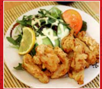
24. Tatsuta Age $7.80 Deep fried marinated chicken served with salad