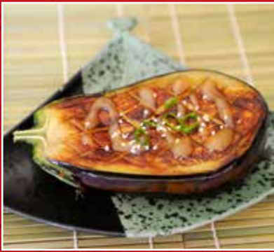
22. Nasu Dengaku (V) $6.80 Fried eggplant with soyo bean paste