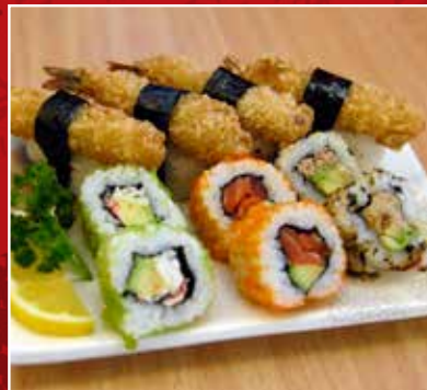
38. Prawn & Maki (10 pcs) $11.50 Crumbed prawn nigiri & inside out rolls mixed