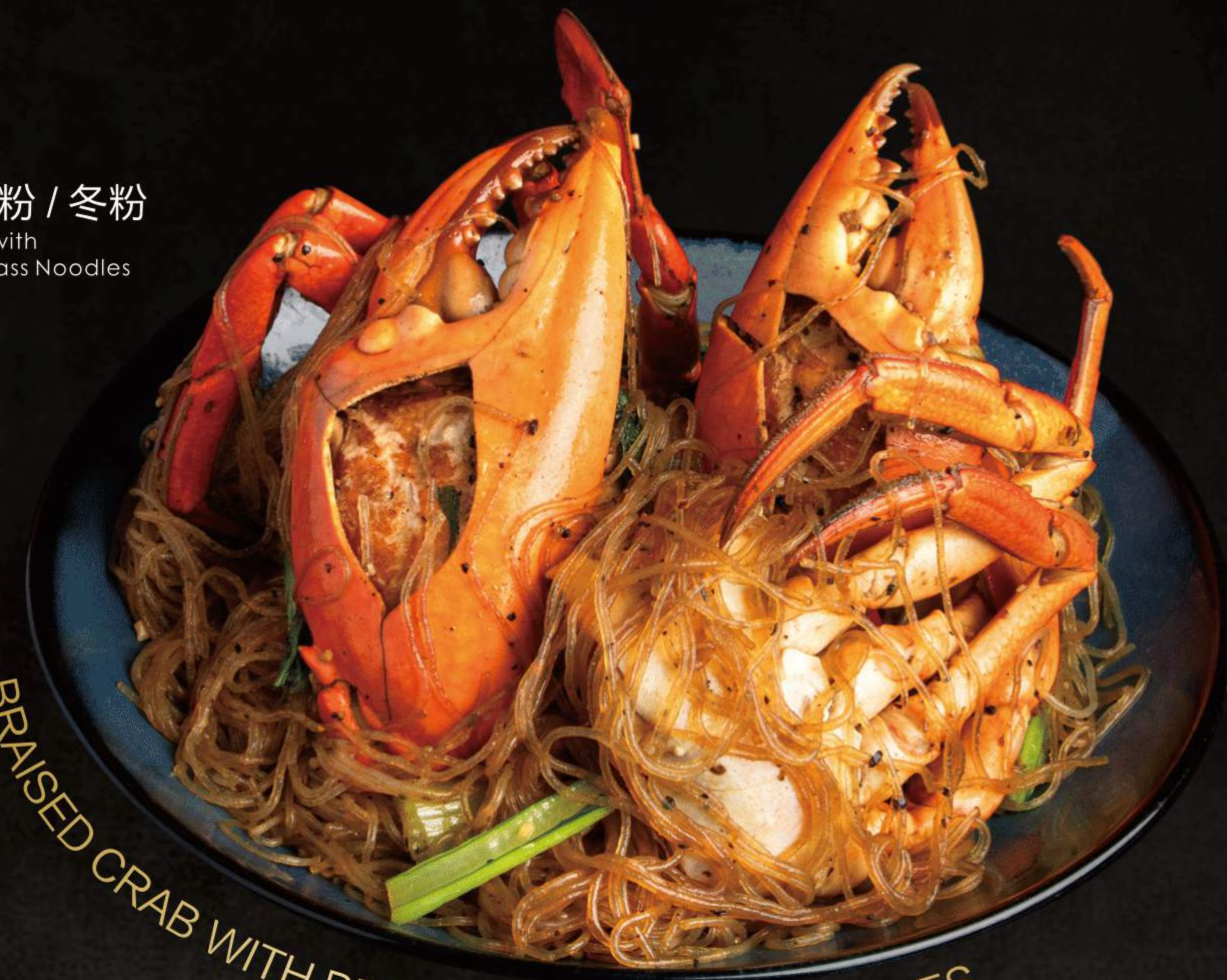
BRAISED CRAB WITH BEE HOON / GLASS NOODLES