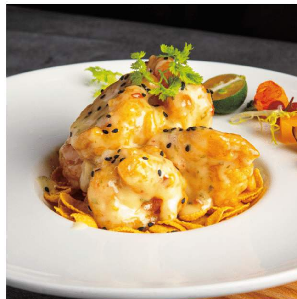
芝麻虾球 Sesame Prawn Ball