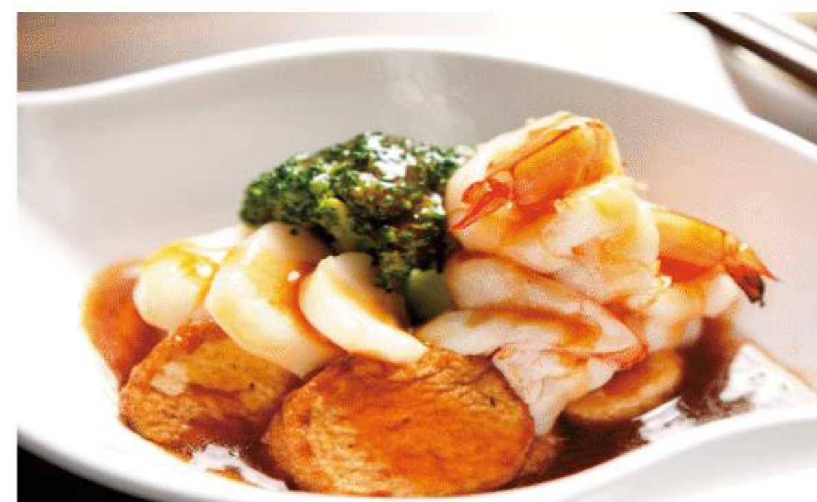
四宝豆腐 Beancurd Combination