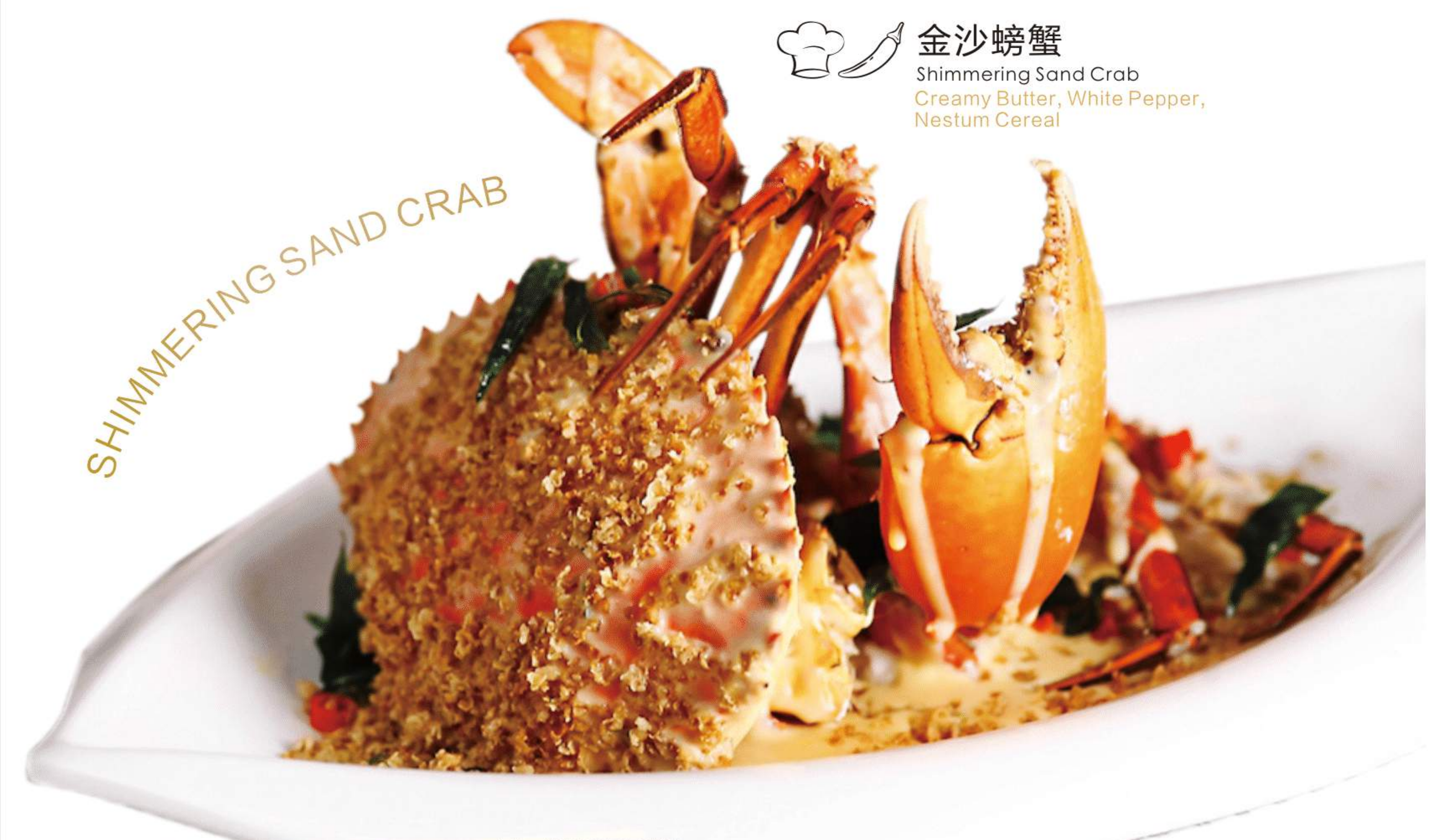
SHIMMERING SAND CRAB