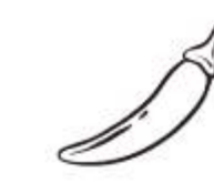
白胡椒螃蟹 White Pepper Crab