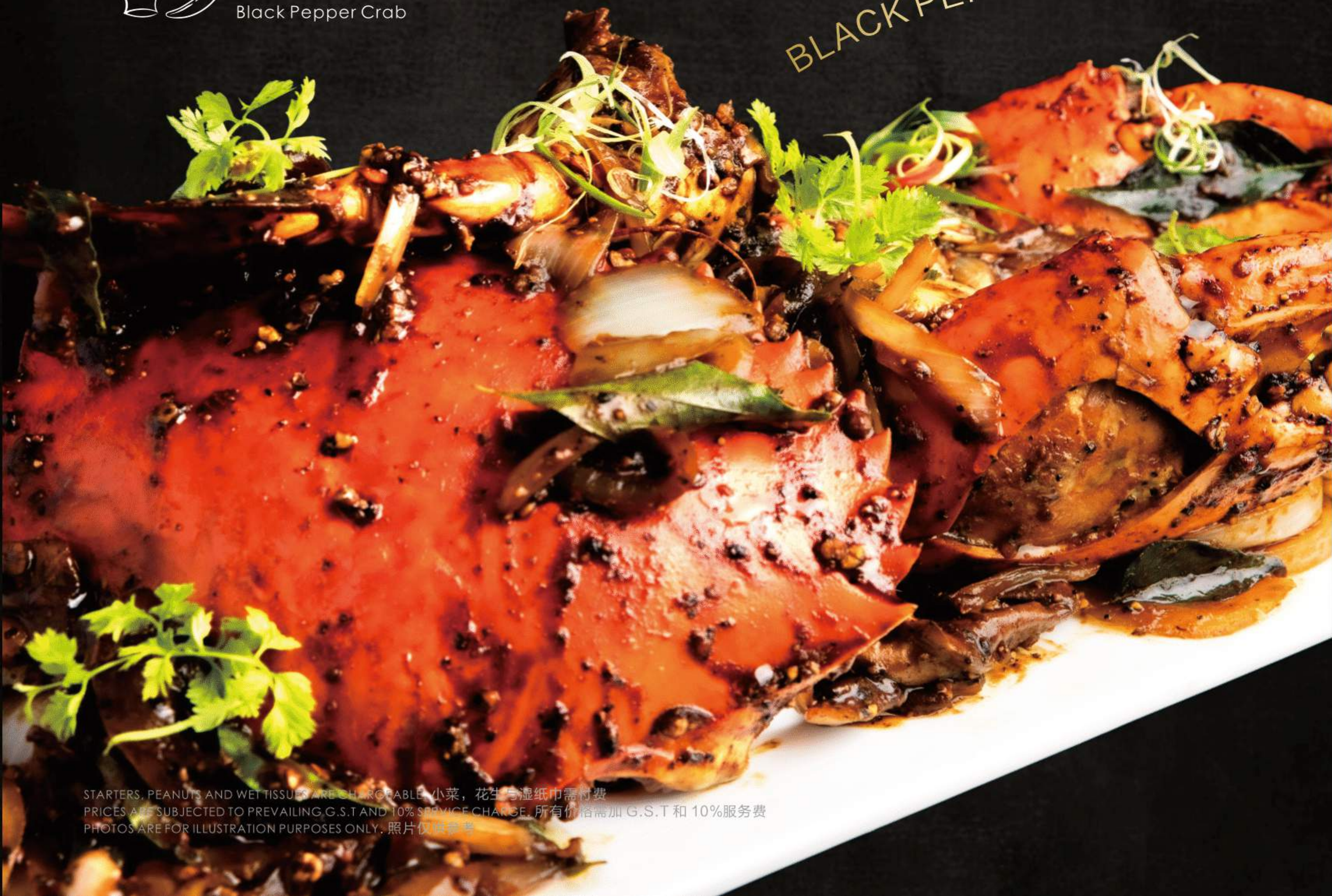
BLACK PEPPER CRAB