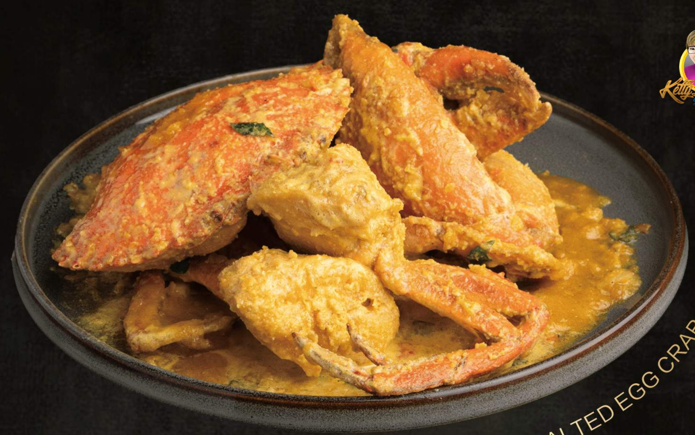
PAN-FRIED SALTED EGG CRAB

STARTERS, PEANUTS AND WET TISSUES ARE CHARGEABLE. 小菜, 花生与湿纸巾需付费 PRICES ARE SUBJECT TO PREVAILING G.S.T AND 10% SERVICE CHARGE. 所有价格需加 G.S.T 和 10% 服务费 PHOTOS ARE FOR ILLUSTRATION PURPOSES ONLY. 照片仅供参考