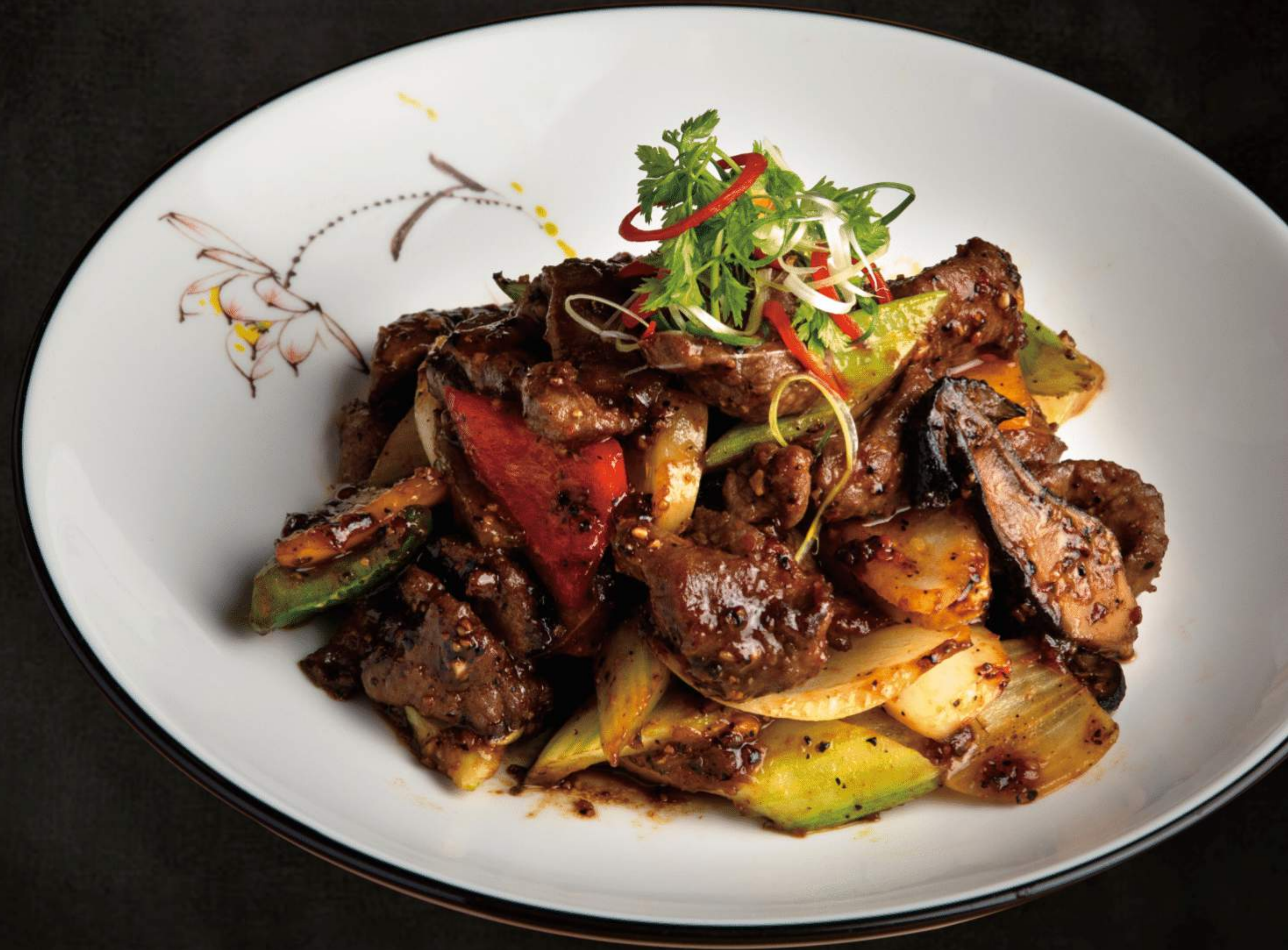
姜葱鹿肉 Spring Onion & Ginger Venison