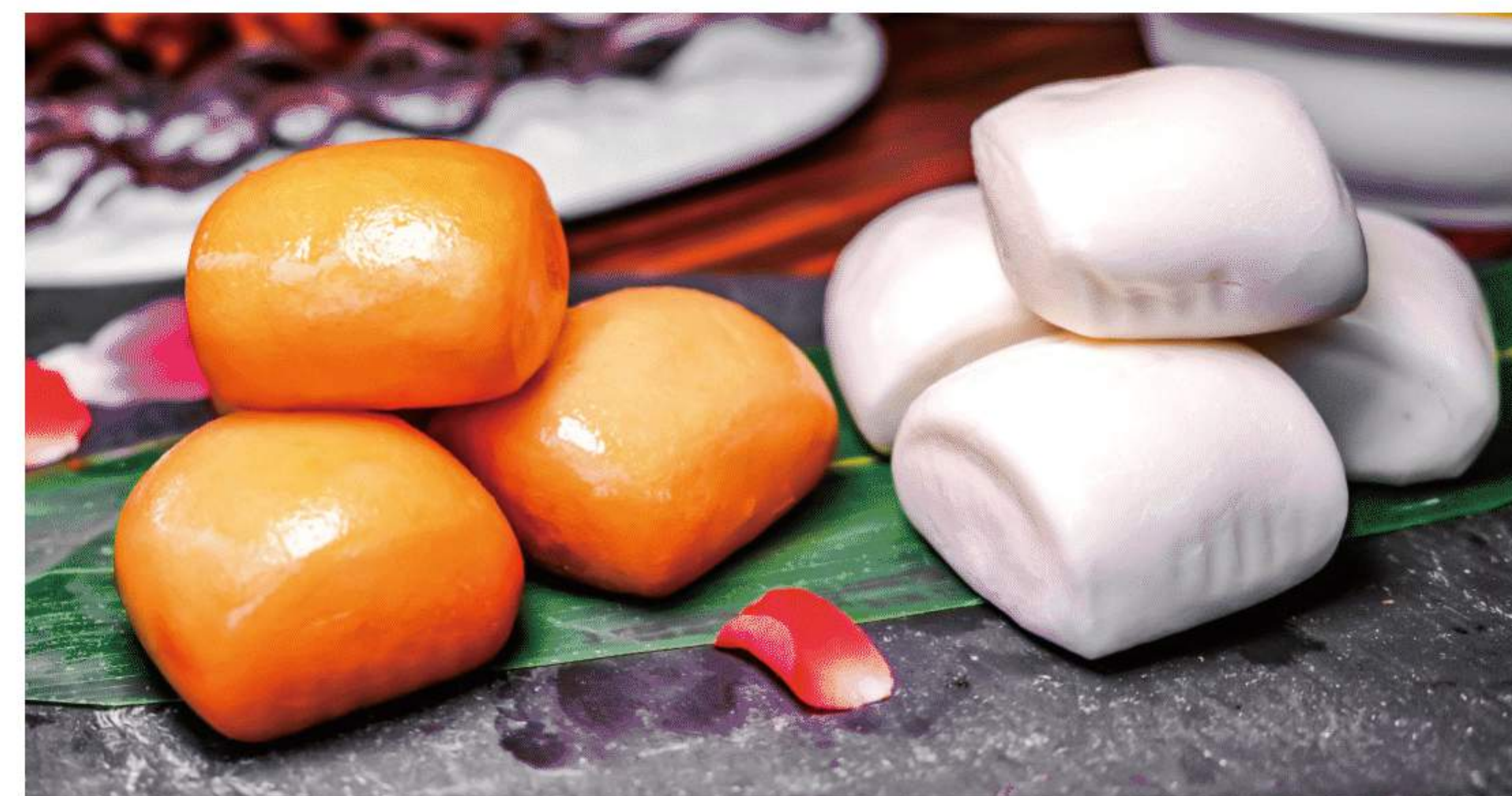
炸 / 蒸馒头 Deep-Fried / Steamed Buns