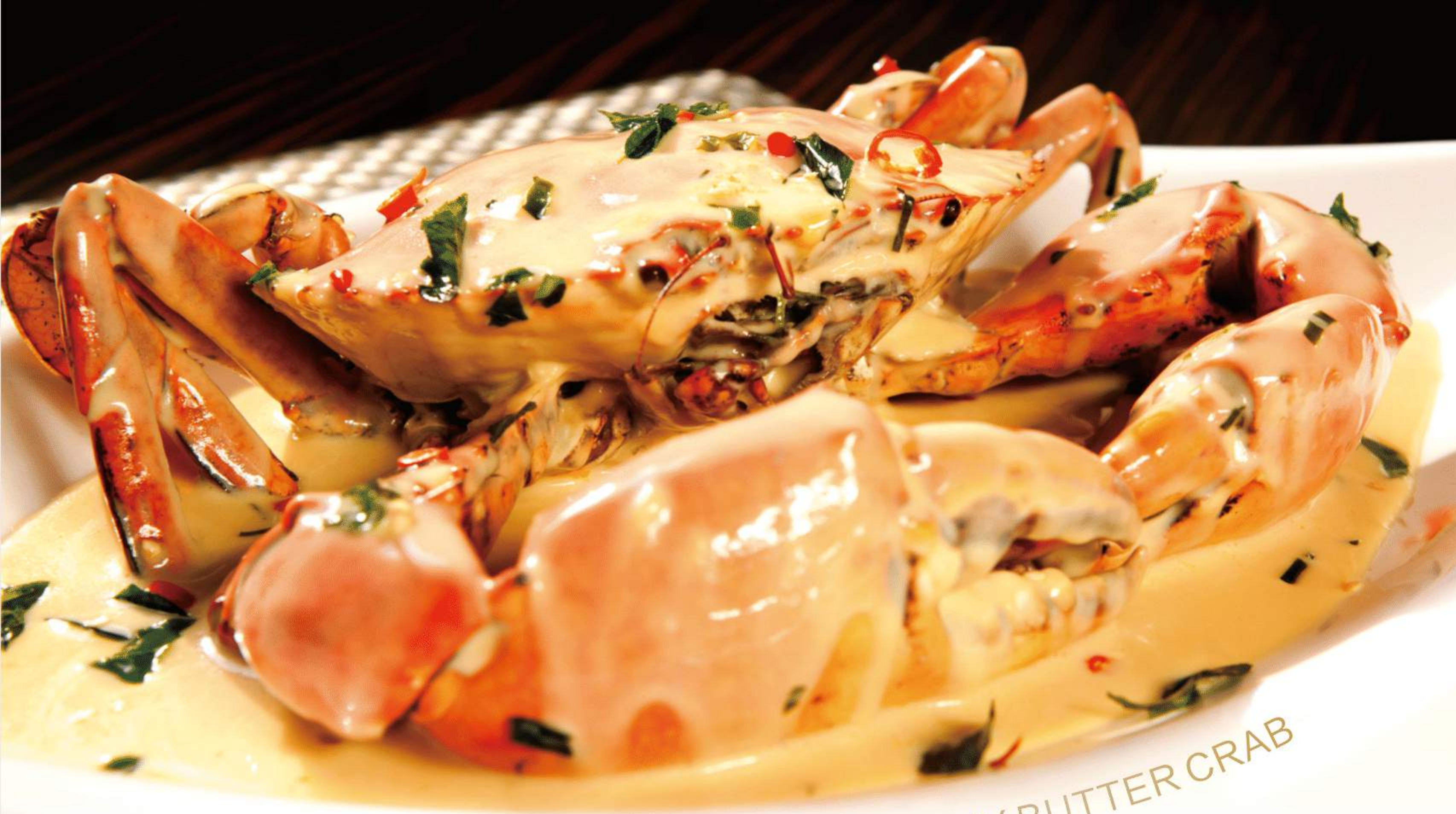
CREAMY BUTTER CRAB