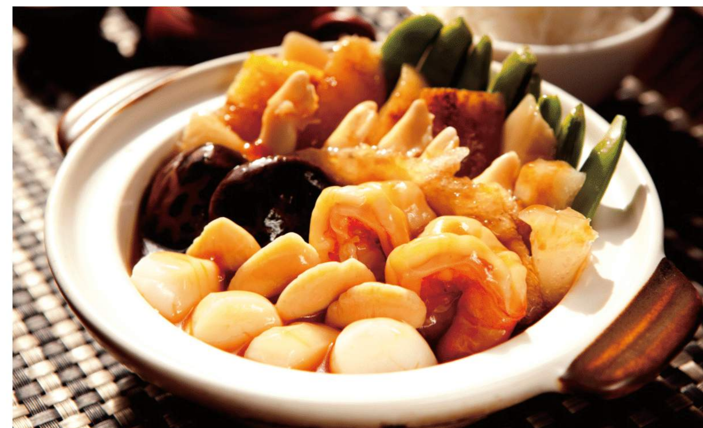
海味煲 Superior Braised Seafood Combination