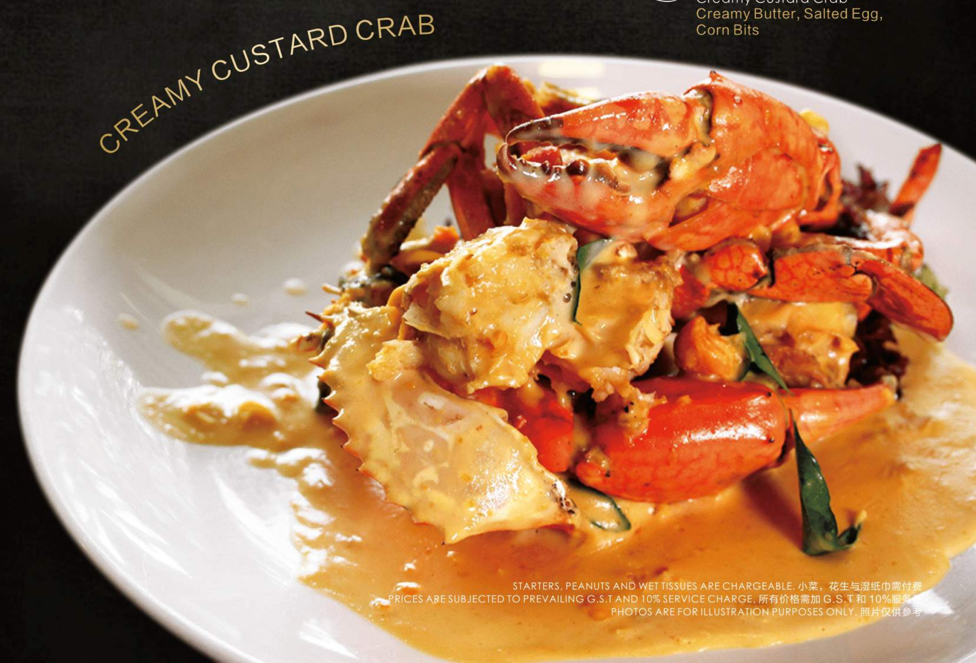
CREAMY CUSTARD CRAB