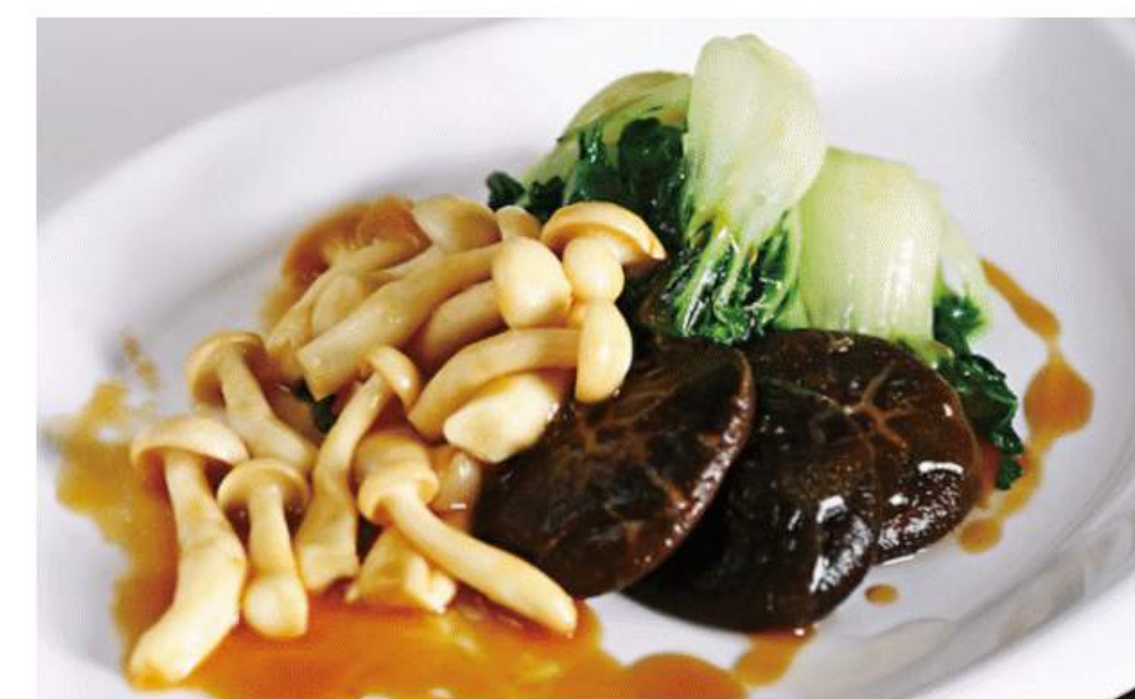
松菇奶白 $15 / $24 / $30 Shanghai Cabbage with Shimeji Mushroom