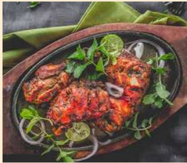
Chicken Tikka Sizzler $17.90