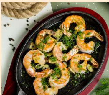
Lemon Butter Tiger Prawn Sizzler $19.90