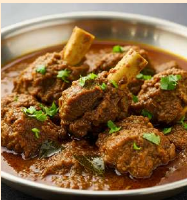
Mutton Chettinad Masala $16.90

Tender mutton pieces simmered in a flavourful, spicy gravy crafted with traditional Mysore spices and coconut