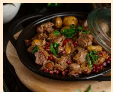
Lamb Chops Sizzler $19.90