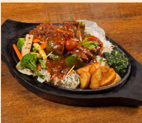
Mixed Veg Sizzler $18.90