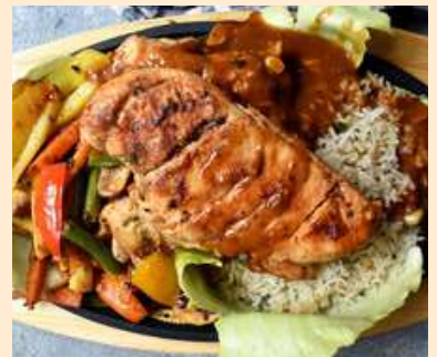
Grilled Chicken Sizzler $17.90