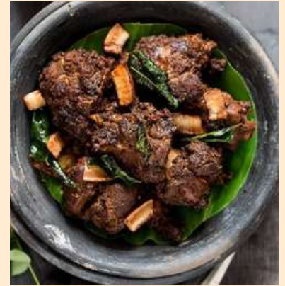
Mutton Pepper Fry $16.90

Tender mutton pieces infused with mutton pieces infused with coriander, cumin and a hint of pepper, cooked to perfection in gingelly oil