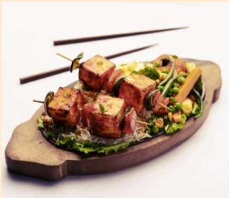
Paneer Tikka Sizzler $16.90