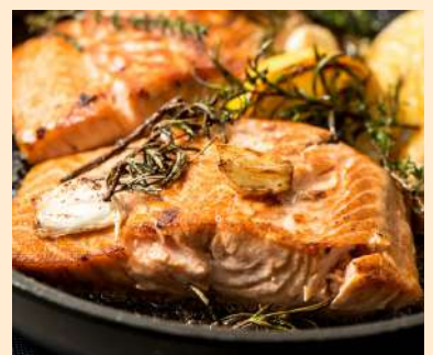
Salmon Sizzler $19.90