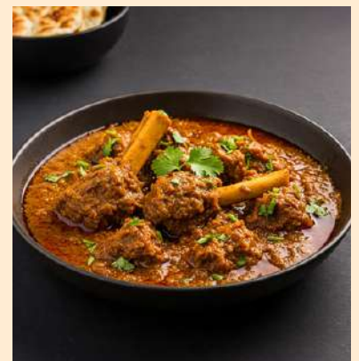
Hyderabad Mutton Gravy $16.90

Tender mutton cooked in a fragrant, spicy Chettinad masala with a blend of roasted spices and herbs