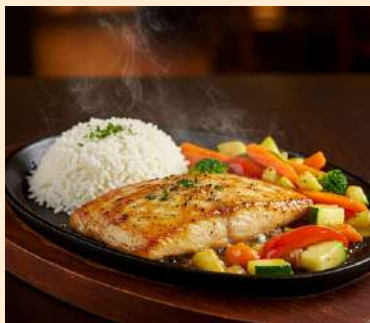
BBQ Fish Sizzler $17.90