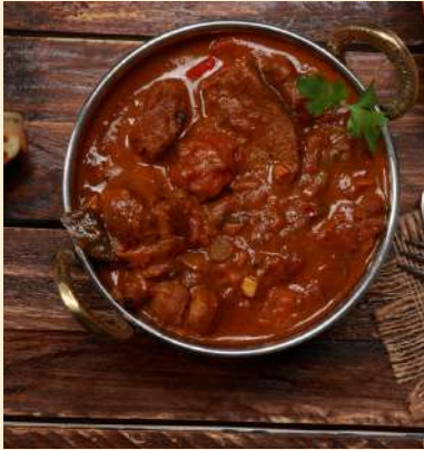
Mutton Rogan Josh $16.90

A classic Kashmiri curry made with tender mutton, infused with the warm flavours of fennel seeds and dry ginger powder