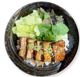
Grilled Tofu with Sweet Soy £9.5