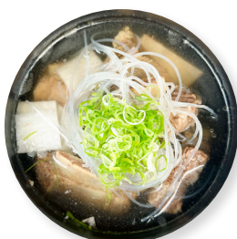
Galbi-Tang (Beef Short rib soup) £15.0