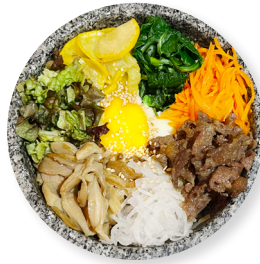
Bibimbap with Fried egg and Beef £12.0