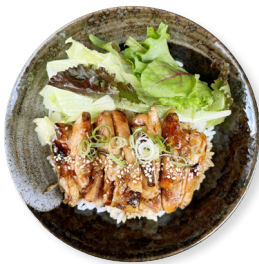
Grilled Chicken with Sweet Soy £10.0