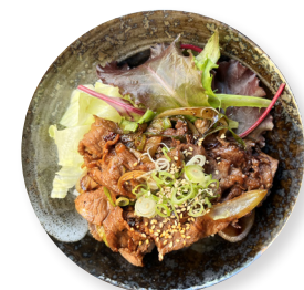
Beef Bulgogi with bean sprouts £12.5