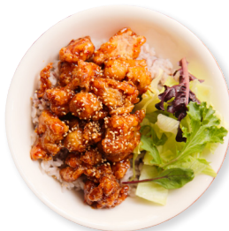
K-pop Chicken Original / Soy £9.5