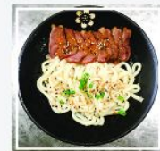
Cold Yuzu Ramen- Clam Ume Udon- Smoked Duck