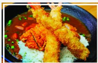
Ebi & Chicken Katsu Curry