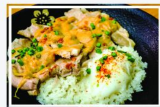
Miso Garlic Buta Don