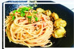
Hotate Mentaiko Pasta