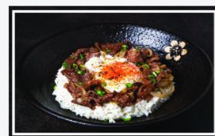
Australia Wagyu Don