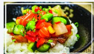
Chirashi Kaisen Don