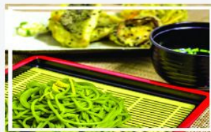
Cha Soba with Tempura