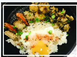
Grilled Garlic Kaisen Don