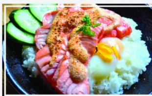
Salmon Mentai Don