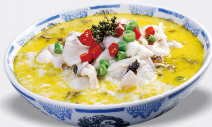
F2 PICKLED FISH 酸菜鱼 $19.80