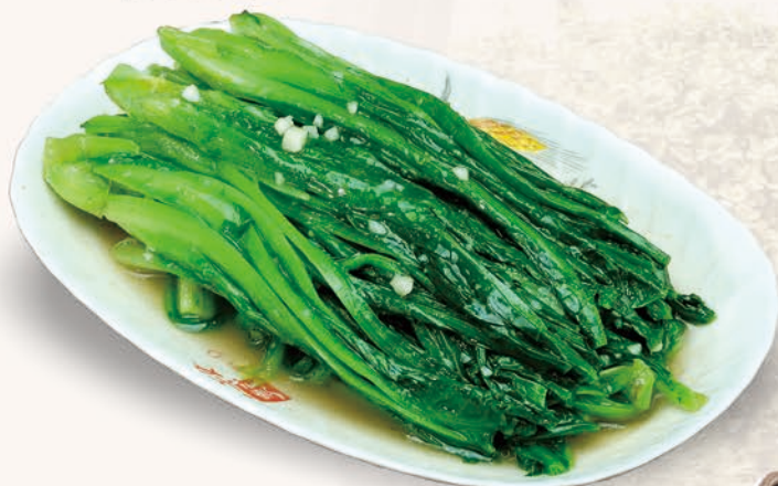
V3 STIR-FRIED OILSEED LETTUCE