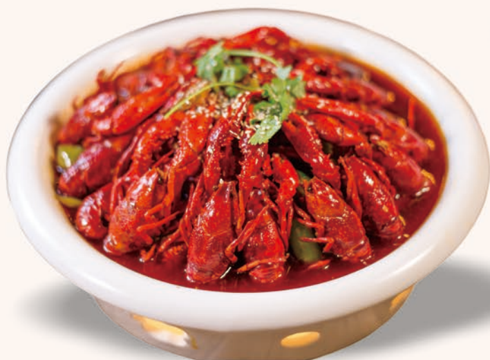
P4 DRYPOT PRAWNS