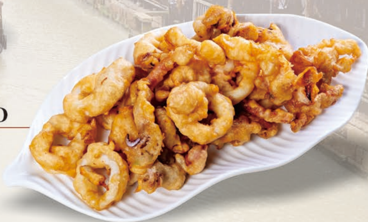
F3 SALTED EGG FRIED SQUID 咸蛋苏东 $16.80