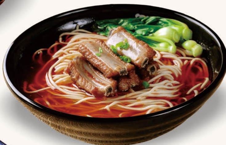
Z12 MALA NOODLE