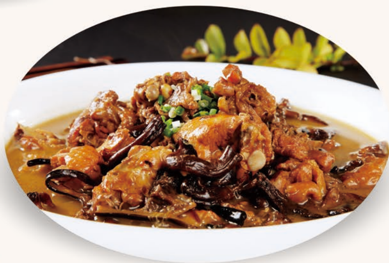
C3 CHICKEN WITH PORK INTESTINES