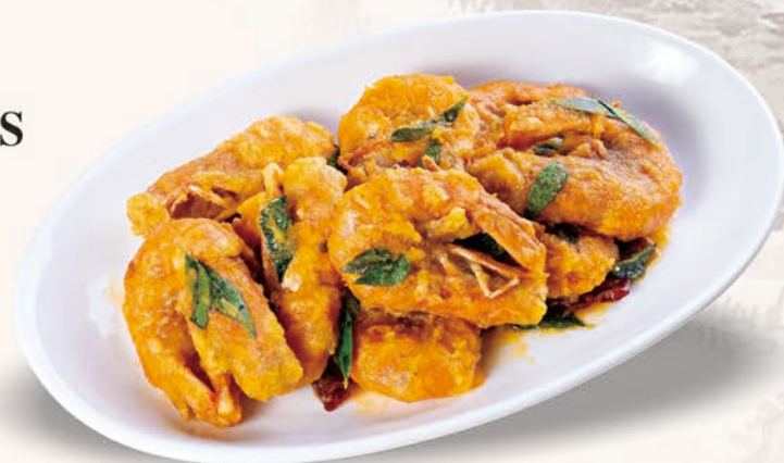
P3 MALA CRAYFISH