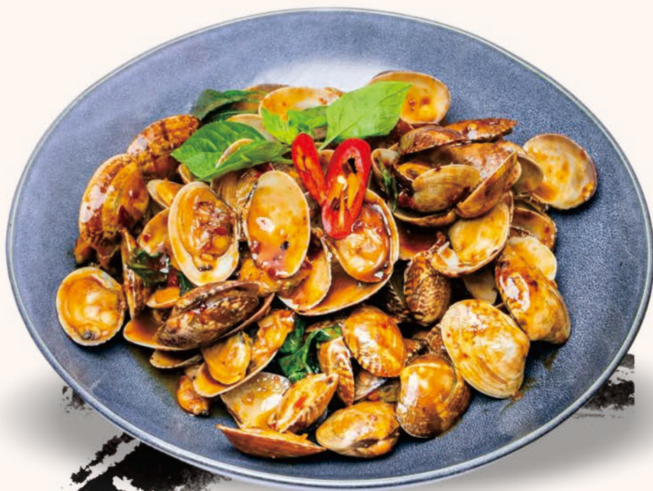
01 MALA CLAMS