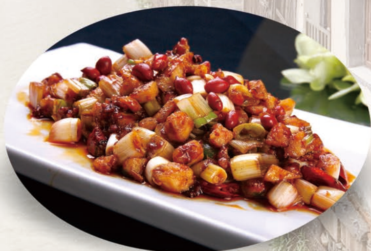
C6 KUNG PAO CHICKEN