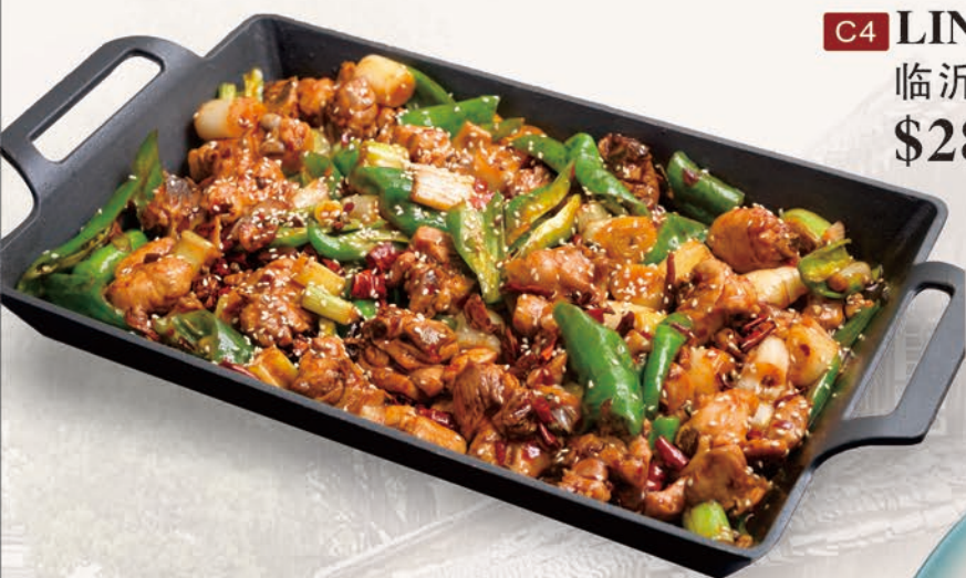
C4 LINYI-STYLE STIR-FRIED CHICKEN