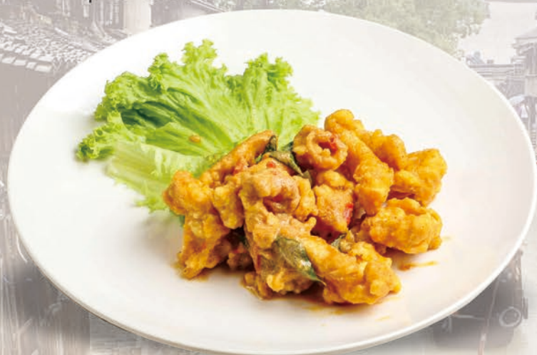
F4 DEEP FRIED CRUNCHY SQUID 酥炸苏东仔 $16.80