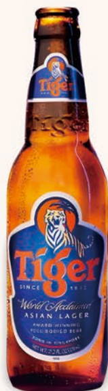
W2 TIGER BEER 老虎啤酒 (640ML) $8.80