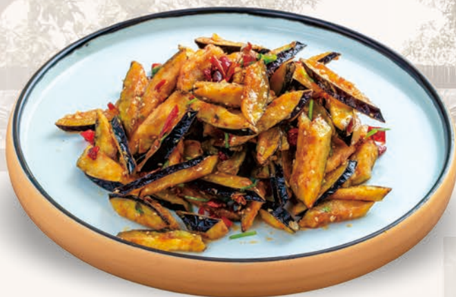
V2 STIR-FRIED AUBERGINE