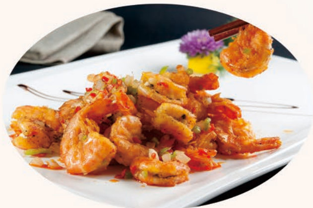
P1 SALT AND PEPPER PRAWNS