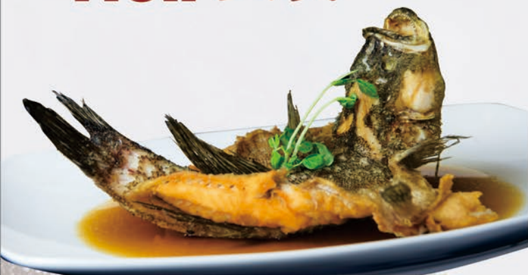
F1 STEAMED BRAISED FISH 金目鲈（清蒸、红烧）、酸菜鱼 $19.80