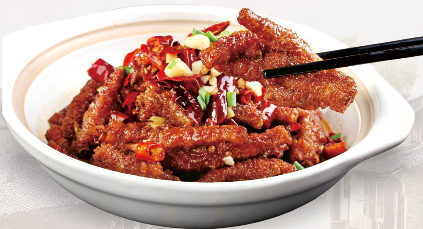
J1 BRAISED CHICKEN FEET