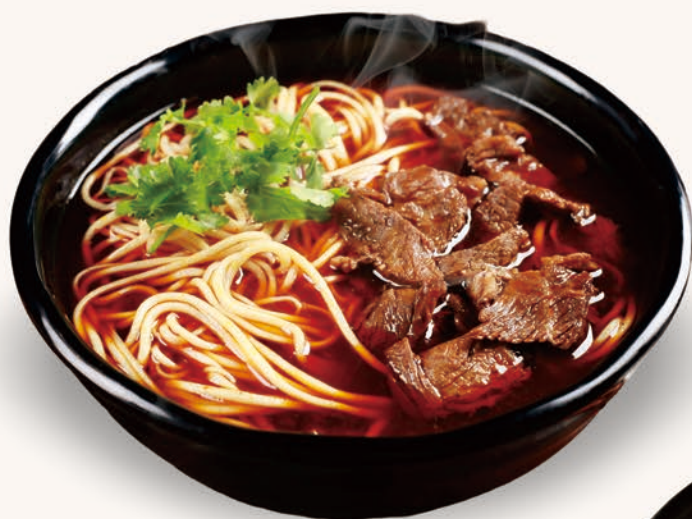
Z10 BEEF NOODLE