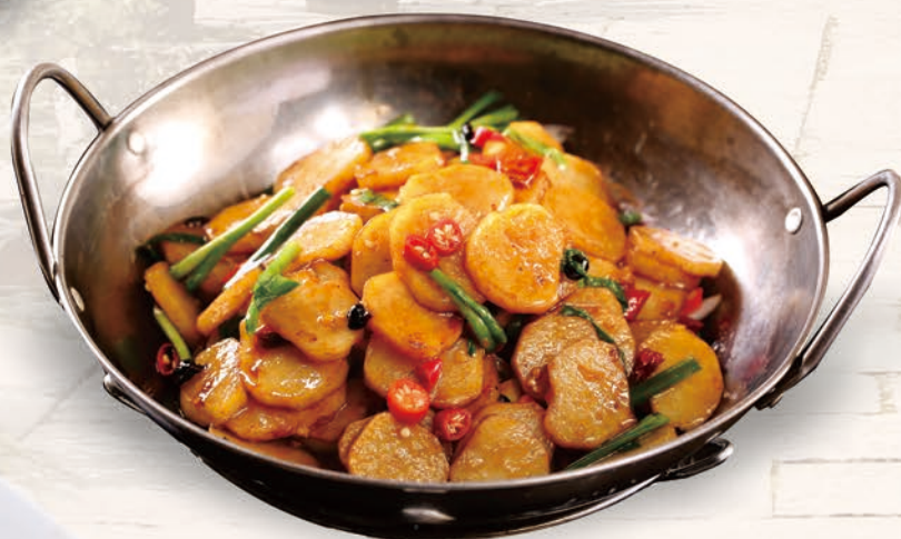
V5 STIR-FRIED YAM WITH BLACK FUNGUS