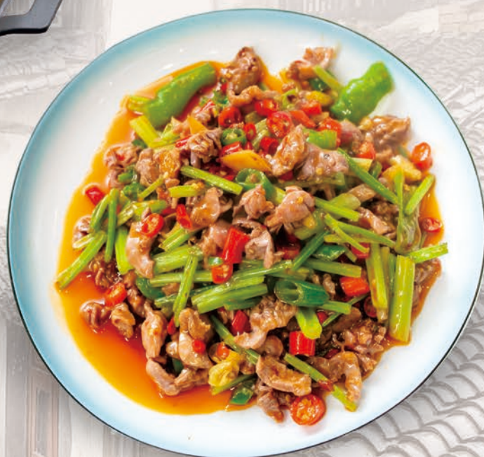
C5 SPICY STIR-FRIED CHICKEN INTESTINES