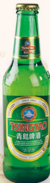
W4 TSINGTAO 2000 BEER 青島2000 $6.00

本菜谱图片仅供参考，出品以实物为准！ The pictures of the menu are only for your reference, To prevail in kind!