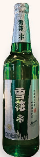
W1 SNOW BEER 雪花啤酒 $6.00