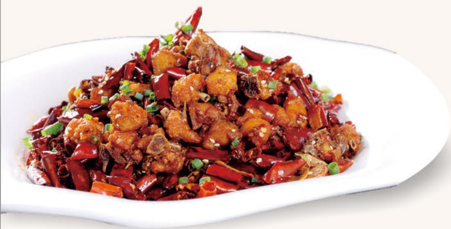
C1 SPICY CRISPY CHICKEN