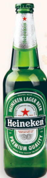
W3 HEINEKEN BEER 喜力啤酒 $10.00