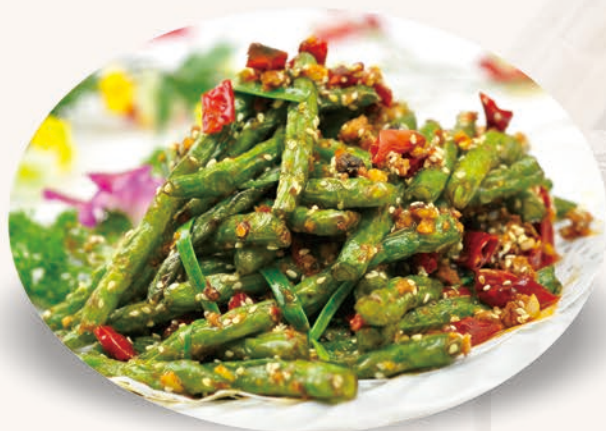
V1 DRY-FRIED STRING BEANS