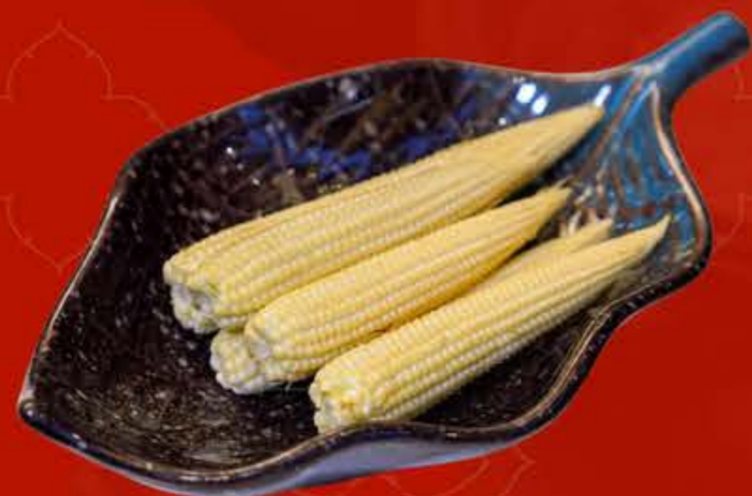
Baby Corn 玉米笋 - $5.50