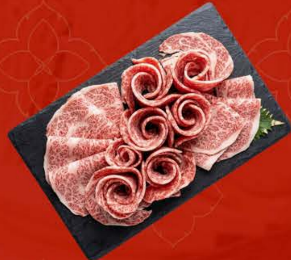
Premium Beef Slice 顶级牛肉片 - $27