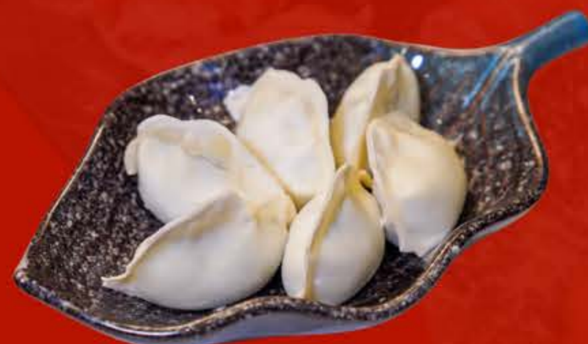
Dumpling 水饺 - $8.50