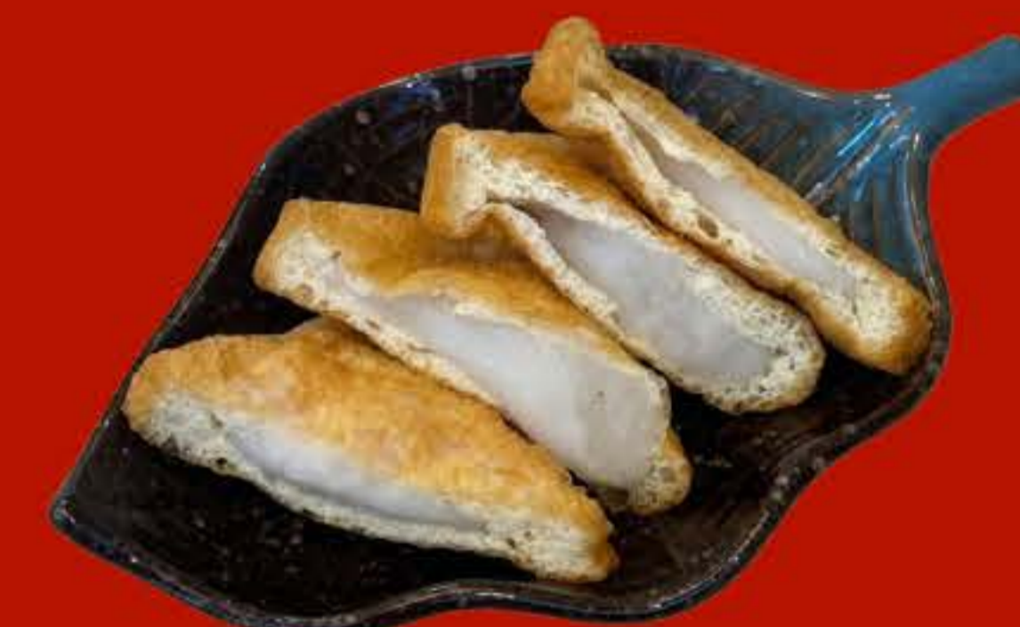
Fresh Tao Pok 豆卜 - $10