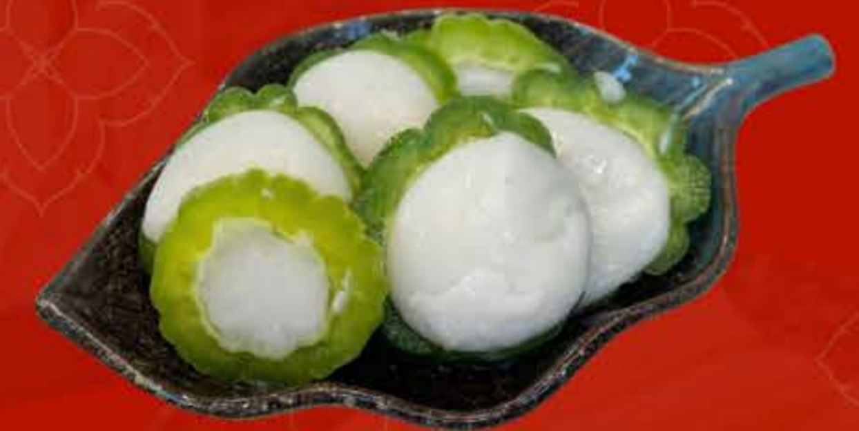
Premium Bitter Gourd with Fish Paste 顶级酿苦瓜 - $12