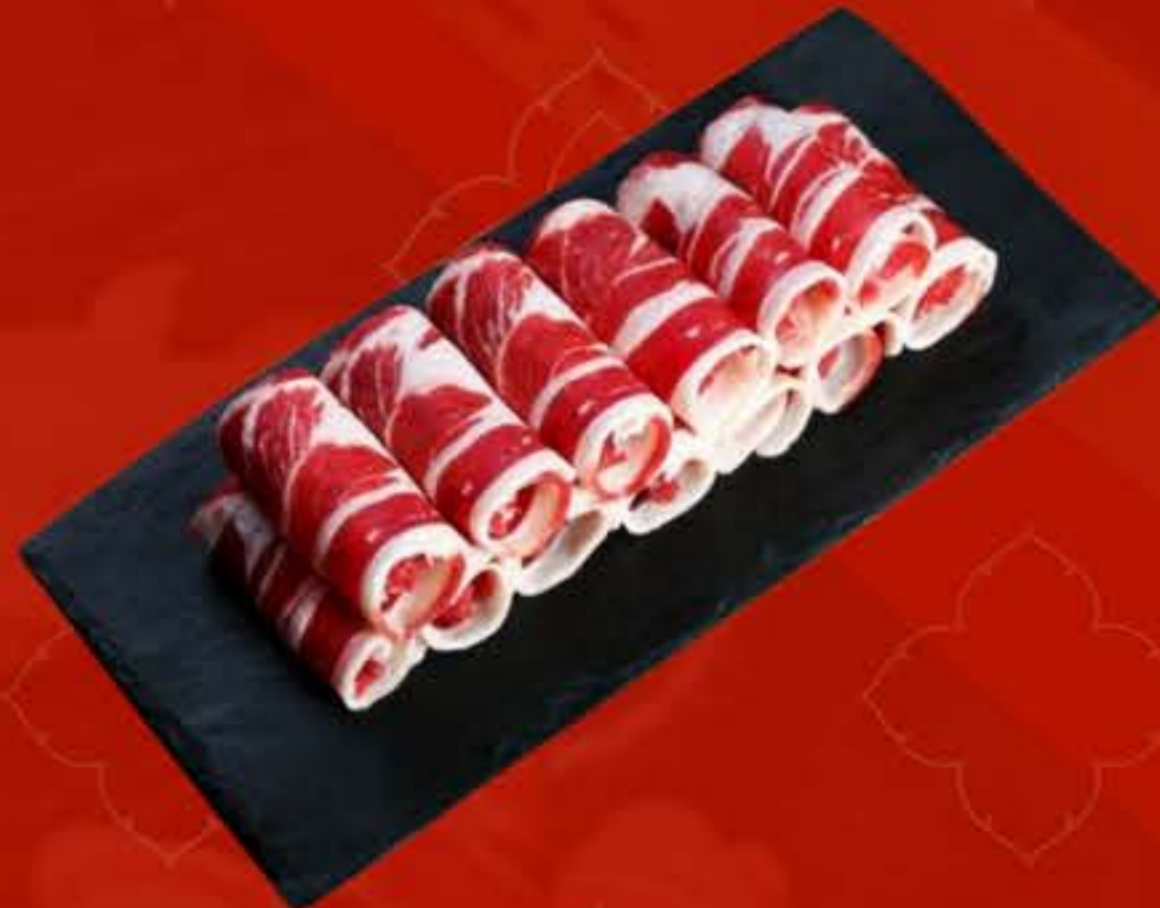
Beef Slice 牛肉片 - $19