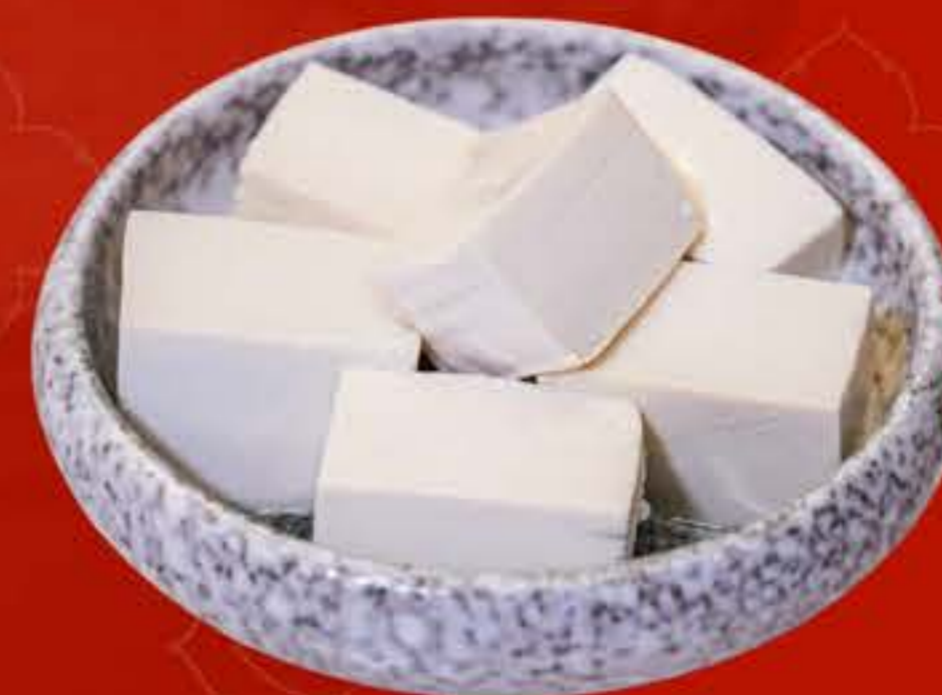
Tao Fu 豆腐 - $7