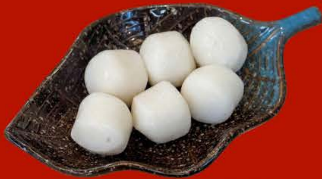
Premium Fish Ball 顶级鱼丸 - $9