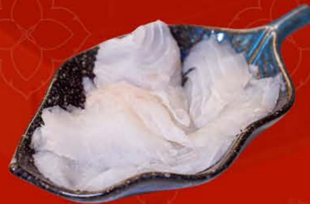
Seabass Fillet 鲈鱼片 - $16.50