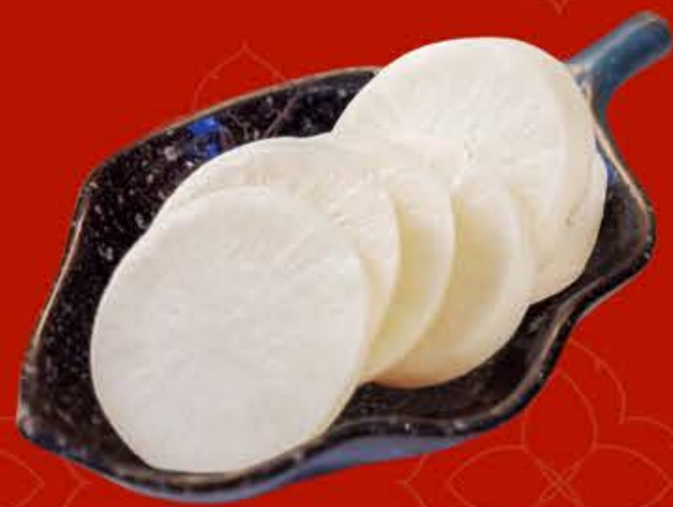
White Radish 白萝卜 - $5.50