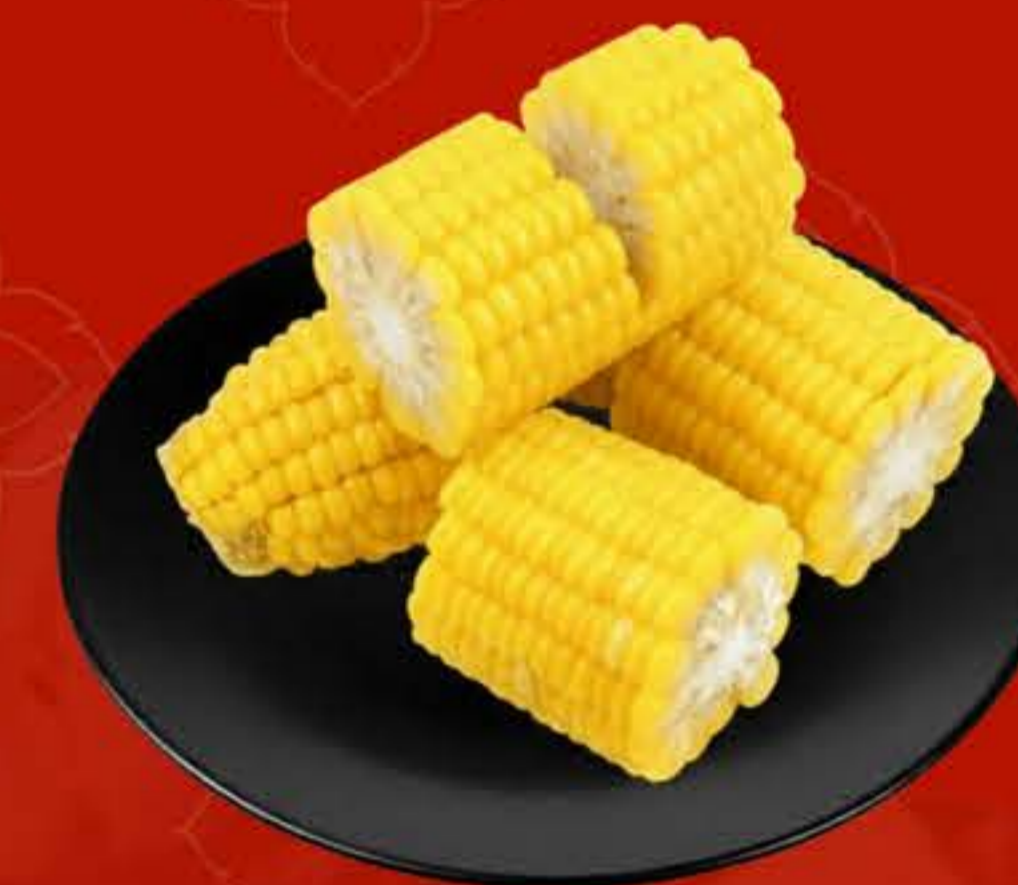
Corn 玉米 - $5.50