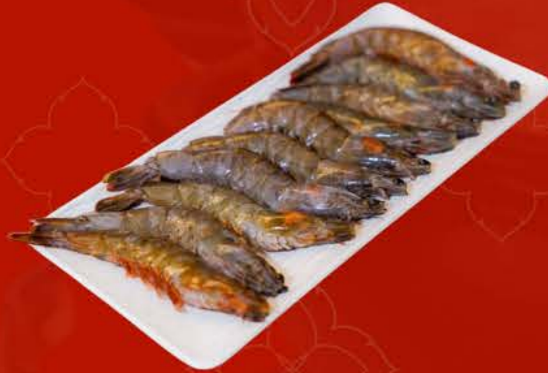
Tiger Prawn 老虎虾 - $24