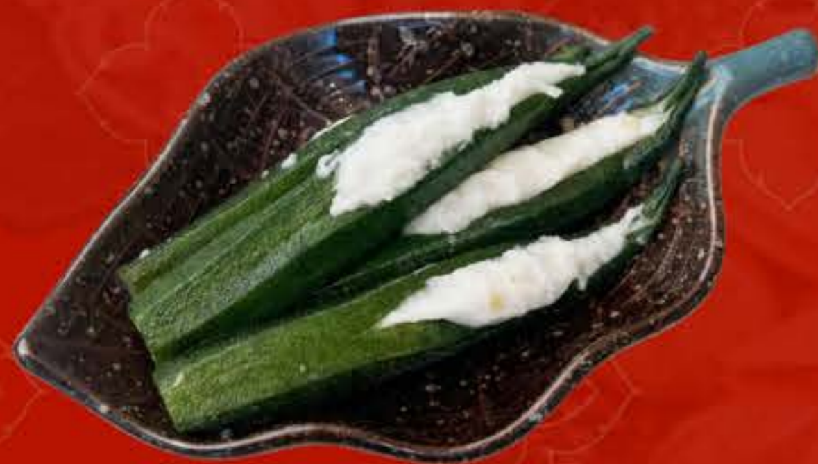
Premium Lady Finger Yong Tau Fu 顶级酿羊角豆 - $8