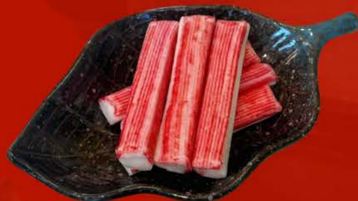
Seafood Stick 海鲜条 - $8.50