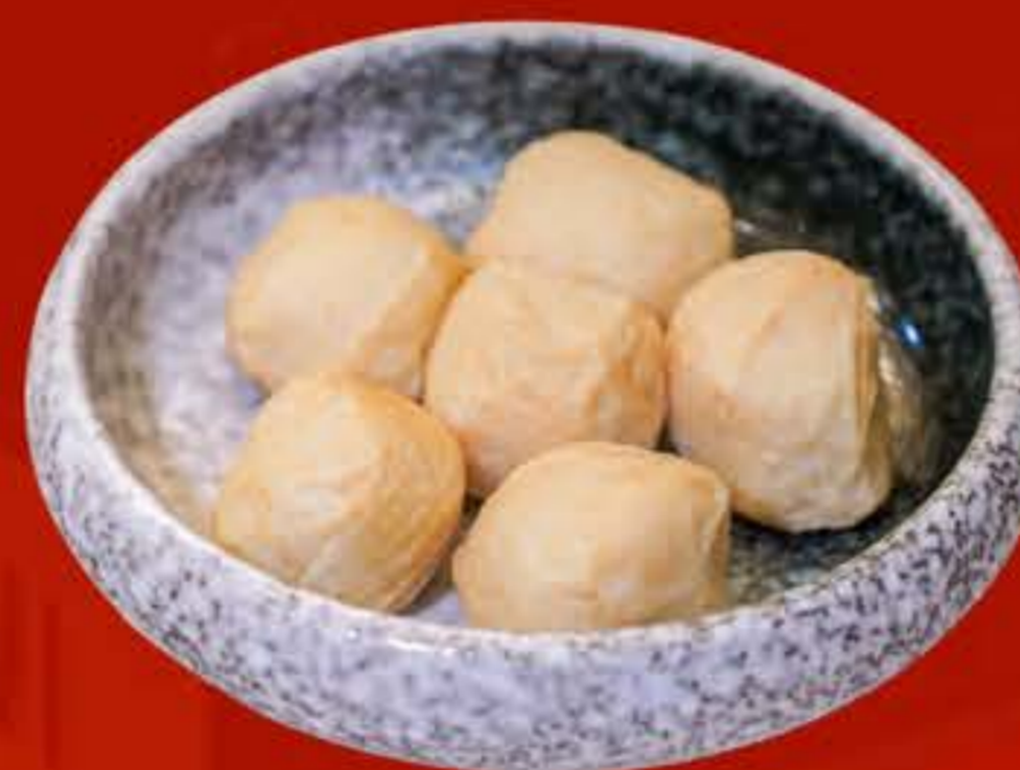
Cheese Tofu 芝士豆腐 - $8.50