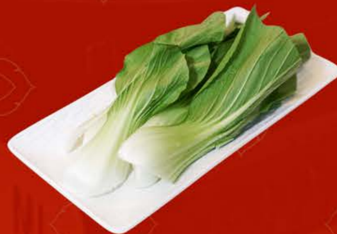
Xiao Bai Cai 小白菜 - $6.50