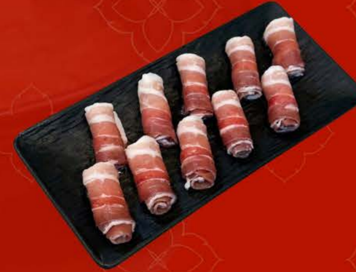
Premium Pork Collar 顶级五花肉 - $27