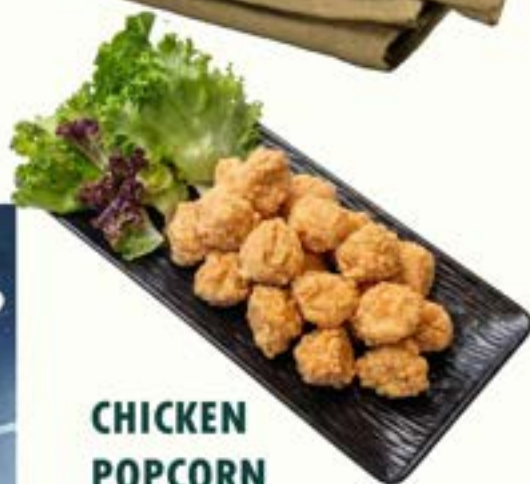
CHICKEN POPCORN $15.00