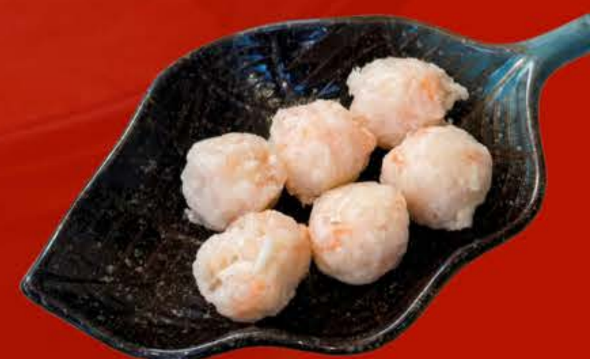
Premium Shrimp Ball 顶级虾丸 - $12