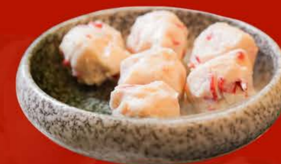
Lobster Balls 龙虾丸 - $11.50