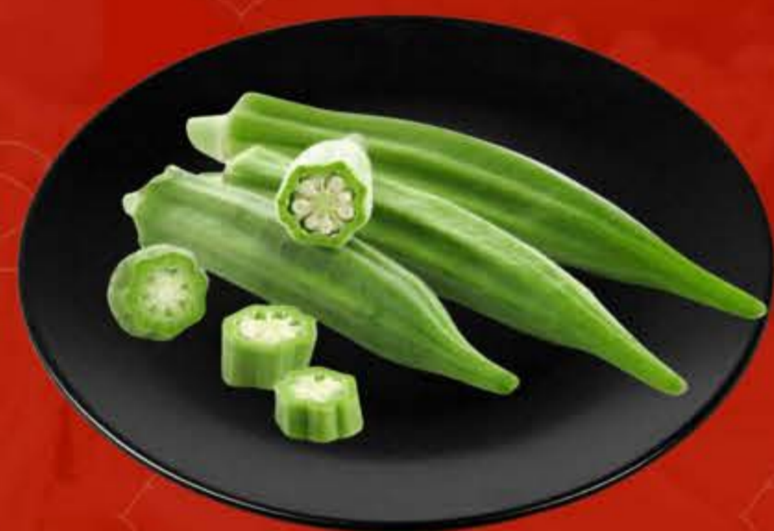
Lady Finger (Okra) 秋葵 - $7