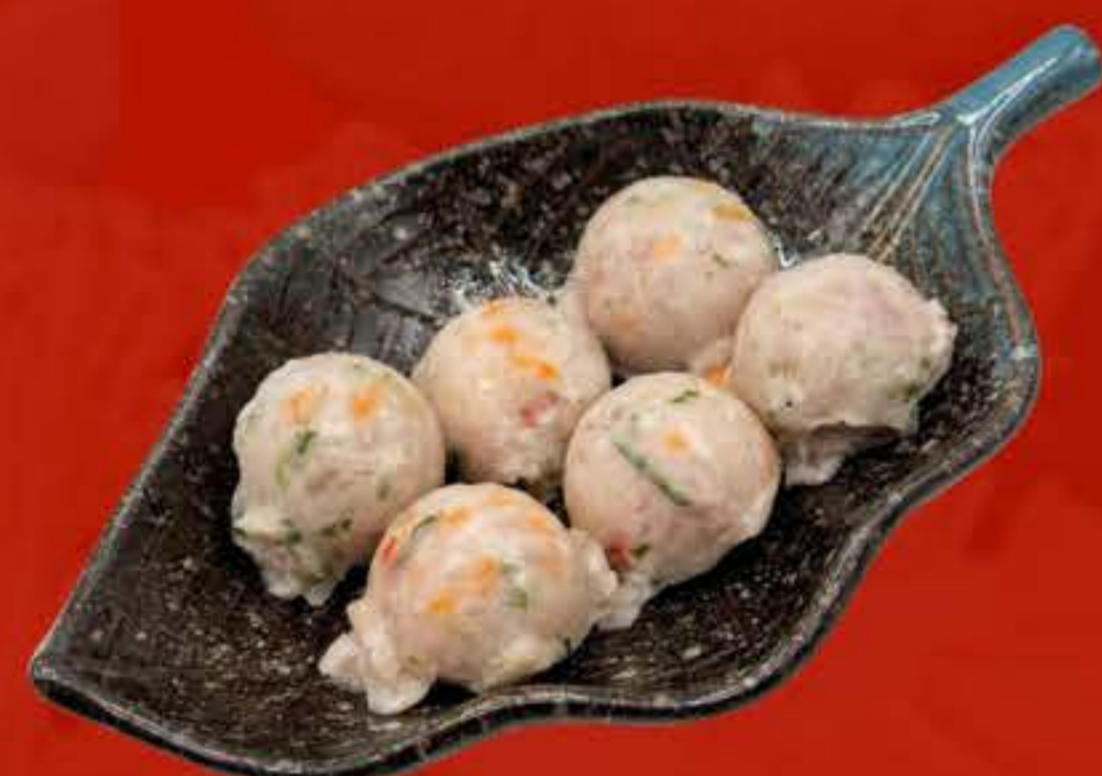
Premium Teochew Pork Ball 顶级潮州肉丸 - $12.80