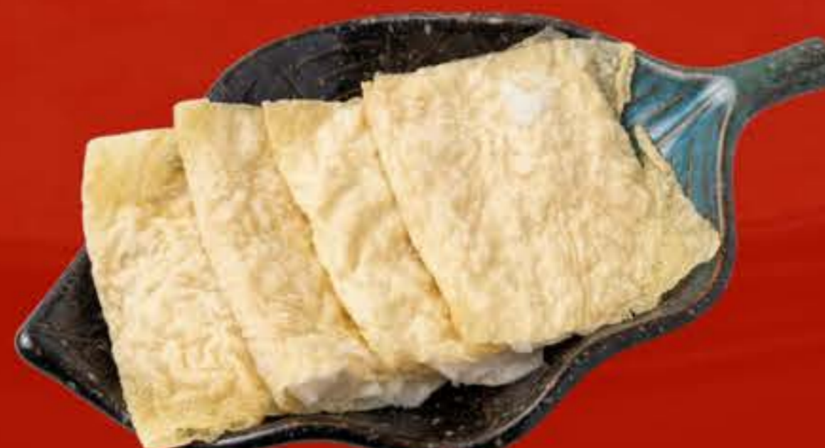
Tao Kee 酿腐竹 - $10