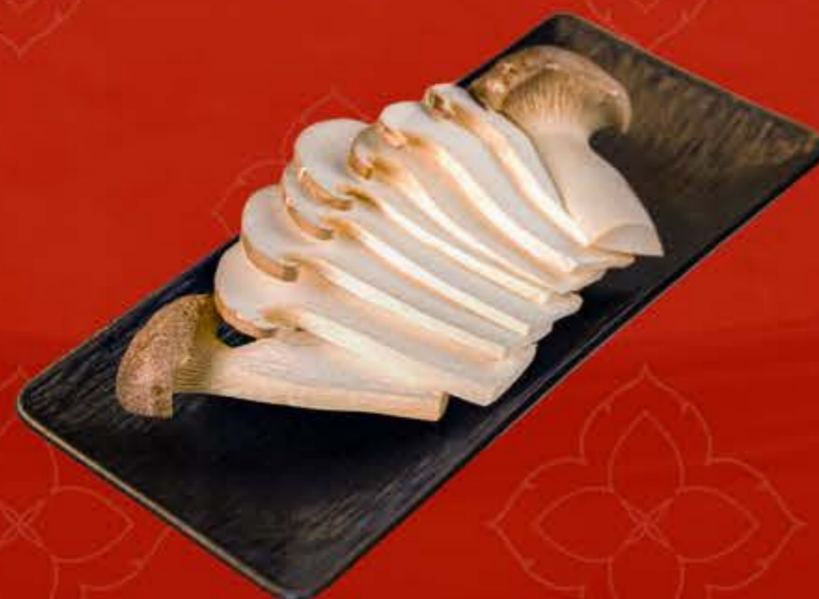
King Oyster Mushroom 杏鲍菇 - $7