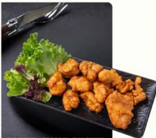
KOREAN CRISPY CHICKEN $16.90