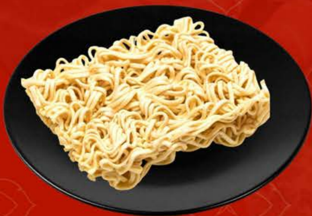
Instant Noodle 即食面 - $5