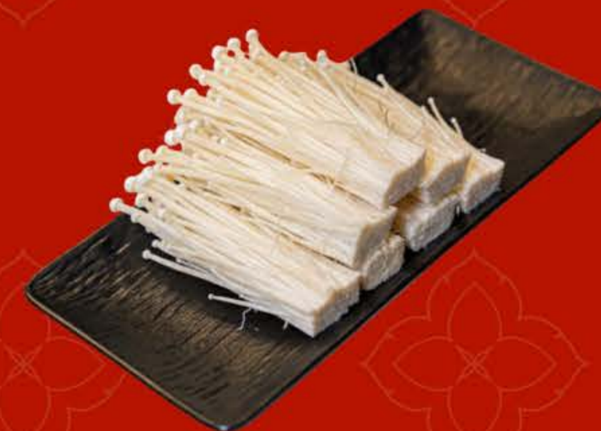
Enoki Mushroom 金针菇 - $8.50