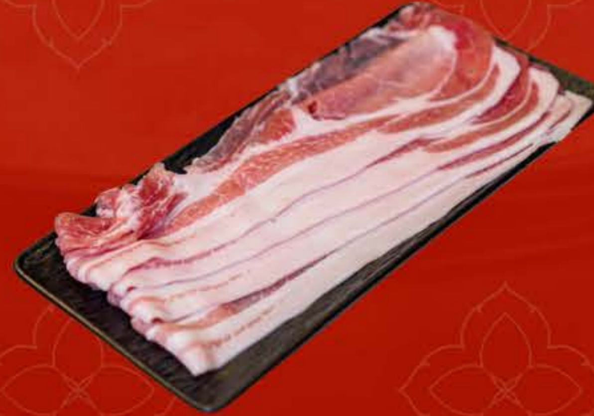
Pork Slice 猪肉片 - $17.50