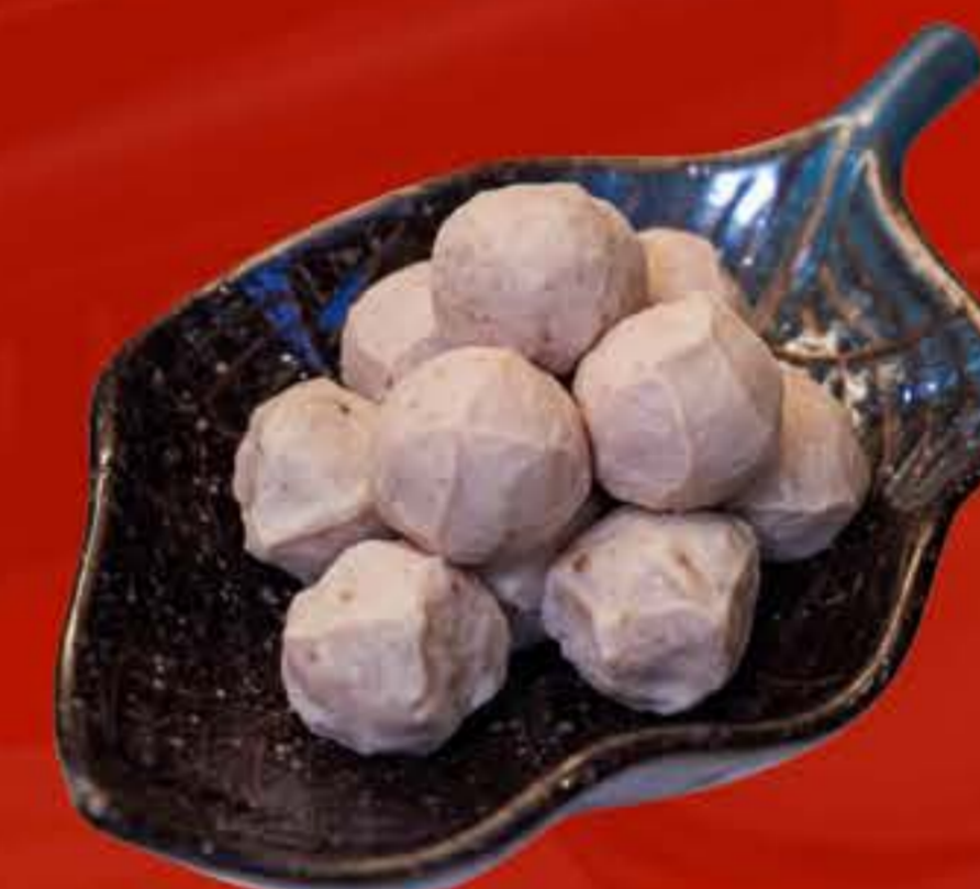
Pork Ball 猪肉丸 - $11