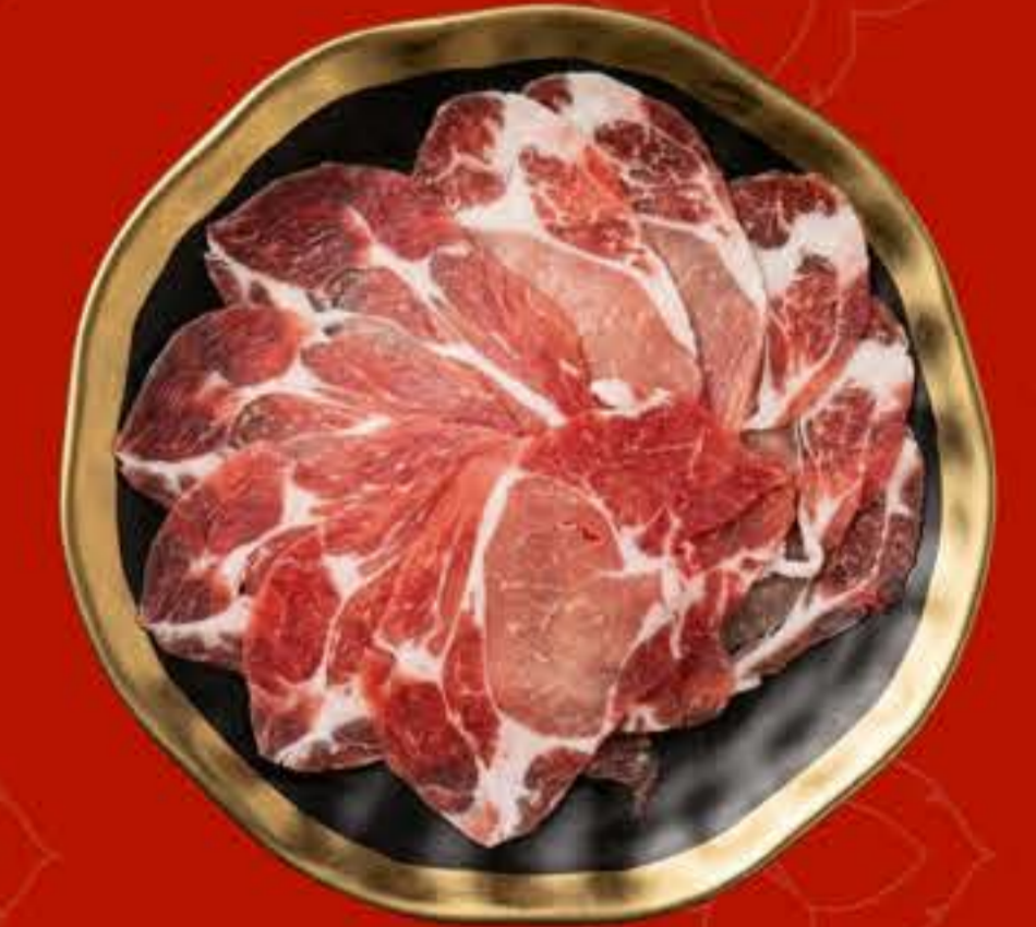
Premium Pork Belly 顶级三层肉 - $28