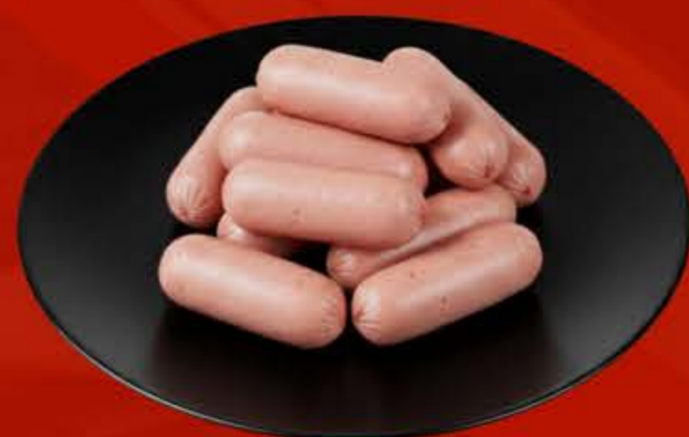
Cocktail Sausage 迷你香肠 - $7