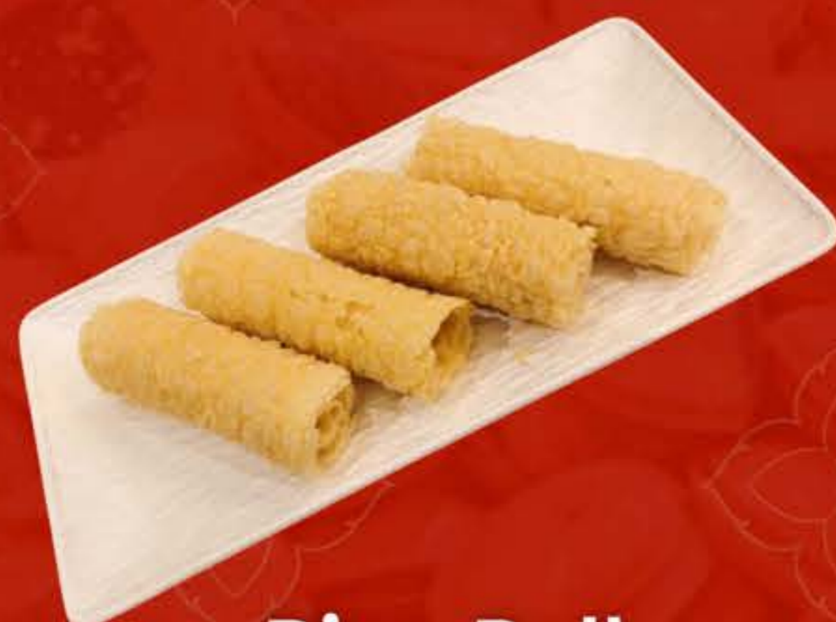
Ring Roll 玲玲卷 - $8.50