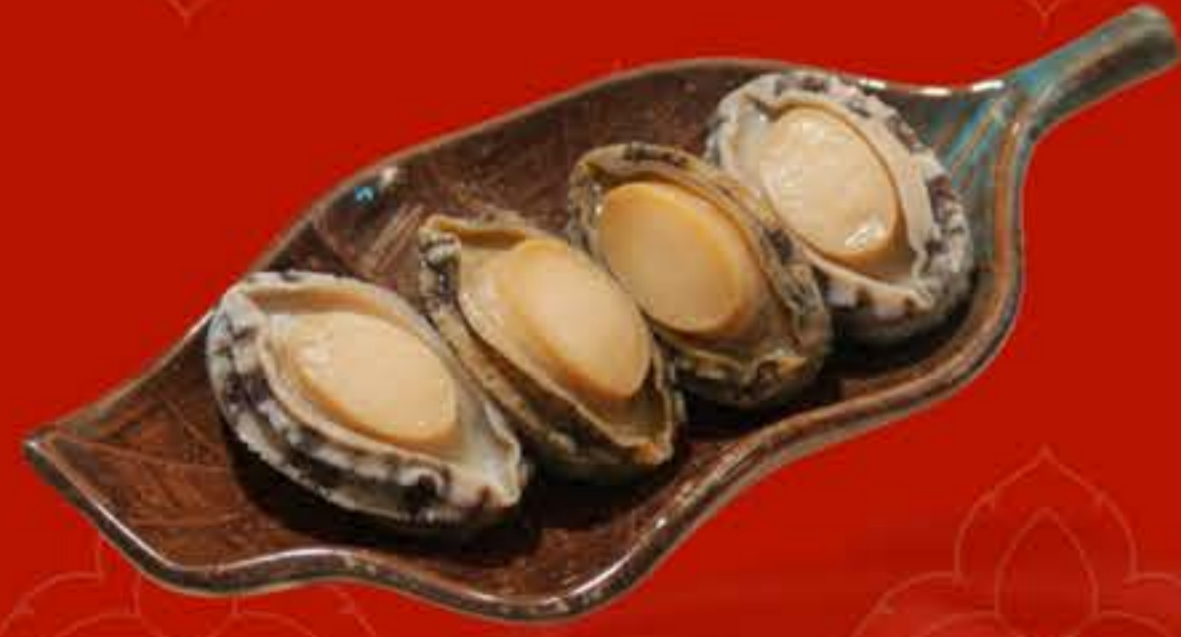
Mini Abalone 小鲍鱼 - $28