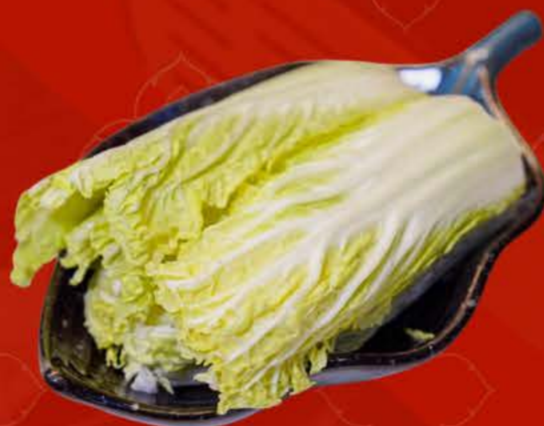
Chinese Cabbage 大白菜 - $6.50