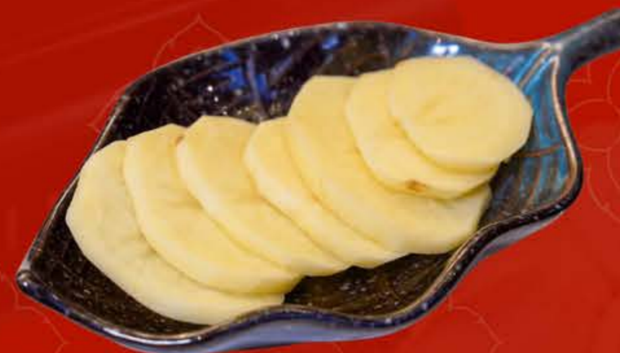
Potato 马铃薯片 - $6.50