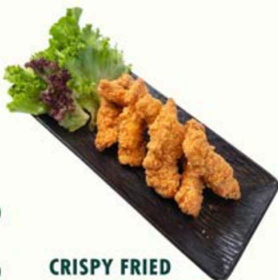
CHICKEN POPCORN $15.00

Chicken Popcorn is small, crispy, deep-fried chicken bites.