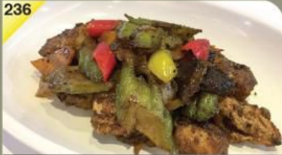
豉汁苦瓜鱼头 Bitterguard Fish Head