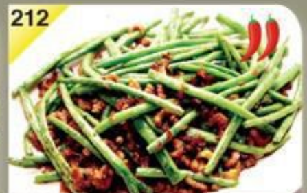
212 虾米四季豆 Crispy Shrimp with French Bean $10.00