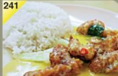
咸蛋鸡肉饭 Salted Egg Chicken Rice