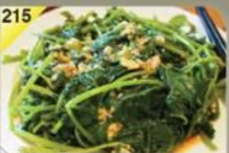
215 蒜蓉薯苗 Stir Fried Sweet Potato Leaf $8.00