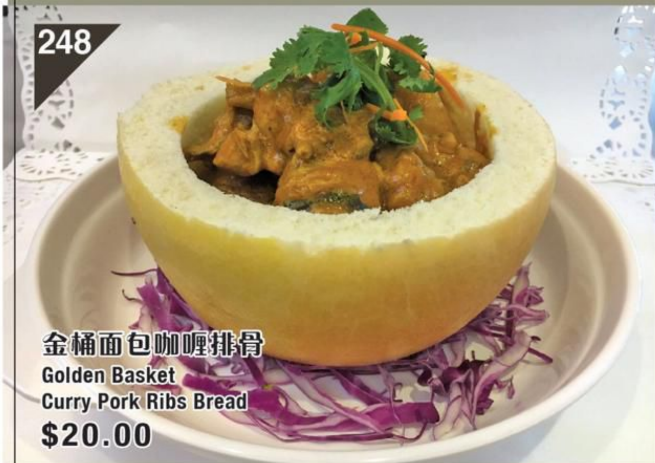
金桶面包咖喱排骨 Golden Basket Curry Pork Ribs Bread $20.00