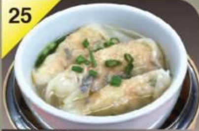
港式汤饺 H.K. Dumpling Soup