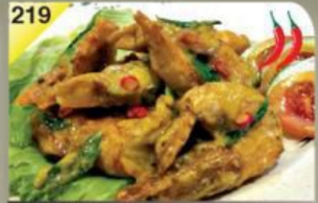
219 咸蛋虾 Salted Egg Prawn $22.00