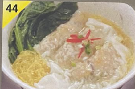
水饺面 (汤) Dumpling Noodles (Soup) $5.50