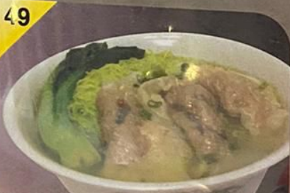
翡翠水饺面 (汤) Emerald Dumpling Noodles (Soup) $6.00