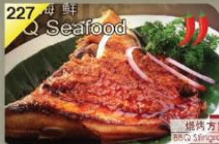
227 海鲜 BBQ Stingray $20.00