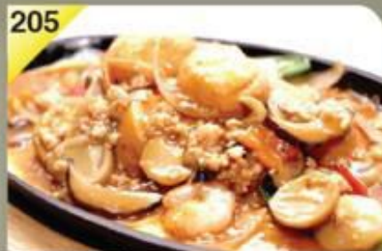
205 铁板豆腐 Hot Plate Tofu $12.00