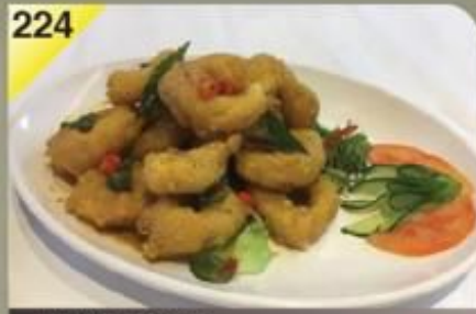
224 脆炸咸蛋苏东 Crispy Salted Egg Sotong $14.00