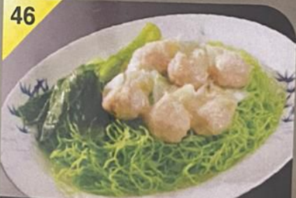
翡翠云吞面 (干) Emerald Wonton Noodles (Dry) $5.00