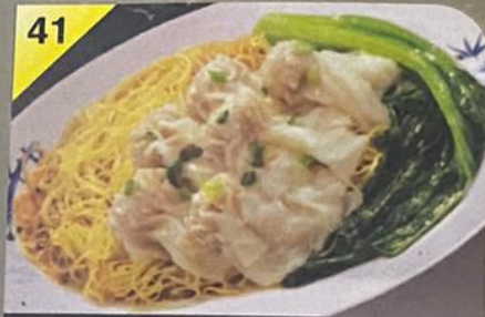
港式云吞面 (干) H.K. Style Wonton Noodles (Dry) $4.50