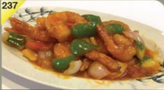
酸甜虾 Sweet & Sour Prawn