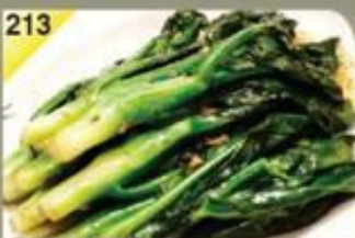
213 清炒芥兰 Stir Fried Kal Lan $8.00