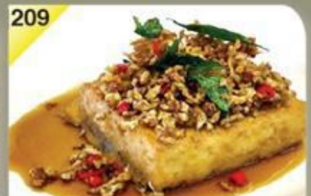
209 菜脯豆腐 Dry Vegetable Tofu $10.00