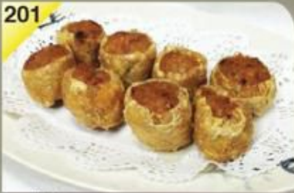
201 虾枣 Fried Prawn Roll $12.00