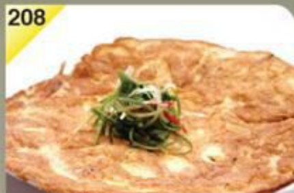
208 大葱煎蛋 Onion Omelette $8.00