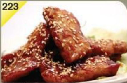
223 排骨王 Pork Rib King $12.00