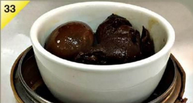
猪脚醋 Pork Trotter with Vinegar