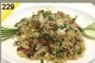
229 扬州炒饭 YangZhou Fried Rice $5.00