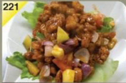
221 咕嚕肉 Sweet and Sour Pork $12.00