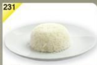
231 白饭 Rice $0.70