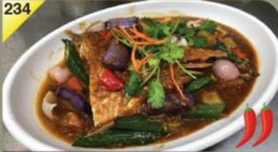
亚参鱼头 Assam Fish Head