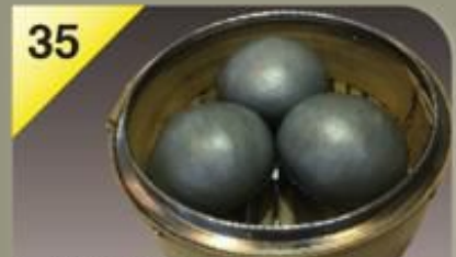
竹炭榴莲包 Bamboo Charcoal Durian Bao