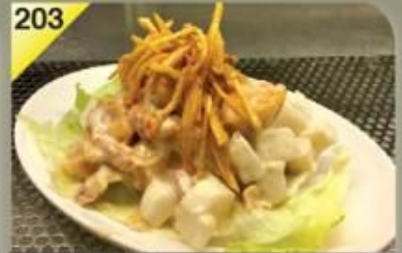
203 香梨沙律虾球 Pear Salad Shrimp Balls $22.00