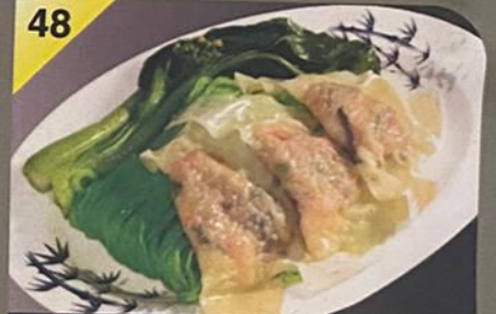
翡翠水饺面 (干) Emerald Dumpling Noodles (Dry) $6.00