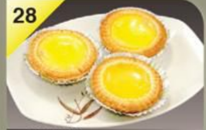
传统蛋挞 Traditional Egg Tarts