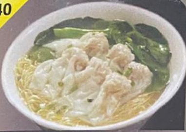
港式云吞面 (汤) H.K. Style Wonton Noodles (Soup) $4.50