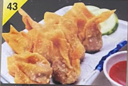
炸云吞 Fried Dumpling $4.80