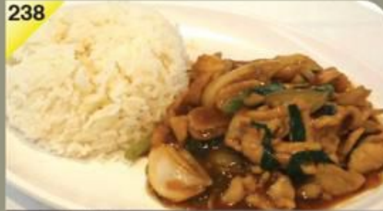
姜葱猪肉饭 Ginger Spring Onion Pork Rice