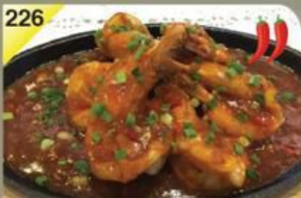
226 铁板辣子虾 Hotplate Spicy Prawn $20.00