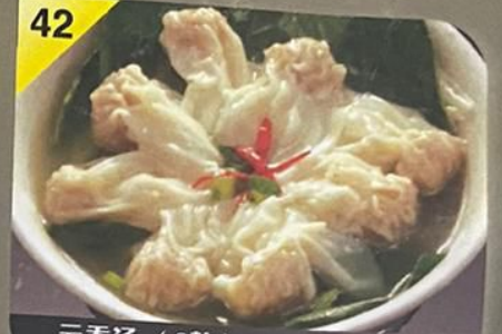
云吞汤 (8粒) Wonton Soup $4.80