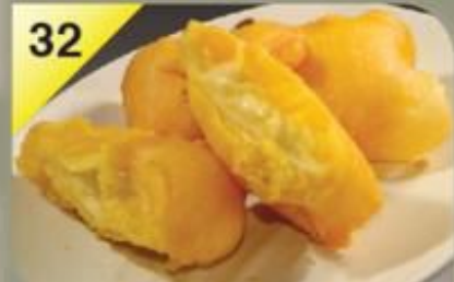
脆炸榴莲卷 Crispy Durian Spring Roll