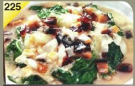
225 上汤菠菜 Chinese Spinach in Superior Stock $12.00