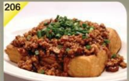
206 肉碎豆腐 Minced Meat Tofu $12.00