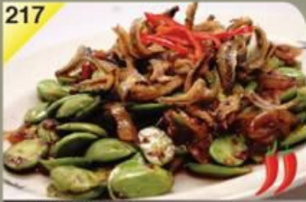
217 臭豆炒江鱼仔 Stir Fried Petai with Ikan Bilis $14.00