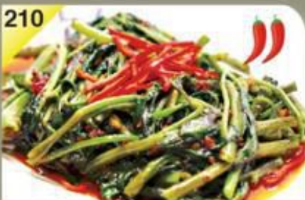
210 马来风光 Sambal Kang Kong $8.00