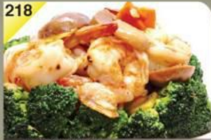
218 西兰花炒虾球 Stir Fried Broccoli with prawns $22.00