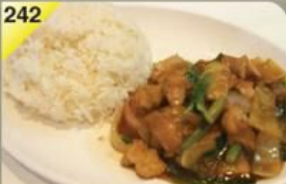
姜葱鸡肉饭 Ginger Spring Onion Chicken Rice