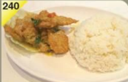
咸蛋排骨饭 Salted Egg Pork Rib Rice