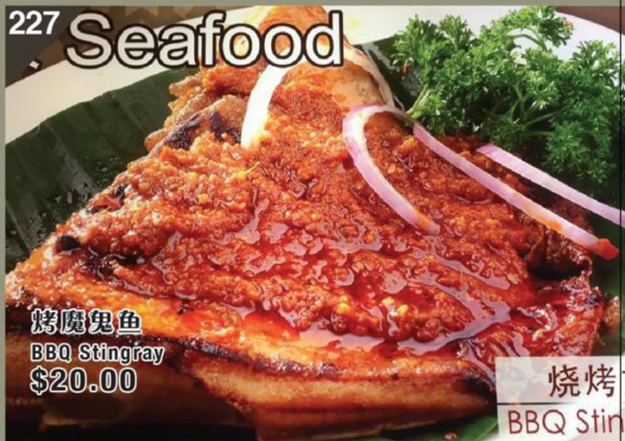
烤魔鬼鱼 BBQ Stingray $20.00