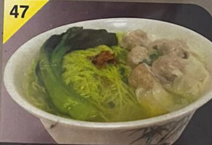
翡翠云吞面 (汤) Emerald Wonton Noodles (Soup) $5.00