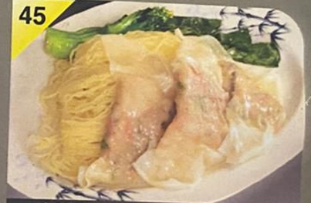
水饺面 (干) Dumpling Noodles (Dry) $5.50