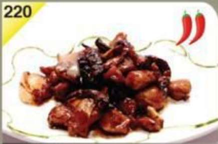
220 宫保鸡丁 Sze Chuan Style Fried Chicken $12.00