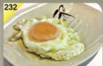
232 加荷包蛋 Fried Egg $0.80