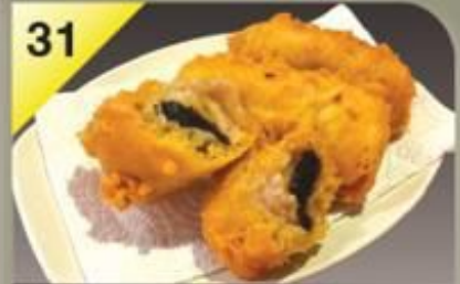
豆沙香蕉筒 Red Bean & Banana Roll