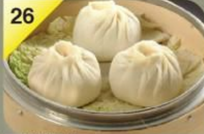
特制小笼包 Special Xiao Long Bao