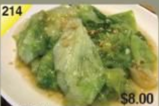
214 蒜香生菜 Garlic lettuce $8.00