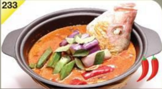
咖喱鱼头 Curry Fish Head