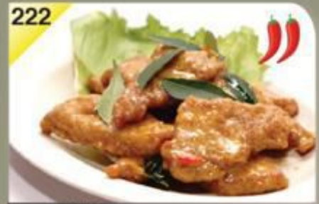
222 咸蛋排骨 Salted Egg Pork Rib $14.00