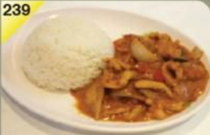
咖喱猪肉饭 Curry Pork Rice