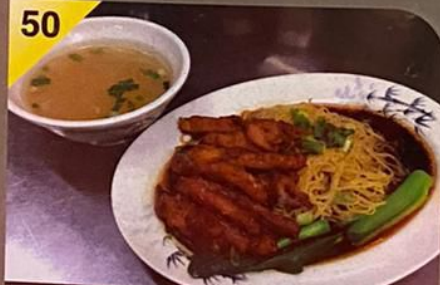
凤爪面 Chicken Feet Wonton Noodles (Dry) $6.00