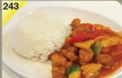
咕咾肉饭 Sweet & Sour Pork Rice