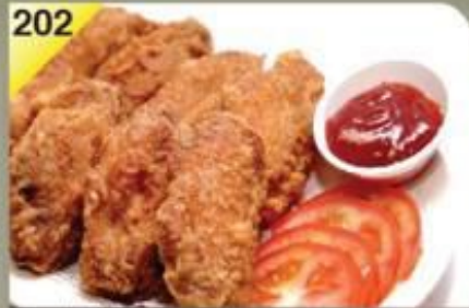
202 虾酱鸡 Prawn Paste Chicken $14.00