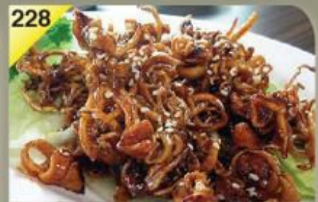
228 炸小章鱼 Fried Baby Squid $14.00