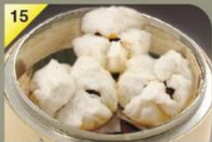
水晶包 Crystal Dumpling (3pcs) $4.60