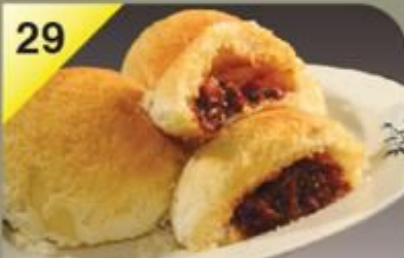
叉烧脆皮包 Crispy Char Siew Bao (3pcs)