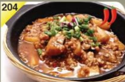
204 鱼香茄子 Braised Eggplant in casserole $12.00