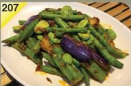
207 四天王 4 Heavenly King with Sambal $14.00