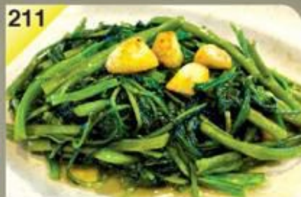
211 蒜蓉蔬菜 Stir Fried Kang Kong $8.00