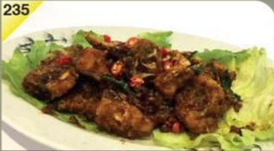
甘香鱼头 Kam Heong Fish Head