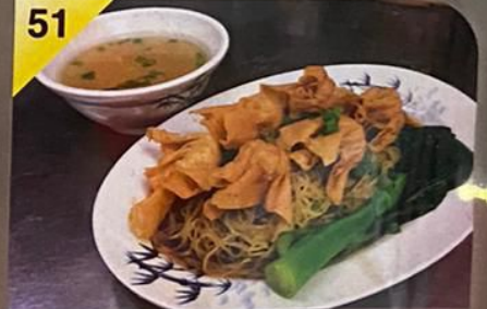
炸云吞面 Fried Wonton Noodles (Dry) $5.50