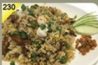
230 咸鱼扬州炒饭 YangZhou Fried Rice with Salted Fish $5.50