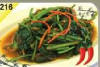
216 豉巴薯苗 Sambal Sweet Potato Leaf $8.00