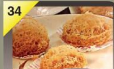
蜂巢芋角 Deep Fried Yam Pastry (3pcs)