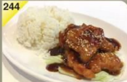
排骨王饭 Pork Rib King Rice