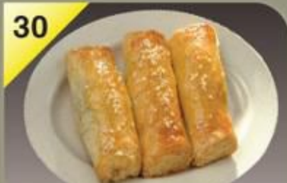
叉烧酥 Char Siew Shu