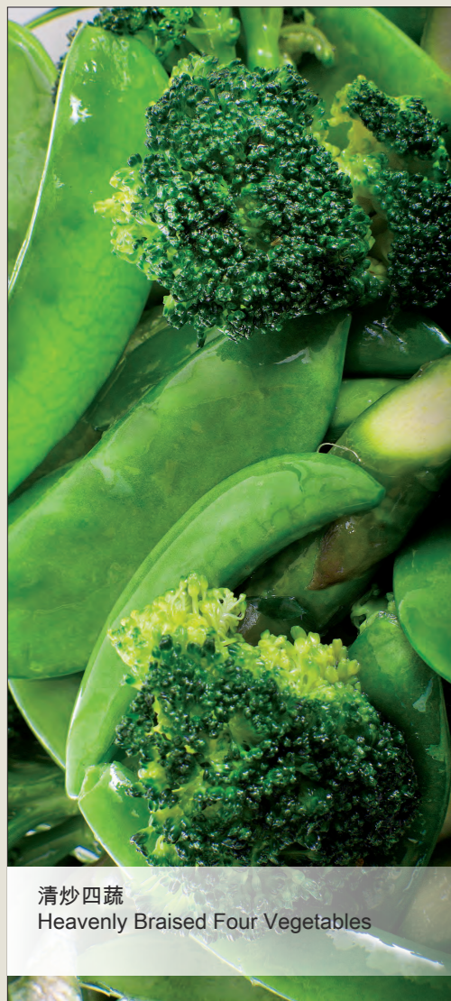
清炒四蔬 Heavenly Braised Four Vegetables