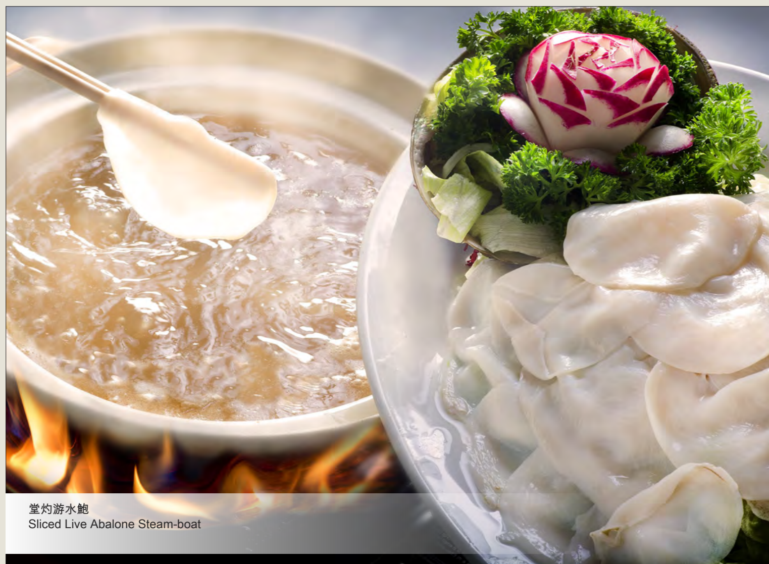
堂灼游水鮑 Sliced Live Abalone Steam-boat