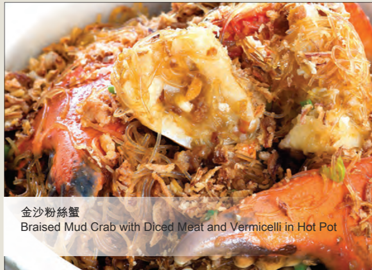
金沙粉絲蟹 Braised Mud Crab with Diced Meat and Vermicelli in Hot Pot