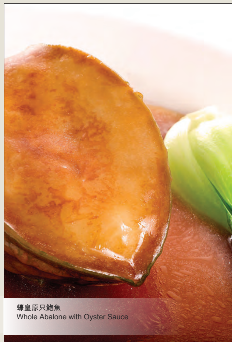
蠔皇原只鮑魚 Whole Abalone with Oyster Sauce