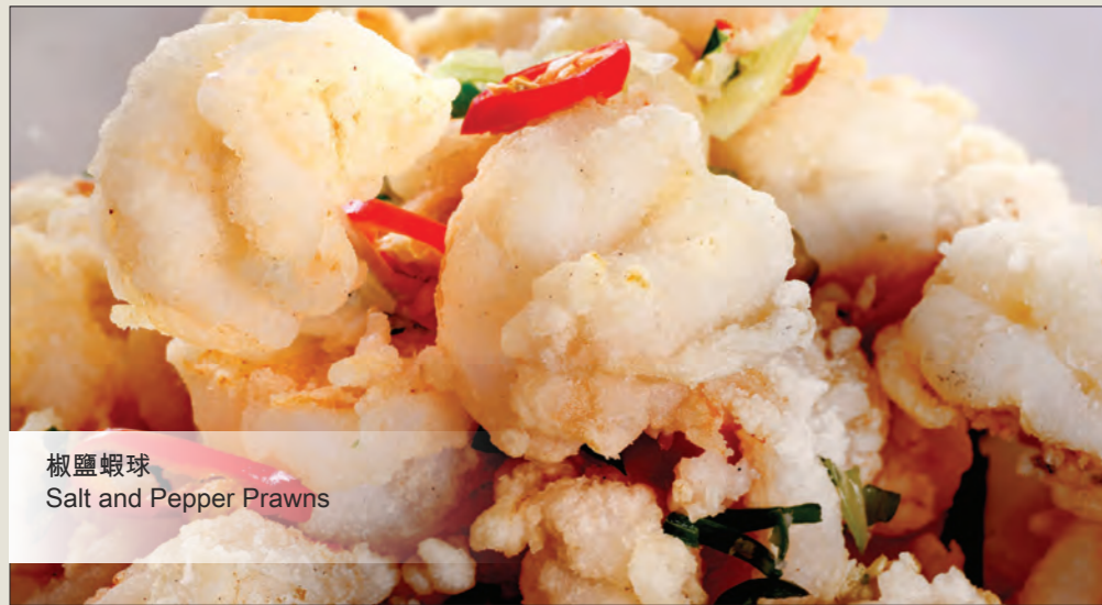
椒鹽蝦球 Salt and Pepper Prawns