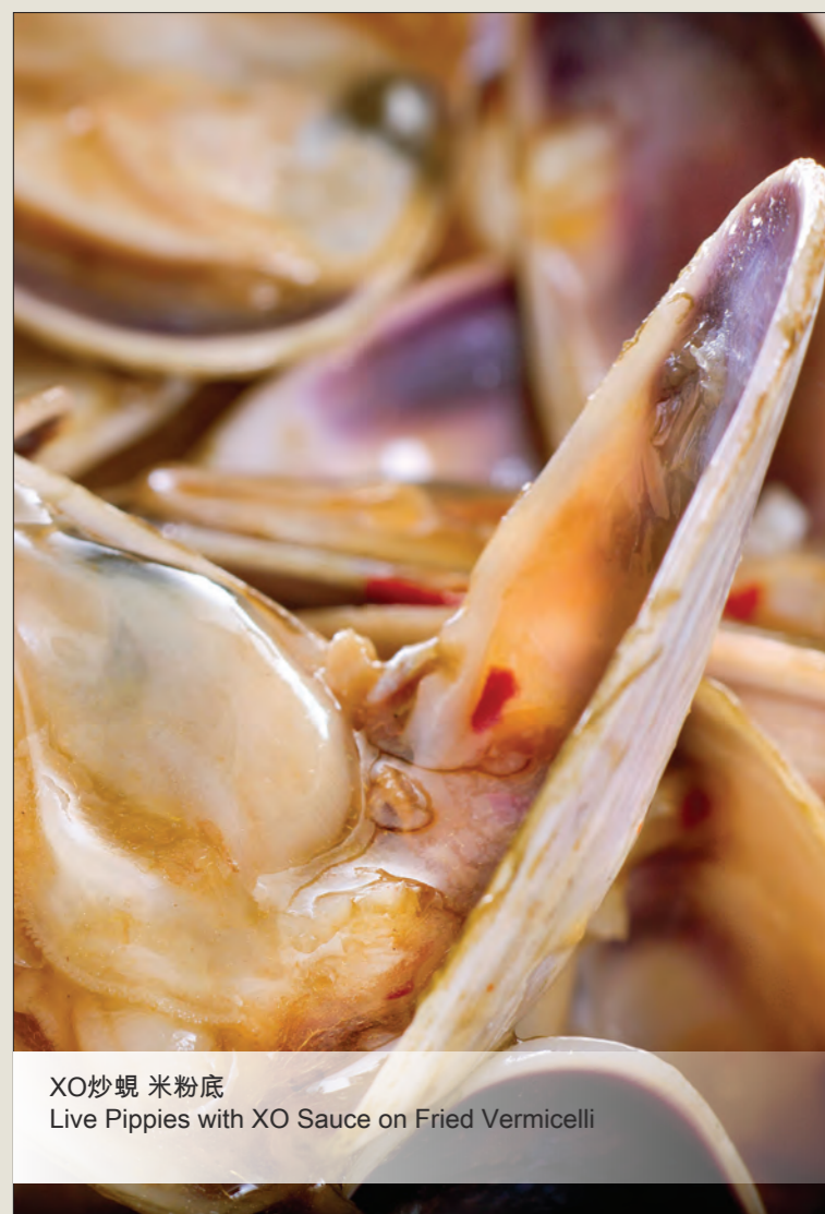
XO炒蜆 米粉底 Live Pippies with XO Sauce on Fried Vermicelli