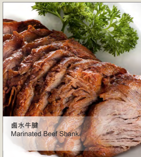
滷水牛腩 Marinated Beef Shank