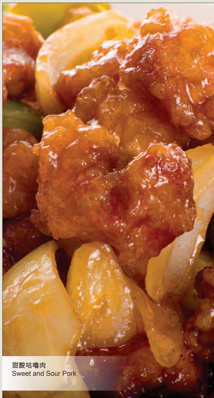
甜酸咕嚕肉 Sweet and Sour Pork