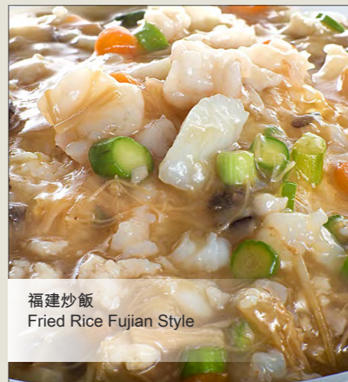
福建炒飯 Fried Rice Fujian Style