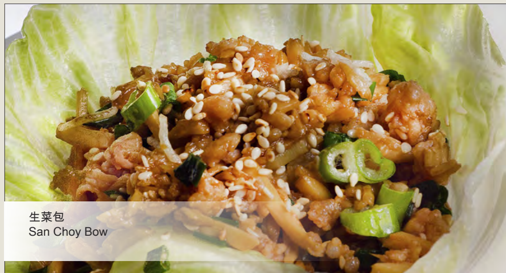
生菜包 San Choy Bow