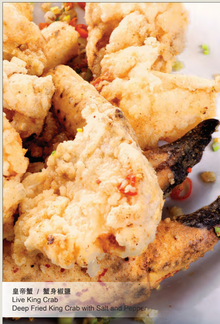
皇帝蟹 / 蟹身椒鹽 Live King Crab Deep Fried King Crab with Salt and Pepper