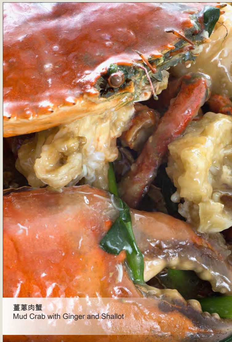
薑蔥肉蟹 Mud Crab with Ginger and Shallot