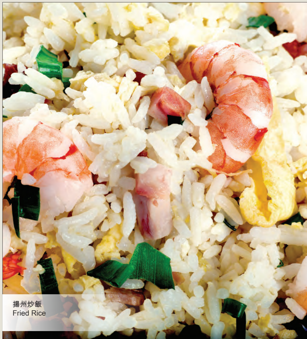
揚州炒飯 Fried Rice