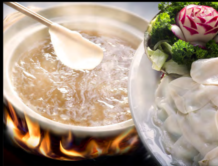
Live Abalone Thinly Sliced with Supreme Broth