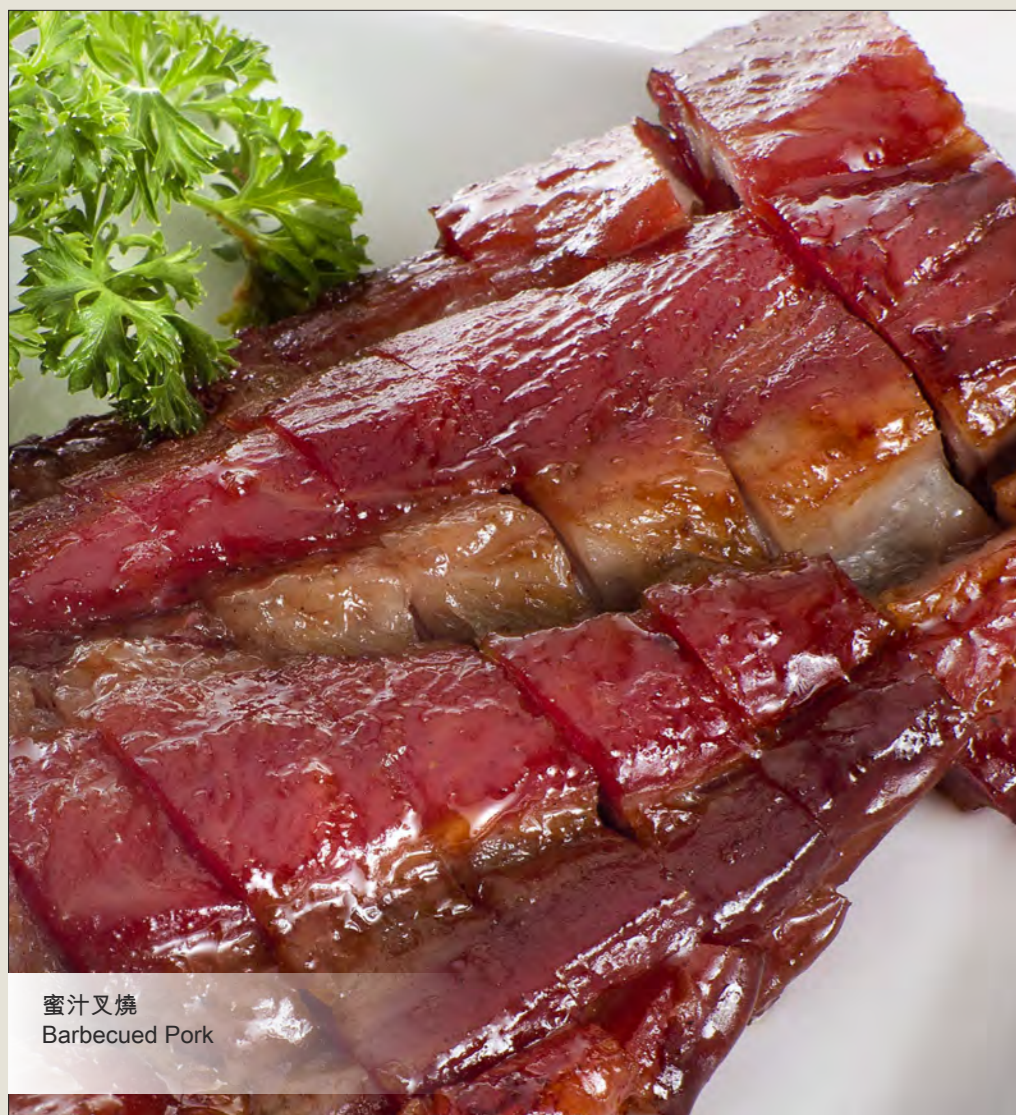
蜜汁叉燒 Barbecued Pork