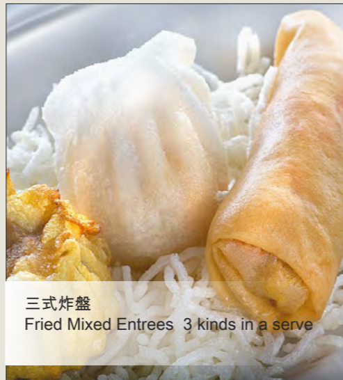
三式炸盤 Fried Mixed Entrees 3 kinds in a serve