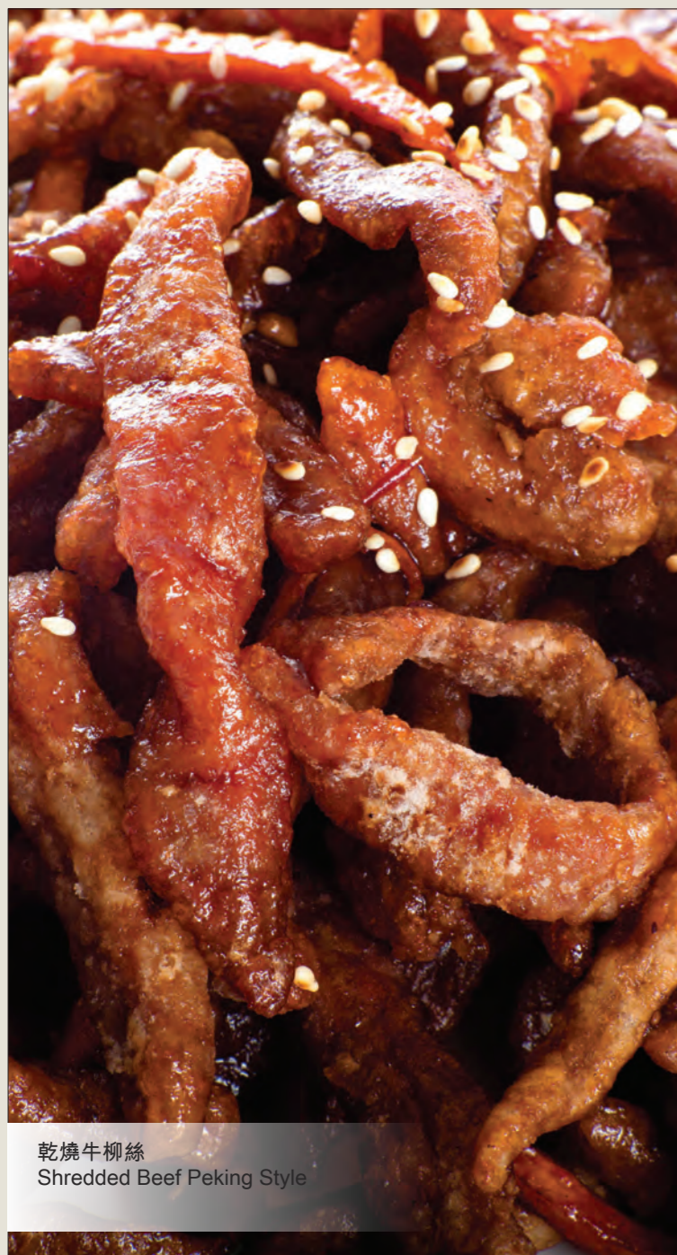
乾燒牛柳絲 Shredded Beef Peking Style