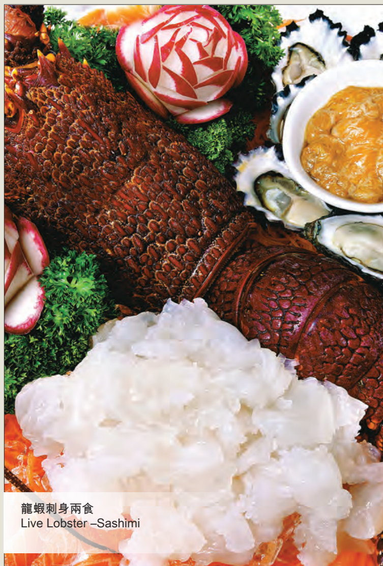
龍蝦刺身兩食 Live Lobster - Sashimi