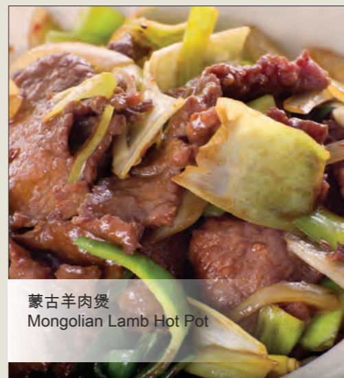
蒙古羊肉煲 Mongolian Lamb Hot Pot