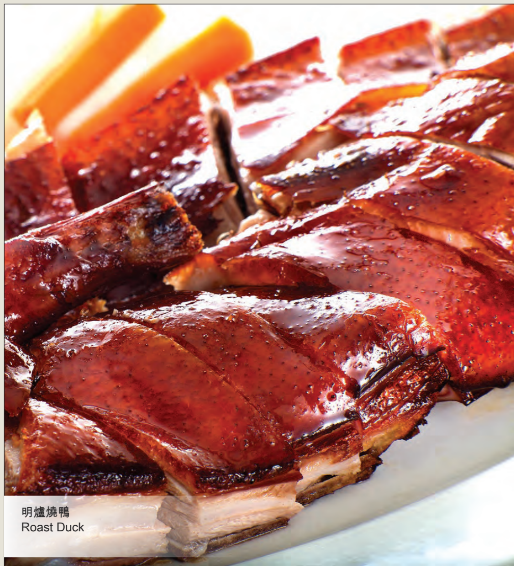
明爐燒鴨 Roast Duck