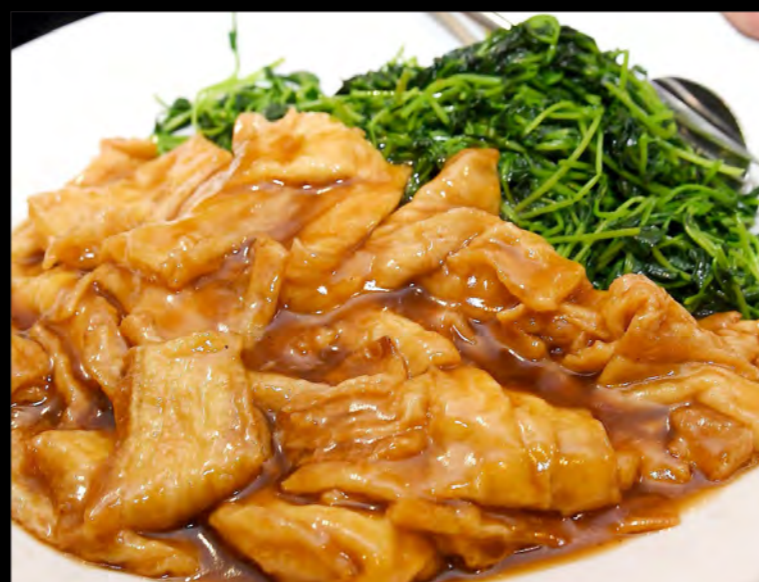
Yuba Bean Curd Sheets with Snow Pea Sprouts