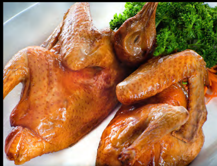
Deep Fried Pigeon