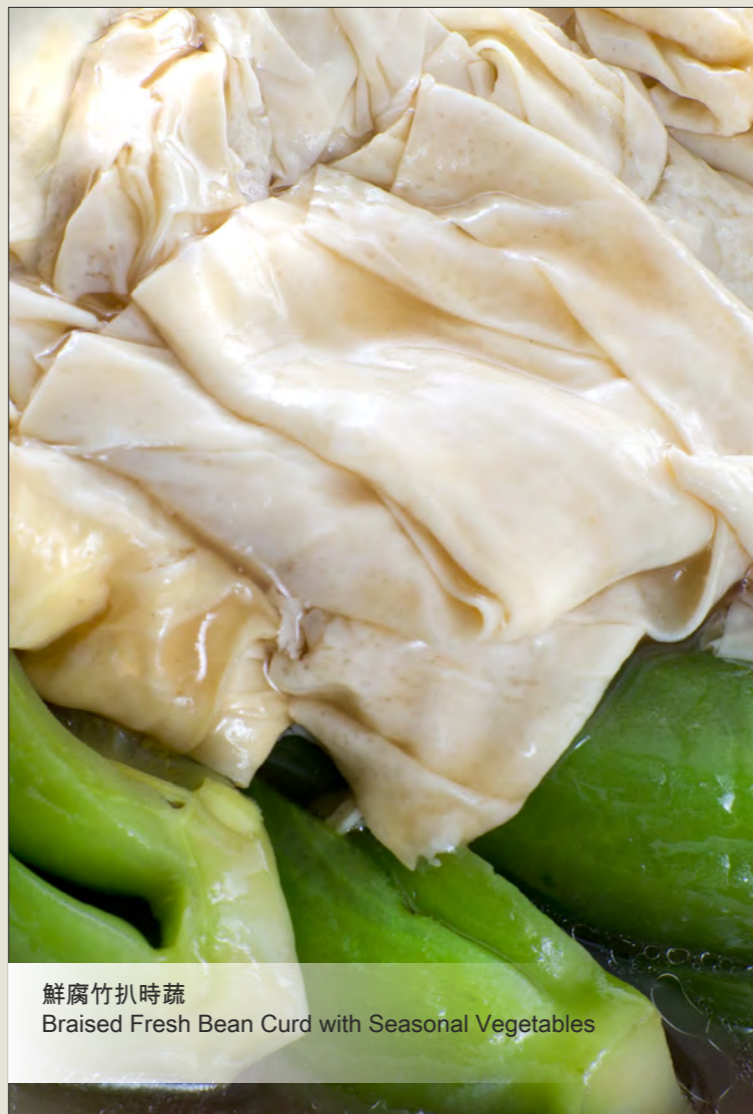
鮮腐竹扒時蔬 Braised Fresh Bean Curd with Seasonal Vegetables