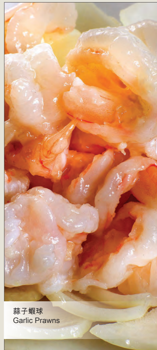
蒜子蝦球 Garlic Prawns