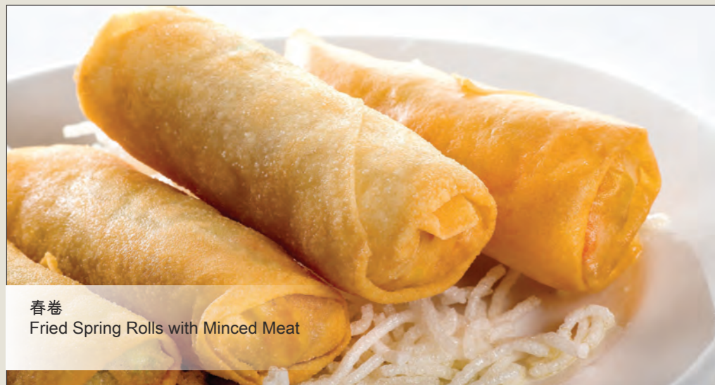
春卷 Fried Spring Rolls with Minced Meat