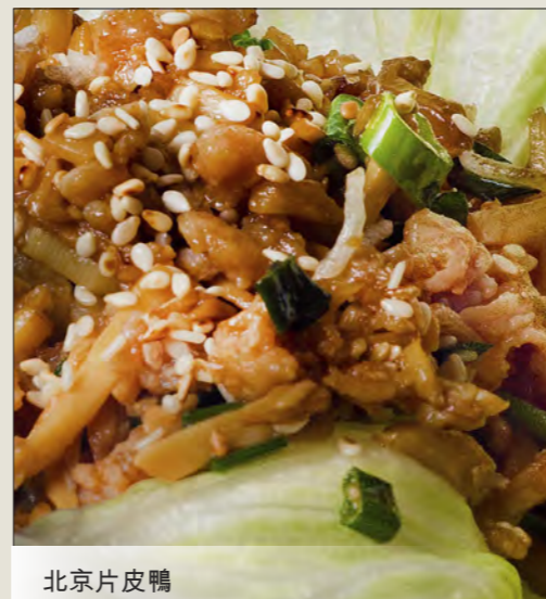
北京片皮鴨 Peking Duck / 2 Courses