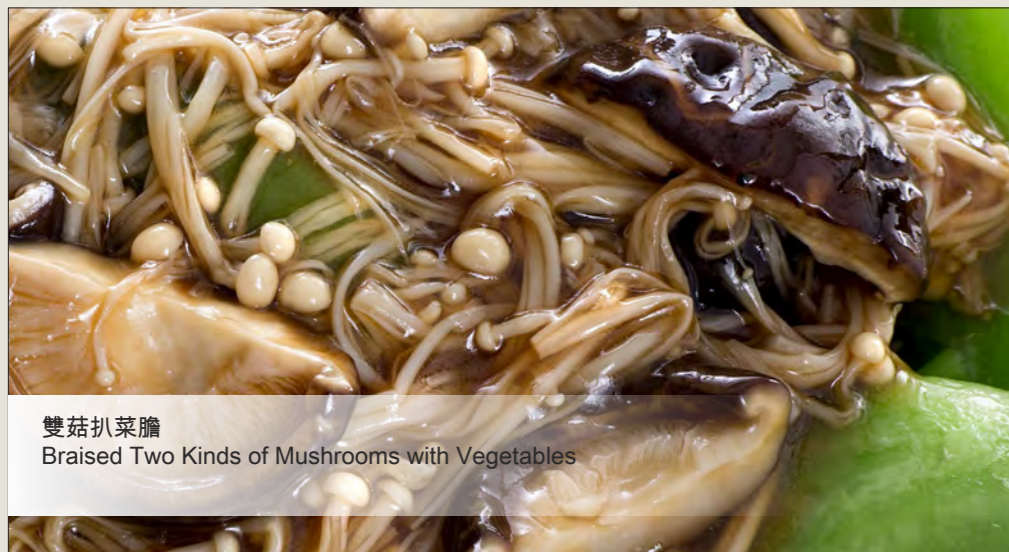
雙菇扒菜膽 Braised Two Kinds of Mushrooms with Vegetables