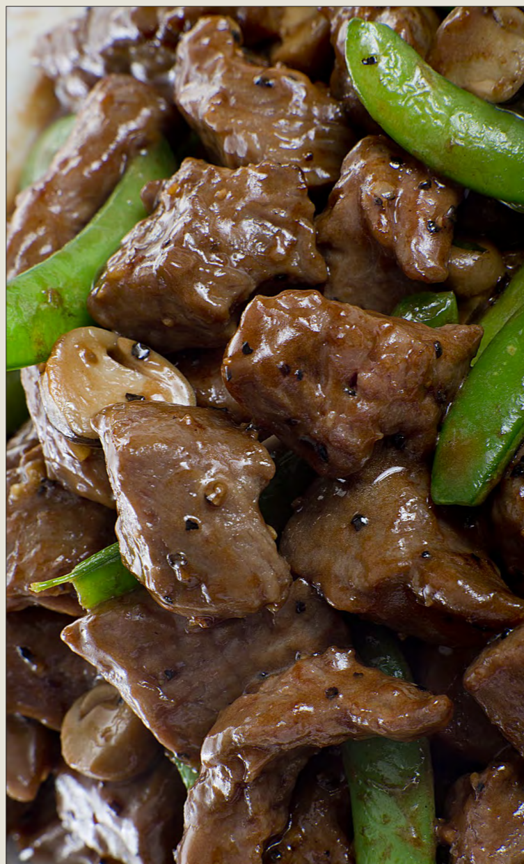
黑椒牛柳粒 Beef with Black Pepper