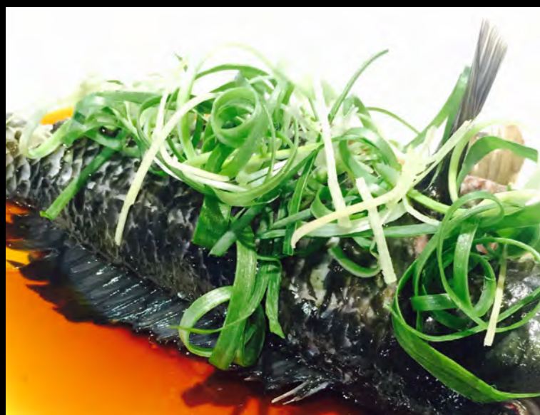
Steamed Parrot Fish with Ginger & Shallots