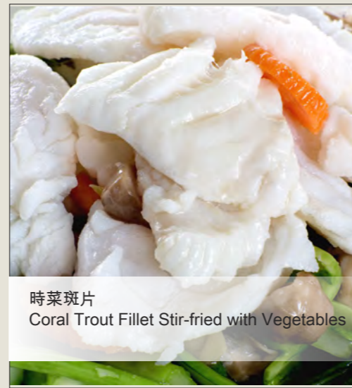
時菜斑片 Coral Trout Fillet Stir-fried with Vegetables