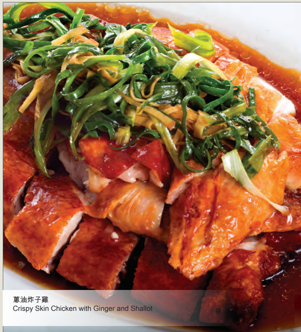
蔥油炸子雞 Crispy Skin Chicken with Ginger and Shallot