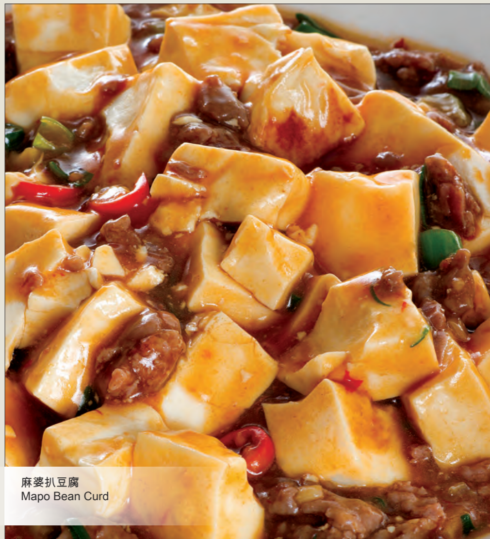
麻婆扒豆腐 Mapo Bean Curd