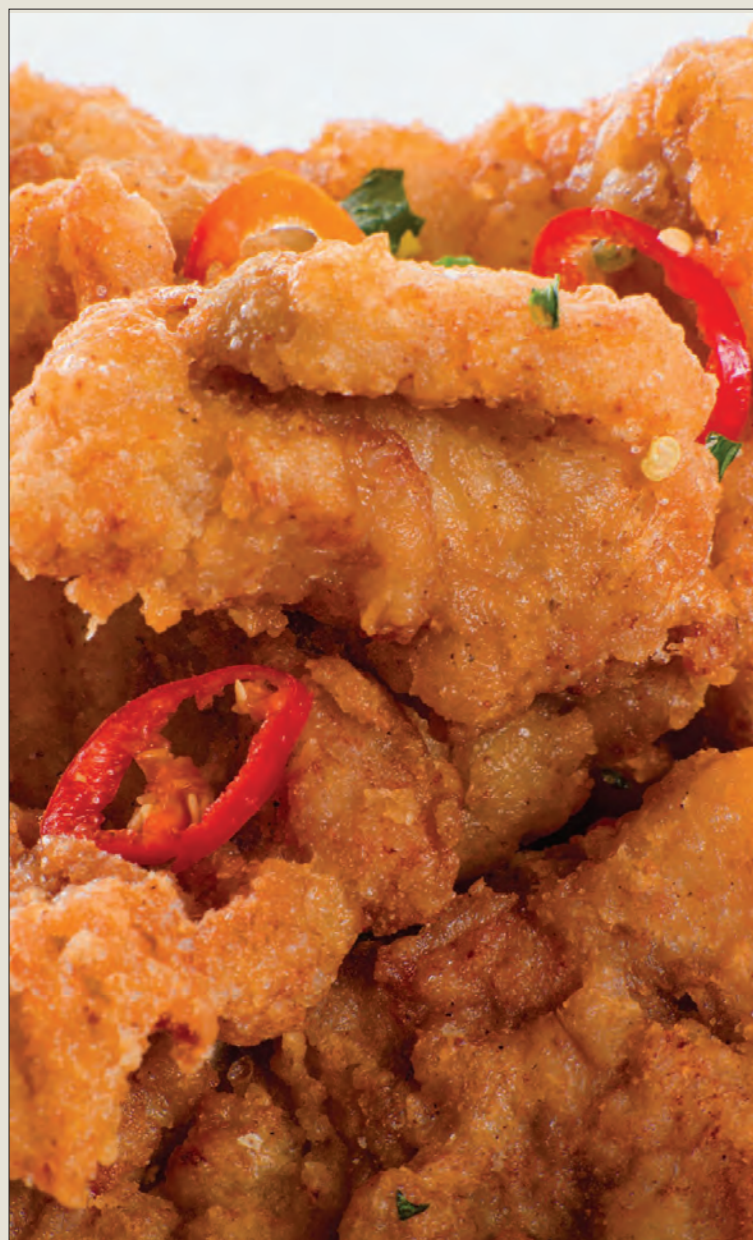
椒鹽排骨 Fried Pork Spare Ribs with Spiced Salt and Pepper