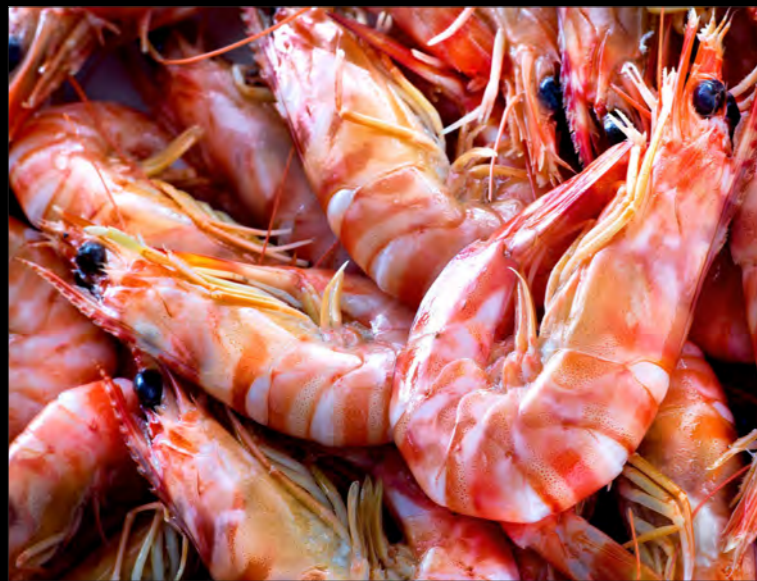
Steamed Live Prawns