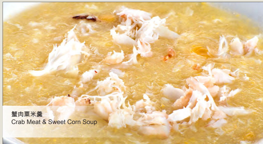
蟹肉粟米羹 Crab Meat & Sweet Corn Soup