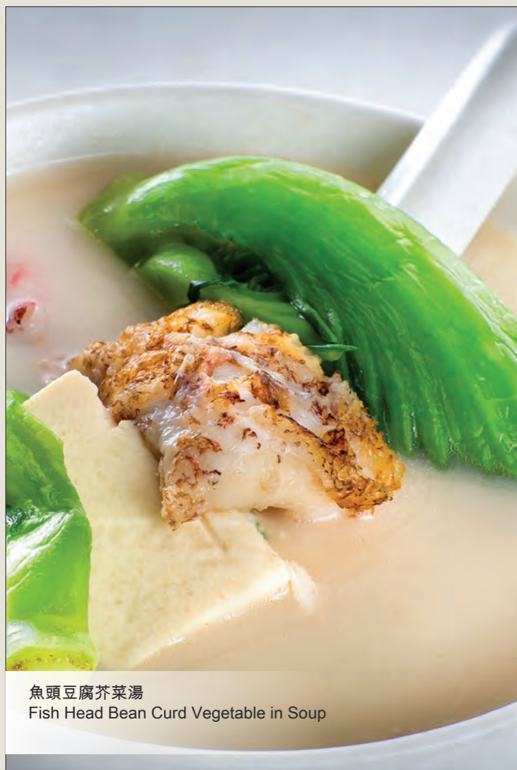
魚頭豆腐芥菜湯 Fish Head Bean Curd Vegetable in Soup