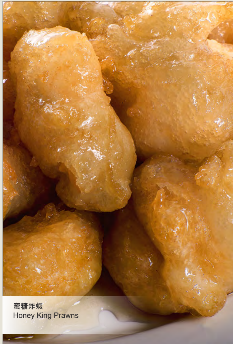
蜜糖炸蝦 Honey King Prawns