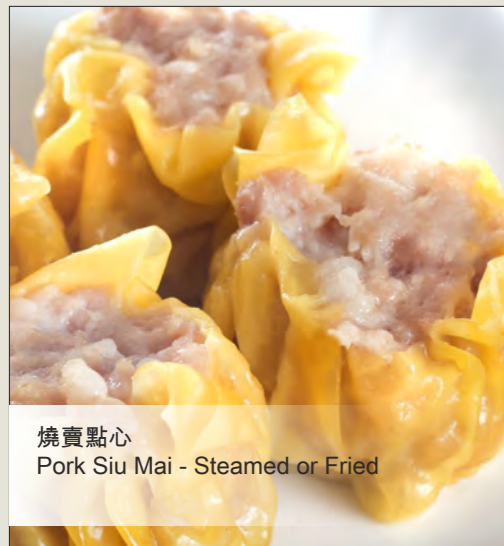
燒賣點心 Pork Siu Mai - Steamed or Fried