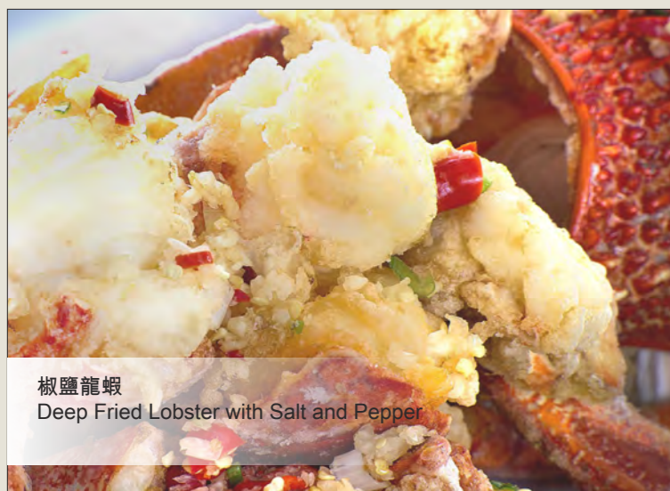
椒鹽龍蝦 Deep Fried Lobster with Salt and Pepper