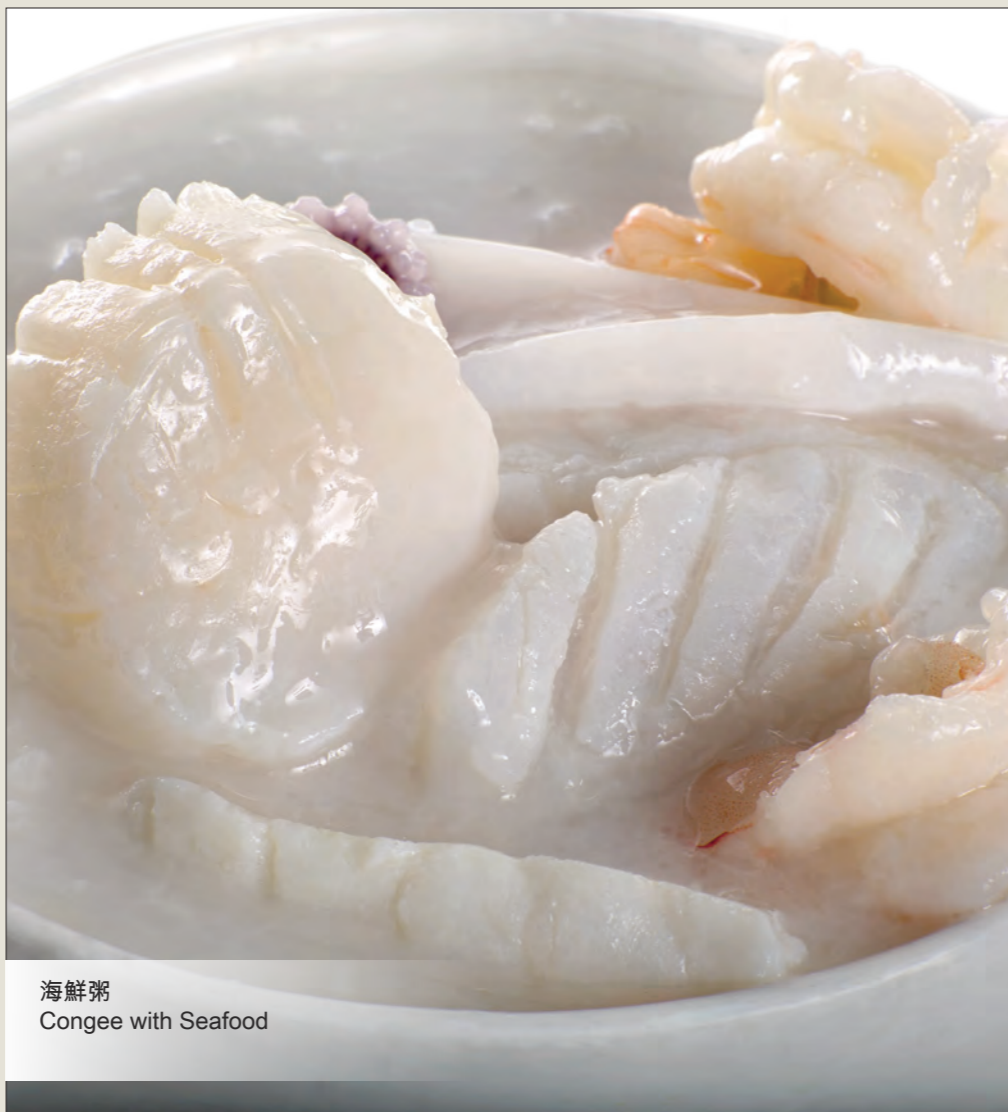
海鮮粥 Congee with Seafood