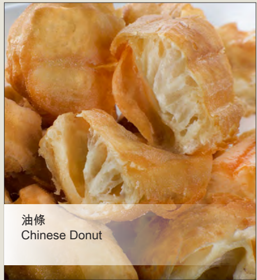
油條 Chinese Donut