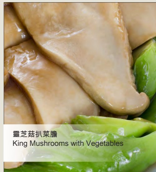
靈芝菇扒菜膽 King Mushrooms with Vegetables