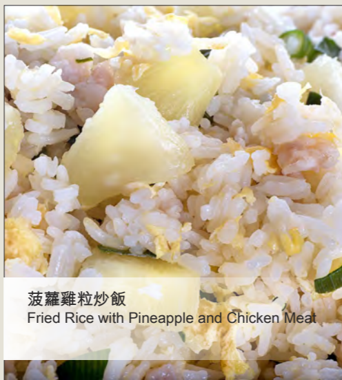
菠蘿雞粒炒飯 Fried Rice with Pineapple and Chicken Meat