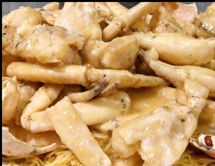
Wok Fried Snow Crab with Garlic Butter on Egg Noodles