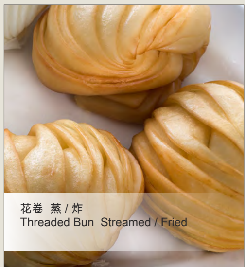
花卷 蒸 / 炸 Threaded Bun Steamed / Fried