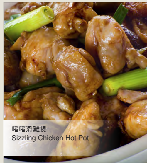
啫啫滑雞煲 Sizzling Chicken Hot Pot