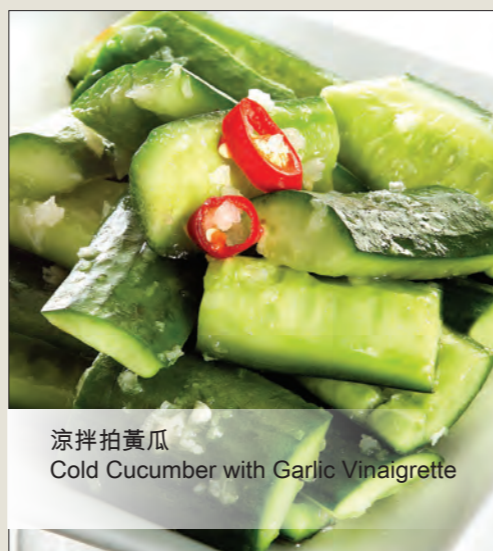
涼拌拍黃瓜 Cold Cucumber with Garlic Vinaigrette