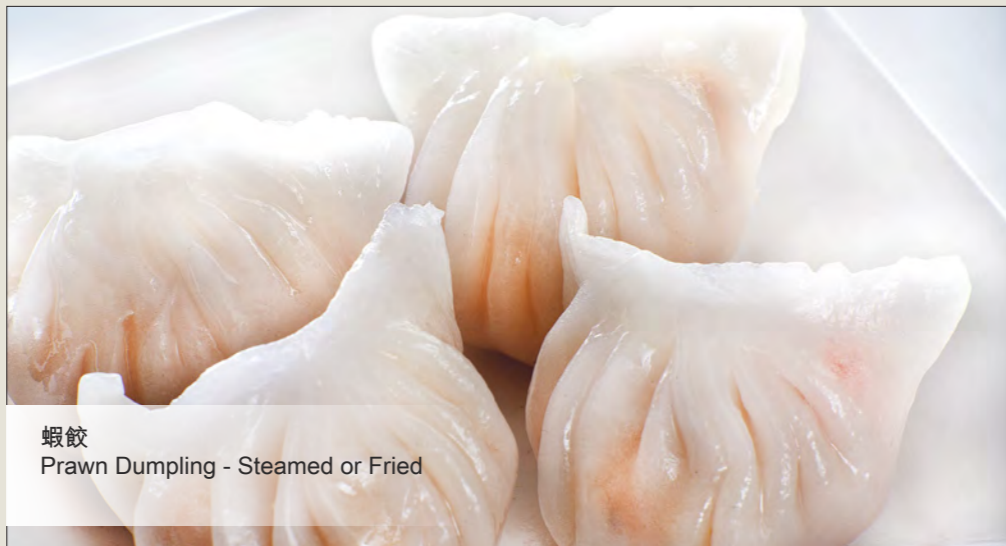
蝦餃 Prawn Dumpling - Steamed or Fried