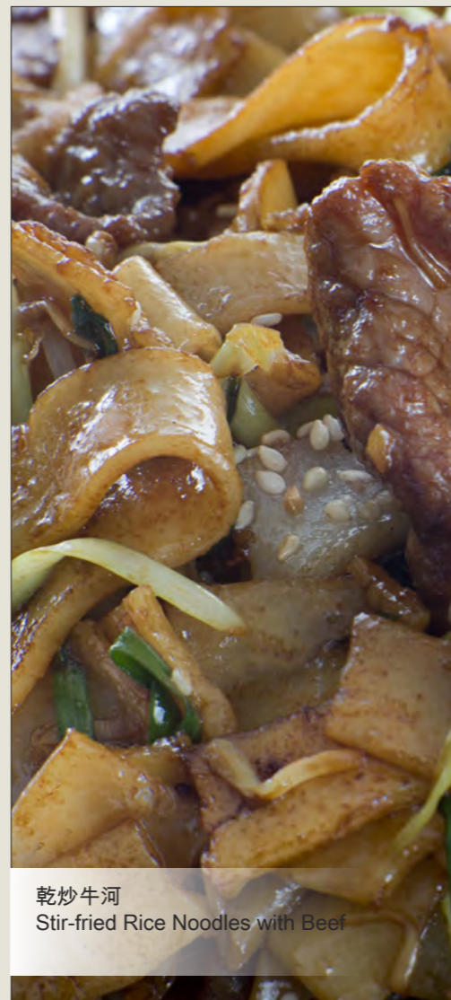
乾炒牛河 Stir-fried Rice Noodles with Beef