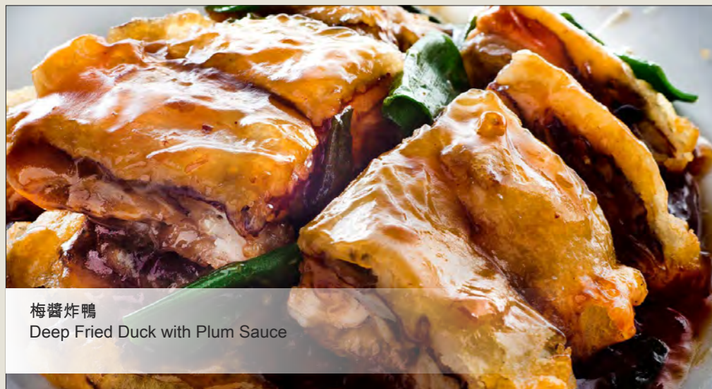
梅醬炸鴨 Deep Fried Duck with Plum Sauce