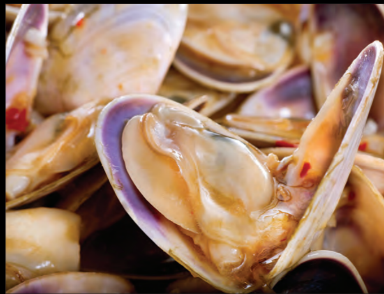
Pippies with XO Sauce on Fried Vermicelli