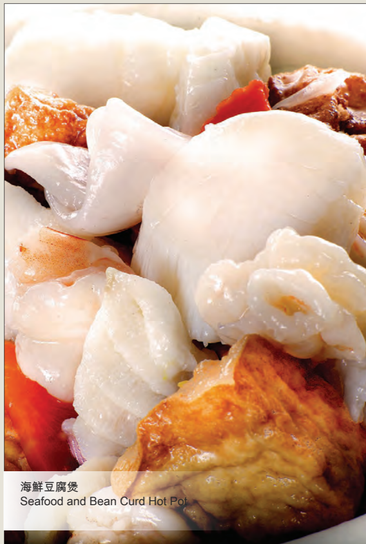
海鮮豆腐煲 Seafood and Bean Curd Hot Pot