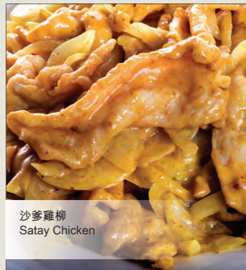
沙爹雞柳 Satay Chicken