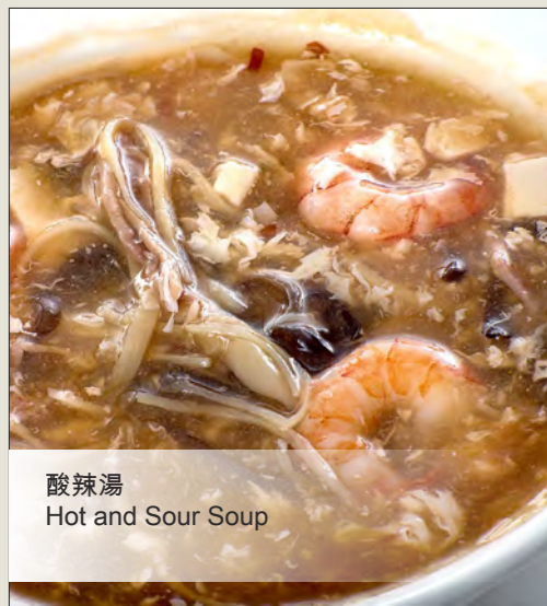
酸辣湯 Hot and Sour Soup