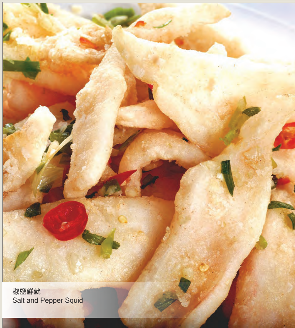
椒鹽鮮魷 Salt and Pepper Squid