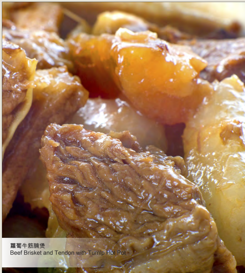
蘿蔔牛筋腩煲 Beef Brisket and Tendon with Turnip Hot Pot