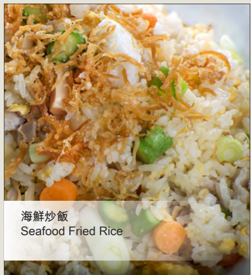
海鮮炒飯 Seafood Fried Rice