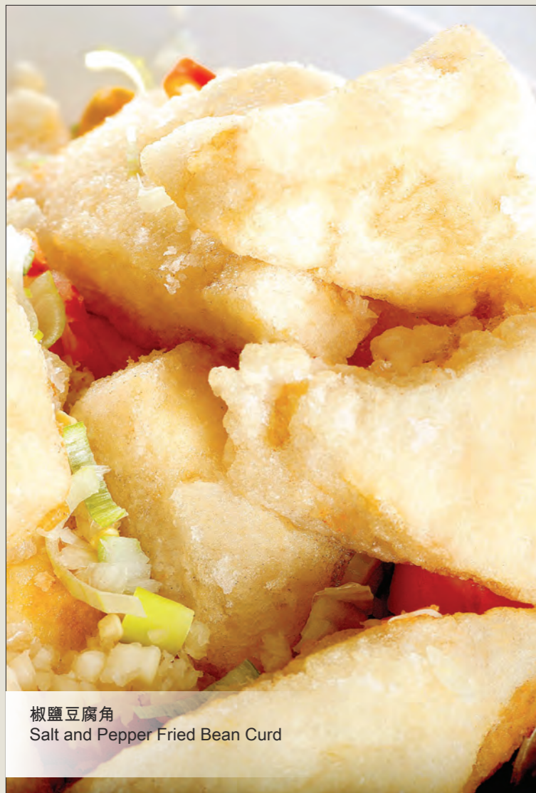
椒鹽豆腐角 Salt and Pepper Fried Bean Curd