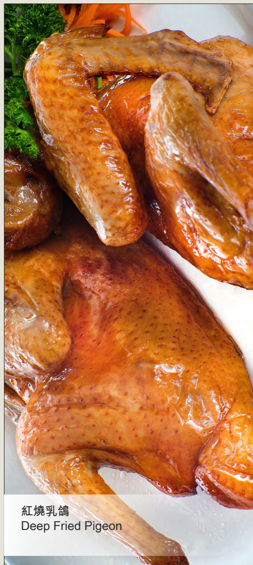
紅燒乳鴿 Deep Fried Pigeon