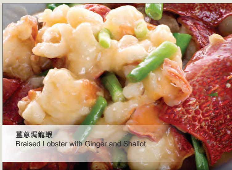
薑蔥焗龍蝦 Braised Lobster with Ginger and Shallot