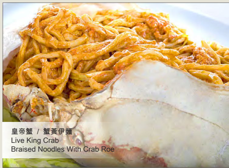
皇帝蟹 / 蟹黃伊麵 Live King Crab Braised Noodles With Crab Roe