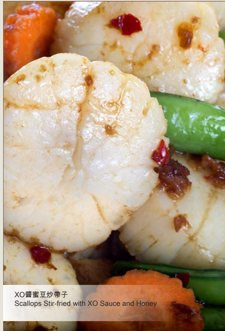
XO醬蜜豆炒帶子 Scallops Stir-fried with XO Sauce and Honey