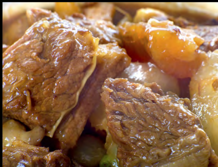
Braised Beef Brisket, Tendon and Turnip Hotpot