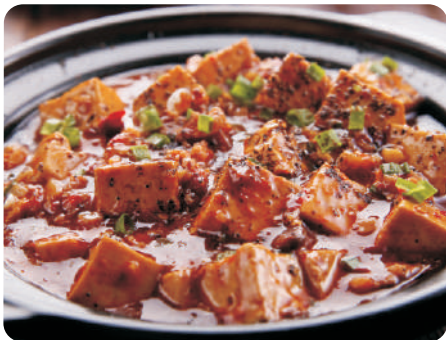
Mapo Tofu 麻婆豆腐 $ 8.8