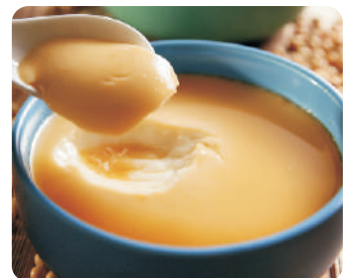
Soybean w Black Sugar 红糖豆花 $ 3.8