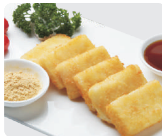
Fried Glutinous Rice Cake (with brown sugar) 红糖糍粑 $ 8.9