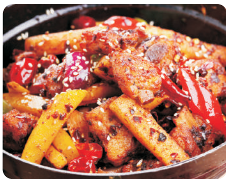
Griddle Pork Rib 馋妹想吃排骨 $ 16.8