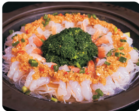
Shrimps w Mince Garlic 蒜蓉蝴蝶虾 $ 16.8