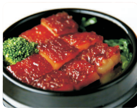
Pork w Soysauce 妈妈的红烧肉 $ 28.8