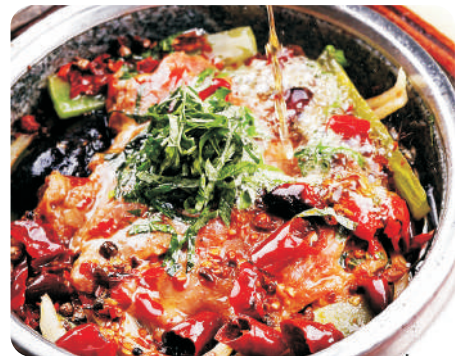
Stone Pot Beef 石烹牛肉 〰 $ 20.8