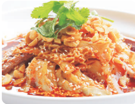
Sliced Beef and Ox Tongue in Chilli Sauce 夫妻肺片 ㉹ $ 12.8