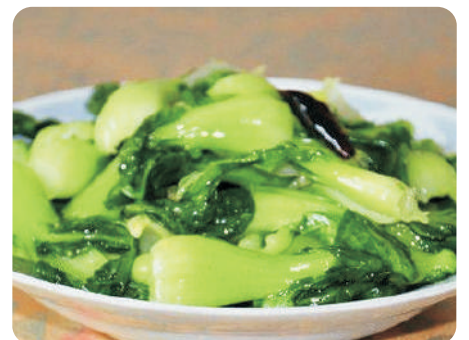
Stir-fried Fresh Veg 炒时蔬 $ 7.8