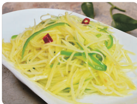
Shredded Potatoes w Green Pepper 青椒土豆丝 $ 6.8