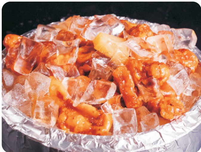
Sweet & Sour Pork 冰雪咕咾肉 $ 13.8