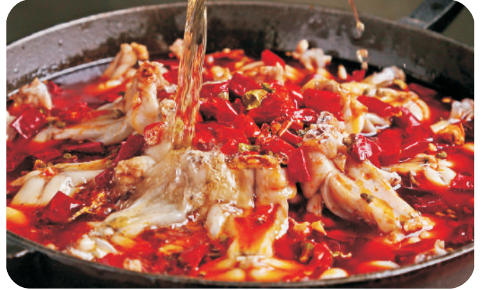
Szechuan Spicy Frog 麻辣美蛙 〰〰 小份(S) $ 24.8 大份 $ 42.8