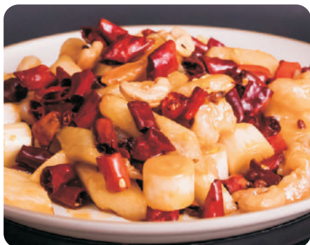
KongBao Shrimp 宫保虾仁 $ 22.8