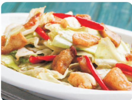
Cabbage 徒手撕包菜 $ 9.8