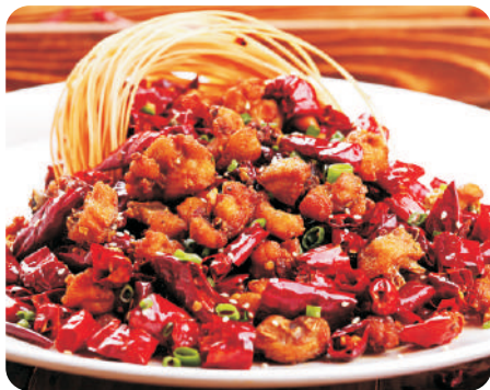
Spicy Szechuan Crispy Chicken 馋院辣子鸡 〰 $ 18.8