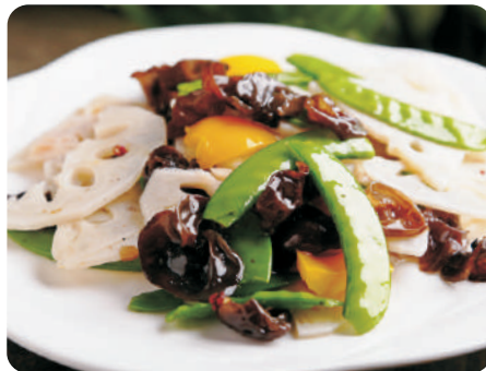
Lotus Fungus w Bean 荷塘小炒 $ 9.8