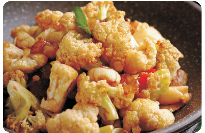
Dry Pot Cauliflower 香锅花菜 $ 11.8