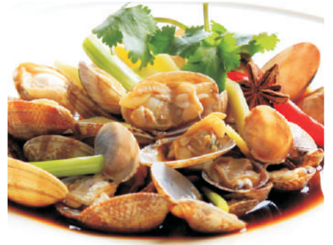
Lala w Special Sauce 捞汁花甲 ㉹ $ 12.8