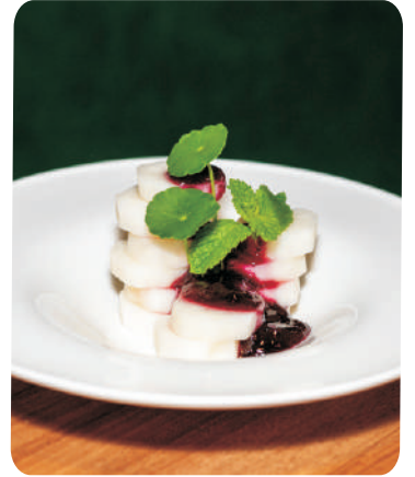
Blueberries w Yam 蓝莓山药 $ 7.8