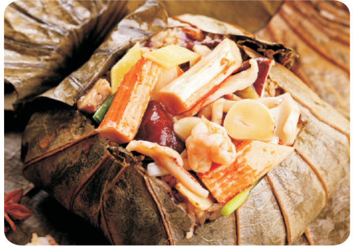
Fried Rice w Seafood Wrapped by Lotus Leaf 荷叶海鲜饭 $ 8.8