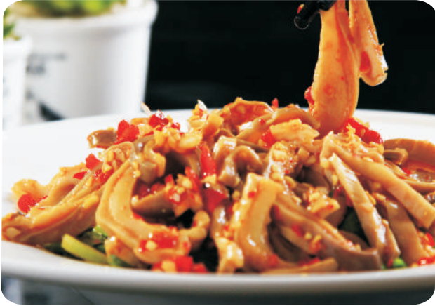
Sliced Pig Tripes w Thai Sauce 泰汁肚丝 ㉹ $ 9.8