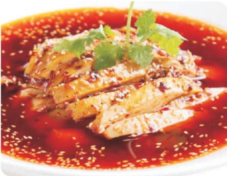
Poached Chicken in Szechuan Style 祖传口水鸡 ㉹ $ 11.8