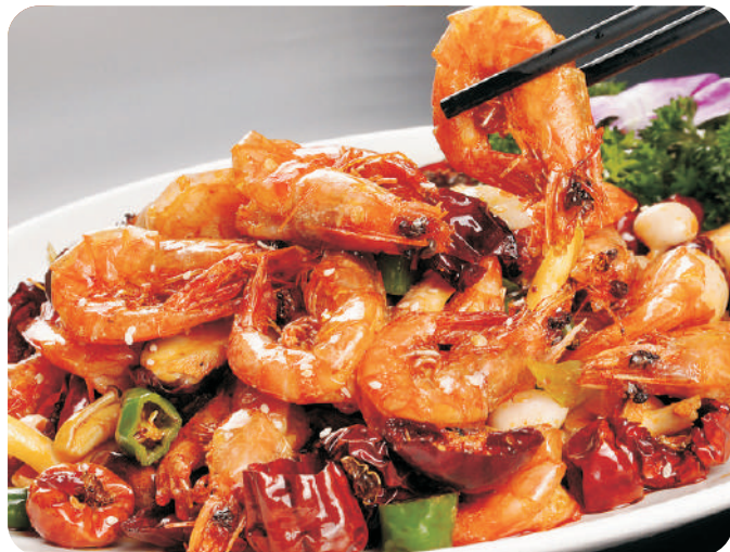
Spicy Prawns 香辣虾 $ 22.8