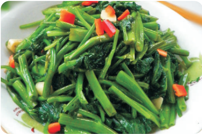
Stir-fried Kangkong 炒空心菜 $ 8.8