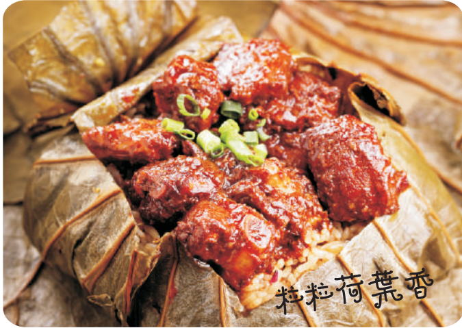
Fried Rice w Pork Rib Wrapped by Lotus Leaf 荷叶排骨饭 $ 7.8