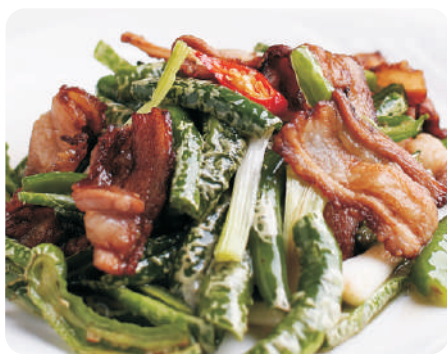
Chillies Stir Fried w Pork 馋院小炒肉 $ 11.8