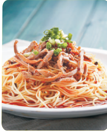
Cold Noodles w Chicken Shreds 鸡丝凉面 ㉹ $ 8.8