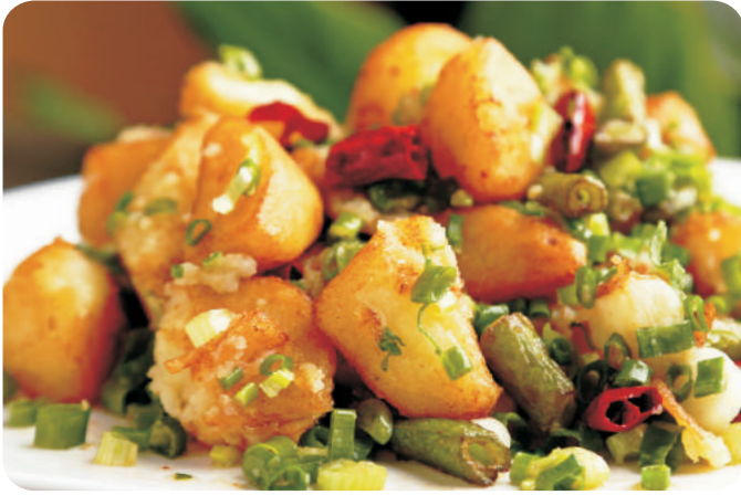
Yam w French Bean 洋芋四季豆 $ 7.8