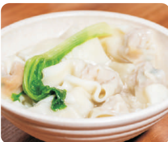
Wonton Soup 鸡汤抄手 $ 4.9