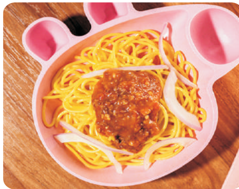
Spaghetti 儿童肉酱面 $ 6.8