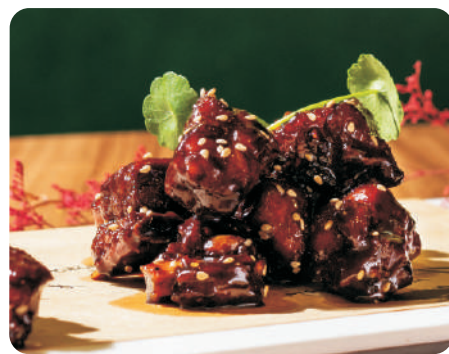
Sweet & Sour Pork Rib 糖小排 $ 14.9