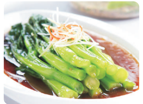
Poached Veg 白灼菜心 $ 8.8