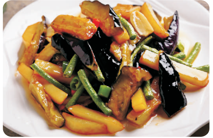
Egg Plant Bean & Potato 馋院三宝 $ 8.8