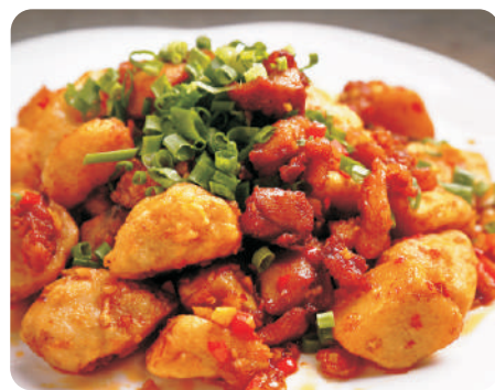
Yam w Chicken 馋院芋儿鸡 $ 15.8