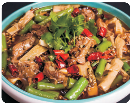
Green Pepper Duck 青椒麻鸭 $ 22.8