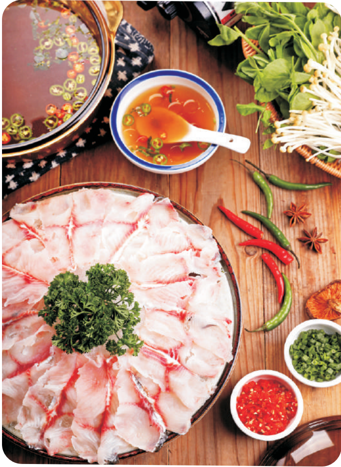
Sliced Fish w Szechuan Sour Soup 馋院酸汤鱼片 〰 $ 32.8