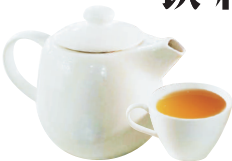
【小吊梨汤·具有生津、润燥等功效】 Snow Fungus Pear Sweet Soup 小吊梨汤 ..... $ 7.8