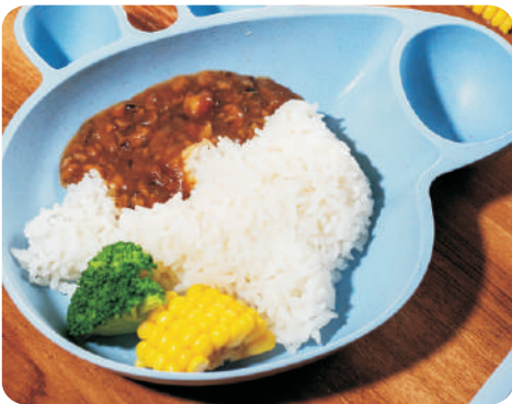
Braised Pork Rice 儿童卤肉饭 $ 4.8