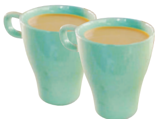
【馋院自制，不含任何添加剂】 Milk Tea 馋院奶茶 ..... $ 2.8