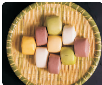
Rainbow Bun 彩虹馒头 $ 4.9