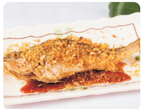
Sweet & Sour Yellow Croaker 酸酸甜甜黄花鱼 $ 13.8