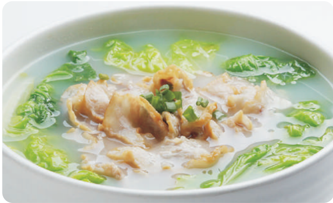
Crispy Meat and Veg Soup 青菜酥肉汤 $ 7.8