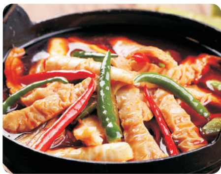
Griddle Chitterlings 鲜辣肥肠馋锅 $ 22.8