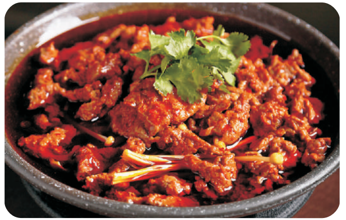
Griddle Beef 麻辣牛肉馋锅 〰 $ 25.8