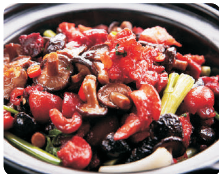
Mushroom w Pork 金钱菇闷拐肉 $ 16.8