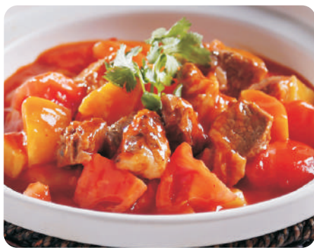
Beef and Tomatoes 蕃茄大战牛腩 $ 19.8