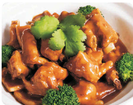
Chicken Feet&Pork Rib 龙凤排骨爪 $ 16.8