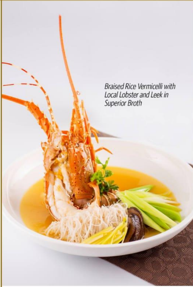
Braised Rice Vermicelli with Local Lobster and Leek in Superior Broth