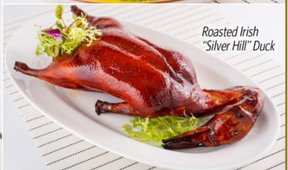
Roasted Irish "Silver Hill" Duck