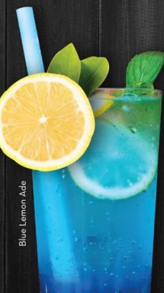
Blue Lemon Ade