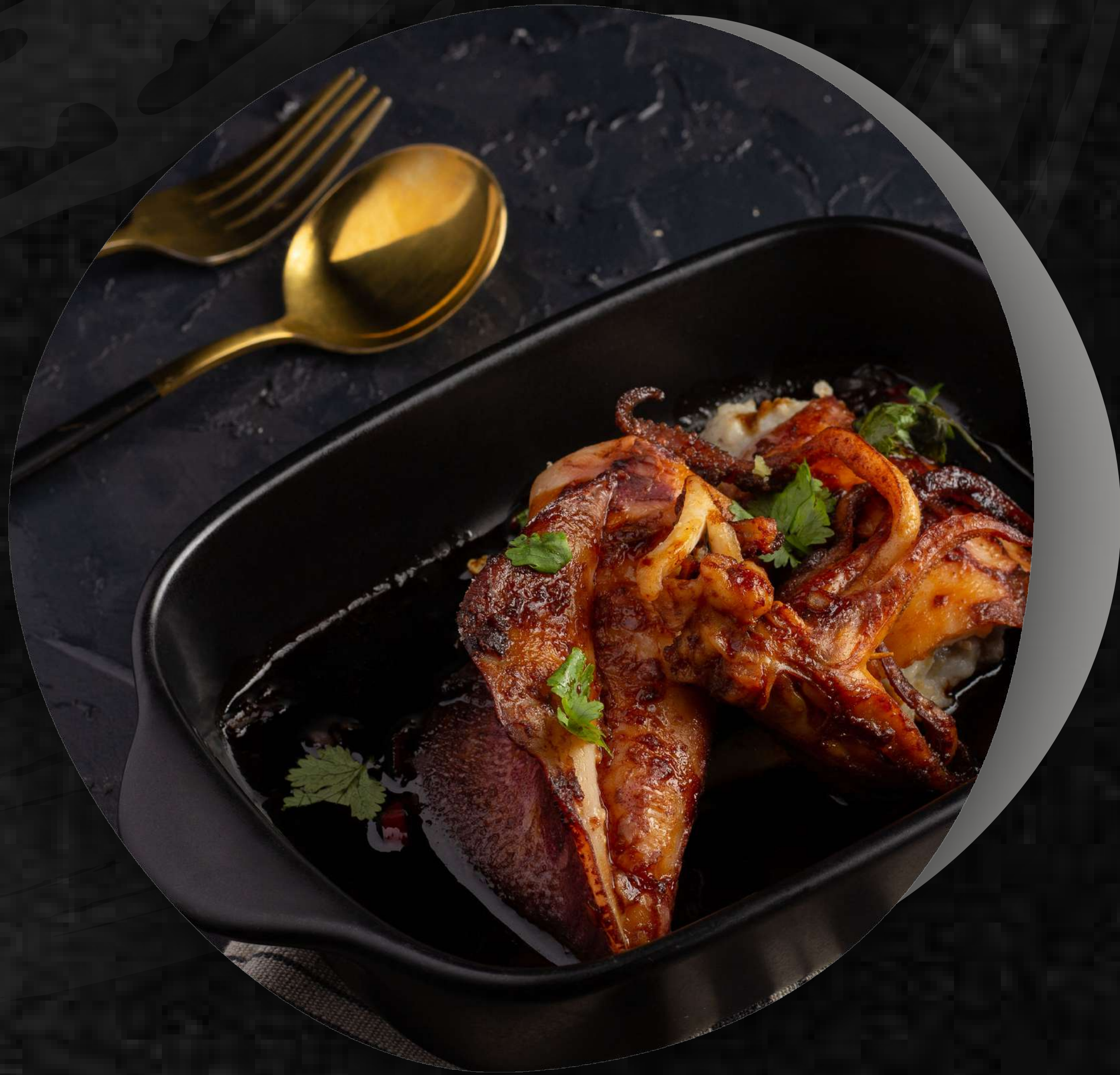
Grilled Stuffed Squid