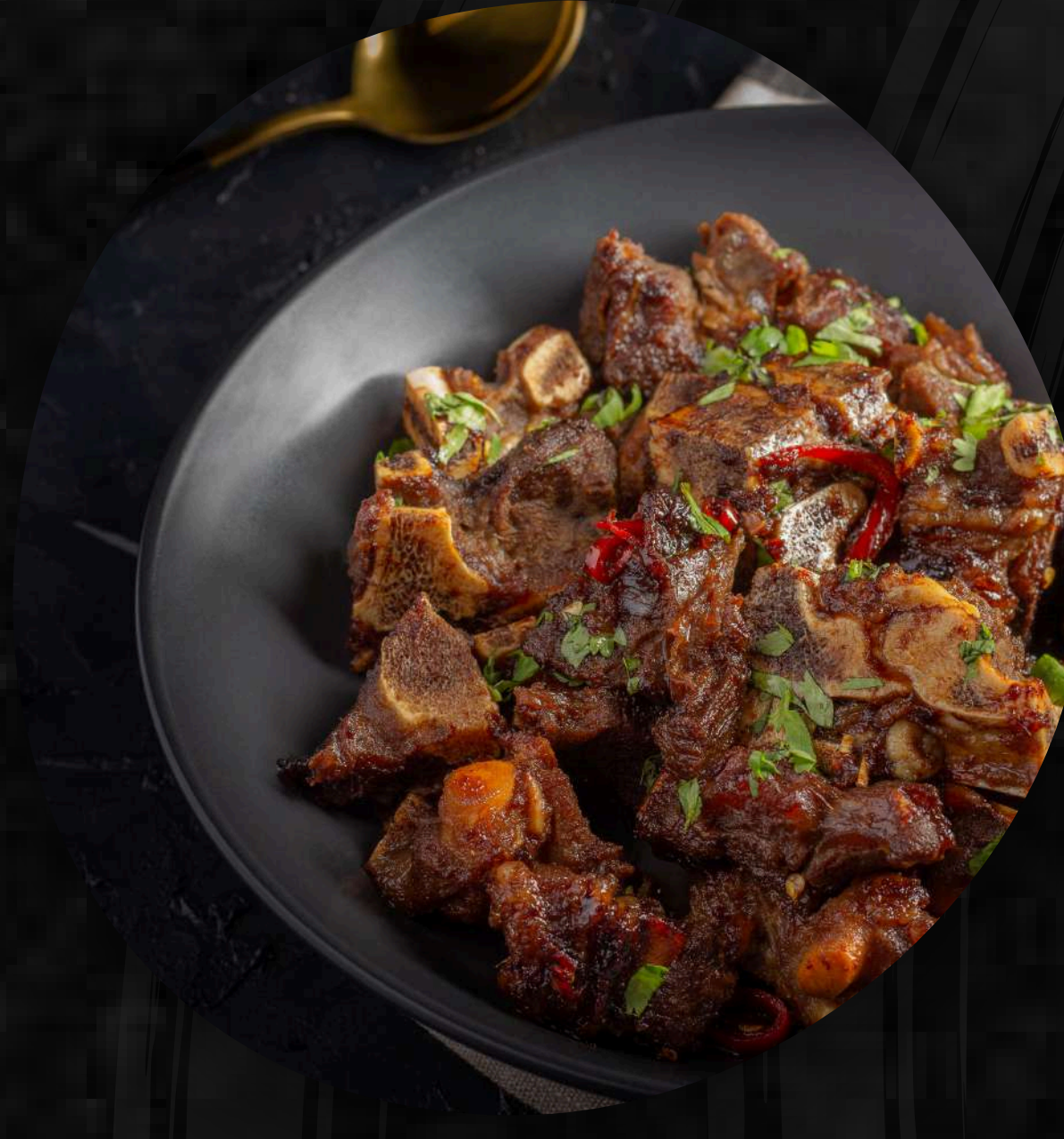
Sticky Glazed Ribs