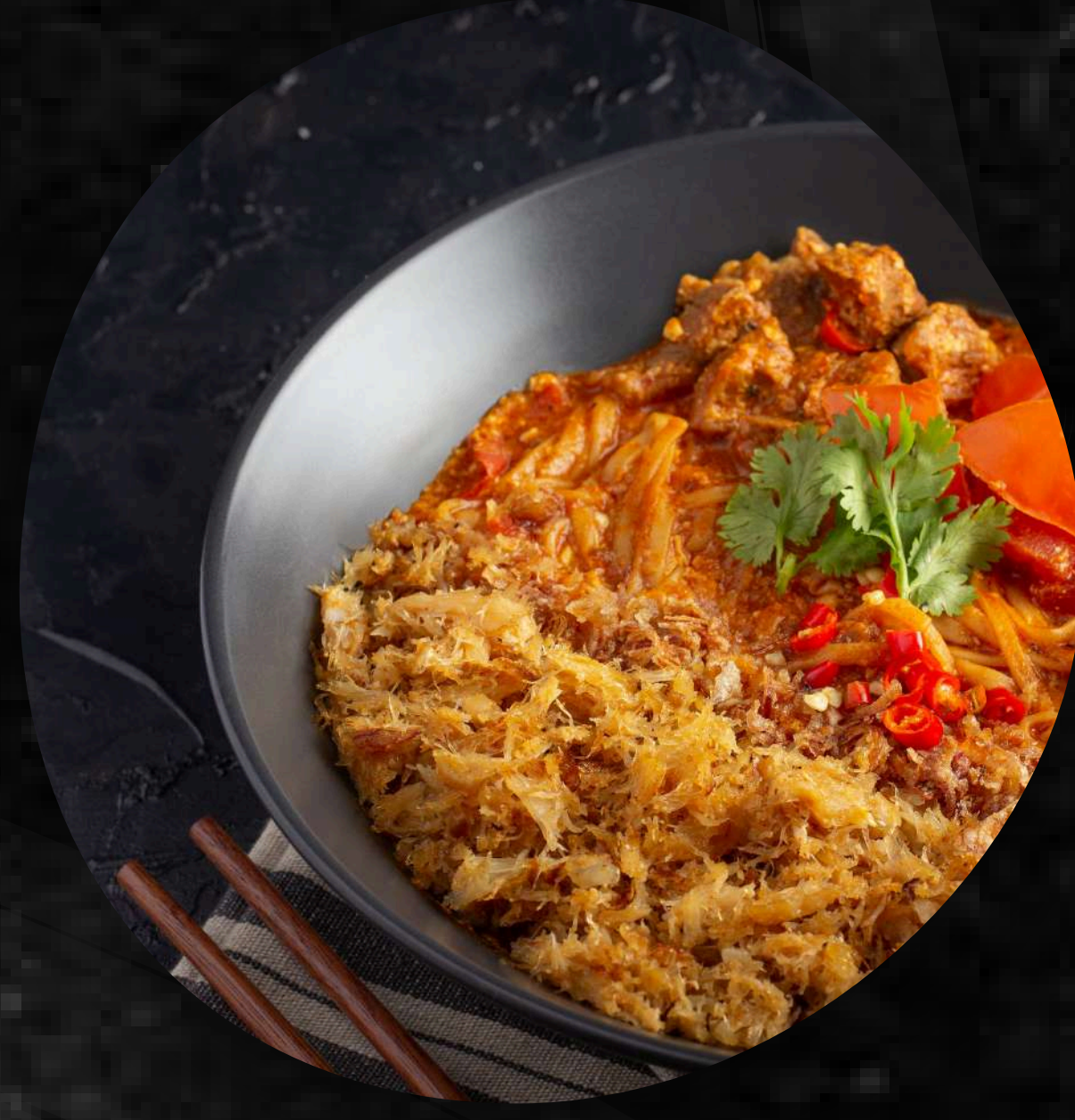
Beef Tendon Ramen with Crab Floss