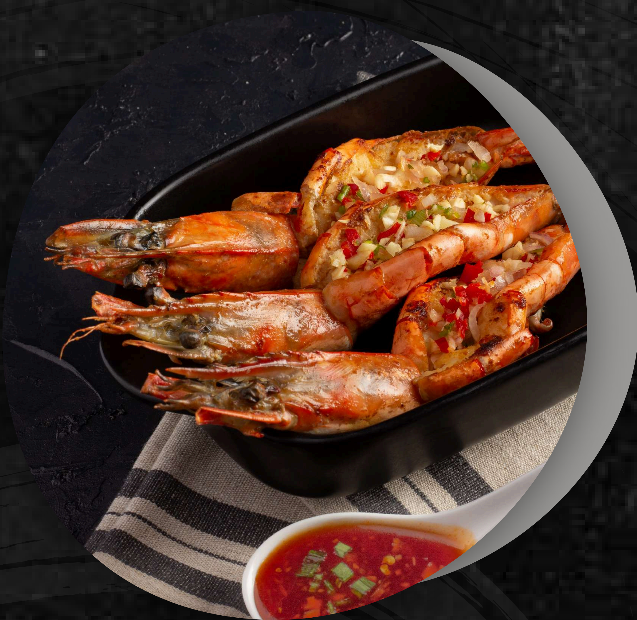
King Prawns Glazed in Honey-Chili