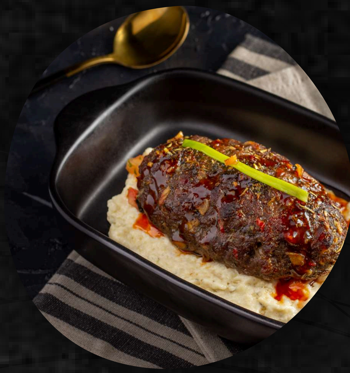
Meatloaf (Impossible / Beef)