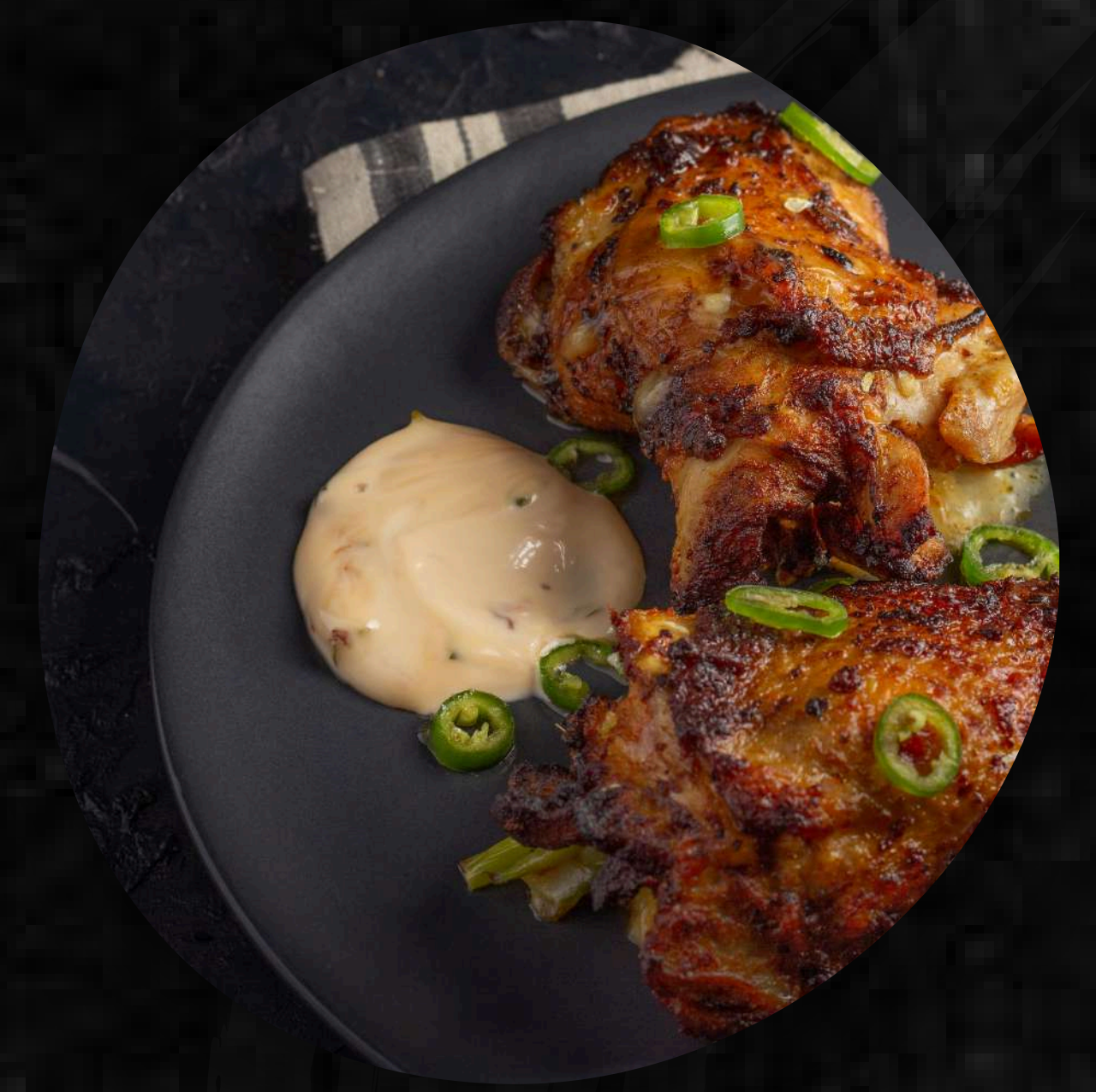
Tandoori Cordon Bleu