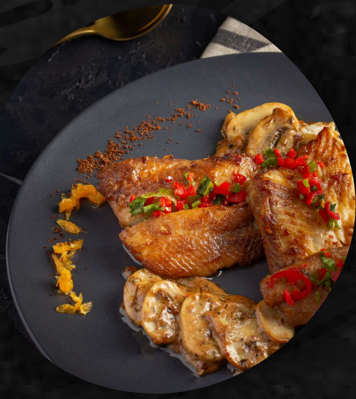
Coffee Orange Halibut