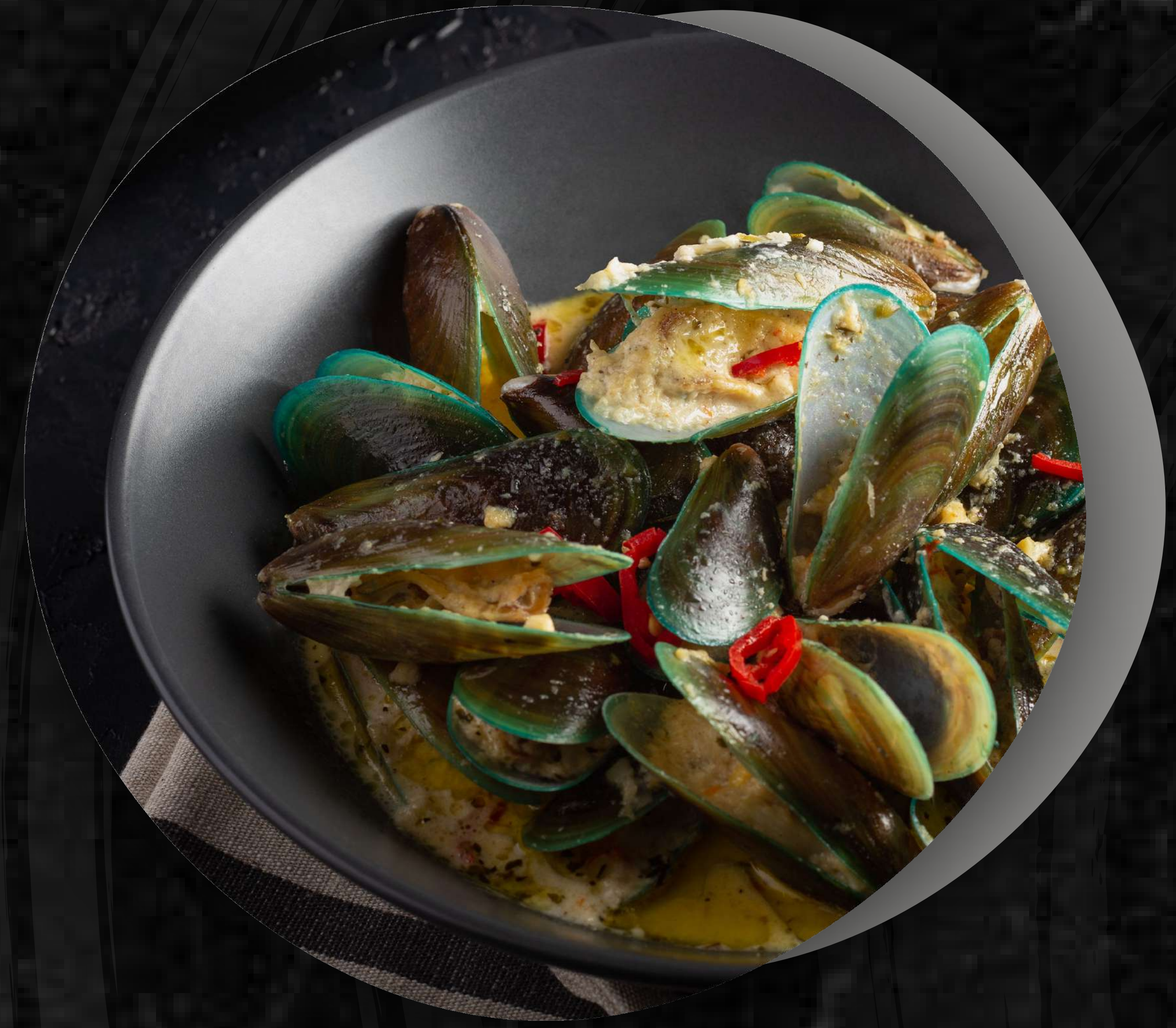
Mussels in Garlic Butter Cream