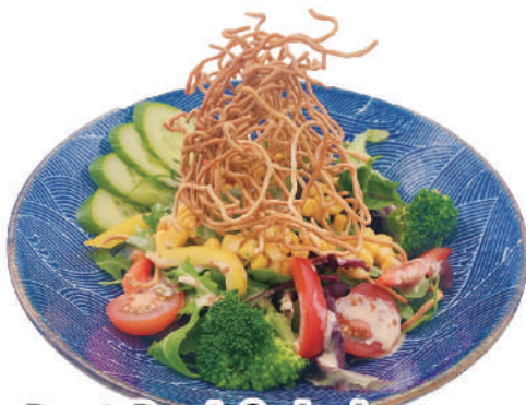
Bari Bari Salad €7,80

Crispy or Pan baked 5st €5,80 10st €10,80