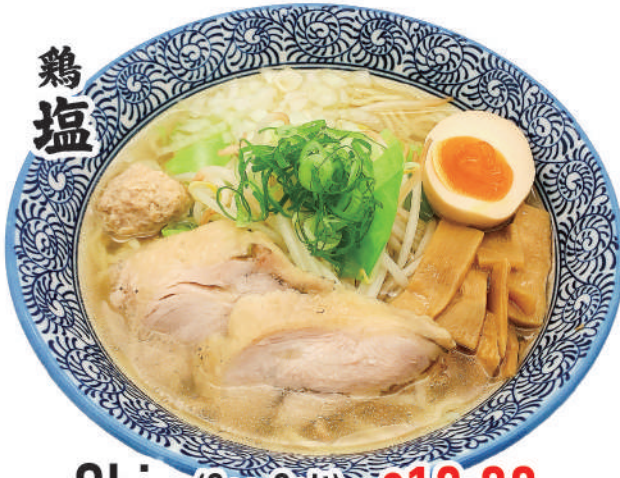
Shio (Sea Salt) €12,90