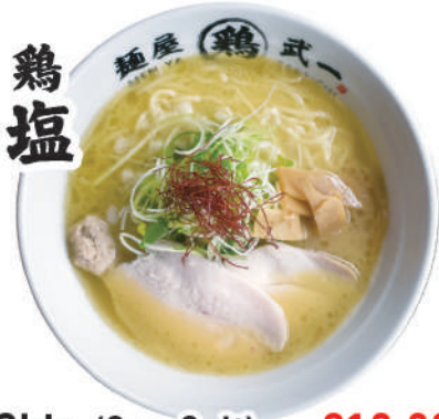
Shio (Sea Salt) €13,80