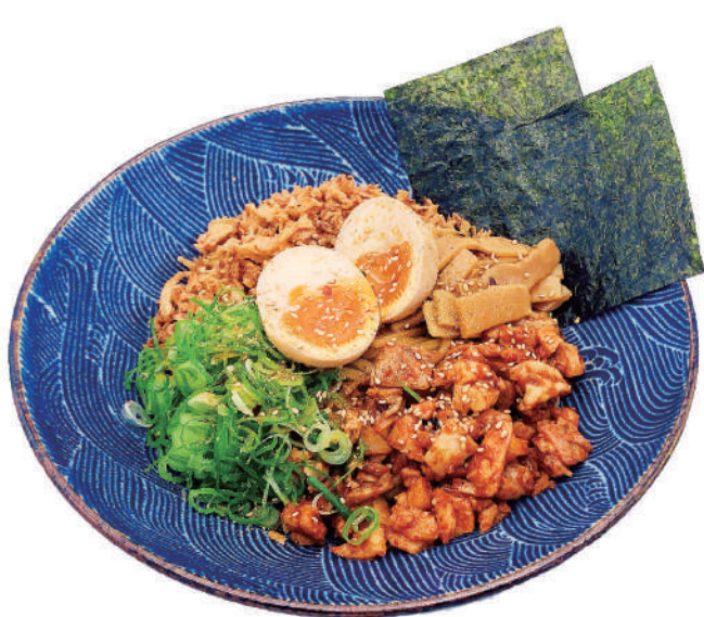
SPICY MAZESOBA €15,00