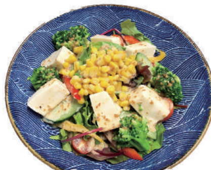
Tofu Salad €8,80