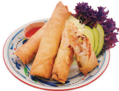
Spring Roll €7,20

Classic or Japanese (with aonori) sauce: mayo or ketchup or wasabi mayo