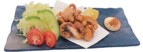
Fried Octopus €8,80

Flame seared mackerel sashimi with shiso leaves