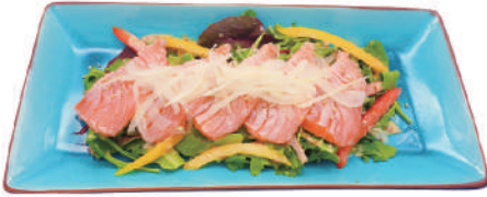
Aburi Salmon €9,80

Flame seared salmon sashimi on a bed of salad