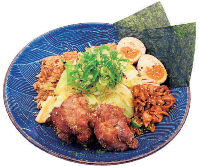
DELUXE SPICY MAZESOBA €17,40