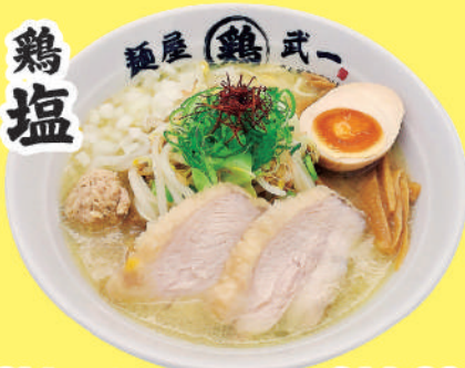
Shio (Sea Salt) €14,30