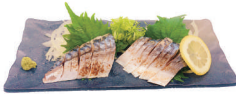
Aburi Mackerel €8,90

Flame seared salmon sashimi on a bed of salad