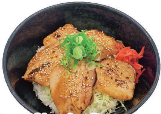
Pork Chashu Don €11,80

Chicken Schnitzel with a home made sauce