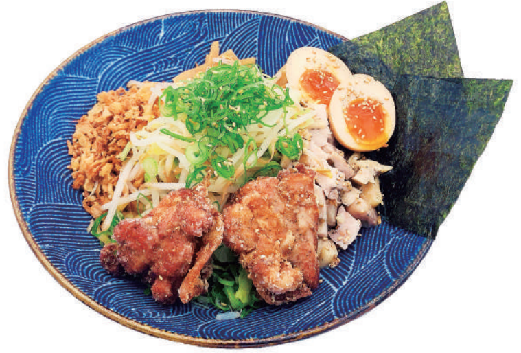
DELUXE MAZESOBA €16,90