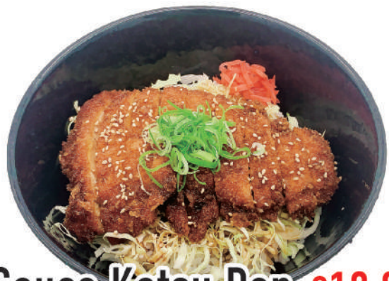
Sauce Katsu Don €12,80

Chicken Schnitzel with a home made sauce