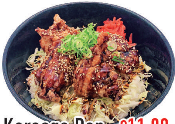
Karaage Don €11,80