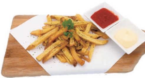
Potato Fries €4,80