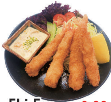
Ebi Fry €8,80