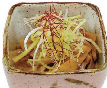
Spicy Menma €4,00