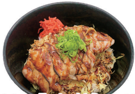
Chicken Teriyaki Don €11,80

Grilled Pork with a garlic Teriyaki sauce