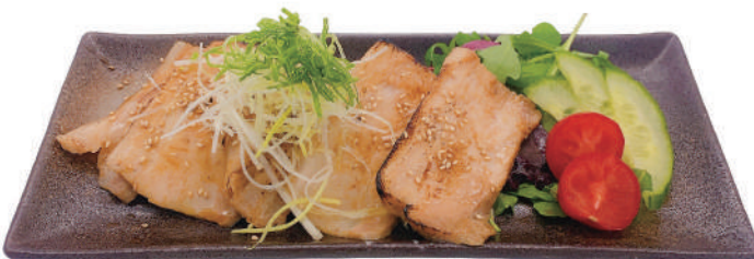
Aburi Pork chashu €6,80