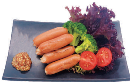
Small Japanese sausage €5,80

Classic or Japanese (with aonori) sauce: mayo or ketchup or wasabi mayo