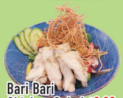
Bari Bari Chicken Salad €9,80