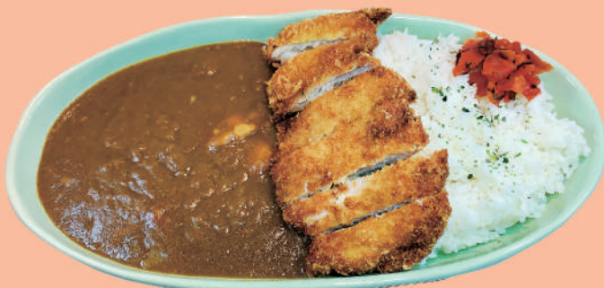
Chicken Katsu Curry €13,80

Our meat dishes are served on a bed of thinly sliced cabbage and rice with Japanese pickles (Benishoga)