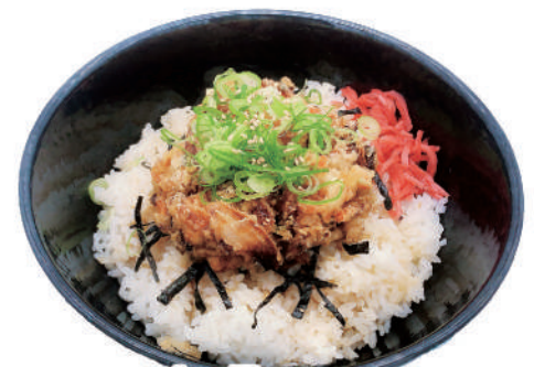
Vegetable Tempura Don

Vegetable Tempura on a bed of nori and rice with Japanese pickles (Benishoga) €9,80