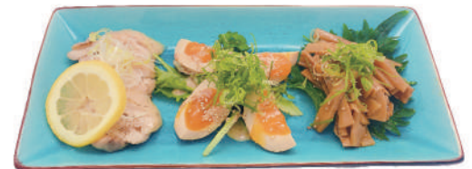
Tapas Trilogy €7,80

Soft boiled marinated eggs with salad topping