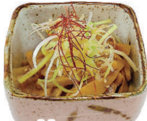
Spicy Menma €4,00