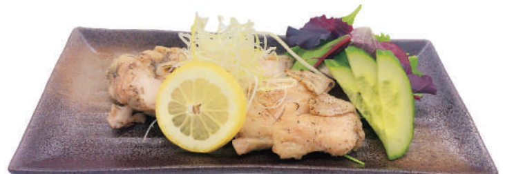
Aburi Tori chashu €7,80