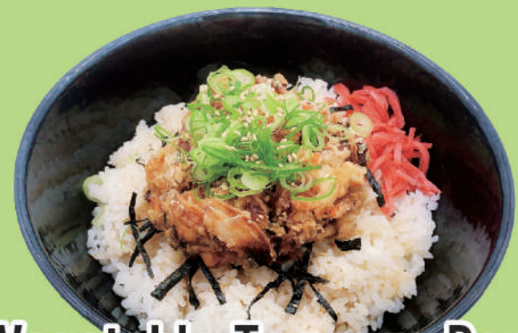
Vegetable Tempura Don €9,80

Vegetable Tempura on a bed of nori and rice with Japanese pickles (Benishoga)