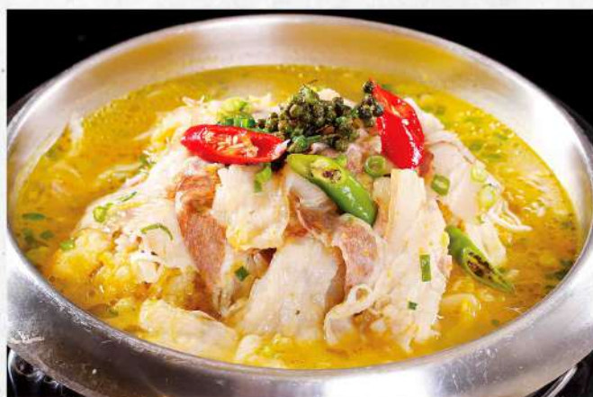
砂锅酸菜白肉 $ 28.80 Pork Belly & Pickled Cabbage