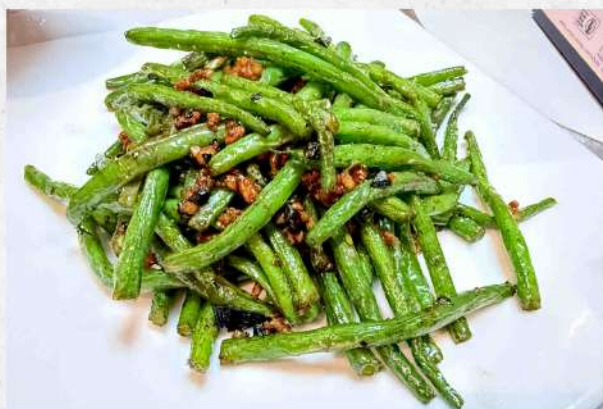
干煸四季豆 $ 36.80