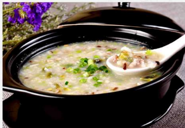
皮蛋瘦肉粥 $ 22.80

(Creamy rice porridge with prawns, scallops & rich salted duck egg sauce)