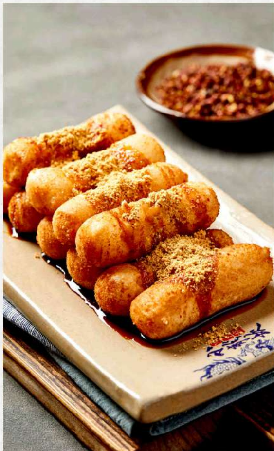
红糖糍粑 $ 18.80