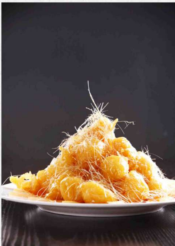
拔丝山药 $ 36.80