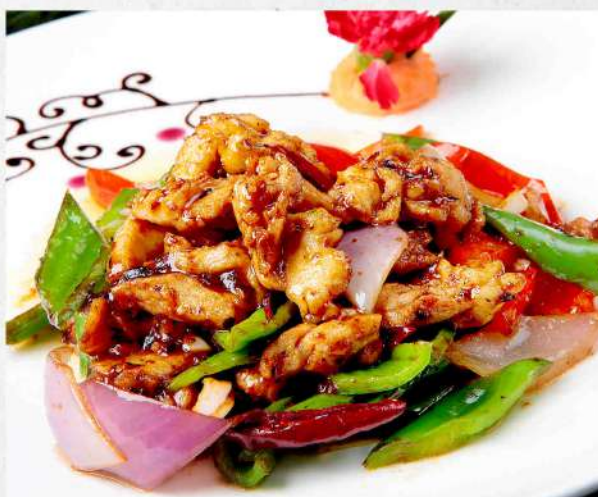
豉椒鸡球 $ 28.80 Chicken with Black Bean Sauce

CHARACTERIZED BY ITS SPICY Featured Chef