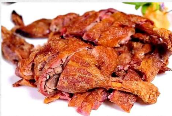
招牌香酥鸭(半只) $ 34.80

Wasabi King Prawns (Tiger prawns with wasabi-infused mayonnaise)