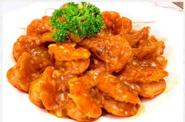
芥末口味虾 $ 48.80

Signature Garlic Ribs (Crispy pork ribs with golden garlic crust)