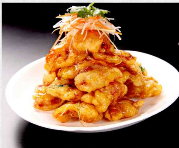
特色锅包肉 $ 28.80 Crispy Sweet & Sour Pork