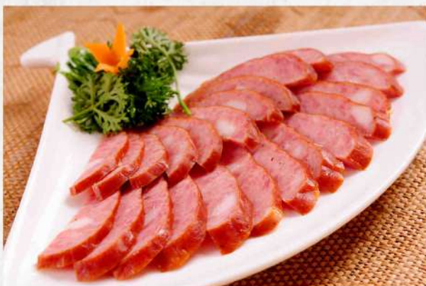
哈尔滨红肠 $ 16.80