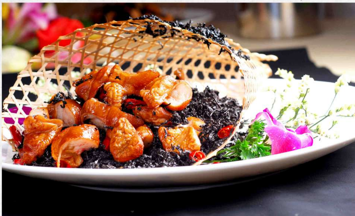
茶香脆皮肥肠 $ 42.80 Crispy Tea-Smoked Intestines

生活的滋味，可以是这样的，匆匆逝去的，是流金的岁月，久久留存的，是唇齿间的回味，以情感触摸氛围，用思想见赏盛宴，生活的滋味，竟可以这样如美妙的诗意，如痴如醉。