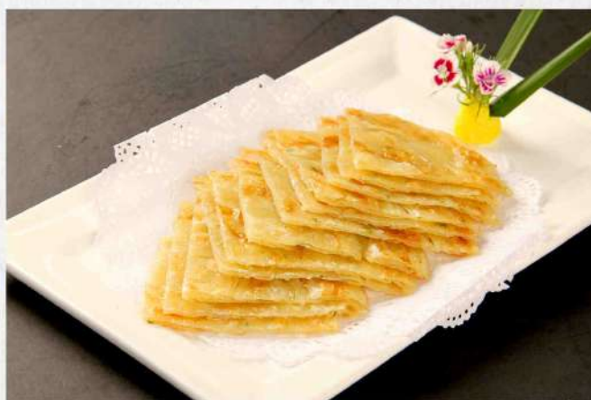
葱油饼 $ 12.80

(Velvety taro pudding with pearl sago in coconut milk)