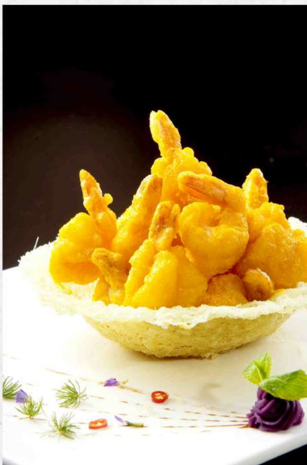
咸蛋黄虾球 $ 36.80 Salted Egg Yolk Prawns Creamy golden yolk coating