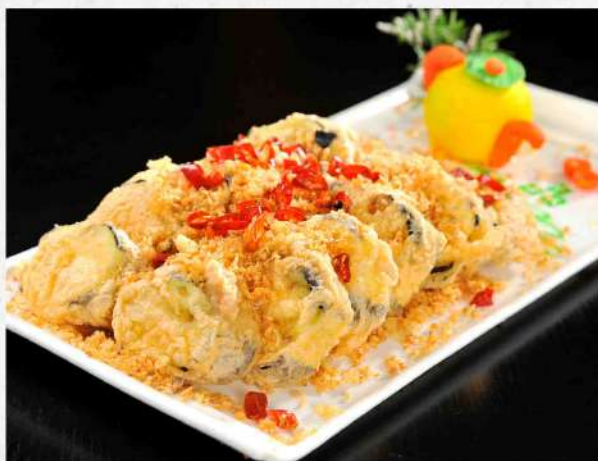
避风塘茄盒 $ 38.80 Typhoon Shelter Eggplant

真正的健康饮食， 是既和中华悠久的饮食文化一脉相承， 又和全新的世界性饮食文化紧密相联的饮食精神。 Truly healthy diet is the only ancient Chinese food culture and the same strain, and world food culture and a new spirit of the diet closely.