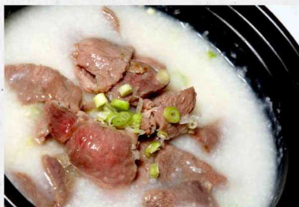
滑牛粥 $ 22.80

(Classic comfort food with silky egg curds and tender pork)