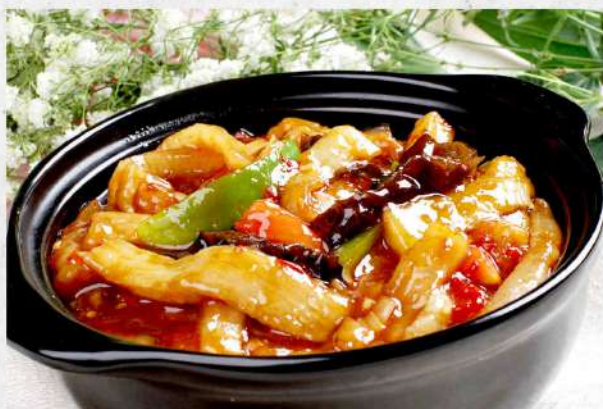
鱼香茄子 $ 28.80