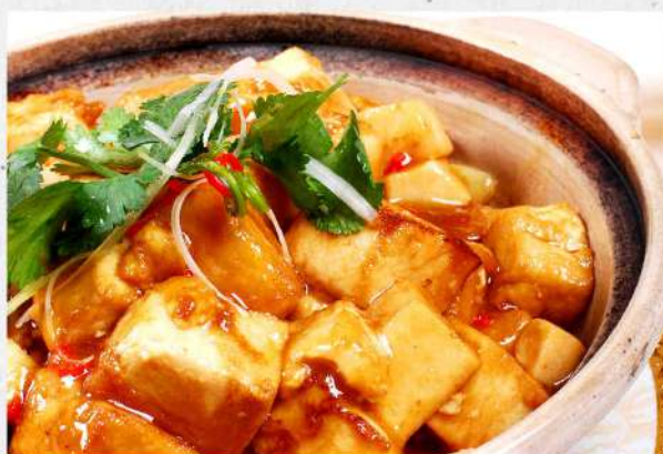
咸鱼鸡粒豆腐煲 $ 28.80 Salted Fish & Chicken Tofu Pot