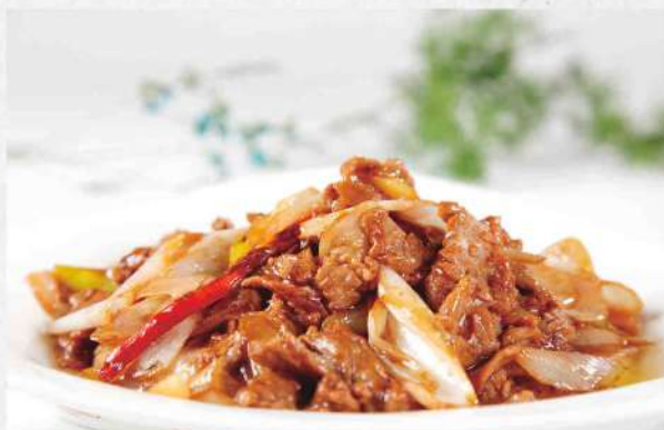
葱爆羊肉 $ 36.80 Scallion Explosion Lamb