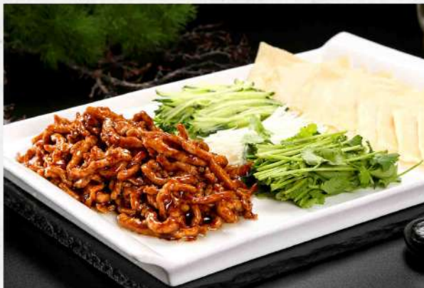
京酱肉丝 $ 32.80 Peking Meat Wraps