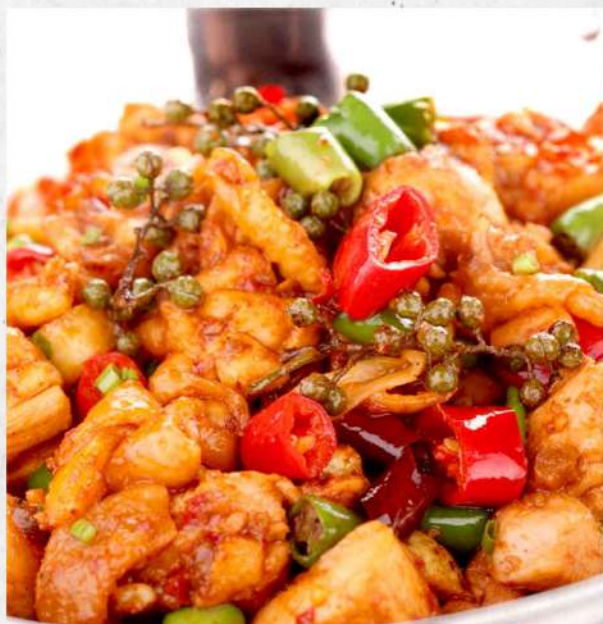
干锅小炒鸡 🌶️ $ 36.80 Dry Pot Chicken