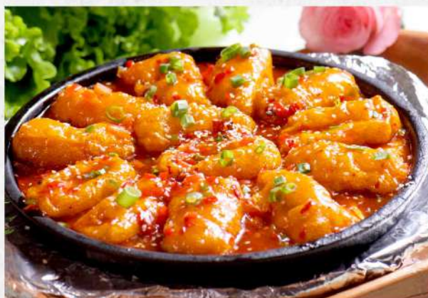
老干妈铁板茄盒 🌶️ $ 32.80

(Whole fish charcoal-grilled with Sichuan spices)