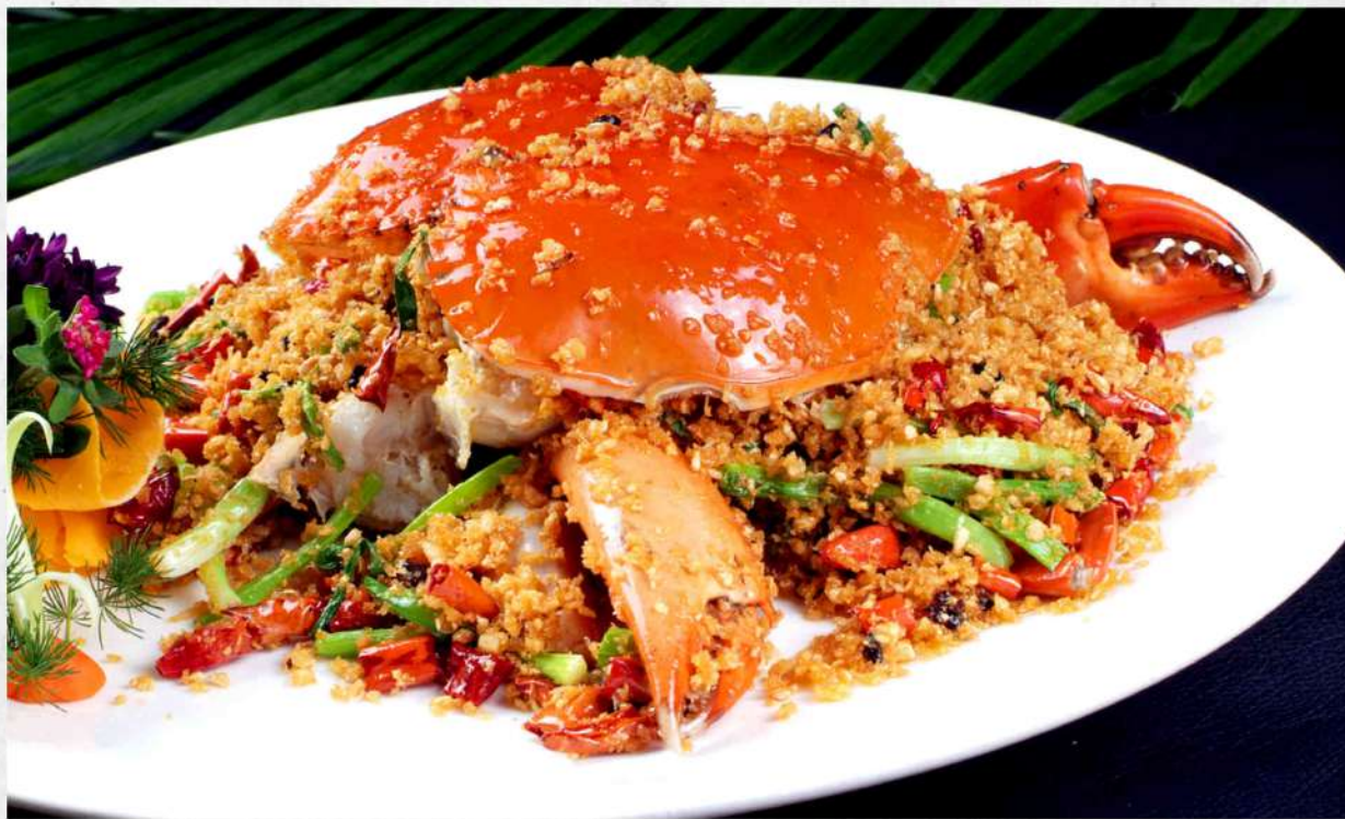
避风塘炒蟹/3只 $ 68.80 Typhoon Shelter Crab/3 Crabs

真正的健康饮食， 是既和中华悠久的饮食文化一脉相承， 又和全新的世界性饮食文化紧密相联的饮食精神。 Truly healthy diet is the only ancient Chinese food culture and the same strain, and world food culture and a new spirit of the diet closely.