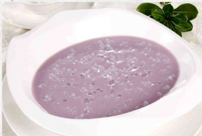
香芋西米露 $ 6.80

(Pan-fried glutinous rice cakes with caramelized brown sugar syrup)