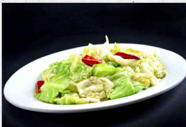
手撕包菜 $ 24.80