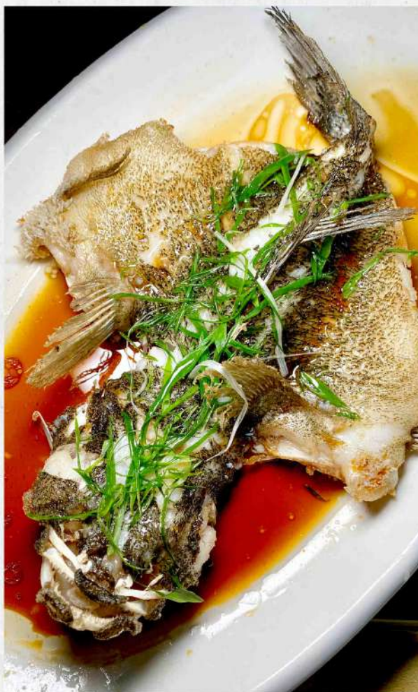
油浸笋壳鱼(1-1.2kg) $ 78.80

(Layered taro and braised pork – Hakka classic)