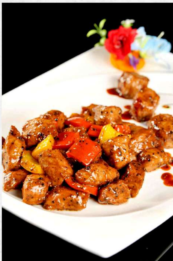
黑椒和牛粒 $ 68.80 Black Pepper Wagyu- Seared medium-rare with crushed peppercorn crust