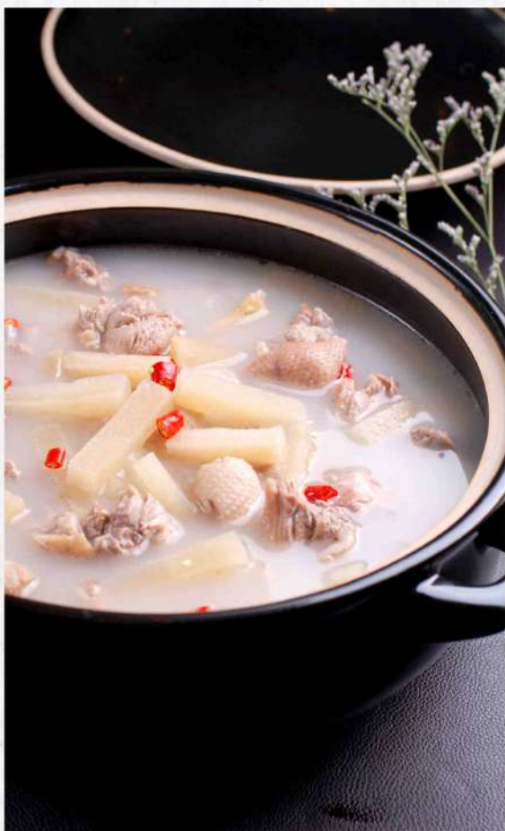
砂锅酸萝卜老鸭 $ 58.80 Sour Duck & Radish Pot