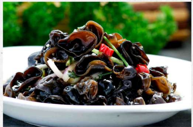
山椒木耳 🌶️ $ 14.80 Mountain Pepper Wood Ear Mushrooms (Crunchy fungus with Sichuan peppercorn dressing)