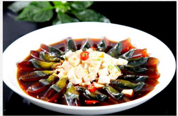
皮蛋拌豆腐 🌶️ $ 14.80 Century Egg & Tofu Salad (Silken tofu with preserved egg and ginger dressing)