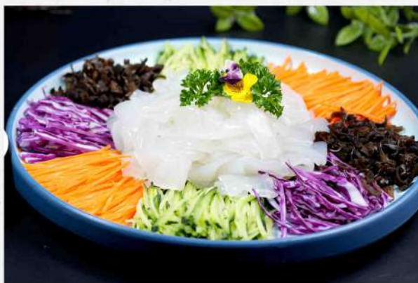
五彩大拉皮 $ 18.80

(Northeastern China's iconic garlicky smoked sausage)