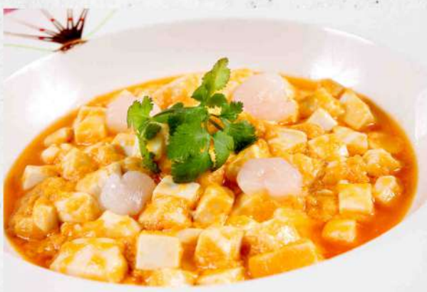
咸蛋黄虾仁豆腐煲 $ 30.80 Salted Egg Yolk Prawn Tofu