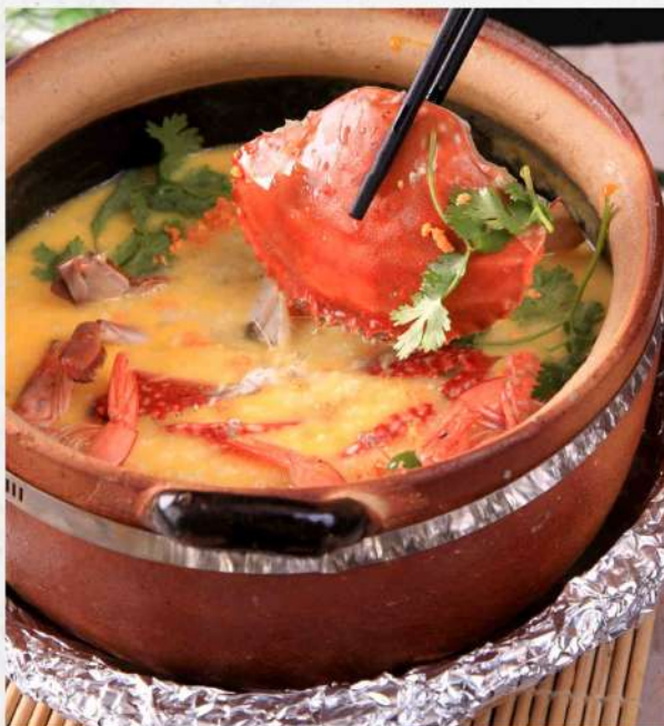
咸蛋黄海鲜粥 $ 34.80