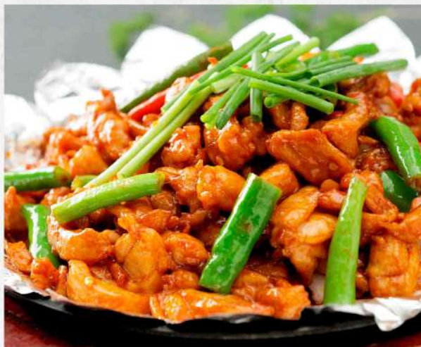
铁板黑椒鸡球 $ 28.80 Black Pepper Chicken Sizzler