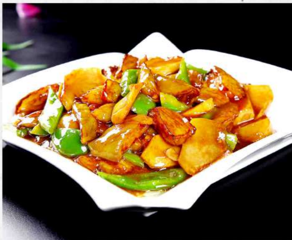
地三鲜 $ 26.80 Three Earthly Delights- Potato, eggplant & bell pepper trio