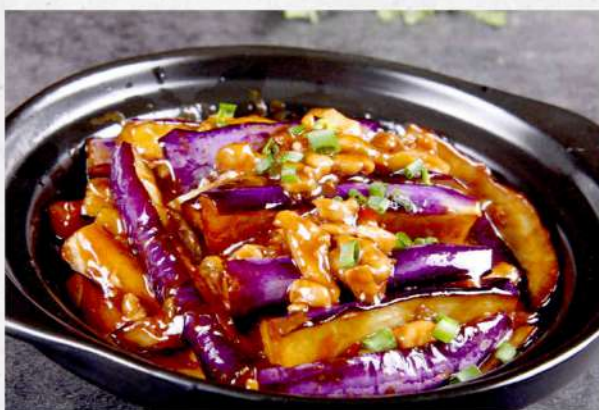
咸鱼鸡粒茄子煲 $ 32.80 Salted Fish & Diced Chicken Eggplant Clay Pot