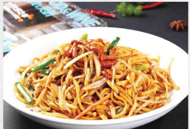
牛肉炒面 $ 18.80 Beef Chow Mein (Wok-seared beef with thick noodles in savory sauce)