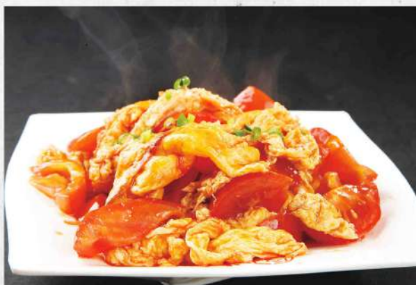
西红柿炒鸡蛋 $ 24.80