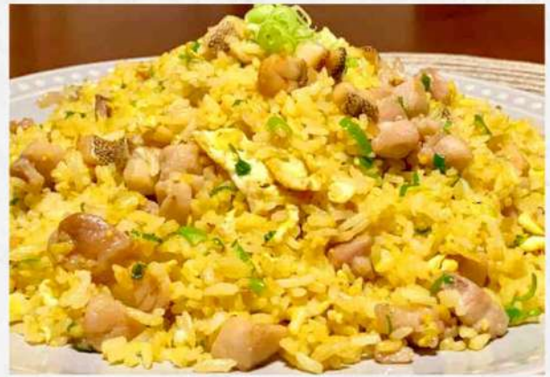
咸鱼鸡粒炒饭 $ 22.80 Salted Fish & Chicken Fried Rice Wok-fried rice with crispy salted fish, tender chicken cubes, eggs, and scallions for a bold, flavorful classic