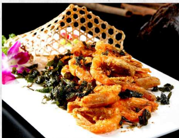
茶香大虾 $ 48.80 Tea-Scented King Prawns

The taste of life, can be like this, pass, is the golden years, long aftertaste is retained, lips, to touch the emotional atmosphere, with ideas see reward feast, the taste of life, such as can be as wonderful as poetry.