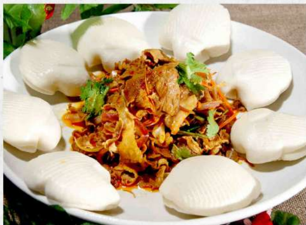
孜然羊肉夹饼 🌶️ $ 38.80 Xinjiang Cumin Lamb Buns

在美食的国度里，厨师们精心寻找的食材和无限创意的佳肴，如同在宣纸上浸润的水墨一样散布在口腔的每一个味蕾上，酸甜苦辣皆是最爱。