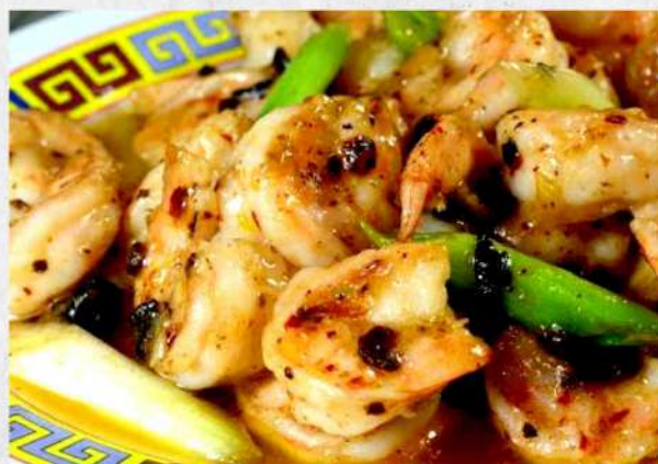
豉椒虾球 $ 36.80 Black Bean Pepper Prawns Fermented black bean sauce