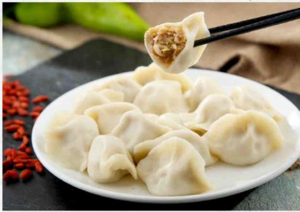
猪肉白菜/20个 $ 19.80 Pork and cabbage/20pcs