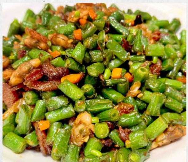
一品小炒皇 $ 36.80

Steamed Taro with Cured Pork & Chilli (Fermented chilli and smoked pork over taro)