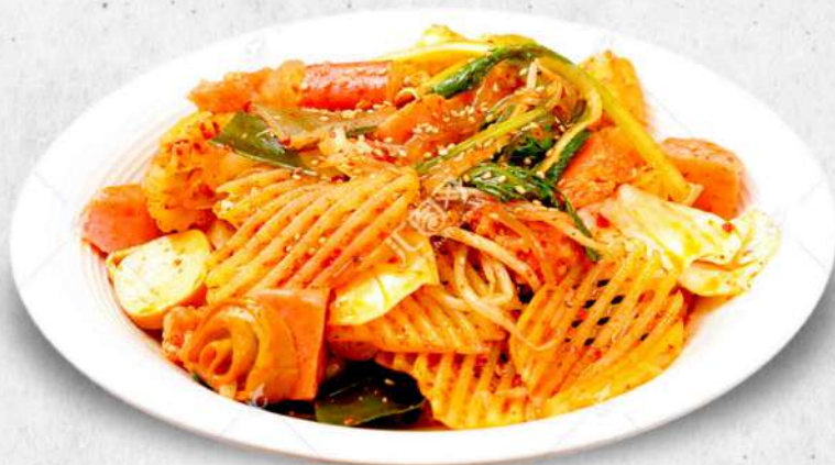
抚顺麻辣拌 $ 19.80