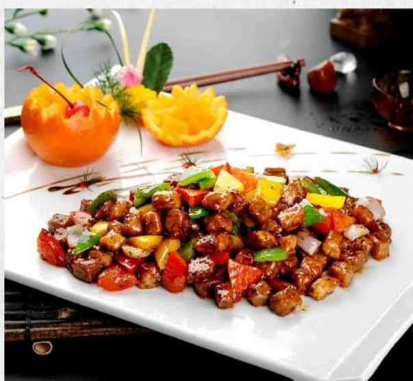
杭椒和牛粒 🌶️ $ 68.80 Hangzhou Pepper Wagyu With mild green peppers in savory glaze

Every dishes, all through the layers of processes, well-built, cooking, breaking tradition. The expensive ingredients and innovative approach to creative use of modern, full of new life. In the visual and taste gives a shock of pleasure.