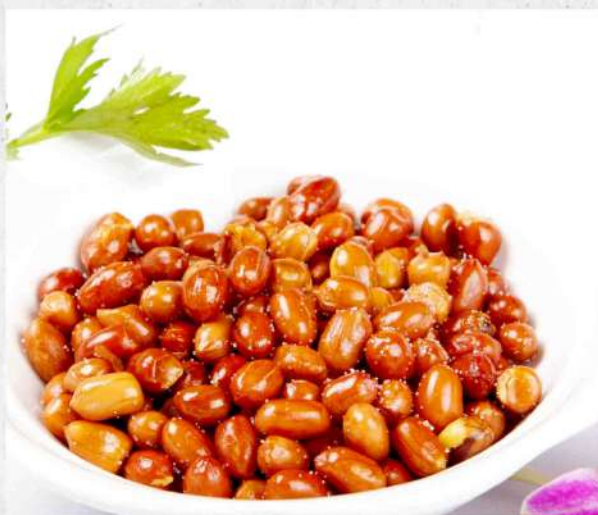
炸花生米 $ 9.80 Crispy Fried Peanuts (Classic beer snack with sea salt)