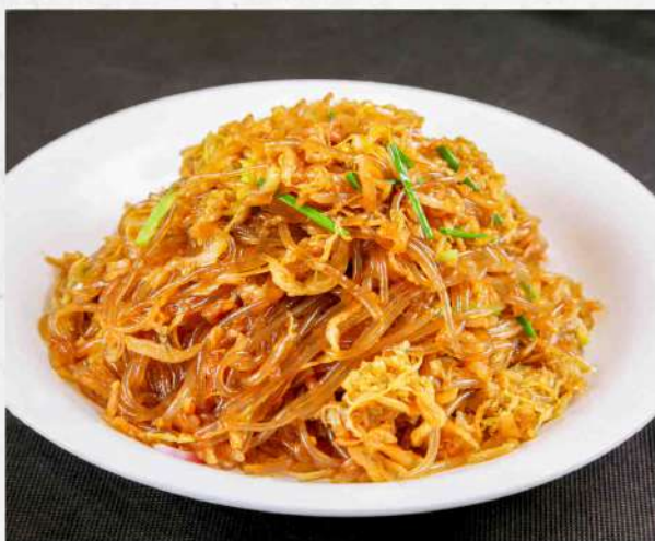
酸菜炒粉 $ 22.80 Pickled Cabbage Vermicelli