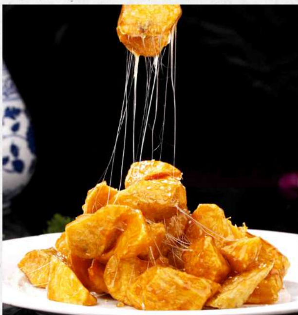
拔丝地瓜 $ 28.80

(Crispy fried yam threads with molten caramel glaze – serve immediately)