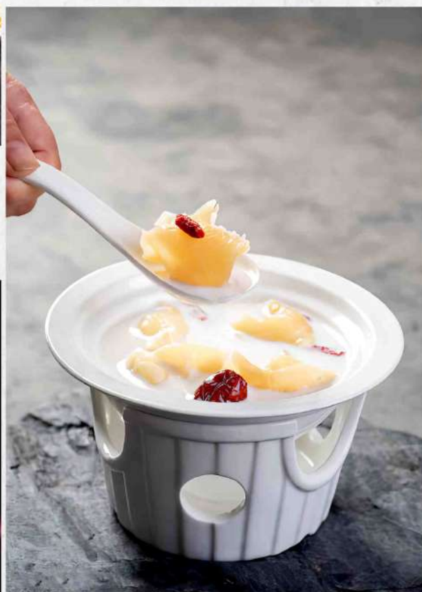
花胶红枣炖奶 $ 28.80

一种可以传达情感的食物，它将唇齿间温柔的风景轻轻描绘，似恋人耳语；时而羞涩，时而热辣，时而甜蜜，时而酸溜溜……那就是记忆中的味道！