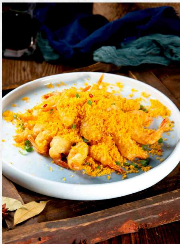
避风塘大虾 $ 48.80 Typhoon Shelter Prawns