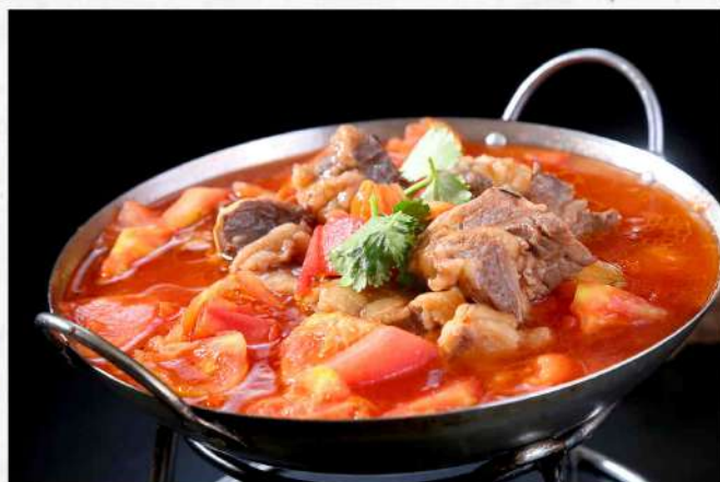
砂锅西红柿炖牛腩 $ 38.80 Tomato Braised Beef Brisket