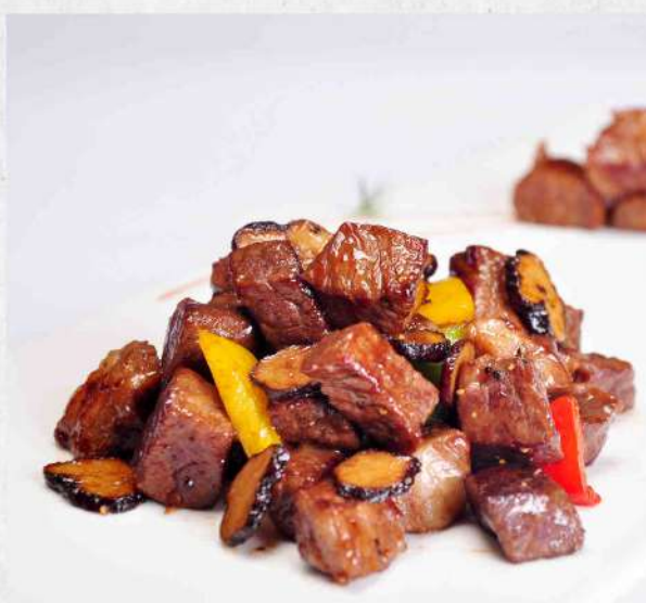
黑松露和牛粒 $ 68.80 Black Truffle Wagyu Shaved fresh truffle finish