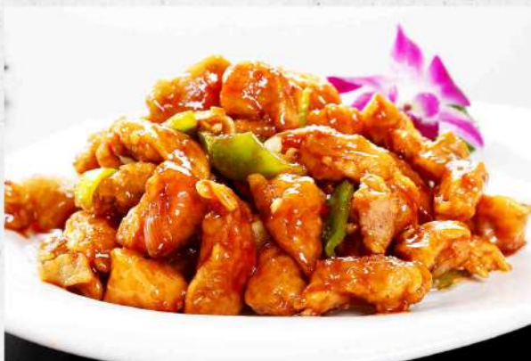
溜肉段 $ 28.80 Braised Pork Slices