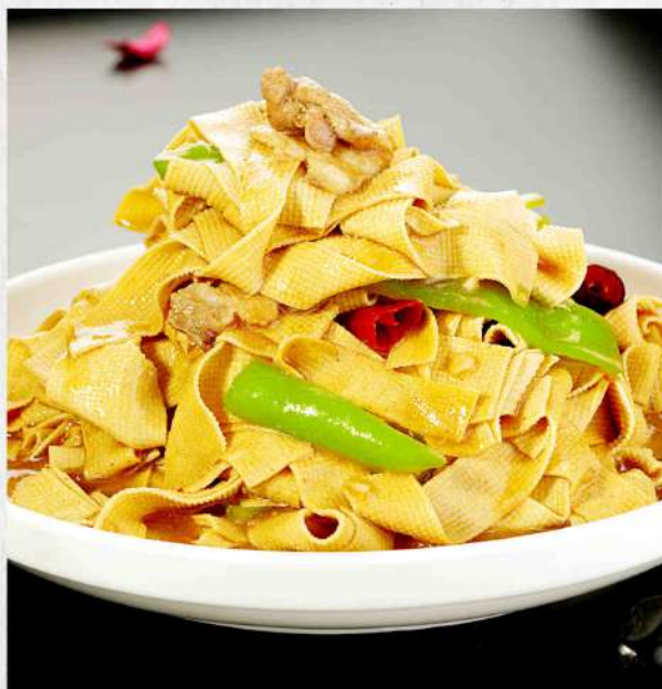
尖椒干豆腐 $ 28.80 Tofu Skin with Green Peppers