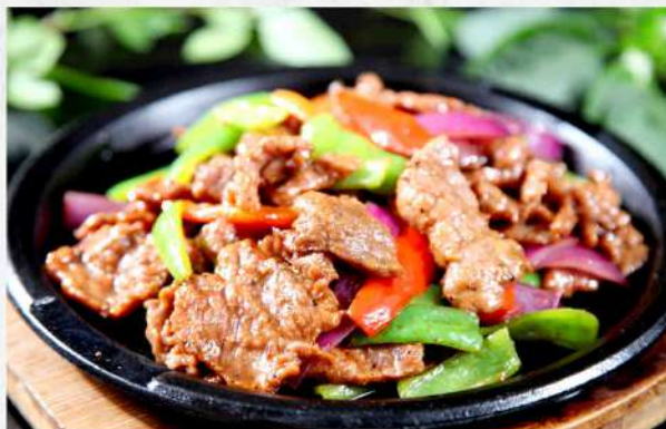
铁板黑椒牛肉 $ 32.80 Black Pepper Beef Sizzler