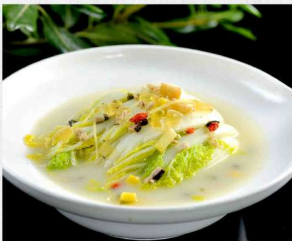
上汤娃娃菜 $ 28.80 Baby Bok Choy in Superior Broth