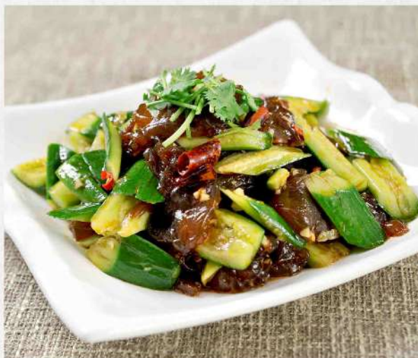
黄瓜拌海蜇 $ 16.80 Jellyfish & Cucumber Salad (Crunchy jellyfish with refreshing cucumber ribbons)