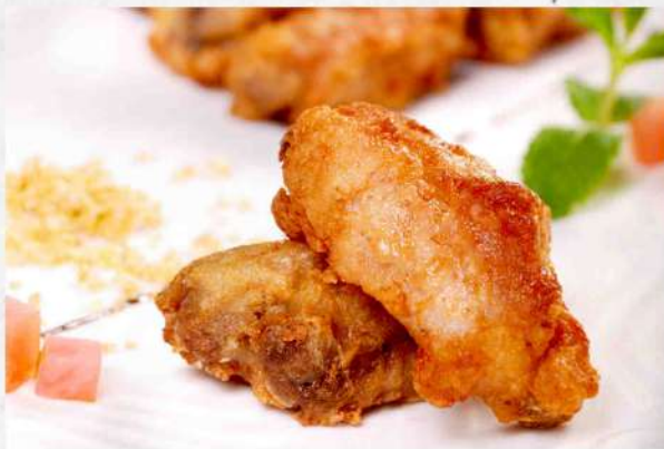
招牌蒜香骨 $ 32.80

Signature Garlic Ribs (Crispy pork ribs with golden garlic crust)