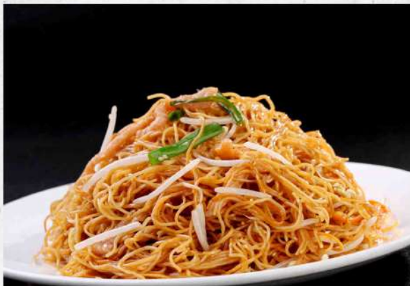
鸡肉炒面 $ 16.80 Chicken Chow Mein (Stir-fried egg noodles with crisp vegetables)