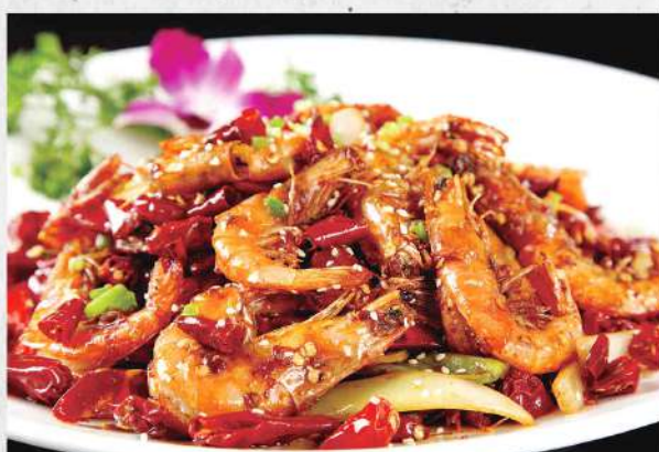
招牌香辣虾 🌶️ $ 48.80 Signature Chilli Prawns