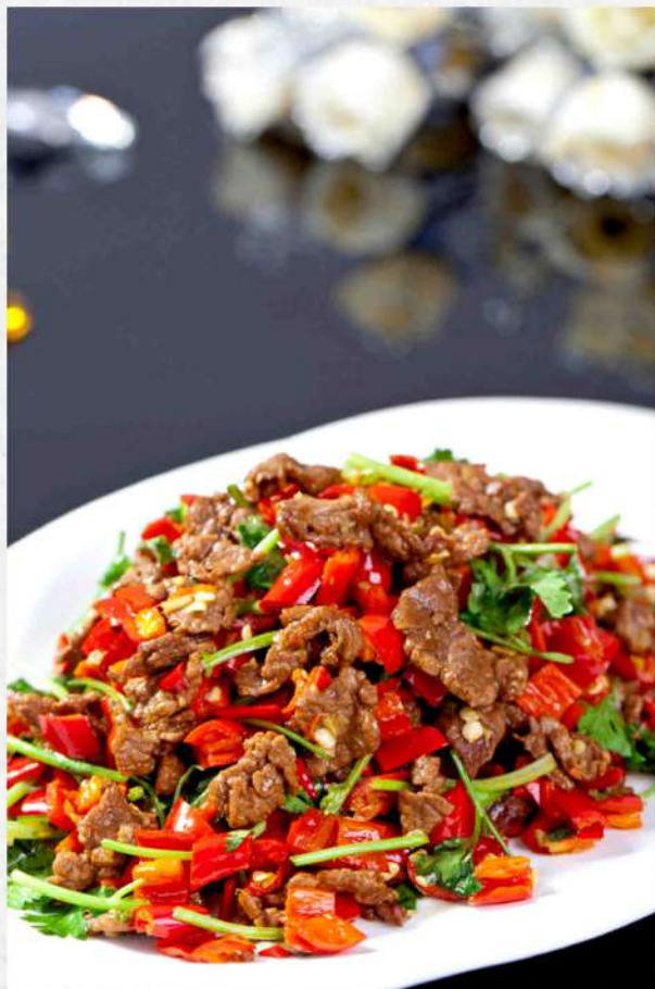
小炒牛肉 🌶️ $ 38.80 Hunan-style Wok-Seared Beef with Coriander