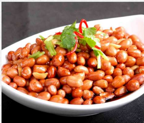
老醋花生 $ 12.80 Crispy Peanuts in Aged Vinegar (Deep-fried peanuts with sweet-black vinegar glaze)

凉菜的精致细腻，如同水一般温柔的女子。在秀色可餐与可餐秀色之间，萌生着一种朦胧却爽朗的感觉。极致的冷菜，演绎浓厚、或清爽的的美味，与清鲜的凉菜相呼应着。秀色让味蕾忍不住起舞，即使最挑剔的嗅觉也可以得到惊喜。