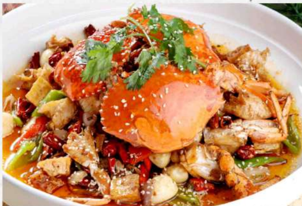
招牌香辣蟹/3只 🌶️ $ 68.80 Signature Chilli Crab/3 crabs