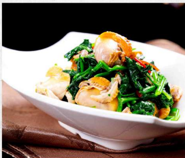
菠菜拌蚬肉 $ 18.80 Spicy Clam & Spinach Salad (Baby clams tossed with spinach in chili dressing)