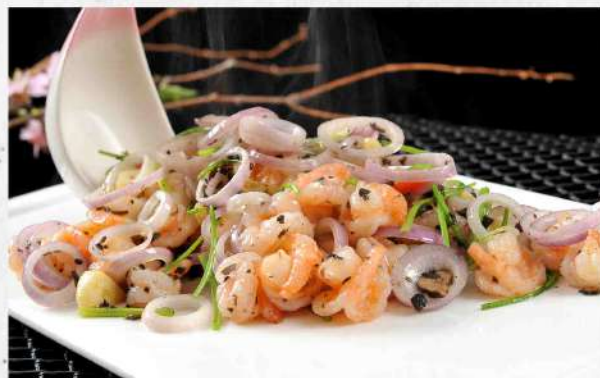
黑松露虾球 $ 36.80 Truffle-Infused Prawns Black truffle oil drizzle