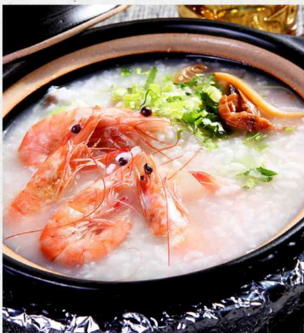
鲜虾粥 (8只) $ 24.80

(Velvety sliced beef in ginger-infused porridge)