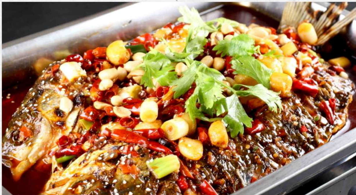
招牌特色烤鱼(1-1.2kg) $ 78.80 🌶️🌶️