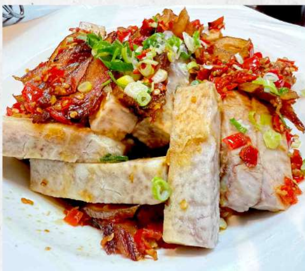
剁椒腊肉蒸芋头 $ 38.80

Nanjing Salted Duck (Half) A classic Nanjing dish featuring tender duck meat cured in aromatic brine, then poached to perfection. Known for its delicate salty flavor and smooth texture.