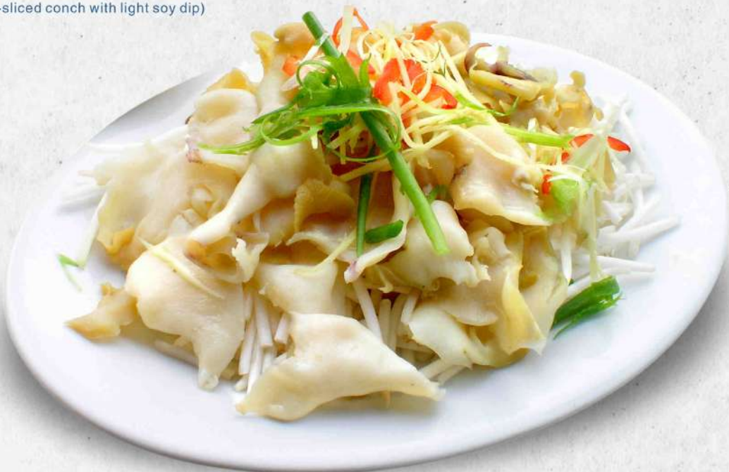
白灼螺片 $ 36.80 Poached Whelk Slices (Precision-sliced conch with light soy dip)