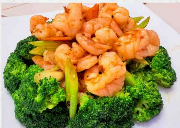
XO酱碧绿炒虾球 $ 36.80 XO Sauce & Greens Prawns Wok-seared with seasonal greens

It often leaves a slight numb sensation in the mouth. However, most peppers were brought to china from the americans in the 18th century so you can thank global trade for much of sichuan cuisine's excellence. Sichuan hot pots are perthas the most famous hotpots in the world, most notably the yuan yang (mandarin duck) hotpot half spicy and half clear.