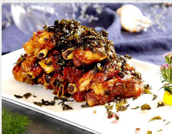
茶香排骨 $ 32.80 Tea-Infused Pork Ribs