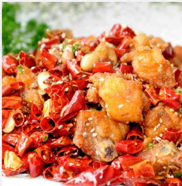
香酥辣子鸡 🌶️ $ 38.80 Crispy Chilli Chicken