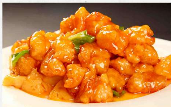
菠萝咕噜虾球 $ 36.80 Pineapple Sweet & Sour Prawns Crispy prawns with fresh pineapple