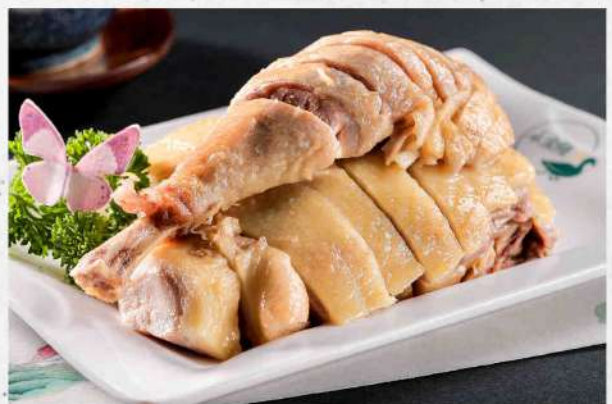
南京盐水鸭(半只) $ 28.80

Signature Crispy Duck (Half) Deep-fried to golden perfection, this duck boasts crispy skin and juicy meat, often seasoned with spices for an irresistible crunch.