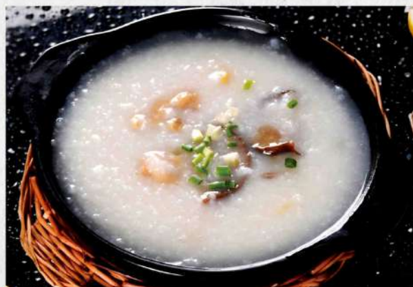
香菇滑鸡粥 $ 16.80

(8 juicy NZ-caught prawns in delicate white broth)