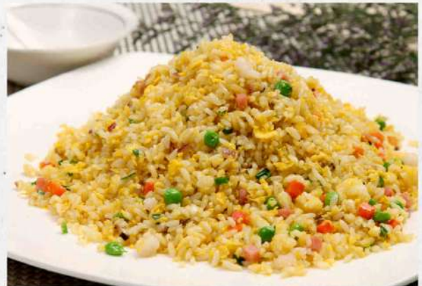
扬州炒饭 $ 20.80 Yangzhou Fried Rice (Traditional BBQ pork, shrimp and vegetable mix)