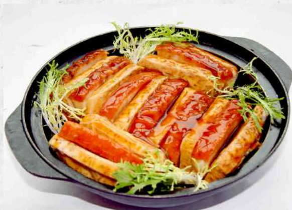
槟榔芋头扣肉 $ 36.80

(Crispy eggplant parcels with iconic chilli sauce on hotplate)