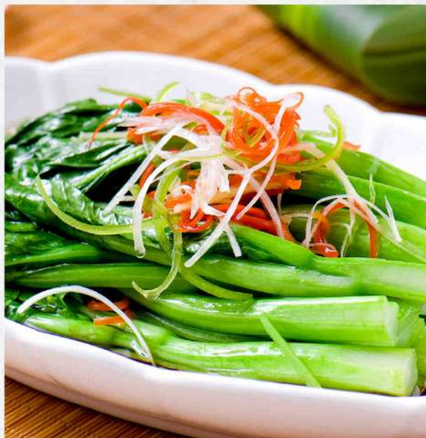
白灼菜心 $ 36.80 Blanched Chinese Broccoli