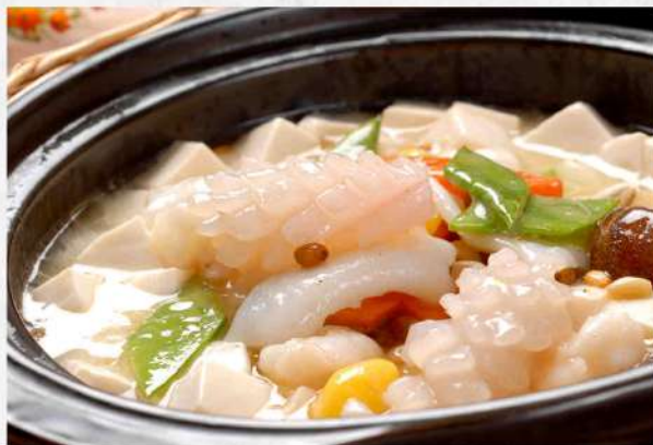
海鲜豆腐煲 $ 32.80 Seafood Tofu Hotpot