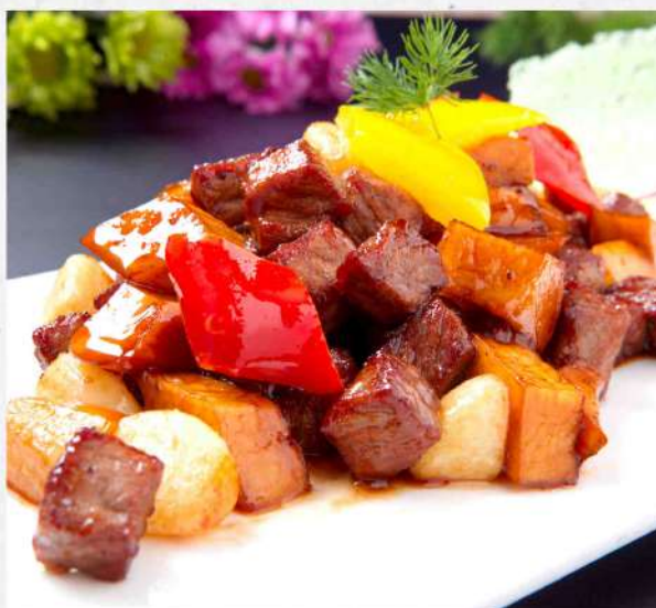
XO酱炒和牛粒 $ 68.80 XO Sauce Wagyu Wok-tossed with house-made XO sauce

Here The Temptation Of Looking For The Deepest Taste Buds 每一道菜品，都经过层层工序，精心打造，烹饪，突破传统。 将名贵的食材和现代创新手法创意运用，焕发新的生命。 在视觉与味觉上给人以震撼的享受。