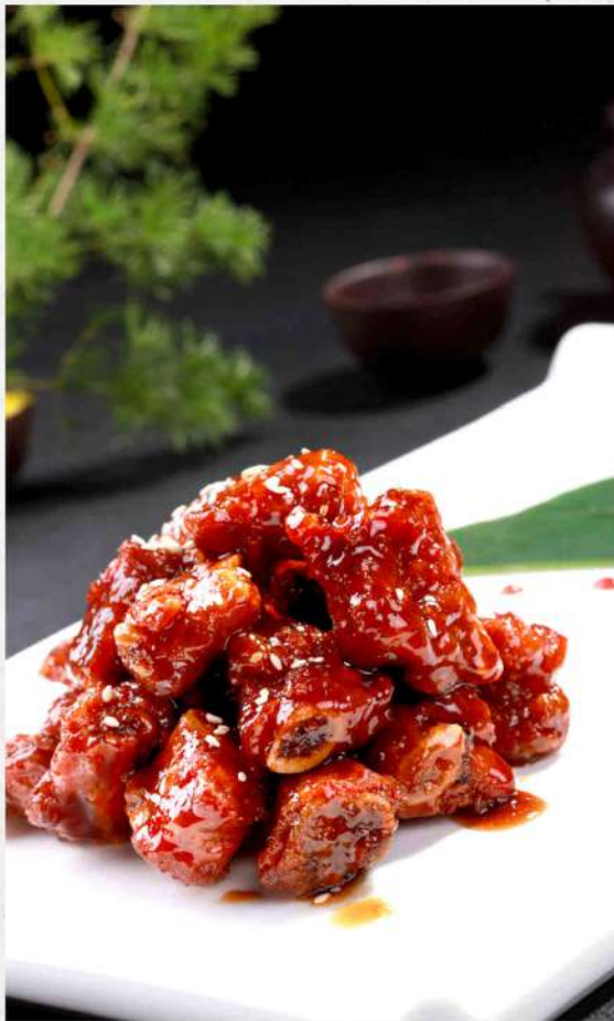
糖醋小排 $ 18.80 Sweet & Vinegar Pork Ribs (Crispy bite-sized ribs in tangy glaze)