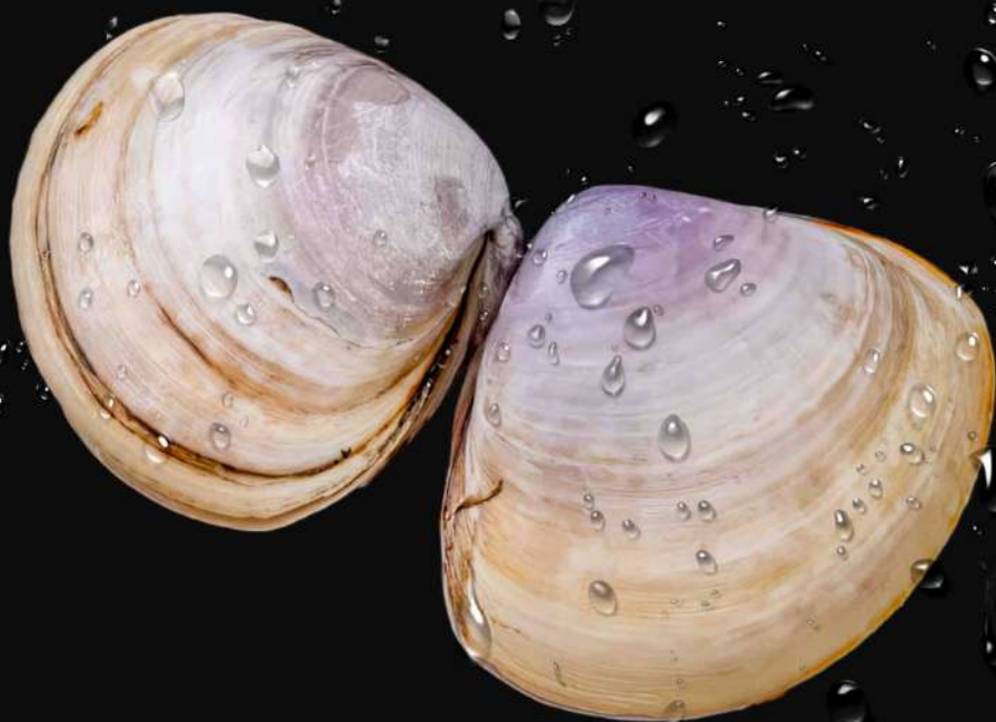
鲜活贵妃蚌 Atlantic Surf clam