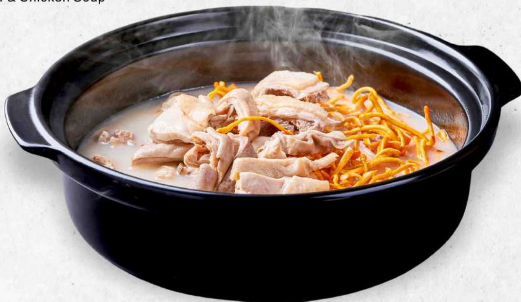
砂锅虫草花胡椒猪肚鸡 $ 38.80 Pepper & Chicken Soup