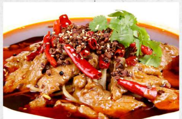
水煮牛肉 🌶️ $ 38.80 Sichuan Boiled Beef