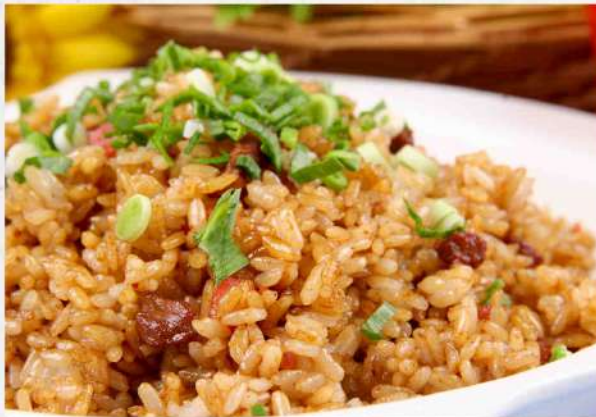
牛肉炒饭 $ 18.80 Beef Fried Rice (Tender beef strips in dark soy sauce)