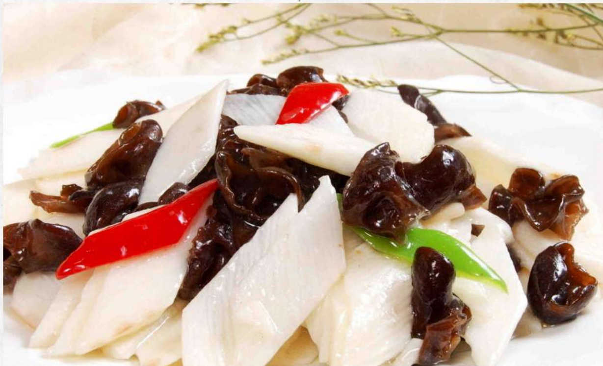
新鲜山药炒木耳 $ 38.80