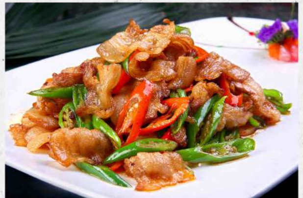
农家小炒肉 🌶️ $ 38.80 Farmhouse Stir-Fried Pork