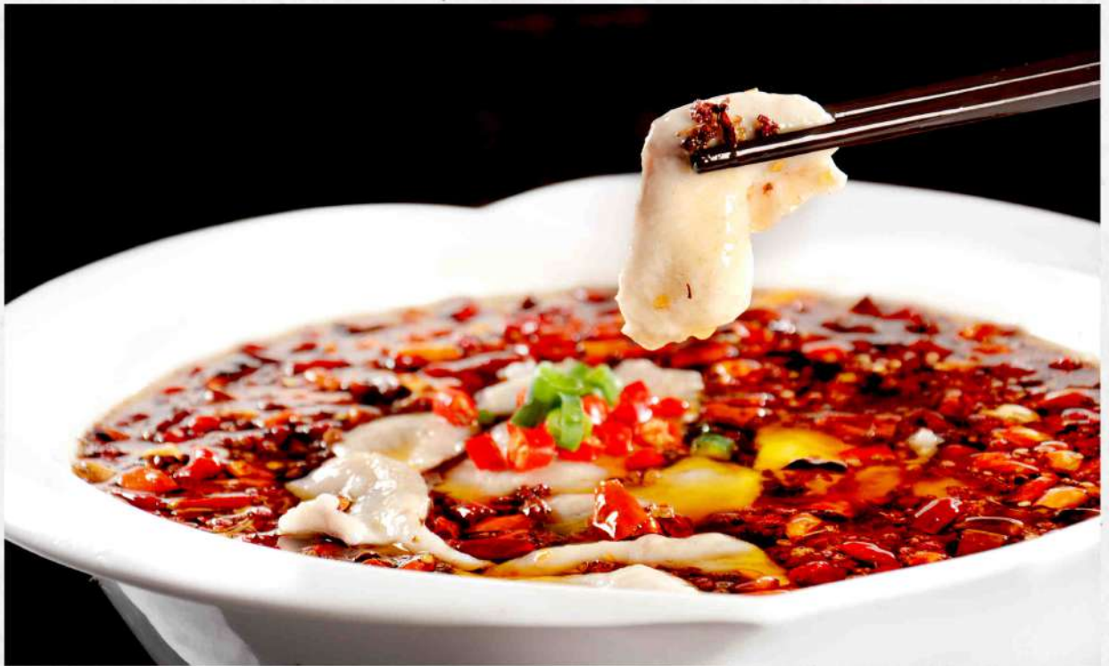
水煮鱼片 🌶️ $ 58.80 Sichuan Boiled Fish