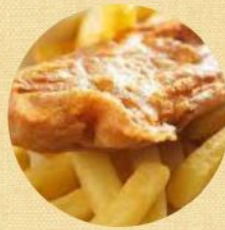
Kids Fish and Chips