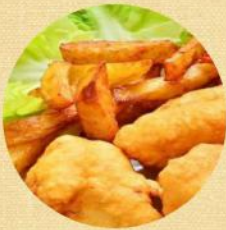
Kids Nuggets and Chips