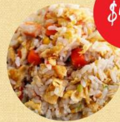
Kids Fried Rice (not hot or spicy)