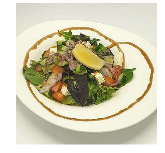
A09 - Choban Salad (Shepperd's Salad)

Cucumber, tomato, onion topped with olive and feta cheese dressing with extra virgin olive oil and lemon juice