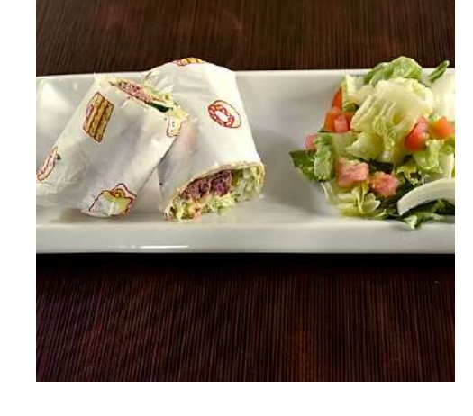
M09 - Adana Kebab Roll

Grilled lamb meat wrapped with green salad, tomato, onion with extra virgin olive oil dressing