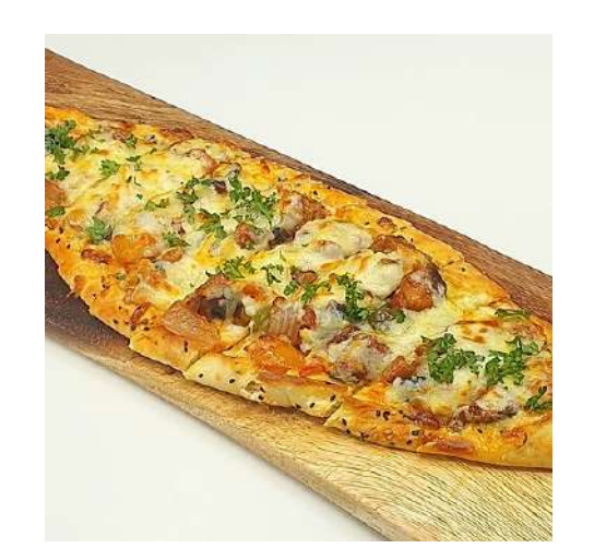
A08 Vegetarian Pide (Turkish Pizza)

Veggie Pide is a boat-shaped flatbread baked with vegetable toppings cooked in stone oven