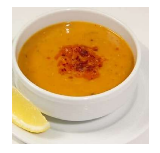
A01 - Soup of the Day

Our restaurant makes all of our soups fresh daily