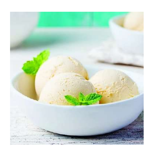
D06 - Ice Cream