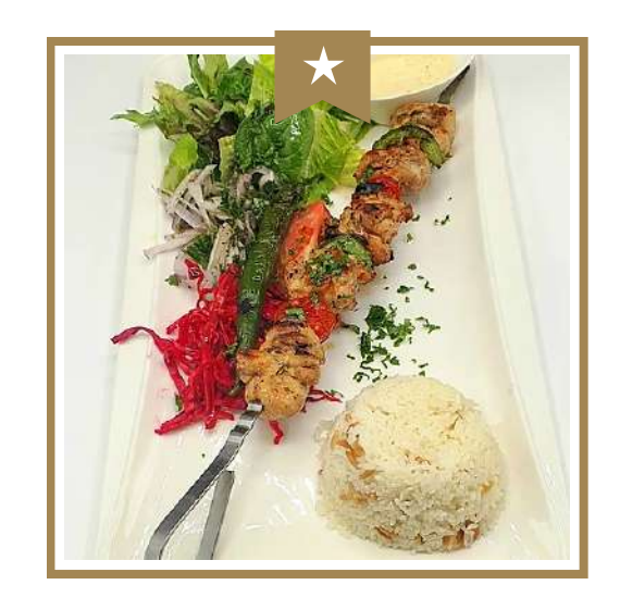
M03 - Grilled Chicken Shish Kebab with Salad

Pieces of marinated chicken cubes and vegetables grilled and served on skewers with Turkish butter rice and salad