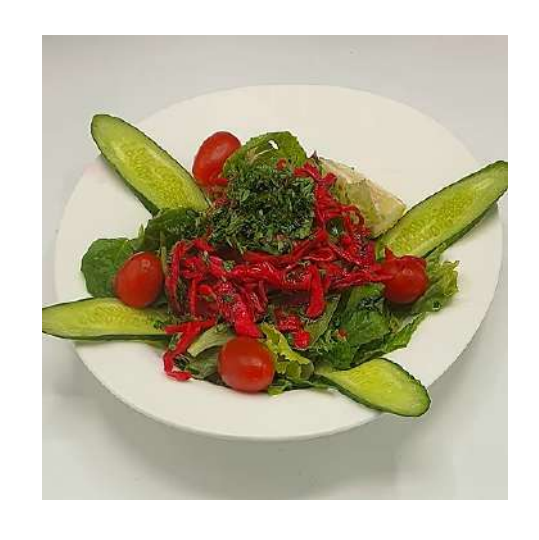
A02 - Green Salad

Green salad tossed with extra virgin olive