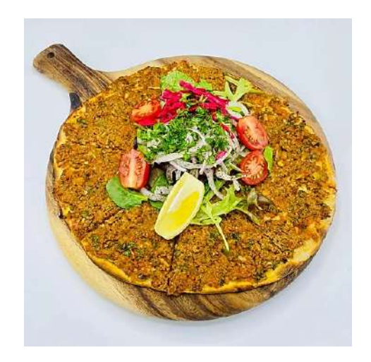
M24 - Lahmacun (lamb)

Super thin, crispy Turkish pizza (or flatbread) topped with a flavor-packed mixture of minced meat with peppers, tomato, fresh herbs and earthy spices