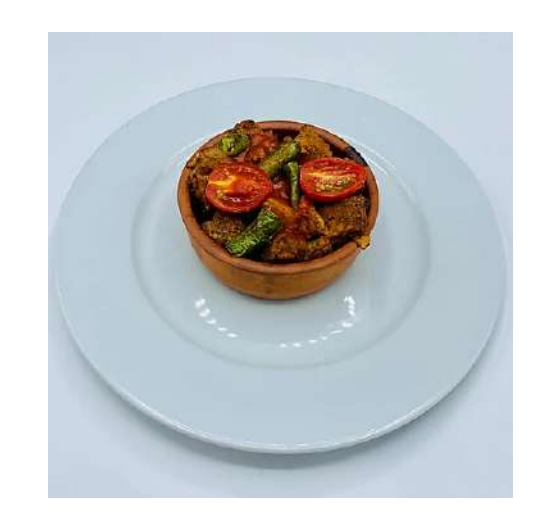
Güveçte Tas Kebabi (Beef Stew in Claypot)

In Turkey 'tas' means bowl and this heart-warming dish is baked in a clay bowl in the oven. Tas kebabi is a Turkish stew made with beef cubes simmered with onions, tomatoes, garlic and spices such as cumin, bay leaves. The stew is slowly cooked until all the ingredients are tender and succulent.