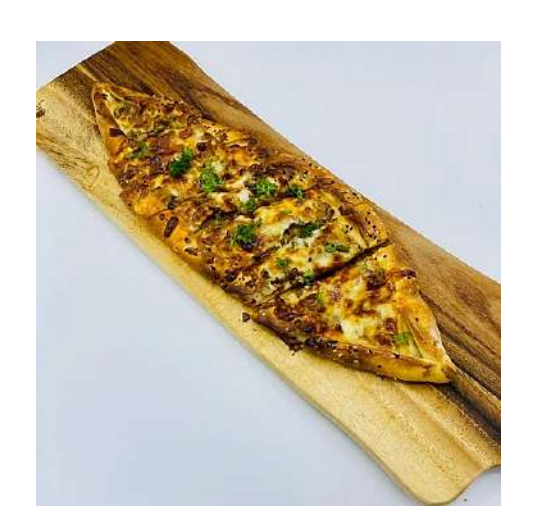
A07 - Lamb Pide (Turkish Pizza)

Lamb Pide is an oval-shaped flatbread baked with minced lamb meat, onion, chilli, herbs and mozzarella toppings slow cooked in stone oven