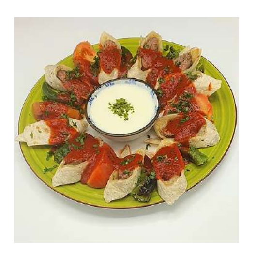
M18 - Beyti Kebab

Beyti is a Turkish dish consisting of ground lamb, grilled on a skewer and served wrapped in lavash and topped with tomato sauce and yogurt