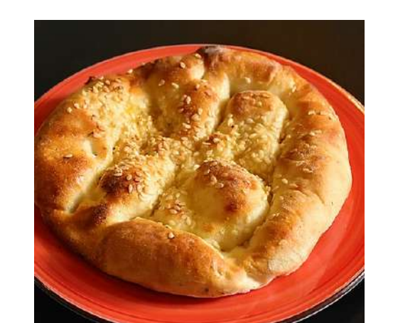
EO2 - Turkish Pita Bread