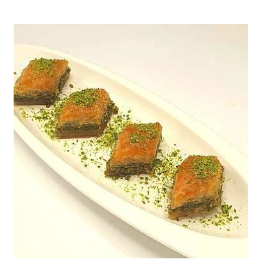
DO3 - Pistachio Baklava

Traditional Turkish desert made by layers of fillo pastry filled with pistachio and syrup