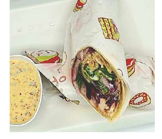
M08 - Doner Chicken Wrap

Marinated slices of chicken thigh seasoned with spices wrapped with green salad, tomato, onion with garlic yogurt sauce