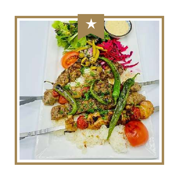
M17 - Mix Grilled Kebab Platter (good for 2 person)

1 skewer lamb chunks, 1 skewer chicken skewer, 1 skewer Adana kebab, 4 pcs lamb meatball, grilled chilli, grilled tomato served with Turkish butter rice under the meats...hmmm yummy