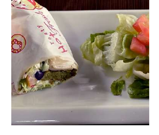
M01 - Falafel Roll

Homemade patty from fava beans wrapped with green salad, tomato, onion with extra virgin olive oil dressing