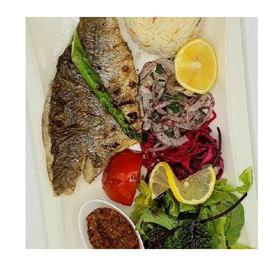
M23 - Grilled Sea Bass

Grilled Sea bass marinated with extra virgin olive oil and lemon juice served with green salad, tomato and onion