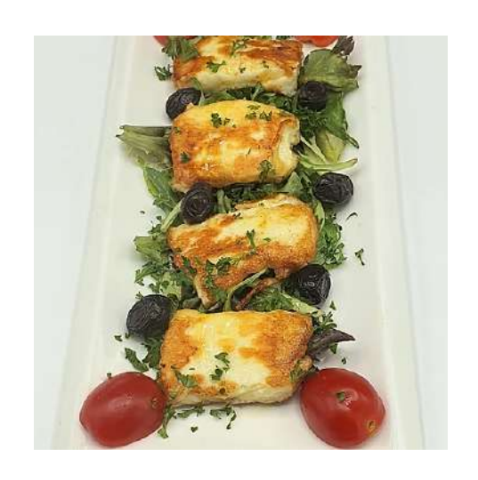
A12 - Grilled Hallumi Cheese

Halloumi is a Cypriot cheese traditionally made from goat's and sheep's milk, or a mixture of the two.