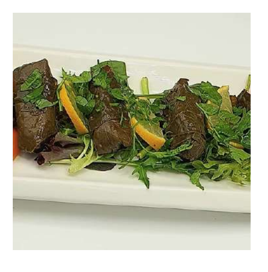
A05 Yaprak Sarma (Stuffed Wine Leaves)

A great vegetarian appetizer made from tender vine leaves wrapped into little rolls and stuffed with rice and fresh herbs