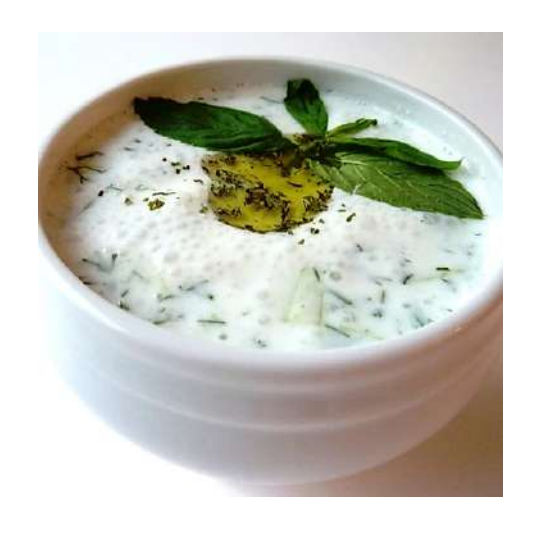
A08 - Cacik

Cacik, pronounced ja-jik is a Turkish yogurt and cucumber dish that's very common in almost all regions in Turkey