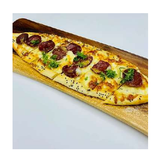
Sucuklu Pide (with beef pepperoni and mozzarella)

Boat-shaped flatbread baked with vegetable toppings cooked in stone oven