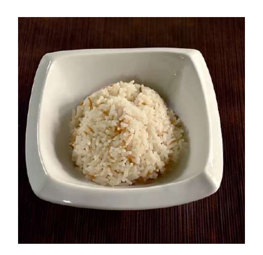
EO1 - Turkish Butter Rice