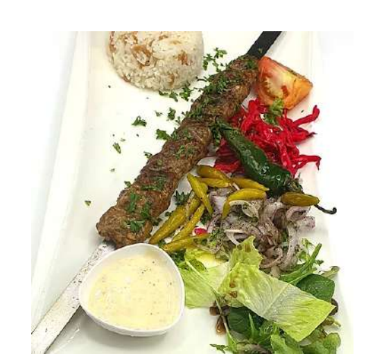
M10 - Adana Sish Kebab

Grilled skewer of ground lamb meat seasoned with aromatic spices served with Turkish butter rice and salad