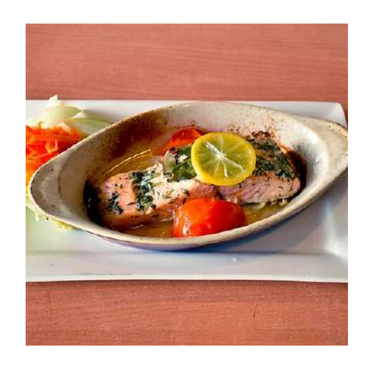
M02 - Baked Salmon

Marinated Salmon fillet with olive oil, onion, lemon and dill baked in oven