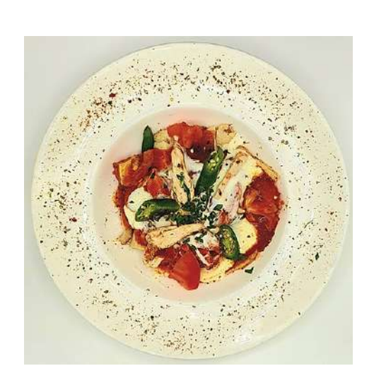
M16 - Chicken Kebab with Yogurt

Grilled chicken chunks on baked pita bread topped with butter and yogurt-tomato sauce.