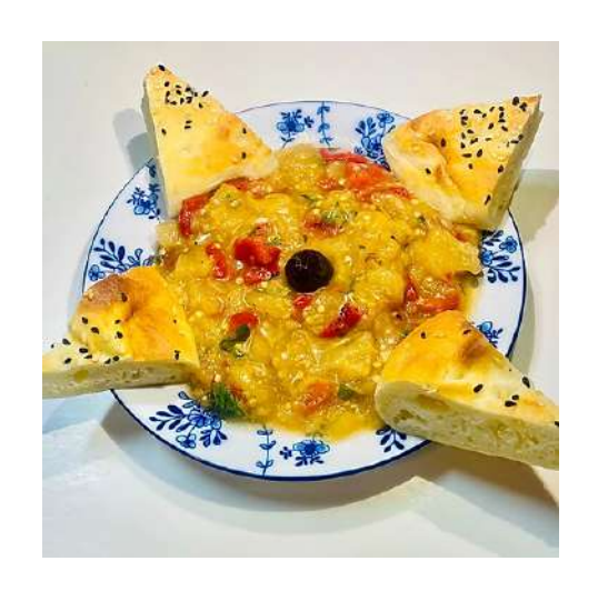
A03 Babagannush (Eggplant Dip)

Tasty vegan dish of roasted eggplant, garlic, extra virgin olive oil and lemon juice.