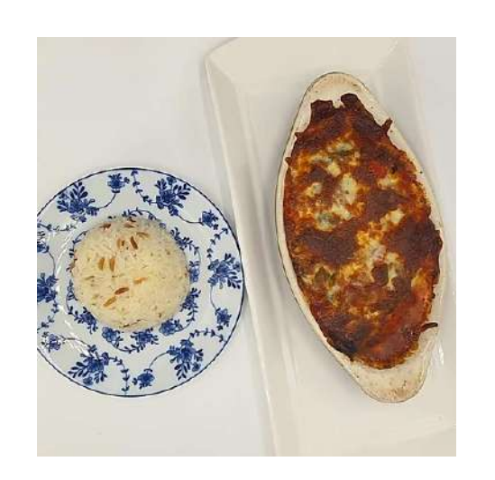
M13 - Musakka (Lamb or Veggie)

Based grilled eggplant with layers of ground lamb or veggies topped with tomato, chilli pepper and a cream-cheese sauce baked in oven.