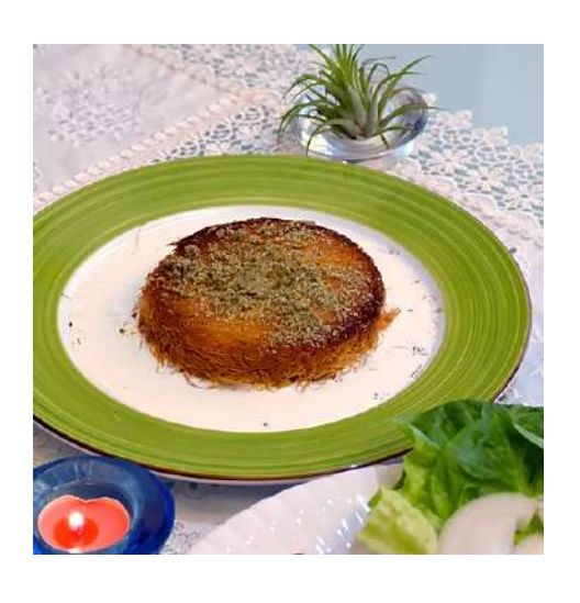
D01 - Kunefe

Also known as a slice of heaven. Kunefe is a pastry with unsalted cheese and syrup topped with pistachio surrounded by milk cream