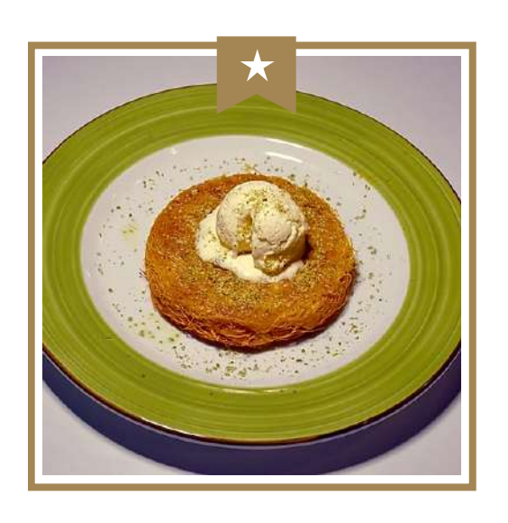
D002 - Kunefe with Ice Cream

Kunefe is a pastry with unsalted cheese and syrup topped with Ice Cream and surrounded by milk cream topped pistachio