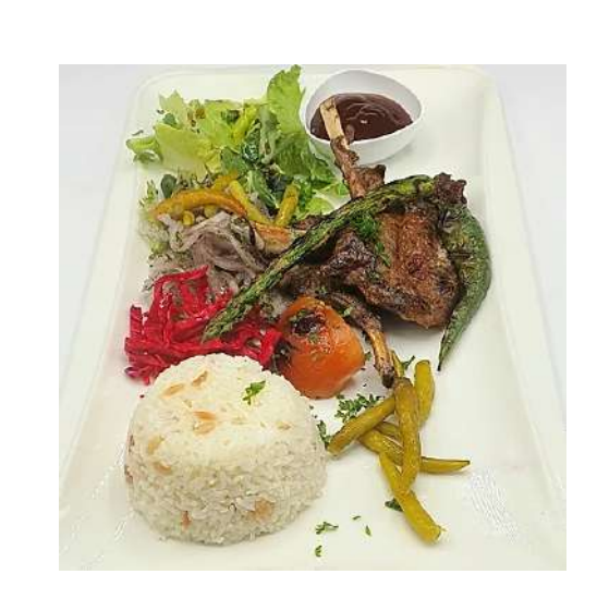
M22 - Lamb Chops

Hünkâr beğendi, (literally, 'the sultan liked it'), is an eggplant and lamb dish in Ottoman cuisine. It is made from eggplant grilled until the skin is burned, giving it a