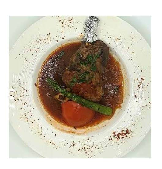
M21 - Lamb Shank

Lamb shank is a tough cut from the lamb leg that becomes tender and juicy with slow and low cooking.