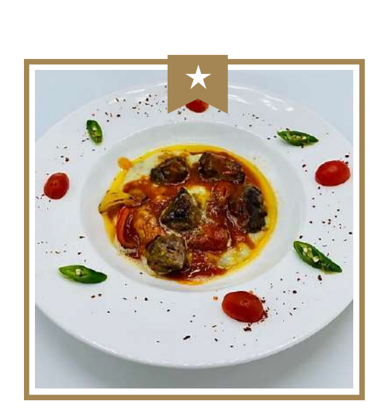
M06 - Hünkar Begendi (Sultan's Delight) (lamb or beef)

Hünkâr beğendi, (literally, 'the sultan liked it'), is an eggplant and lamb dish in Ottoman cuisine. It is made from eggplant grilled until the skin is burned, giving it a