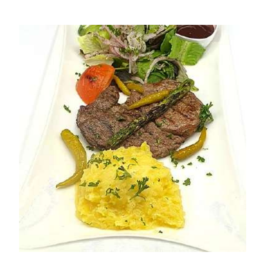
M19 - Ribeye Steak Premium Grass Fed 220 gr

220 gr Grilled Ribeye steak served with salad