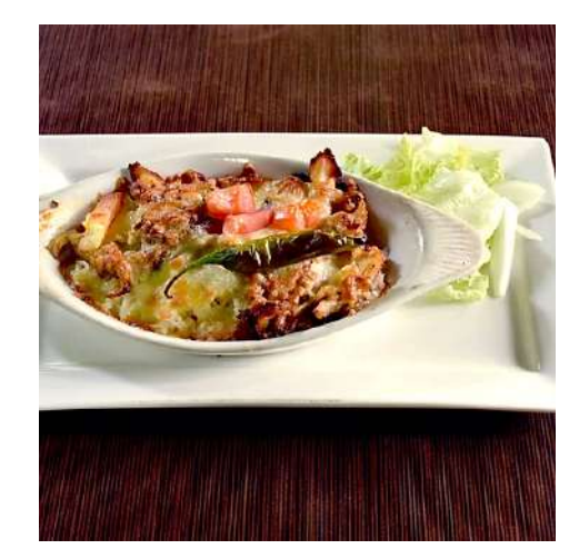
M12 - Baked Rice (Lamb or Chicken)

Baked rice topped with minced lamb or chicken topped with cheese and cream sauce