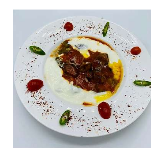
M14 - Ali Nazik

Ali Nazik kebab is a scrumptious Turkish specialty and one of our favourites. It is a delicious marriage of char-grilled smoked eggplant puree mixed with yoghurt and topped with tender lamb stew.