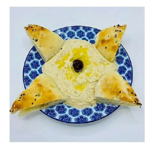
A04 - Hummus

Hummus is a Middle Eastern dip, spread, or savory dish made from cooked, mashed chickpeas blended with tahini, lemon juice, herbs and garlic. The standard garnish in the Middle East includes olive oil, a few whole chickpeas, parsley, and paprika. In Middle Eastern cuisine, it is usually eaten as a dip, with pita bread.