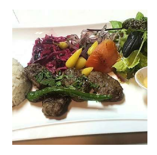
M07 - Izgara Kofte (Lamb Meatballs)

Grilled minced marinated lamb or beef meat with grilled chilli & tomato served with green salad