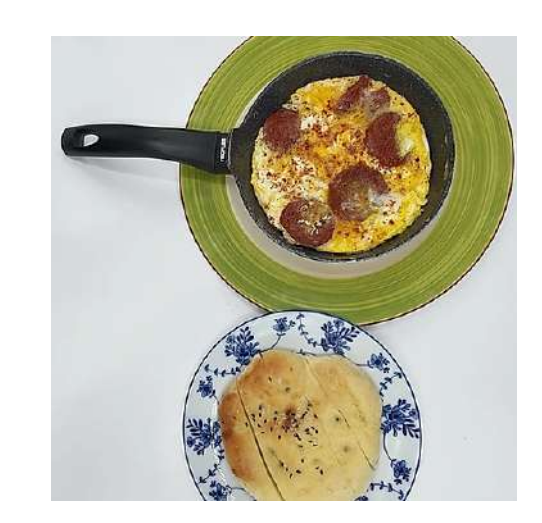
Sucuklu Yumurta (Beef Pepperoni with Eggs)

Sauteed Turkish style beef pepperoni with two eggs in pan.