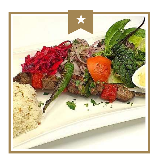
M04 - Grilled Lamb Shish Kebab with Salad

Pieces of marinated juicy lamb tenderloin cubes and vegetables grilled and served on skewers with Turkish butter rice and salad.