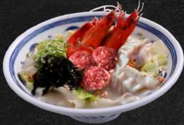
Signature 3 Treasure 시그니처 3 트레저

Kalguksu(Knife Noodle) / Sujebi(Flat Noodle) / Bap(Rice) (칼국수 / 수제미 / 밥)