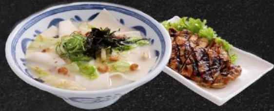
Grilled Chicken 닭고기 구이