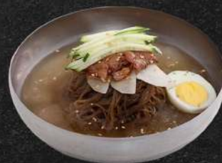
Chicken Cold Soup Buckwheat Noodles (Spicy/Non-spicy) 닭고기 물냉면