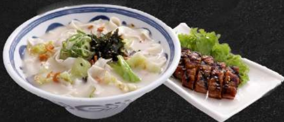
Grilled Pork Belly 삼겹살 구이