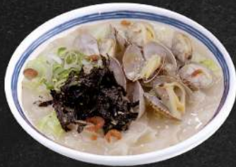
Flower Clam 바지락