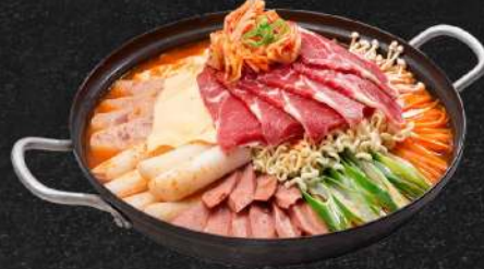
Black Pork Army Stew 흑돼지 부대찌개