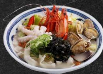
Mixed Seafood 해산물 모듬