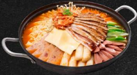
Waygu Beef Army Stew 와규 소고기 부대찌개

TOP UP CHEESE $3 | TOP UP RICE CAKE $4 | TOP UP NOODLE $3 | TOP UP FISHCAKE $4 TOP UP SPAM $4 | TOP UP SAUSAGE $4 | TOP UP ENOKI MUSHROOM $3 | TOP UP RICE $3