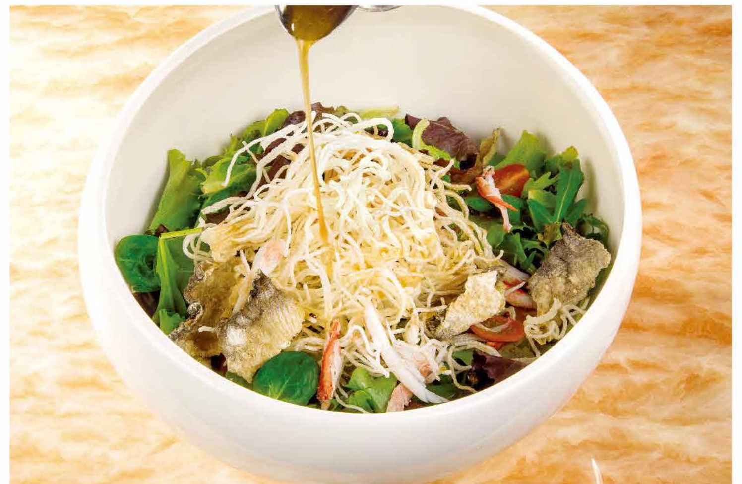
蟹柳野菜沙律 Vegetable Salad with Crab Meat & Crispy Fish Skin