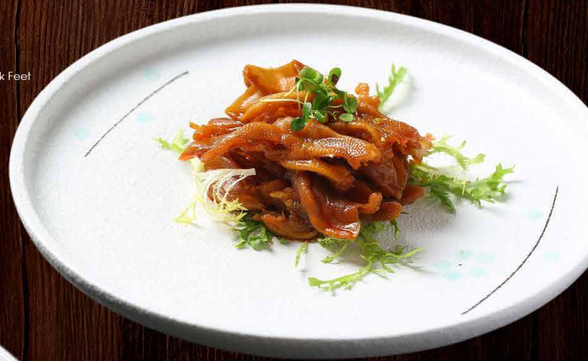
凉伴去骨鸭掌 Chilled Boneless Duck Feet in Thai Style $18/每份/Per Portion