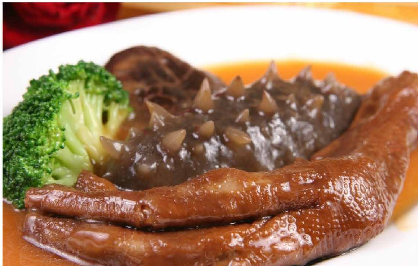
海参去骨鸭掌 Braised Sea Cucumber with Boneless Duck Feet