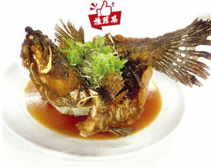
油浸鱼 Deep-fried Fish with Light Soya Sauce