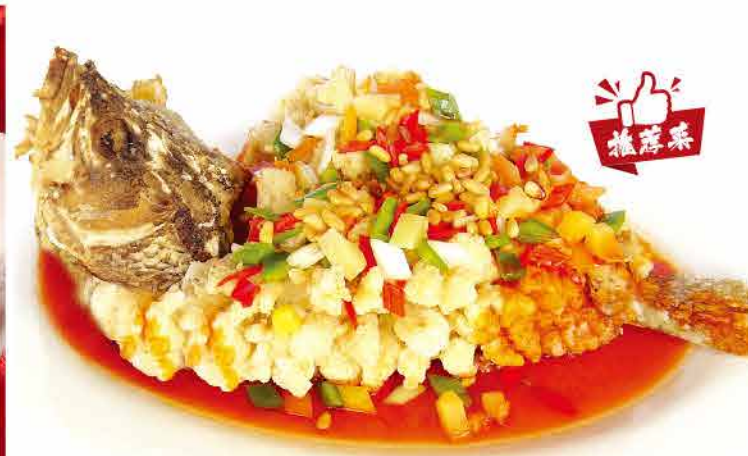
酸甜鱼 Deep-fried Sweet & Sour Fish