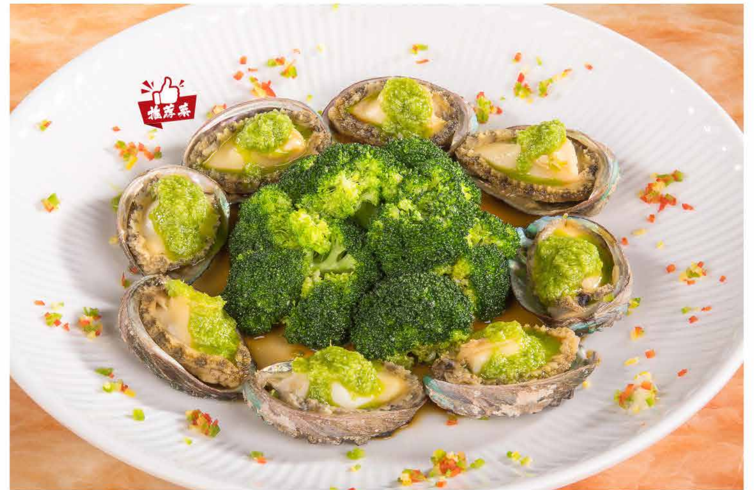
阿一姜葱茸蒸鲍鱼伴西兰花 Steamed Abalone with Minced Ginger & Spring Onion in Ah Yat Style