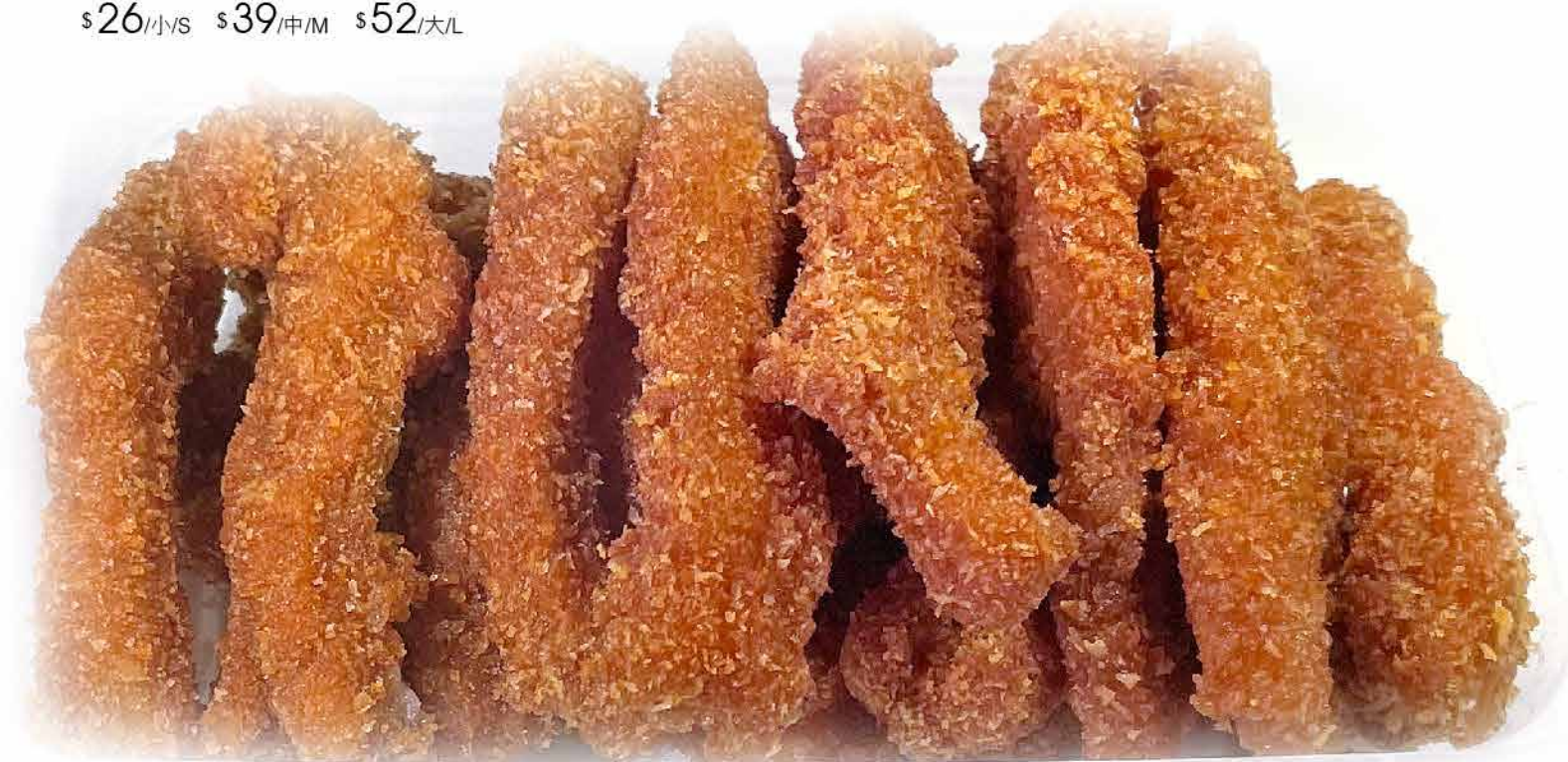
南乳脆香肉 Deep-fried Crispy Pork with "Nam Yu" $26/小/S $39/中/M $52/大/L