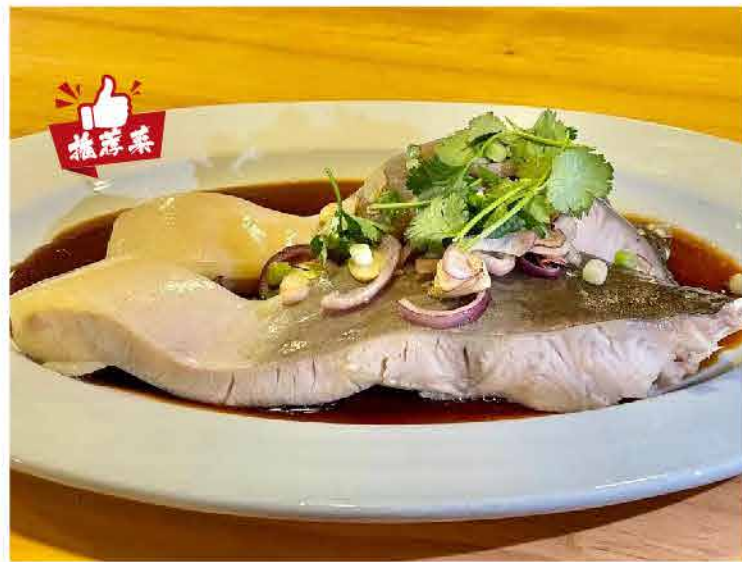
清蒸白巴丁鱼 Steamed White Gold Pa-Tin Fish in Hong Kong Style