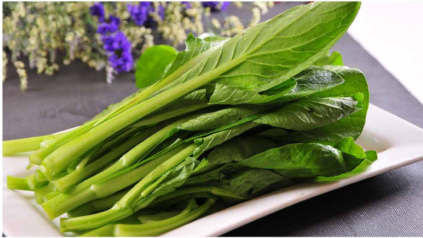
香港菜心 Hong Kong "Choy Sum" $20/小/S $30/中/M $40/大/L