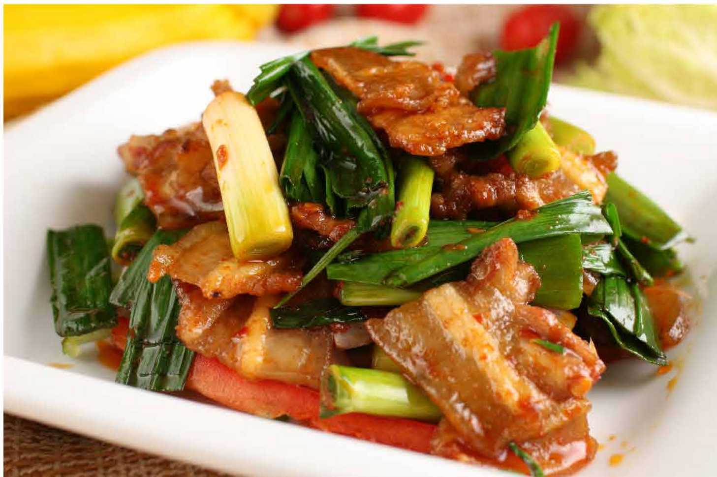
回锅肉 Wok-fried Sliced Pork with Chilli & Spring Onion in "Sze Chuan" Style $22/小/S $33/中/M $44/大/L