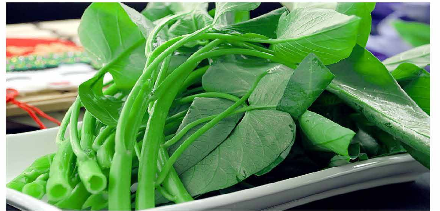
空心菜 Kang Kong $20/小/S $30/中/M $40/大/L