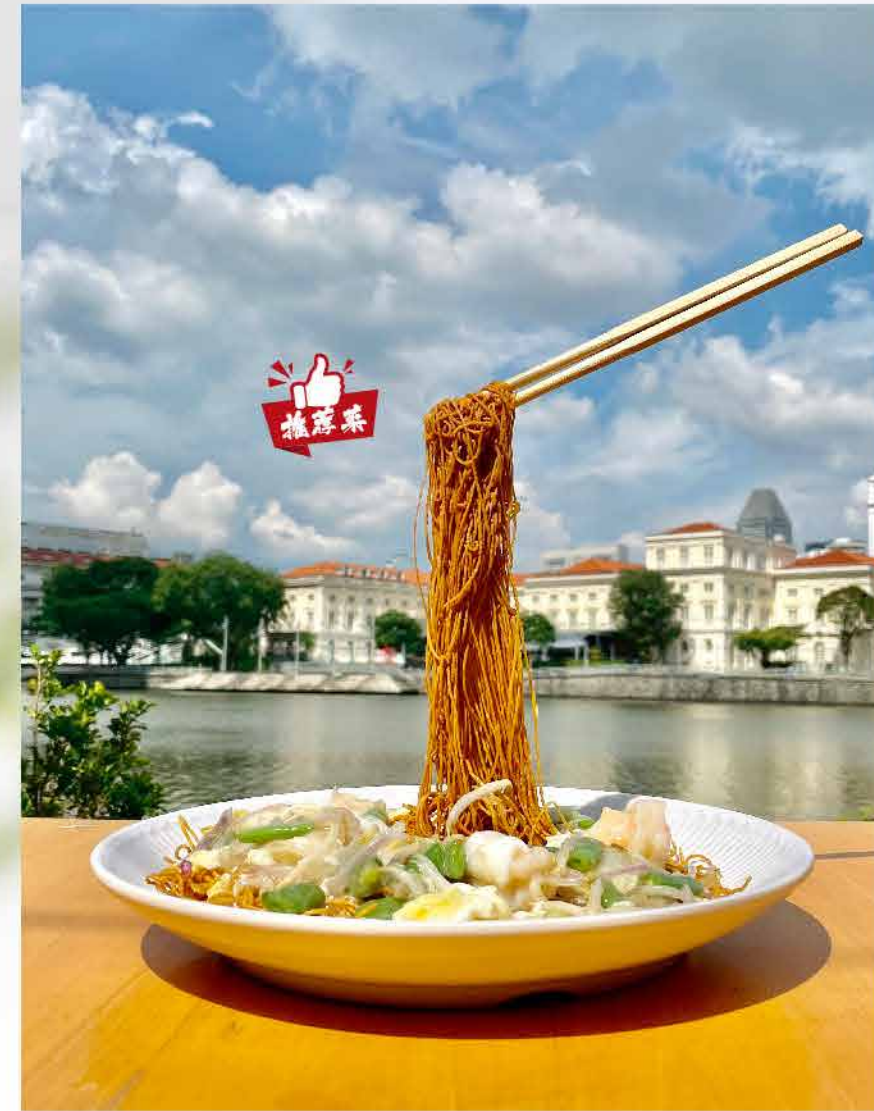
首创海鲜飞天麵 Original Signature Dish: Crispy Flying Noodles with Seafood $28/小/S $42/中/M $56/大/L