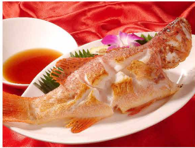
烧烤鱼 BBQ Fish