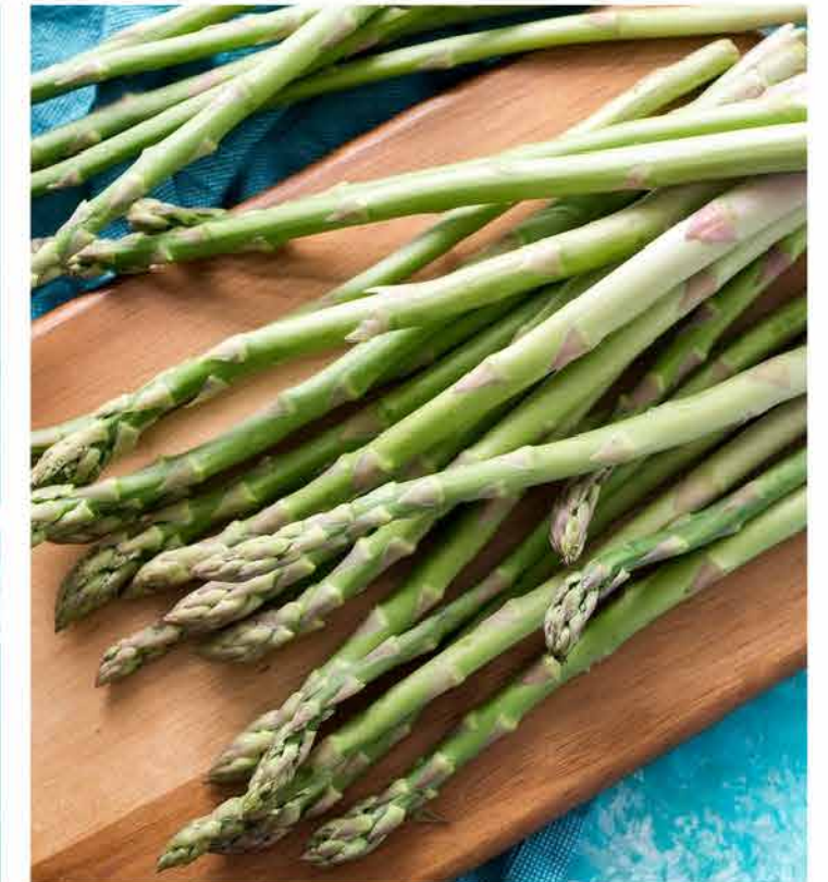
鲜芦笋 Asparagus $20/小/S $30/中/M $40/大/L