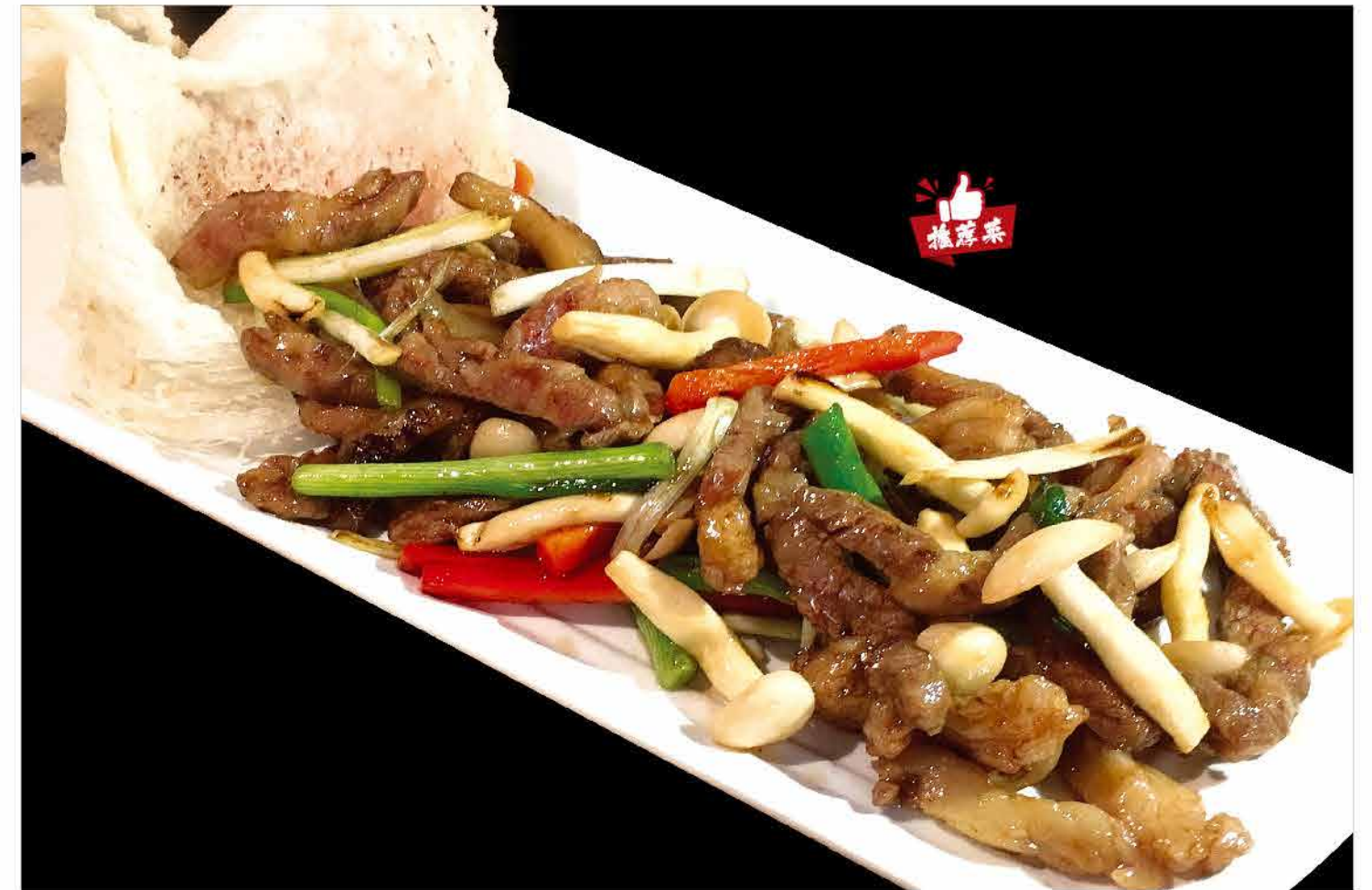
野菌炒美国顶级黑尾牛肉 Stir-fried US Black Tail's Beef with Wild Mushrooms $38/小/S $57/中/M $76/大/L