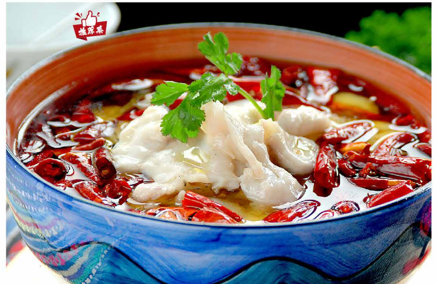
水煮鱼片 Poached Sliced Fish with Chilli in "Sze Chuan" Style $28/小/S $42/中/M $56/大/L