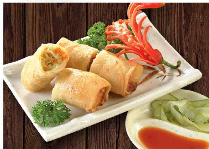
酥炸春卷 Deep-fried Spring Rolls