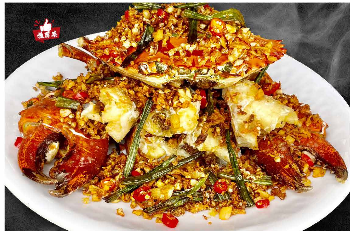
避风塘桥底辣蟹 Fried Spicy Crab in Authentic "Bi Feng Tang" Style