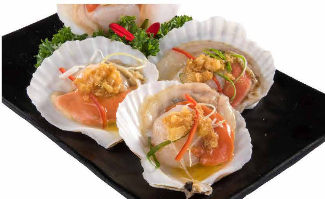
扇贝 Fan Scallops