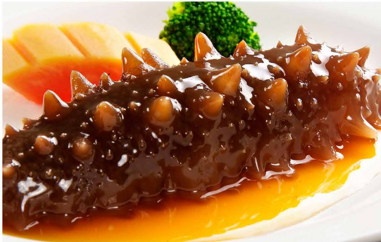
原条葱烧海参 Braised Sea Cucumber with Spring Onion