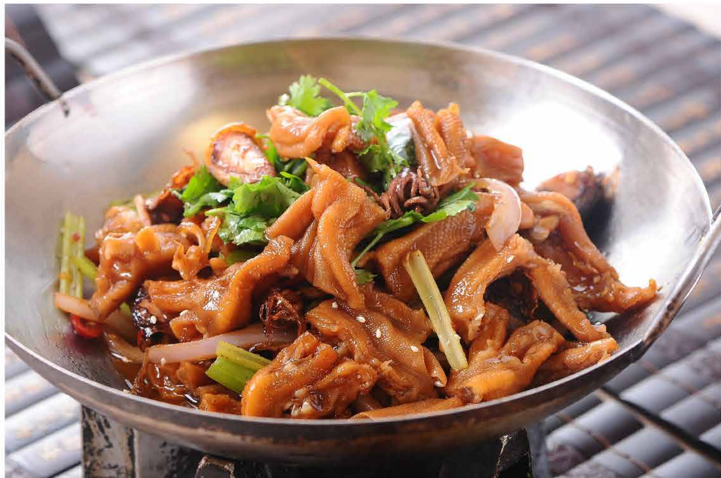
蒜子豆根焖去骨鸭掌 Braised Boneless Duck Feet with Bean Dough $38/小/S $57/中/M $76/大/L