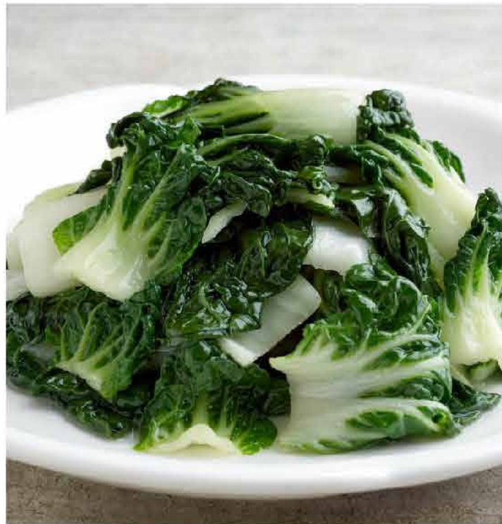
香港白菜苗 Hong Kong Baby Cabbage $20/小/S $30/中/M $40/大/L