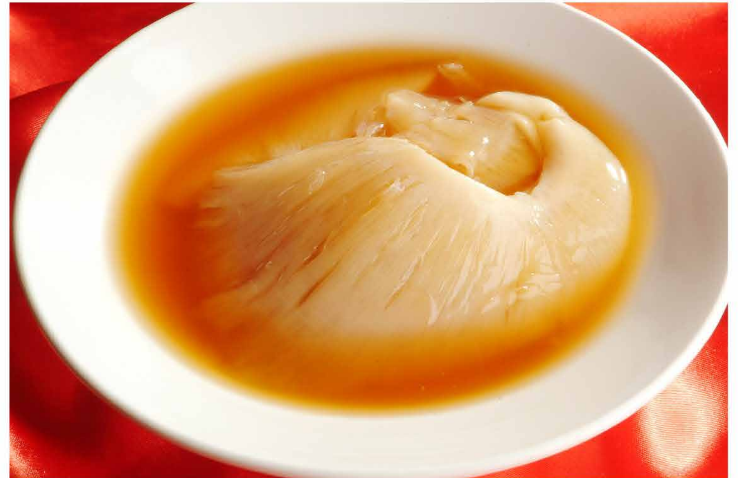
红烧大鲍翅 Braised Superior Shark's Fin $88/每位/Per Person