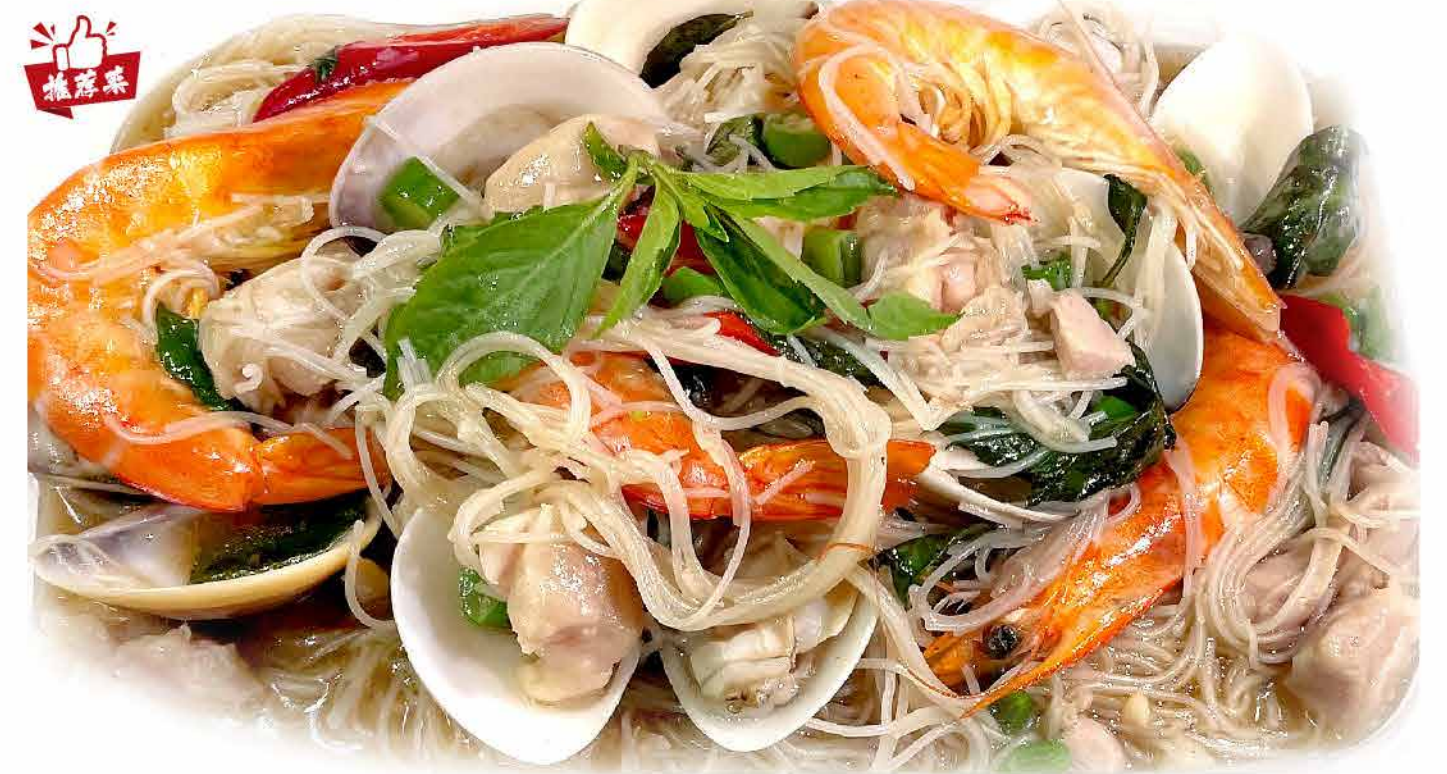
招牌紫苏海鲜焖米粉 Braised Seafood Bee Hoon with Basil Leaf $20/小/S $30/中/M $40/大/L