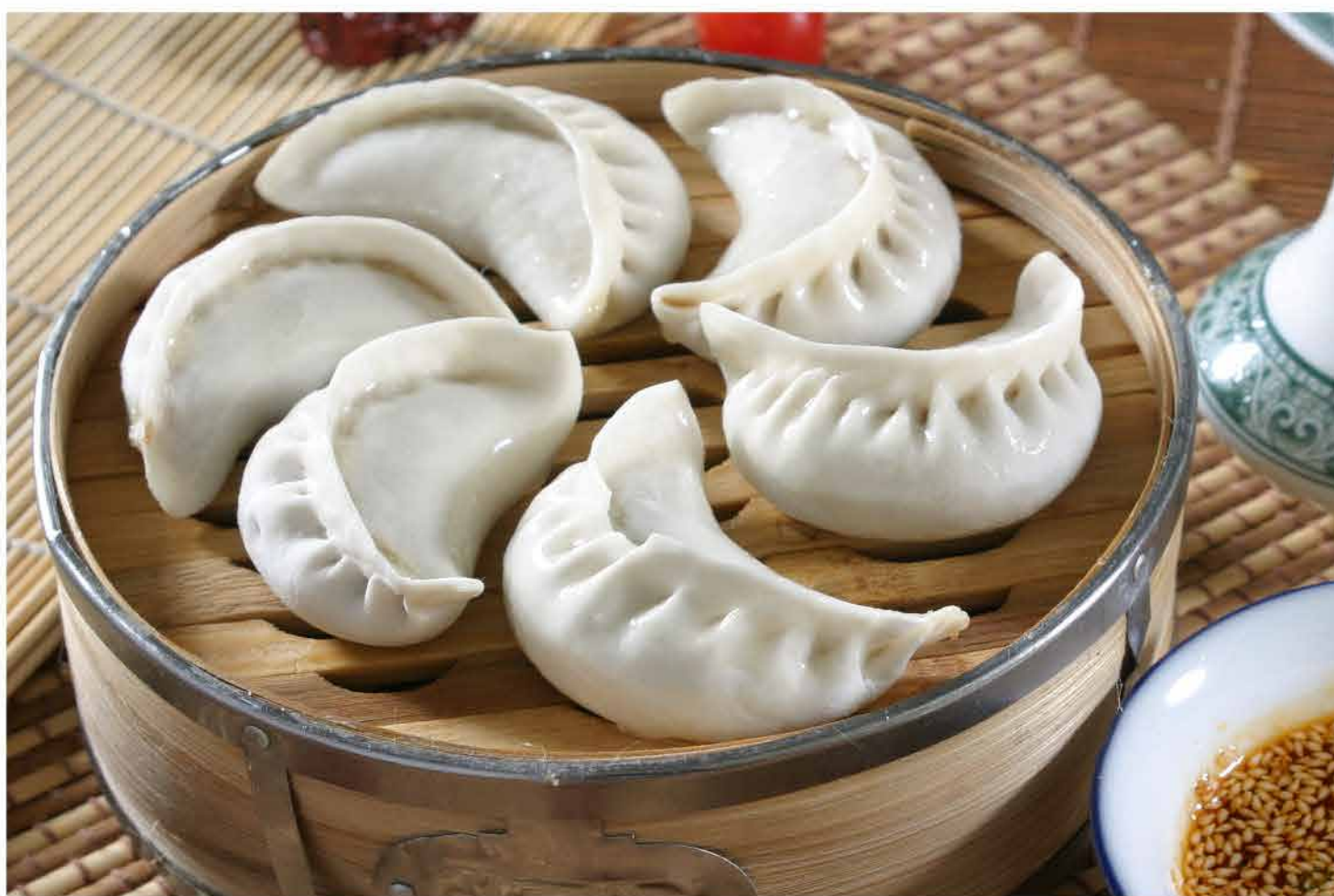
四川蒸饺子 Steamed "Sze Chuan" Dumplings $16/小/S $24/中/M $32/大/L