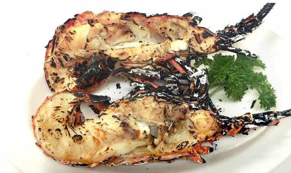
烧烤龙虾 BBQ Lobster 时价 Seasonal Price