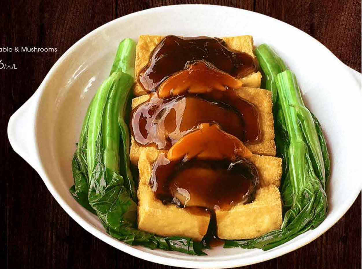
红烧豆腐 Braised Beancurd with Vegetable & Mushrooms $18/小/S $27/中/M $36/大/L