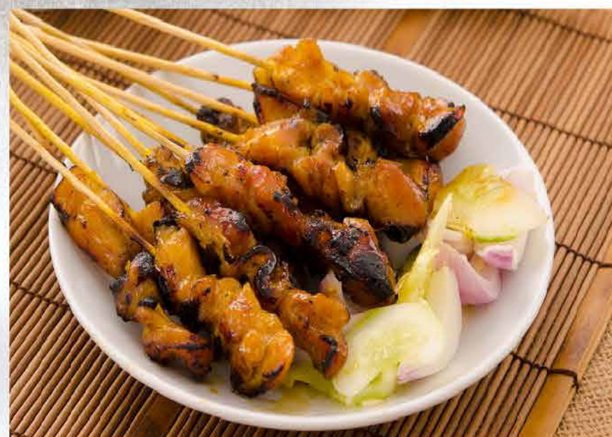
鸡牛沙爹 Chicken & Beef Satay