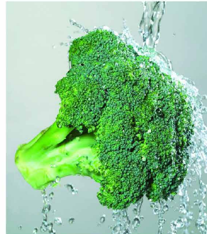
西兰花 Broccoli $20/小/S $30/中/M $40/大/L