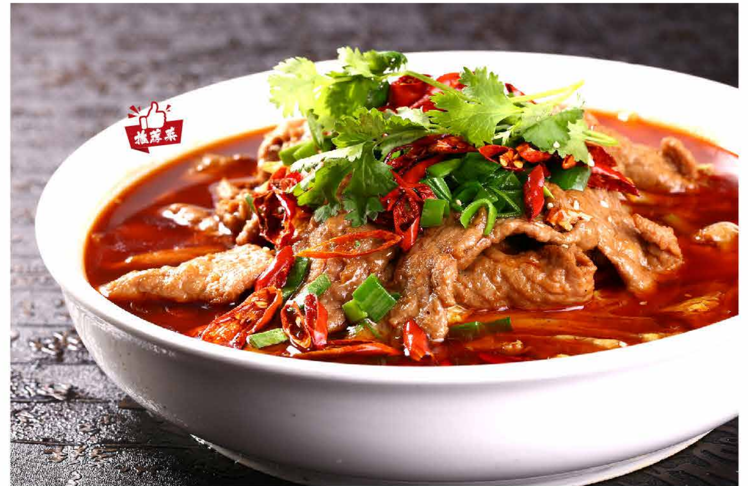
水煮牛肉 Poached Sliced Beef with Chilli in "Sze Chuan" Style $28/小/S $42/中/M $56/大/L