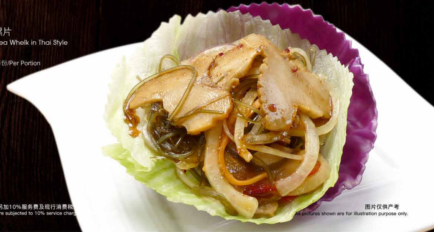
生捞螺片 Sliced Sea Whelk in Thai Style $28/每份/Per Portion

所有售价另加10%服务费及现行消费税 All prices are subjected to 10% service charge & prevailing GST.