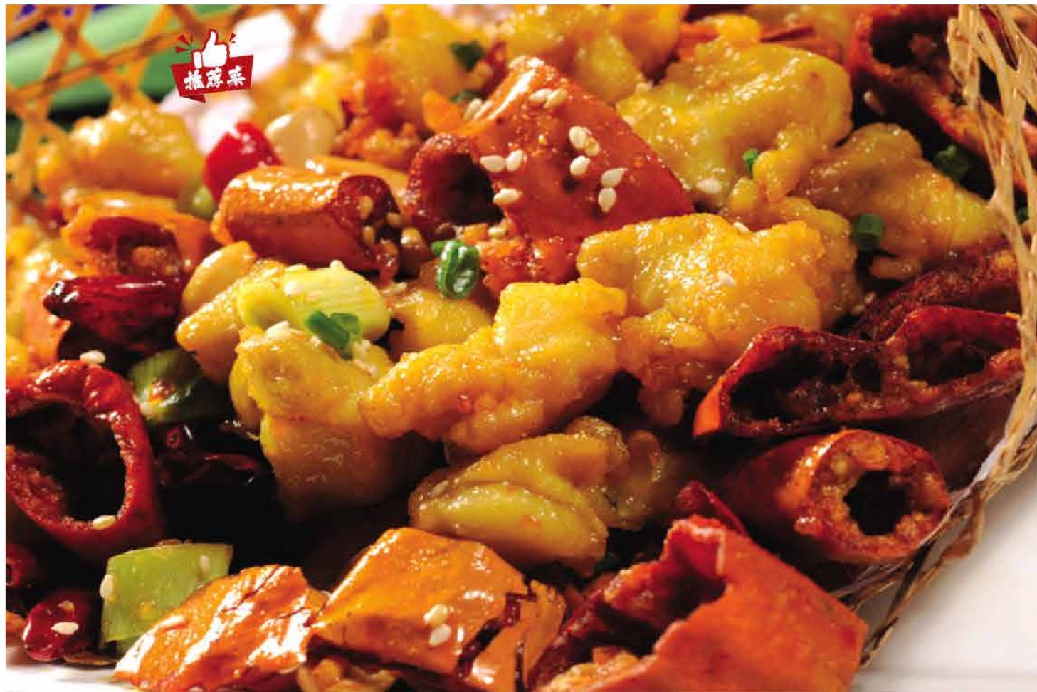
辣子鸡 Fried Diced Chicken with Dried Chilli $22/小/S $33/中/M $44/大/L