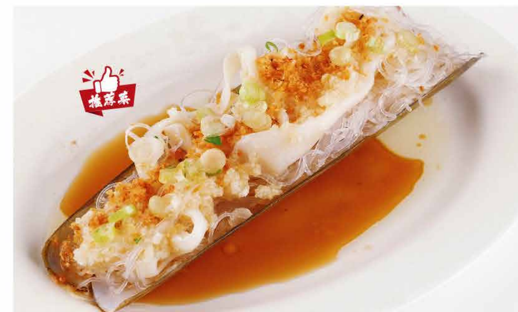
金银蒜蒸竹节蚌 Steamed Bamboo Clam with Minced Garlic