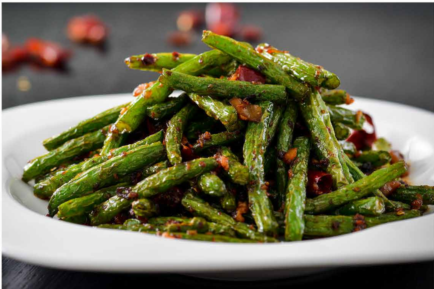
干煸四季豆 Fried Green Beans with Minced Pork & Dried Chilli $18/小/S $27/中/M $36/大/L