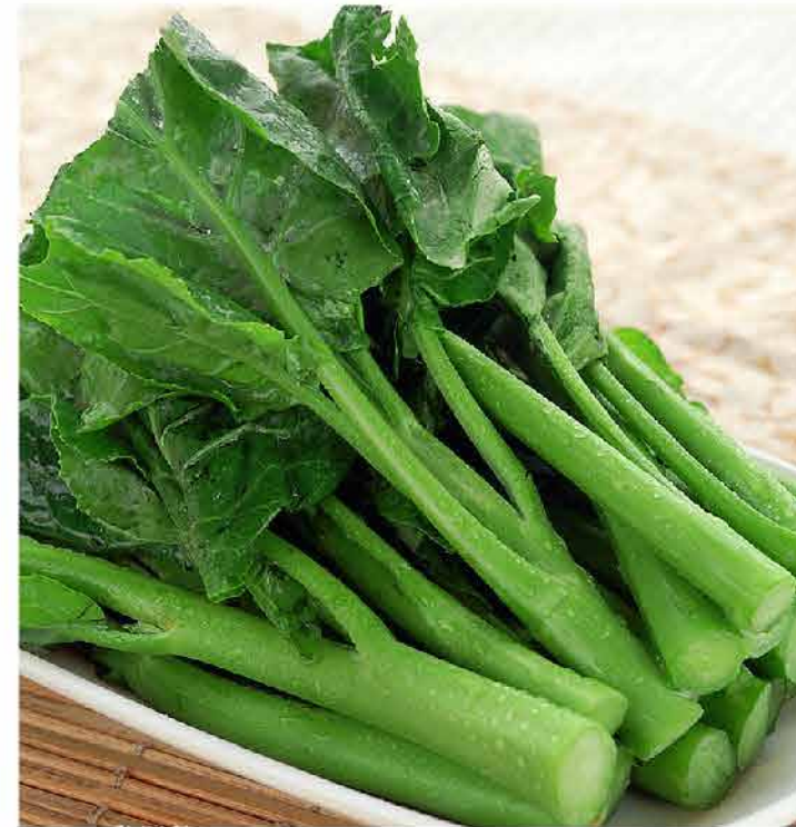
芥兰仔 Baby Kai Lan $20/小/S $30/中/M $40/大/L