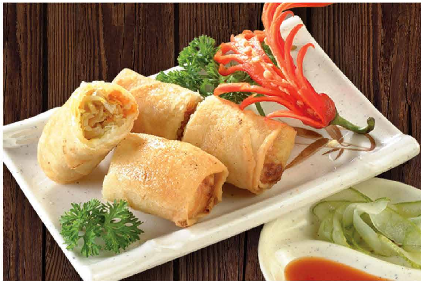
素春卷 Deep-fried Vegetarian Spring Rolls $16/小/S $24/中/M $32/大/L