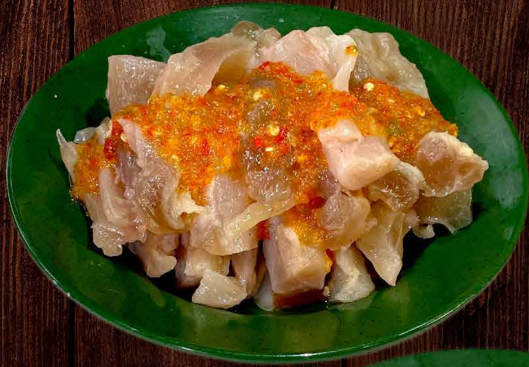
秘制蹄筋 Secret Ingredient Beef Tendon $10/每份/Per Portion