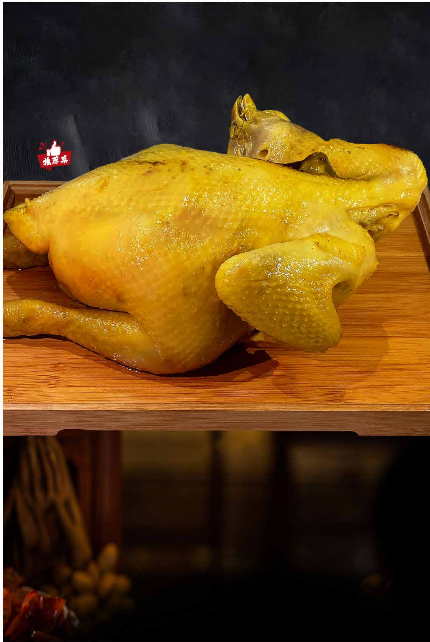
正宗香港盐焗沙姜鸡 (每只至少1.6公斤或以上) Authentic Hong Kong Salt-baked Chicken with Ginger Powder (Approx. 1.6Kg or Above)