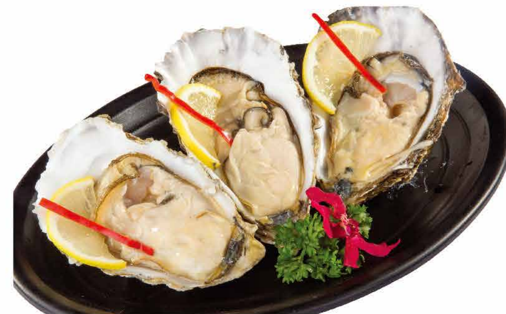
生蚝 Live Oysters