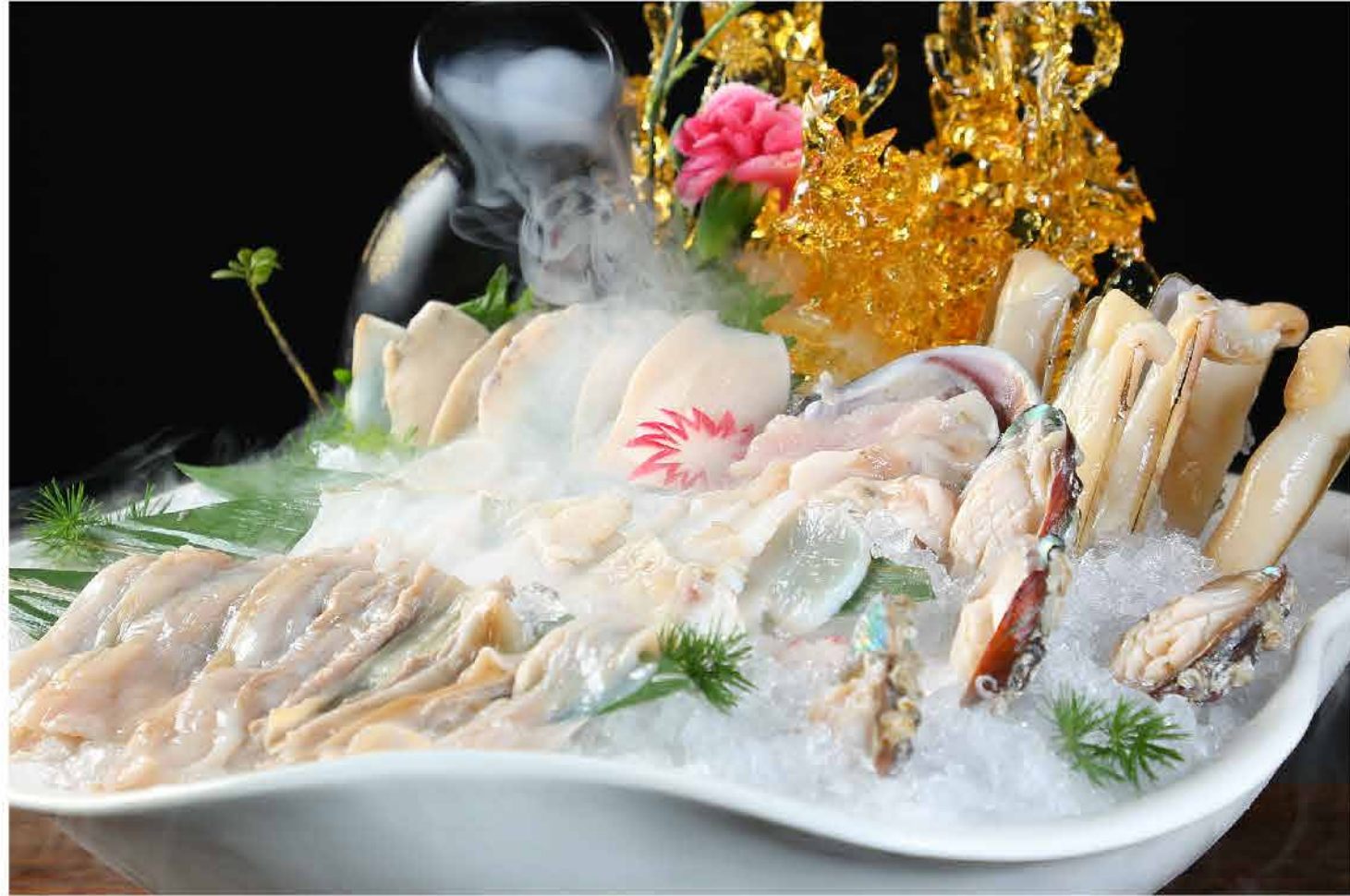
烧烤各类海鲜 BBQ All Type of Seafood 时价 Seasonal Price