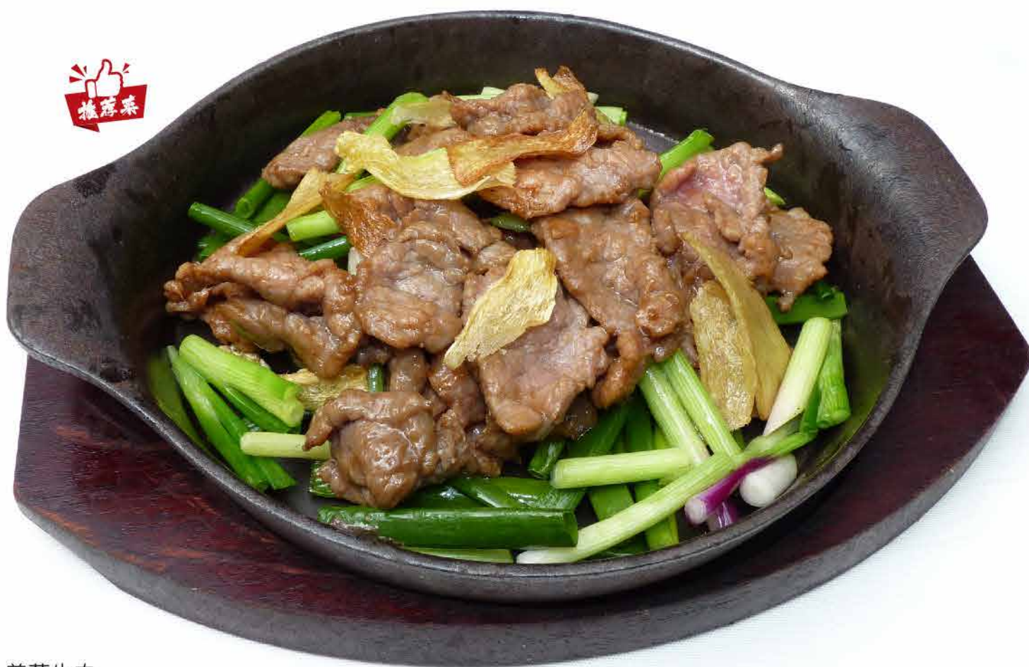
姜葱牛肉 Sauteed Sliced Beef with Ginger & Spring Onion $28/小/S $42/中/M $56/大/L