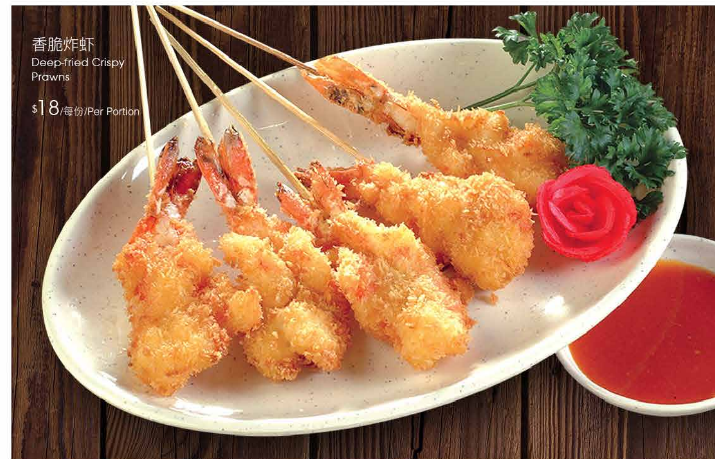
香脆炸虾 Deep-fried Crispy Prawns