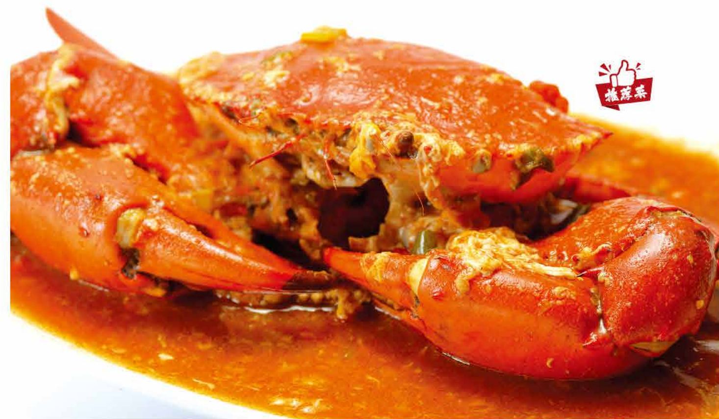
辣椒斯里兰卡螃蟹 Chilli Sri Lankan Crab