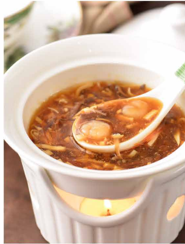
四川酸辣汤 Hot & Sour Soup in "Sze Chuan" Style $12/每位/Per Person