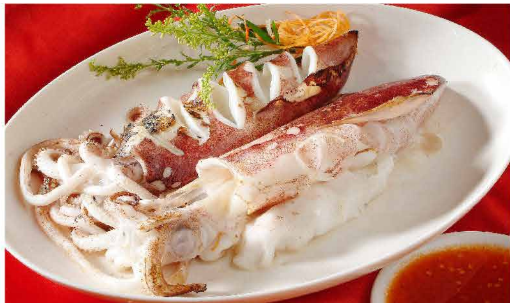
烧烤苏东 BBQ Sotong $38/每只/Each