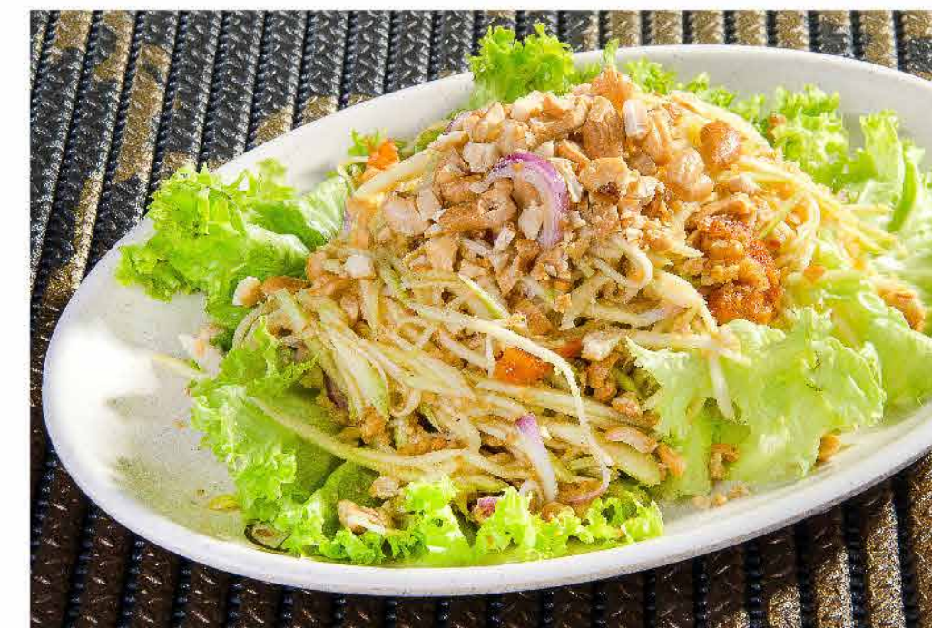
泰式芒果沙律 Green Mango Salad in Thai Style