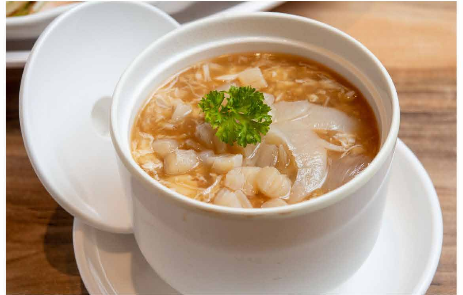
黄焖玉带蟹肉翅 Braised Superior Shark's Fin with Scallops $48/每位/Per Person