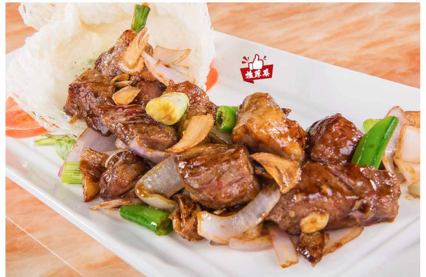
蒜香美国黑尾牛粒 Fried US Black Tail's Beef with Garlic & Onion