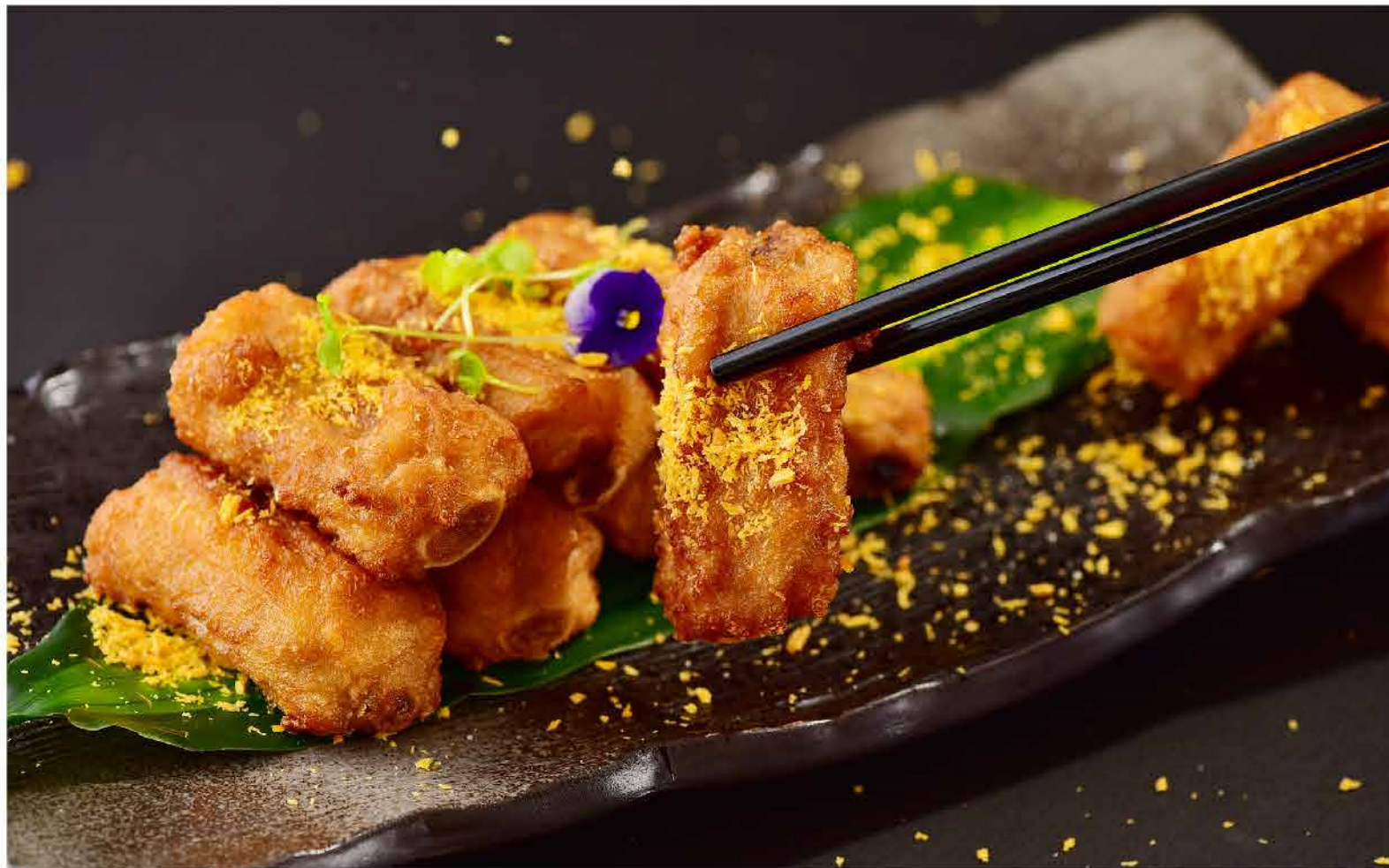
蒜香排骨 Pan-fried Pork Rib with Minced Garlic $28/小/S $42/中/M $56/大/L