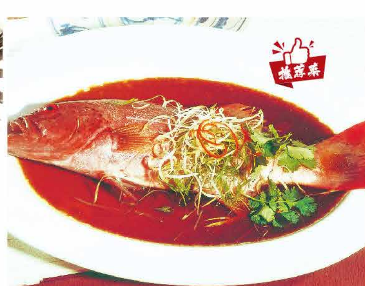
港蒸鱼 Steamed Fish in Hong Kong Style