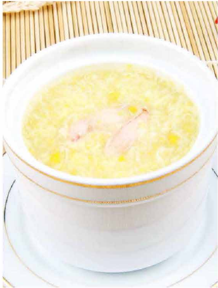
蟹肉粟米羹 Sweet Corn Thick Soup with Crab Meat $12/每位/Per Person