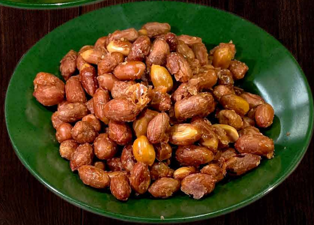
南乳花生 Roasted Peanuts with Nam Yu $6/每份/Per Portion