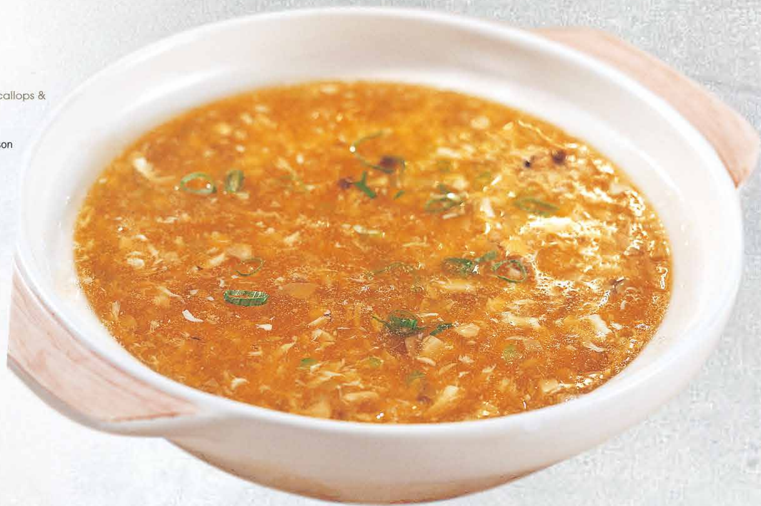
龙皇带子羹 Thick Soup with Scallops & Minced Seafood $18/每位/Per Person