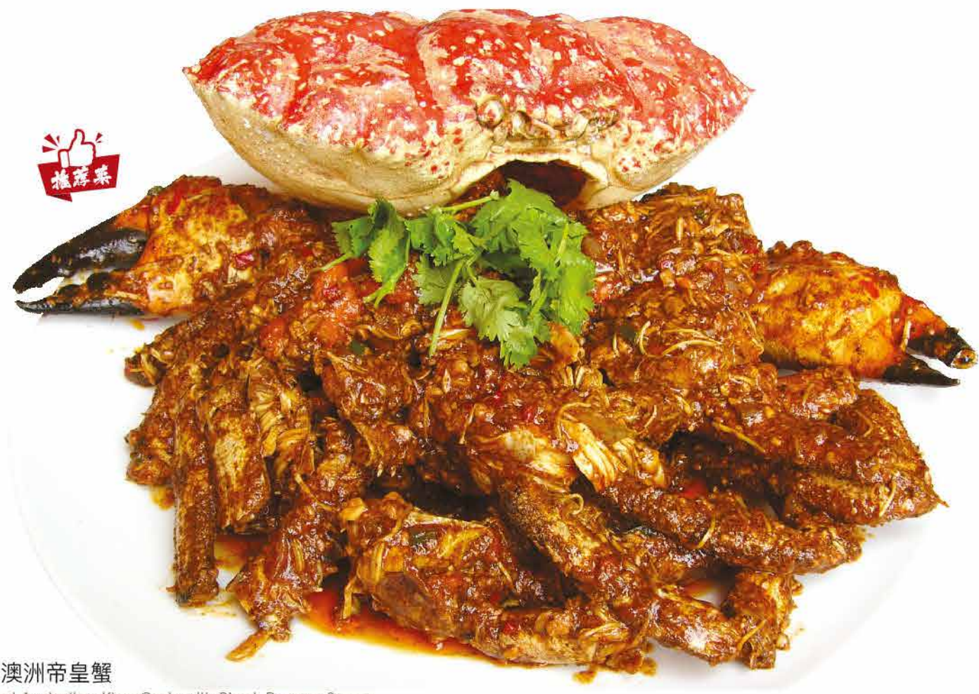
黑椒澳洲帝皇蟹 Stir-fried Australian King Crab with Black Pepper Sauce