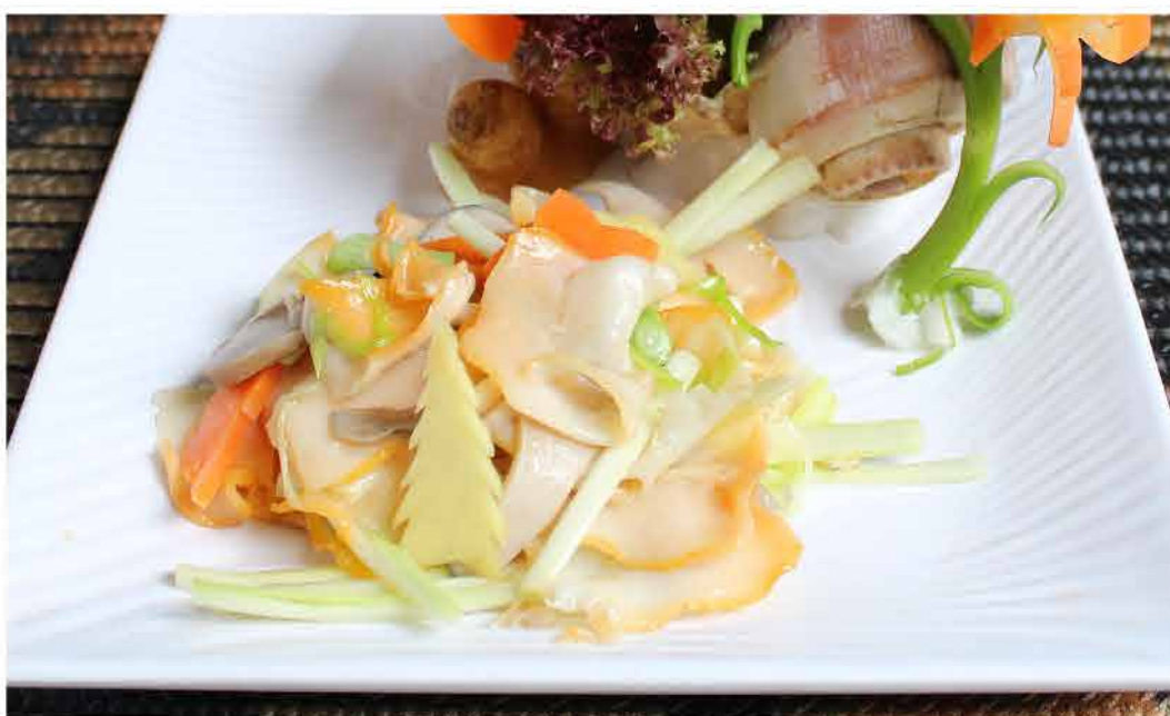
油泡响螺 Stir-fried Sea Whelk