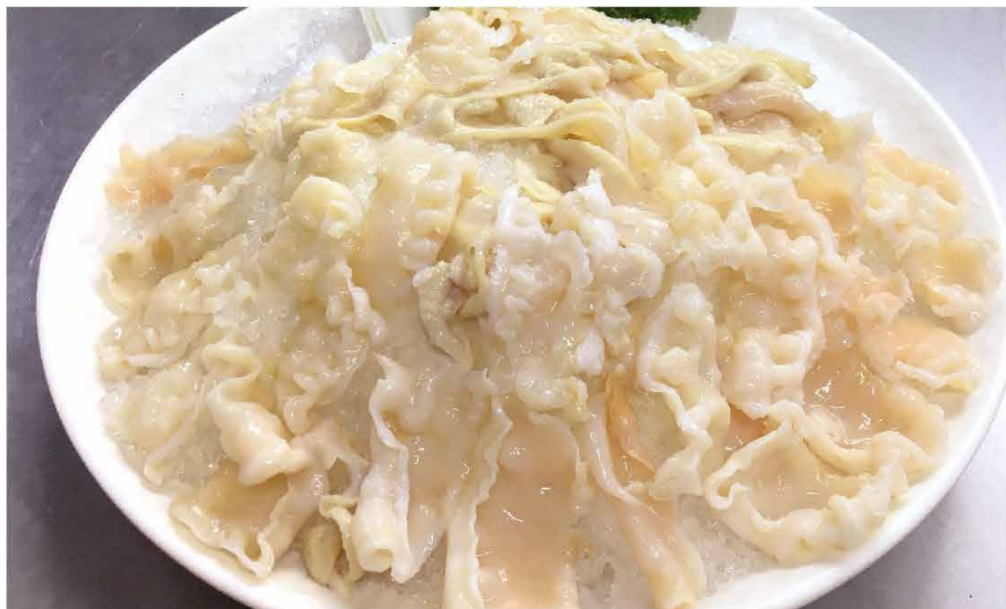
象拔蚌刺身 Geoduck Clam Sashimi