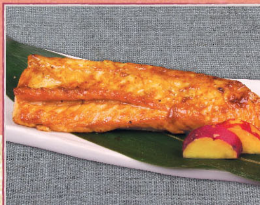
SALMON BELLY SET..... $24.80 SHIOYAKI / TERIYAKI

Grilled chicken glazed with sweet soy sauce served with choice of 3 mini side dishes, miso soup, and a drink