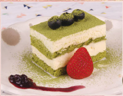
MATCHA TIRAMISU ..... $7.80 抹茶ティラミス

Hokkaido imported soft crepe layered with chocolate milk cream