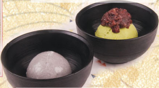
KUROGOMA ICE CREAM..... $4.80 黒胡麻アイスクリーム

Rich milky ice cream with a divine aroma of Japanese green tea topped with red bean paste