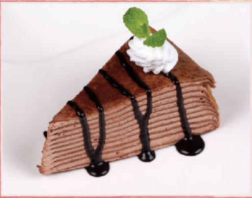
HOKKAIDO CHOCOLATE..... $7.80 MILLE CREPE 北海道チョコレートミルクレープ

Hokkaido imported soft crepe layered with strawberry milk cream and served with vanilla ice cream