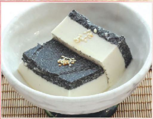
KUROGOMA PUDDING ..... $5.80 黒胡麻プリン

Delicious union of rich black sesame paste and silky milk pudding