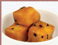
DAIGAKU IMO 大学芋 Glazed sweet potatoes