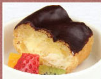
CHOCOLATE ECLAIR チョコレートエクレア