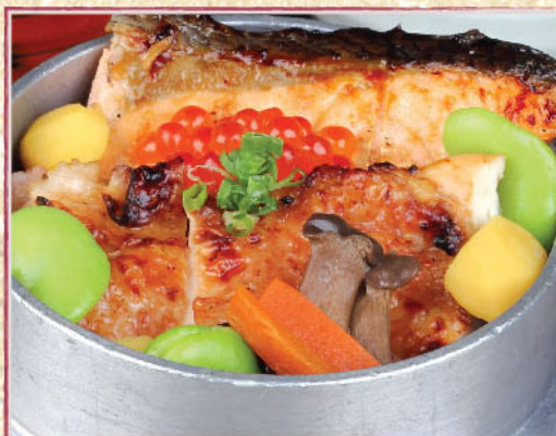
SALMON & TORI KAMAMESHI SET... $21.80 鮭と鶏の照り焼き釜飯セット

Sauteed sliced beef topped with soft boiled egg served in iron pot with flavoured steamed rice. Set includes choice of 3 mini side dishes, miso soup, and a drink