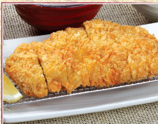
US KUROBUTA TONKATSU SET..... $24.80 US黒豚とんかつセット

Flame-seared seafood mix of diced salmon, scallop, prawn and grilled eel served in iron pot with flavoured steamed rice. Set includes choice of 3 mini side dishes, miso soup, and a drink