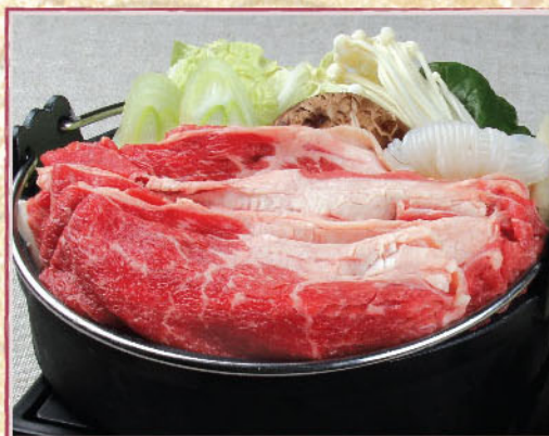
BEEF SUKIYAKI SET ..... $24.80 すき焼きセット

US Berkshire pork cutlet served with choice of 3 mini side dishes, miso soup, and a drink