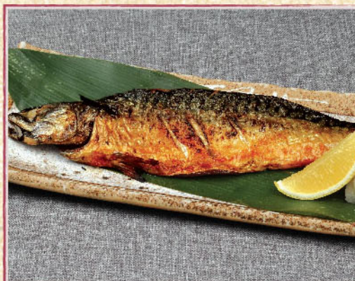
SABA SHIOYAKI SET ..... $21.80 鯖塩焼きセット

Grilled salmon and chicken thigh with sweet soy sauce served in iron pot with flavoured steamed rice. Set includes choice of 3 mini side dishes, miso soup, and a drink