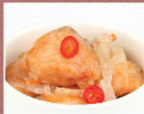
SALMON NANBANZUKE サーモン南蛮漬け Fried salmon in vinegar