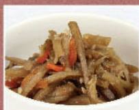
KINPIRA GOBO さんぴら牛蒡 Braised burdock root and carrot