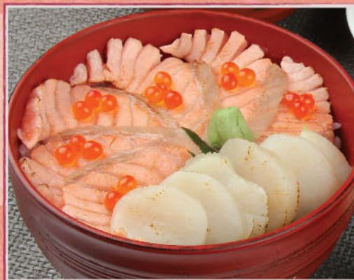
ABURI SALMON HOTATE DON SET.. $24.80 炙りサーモンとホタテ丼セット

Flame-seared sliced salmon and scallops served on Japanese rice, with choice of 3 mini side dishes, miso soup, and a drink