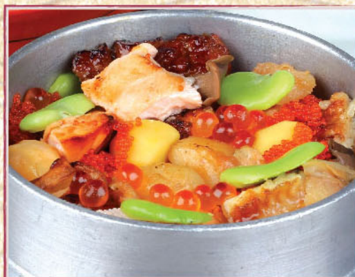
ABURI KAISEN CHIRASHI ..... $25.80 KAMAMESHI SET 炙り海鮮ちらし釜飯セット

Deep fried battered prawns and vegetables served on rice, with choice of 3 mini side dishes, miso soup, and a drink