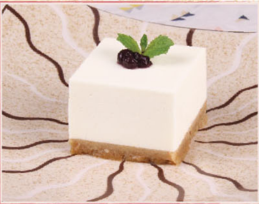
SUN'S TOFU CHEESE CAKE ..... $6.80 豆腐チーズケーキ

Hot Favourite! SUN's tofu cheese cake, green tea ice cream and black sesame pudding combo