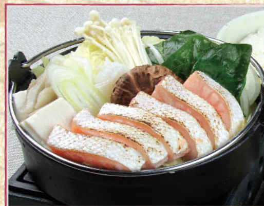
ABURI SALMON BELLY ..... $25.80 SUKIYAKI SET 炙りサーモンハラスすき焼きセット

Sliced beef and vegetables in sweet broth hotpot. Set includes choice of 3 mini side dishes, miso soup, and a drink