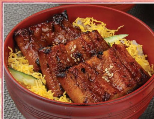
UNA DON SET..... $25.80 うな丼セット

Grilled salmon belly with salt or sweet soy sauce served with choice of 3 mini side dishes, miso soup, and a drink