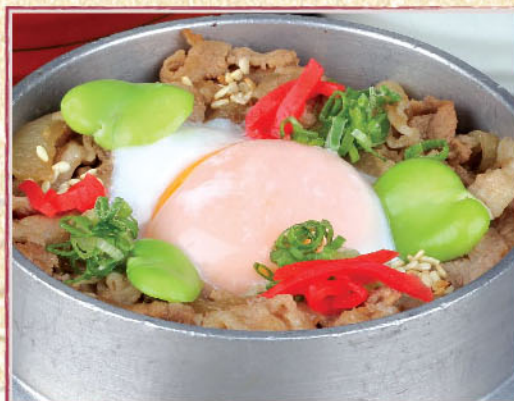
YAKINIKU KAMAMESHI SET..... $20.80 牛焼き肉玉子釜飯セット

Grilled eel with sweet soy sauce served on rice, with choice of 3 mini side dishes, miso soup, and a drink