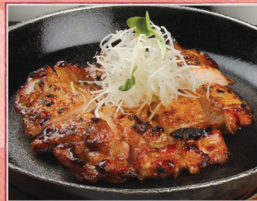
CHICKEN TERIYAKI SET..... $18.80 チキン照焼きセット

Flame-seared sliced salmon and scallops served on Japanese rice, with choice of 3 mini side dishes, miso soup, and a drink