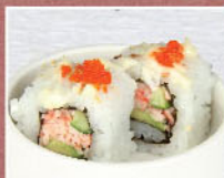
CALIFORNIA ROLL カリフォルニアロール Crab meat sushi roll