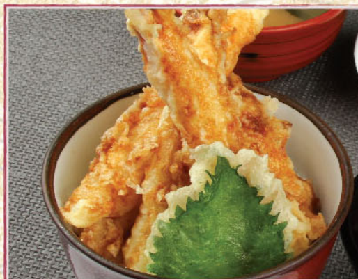
TENDON SET ..... $23.80 海老天丼セット

Grilled mackerel with salt served with choice of 3 mini side dishes, miso soup, and a drink