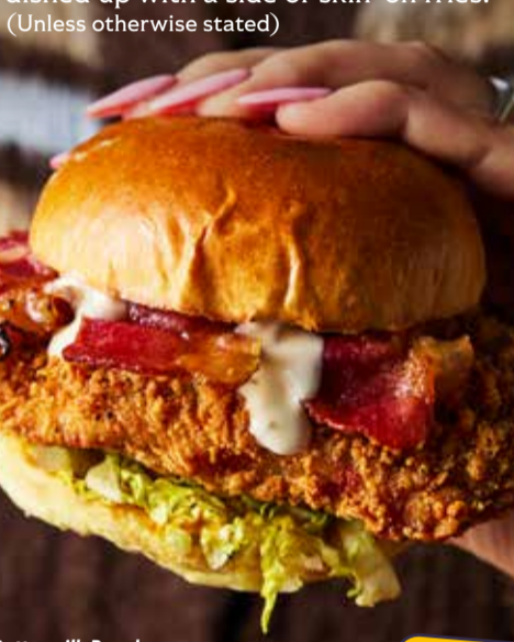
The Buttermilk Ranch

All served in a soft glazed bun with lettuce, onion and gherkin, dished up with a side of skin-on fries. (Unless otherwise stated)