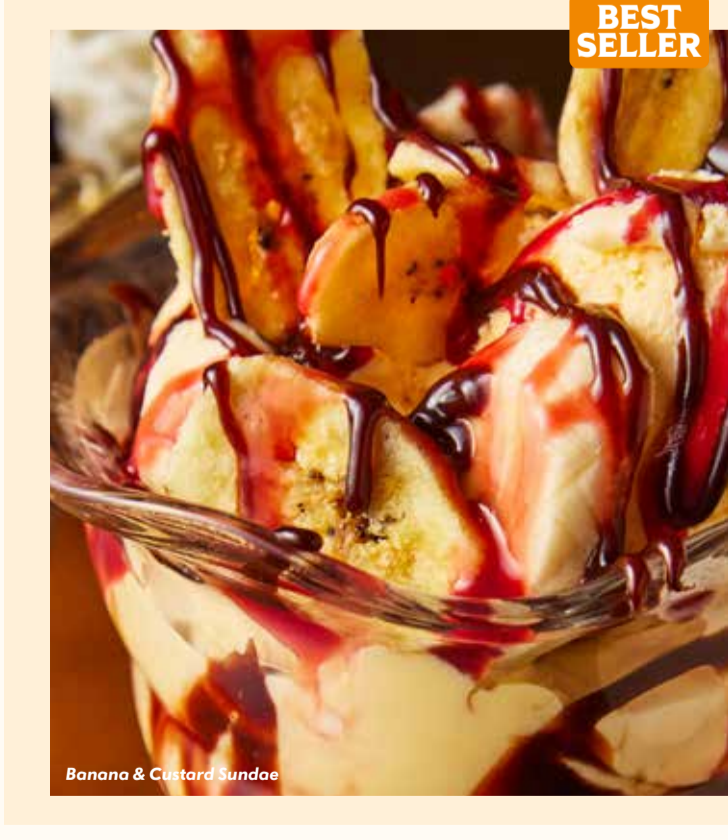
Banana & Custard Sundae

There's always room for pud. Treat yourself to something chocolate, something fruity or maybe just a few scoops of classic vanilla.