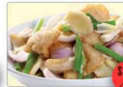
a) 姜蔥魚片 Spring Onion Sliced Fish b) 酸甜魚片 Sweet & Sour Sliced Fish