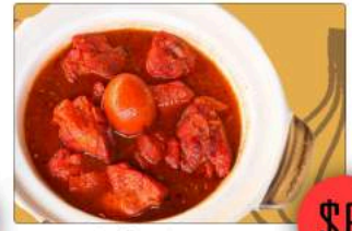
紅糟雞 Red Glutinous Wine Chicken