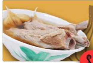
排骨湯 Spare Ribs Soup