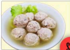
自創肉圓湯 Homemade Meatball Soup