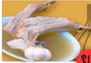
龍骨湯 Premium Loin Ribs