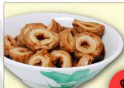
大腸頭 Braised Large Intestines