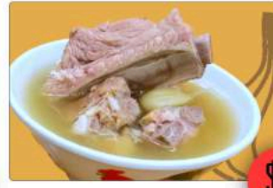
經典肉骨湯 Classic Bak Kut Teh Soup