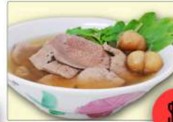
豬肝湯 Pig's Liver Soup