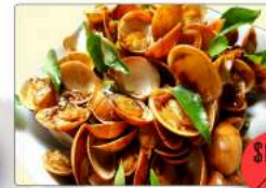
a) 甘香啦啦 Frangant La-La b) 辣椒啦啦 Chilli La-La