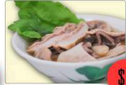
豬肚湯 Pig's Stomach Soup