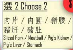
選 2 Choose 2 肉片 / 肉圓 / 豬腰 / 豬肝 / 豬肚 Sliced Pork / Meatball / Pig's Kidney / Pig's Liver / Stomach