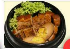
滷肉拼盤 Braised Pork Belly