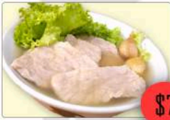
肉片湯 Sliced Pork Soup