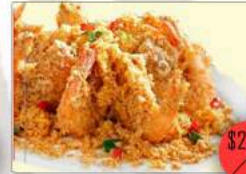
a) 麥片蝦 Cereal Prawns b) 鹹蛋蝦 Salted Egg Prawns