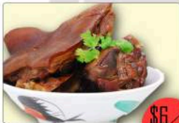
元蹄 Braised Trotters