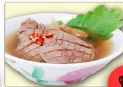
豬腰湯 Pig's Kidney Soup