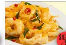
a) 鹹蛋蘇東 Salted Egg Squid b) 叁峇蘇東 Sambal Squid