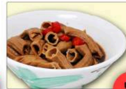
粉腸 Braised Small Intestines