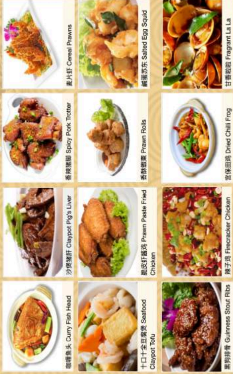
茄片蝦 Cereal Prawns 香酥豬腳 Spicy Pork Trotter 香酥蟹膏 Prawn Rolls 宮保田雞 Dried Chilli Frog 沙茶豬肝 Claypot Pig's Liver 脆皮炸醬雞 Prawn Paste Fried Chicken 辣子雞 Firecracker Chicken 脆滑魚頭 Curry Fish Head 十口十全豆腐羹 Seafood Claypot Tofu 黑羽排骨 Guinness Stout Ribs