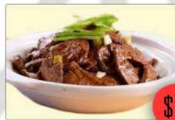
沙煲豬肝 Claypot Liver