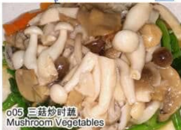
o05 三菇炒时蔬 Mushroom Vegetables