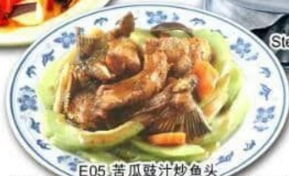
E05 苦瓜豉汁炒鱼头 Bittergourd Black Bean Sauce Fish Head