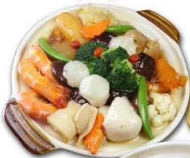
H01 砂煲一品锅 Royal Claypot