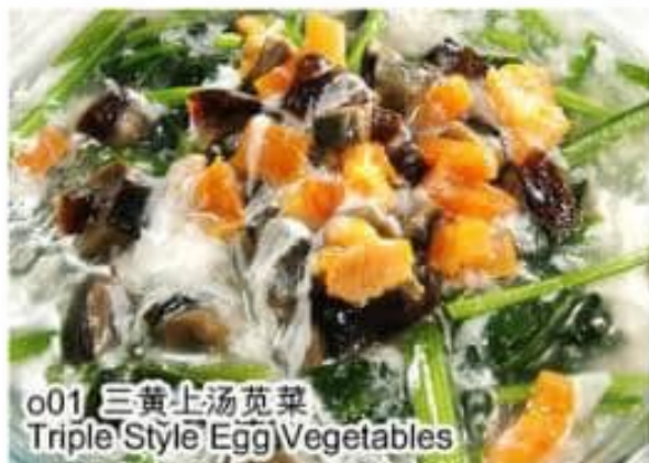
o01 三黄上汤苋菜 Triple Style Egg Vegetables