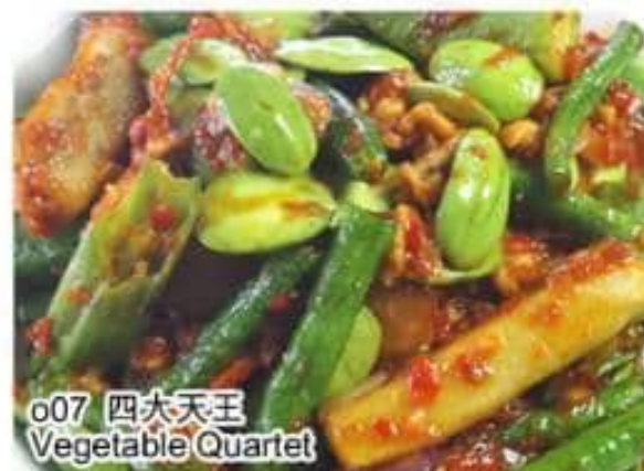
o07 四大天王 Vegetable Quartet