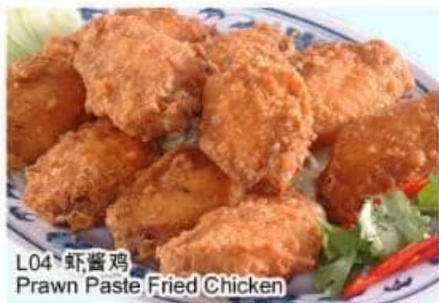
L04 虾酱鸡 Prawn Paste Fried Chicken