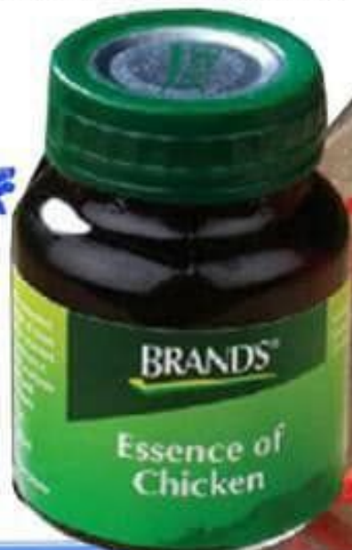
F04 鸡精蒸田鸡 Chicken Essence Steamed Frog