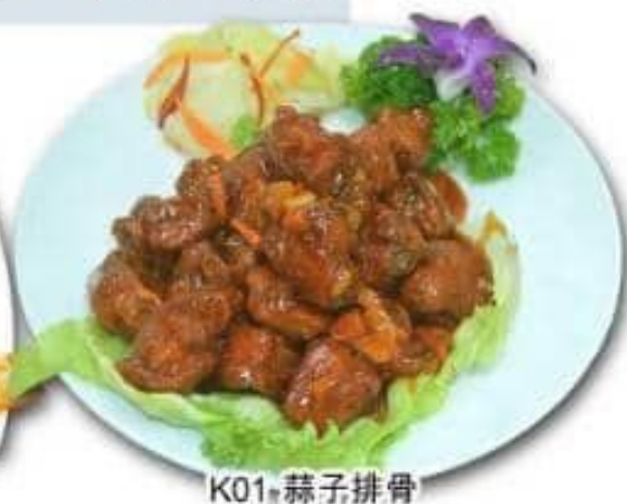
K01 蒜子排骨 Garlic Pork Ribs