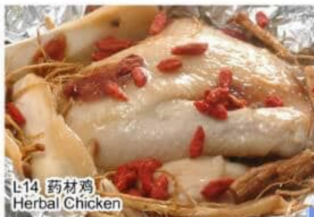
L14 药材鸡 Herbal Chicken