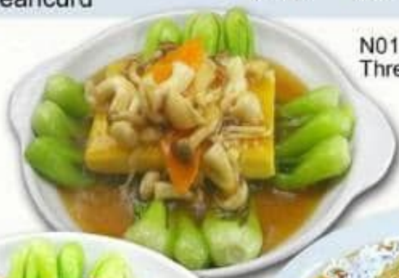
N01 三菇豆腐 Three Mushroom Beancurd