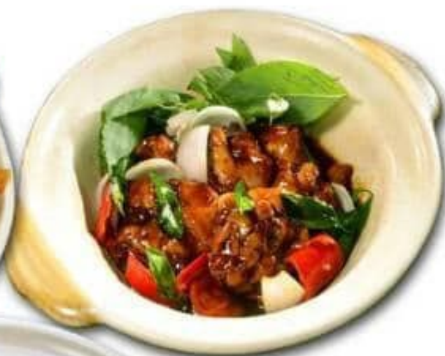
H04 砂煲三杯鸡 Chicken Claypot