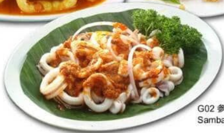
G02 参巴苏东 Sambal Squid