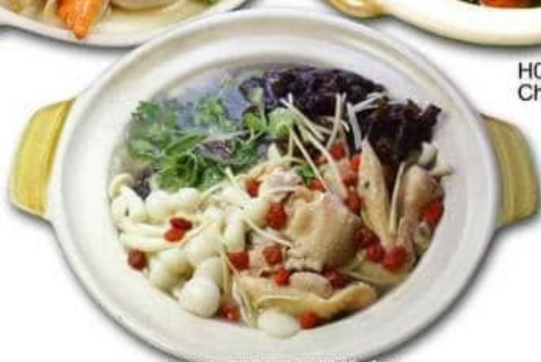
H06 砂煲云耳甘榜鸡汤 Kampong Chicken Claypot