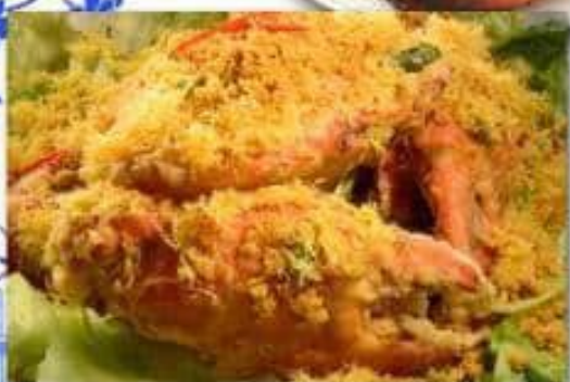
B07 麦片炒螃蟹 Cereal Crab