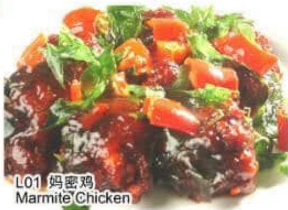
L01 妈密鸡 Marmite Chicken