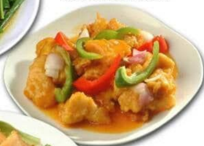
i2 酸甜鱼片 Sour & Sweet Sliced Fish