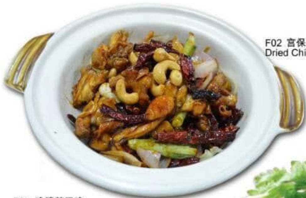
F02 宫保田鸡 Dried Chili Frog

F04 鸡精蒸田鸡 鸡精 Chicken Essence +$4 Chicken Essence Steamed Frog