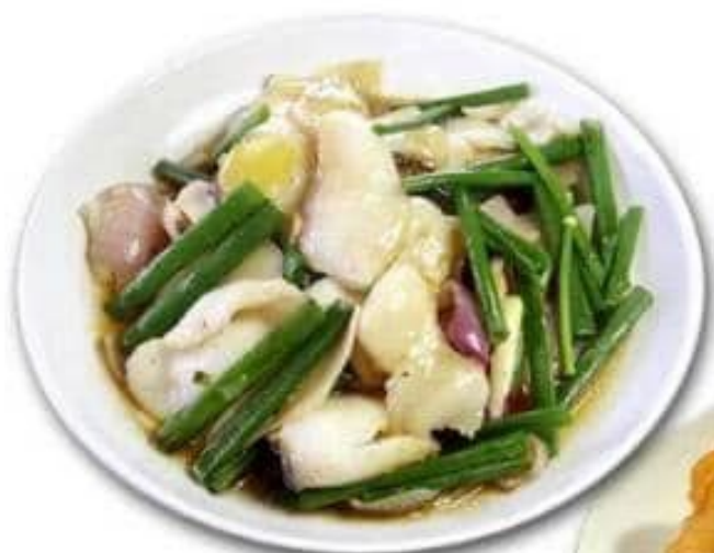
i1 姜葱炒鱼片 Spring Onion Sliced Fish