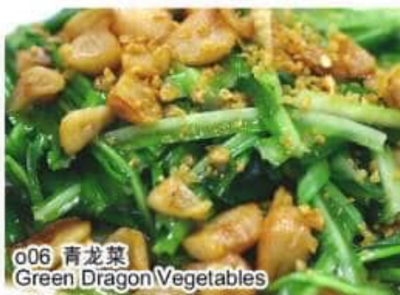
o06 青龙菜 Green Dragon Vegetables