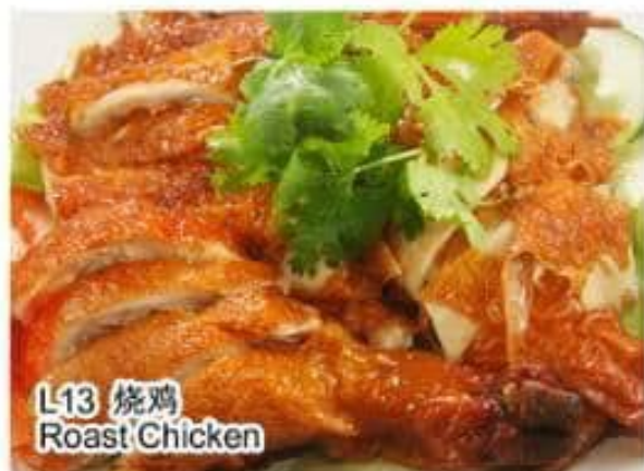
L13 烧鸡 Roast Chicken