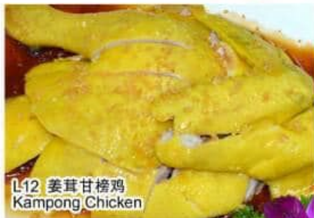
L12 姜茸甘榜鸡 Kampong Chicken