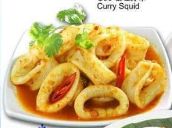
G03 咖喱苏东 Curry Squid