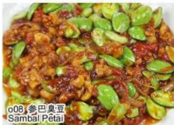
o08 参巴臭豆 Sambal Petai