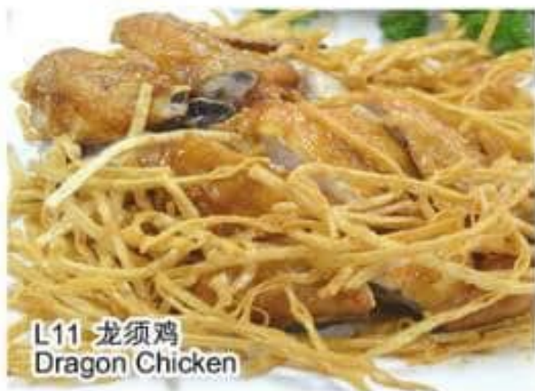
L11 龙须鸡 Dragon Chicken