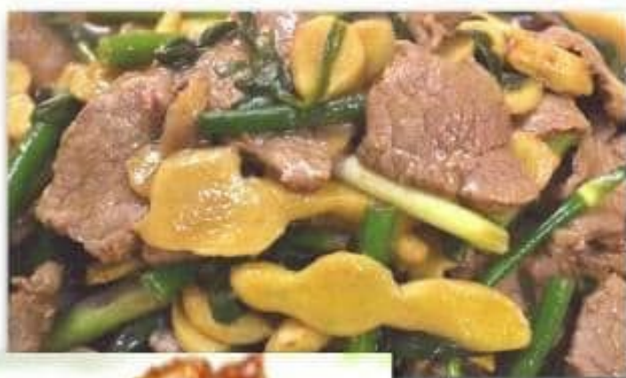
M02 姜葱牛肉 Ginger & Onion Beef