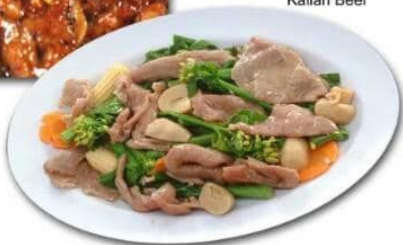
M03 芥兰牛肉 Kailan Beef