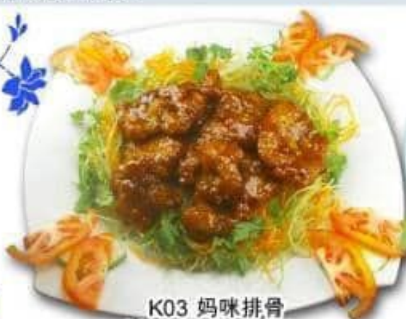
K03 妈咪排骨 Marmite Pork Ribs