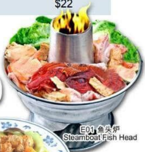
E01 鱼头炉 Steamboat Fish Head