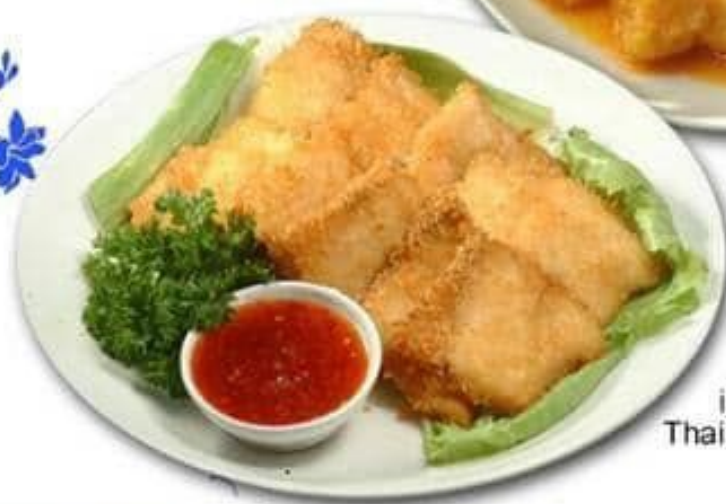
i5 泰式炸鱼片 Thai Style Sliced Fish