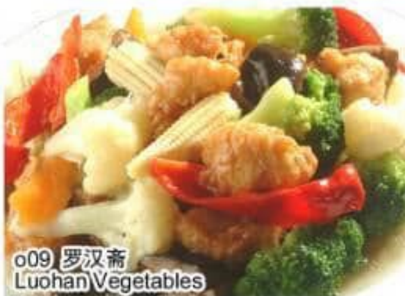
o09 罗汉斋 Luohan Vegetables