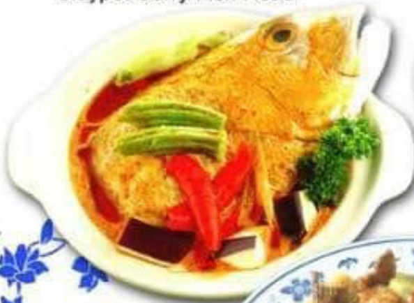
E03 砂煲咖喱鱼头 Claypot Curry Fish Head