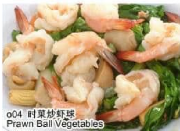
o04 时菜炒虾球 Prawn Ball Vegetables