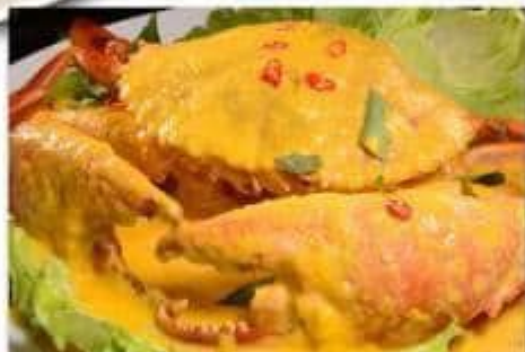
B08 咸蛋炒螃蟹 Salted Egg Crab