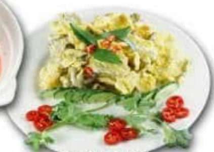
A06)咸蛋鱼皮 Salted Egg Fish Skins