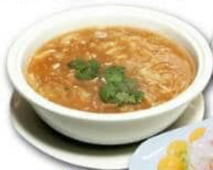
A03)蟹王鱼翅 Crab Meat with Shark Fins