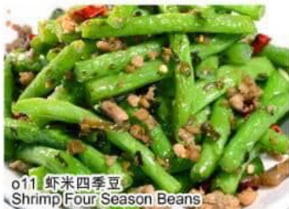
o11 虾米四季豆 Shrimp Four Season Beans