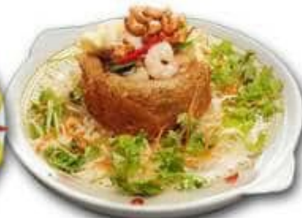
A07)佛钵飘香 Yam Ring