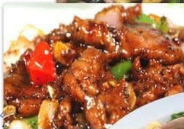
M01 黑椒牛肉 Black Pepper Bee