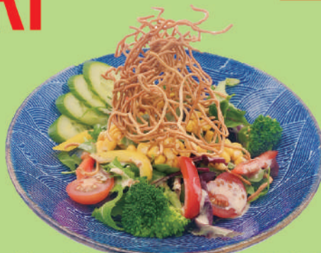
Bari Bari Salad €7,80

BARI BARI : crispy noodles. Break in small pieces & mix. Salad for 2 , 3 persons