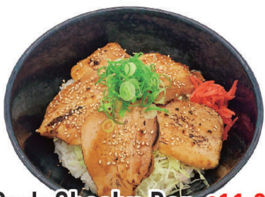
Pork Chashu Don €11,80

Chicken Schnitzel with a home made sauce