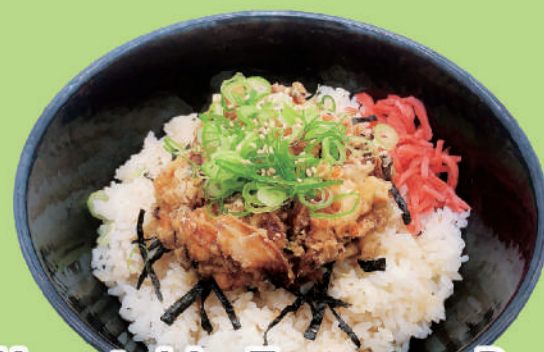
Vegetable Tempura Don

Vegetable Tempura on a bed of nori and rice with Japanese pickles (Benishoga)