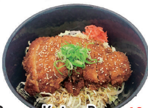
Sauce Katsu Don €12,80

Chicken Schnitzel with a home made sauce