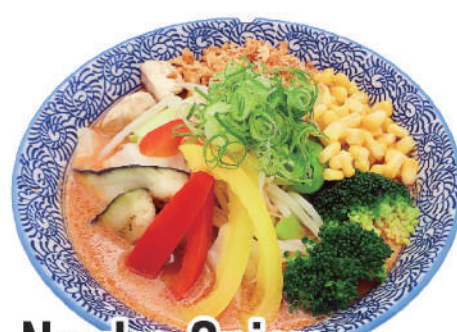
Nouko Spicy Vegetable Ramen €14,00