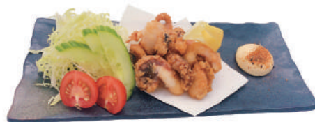
Fried Octopus €8,80

Flame seared mackerel sashimi with shiso leaves