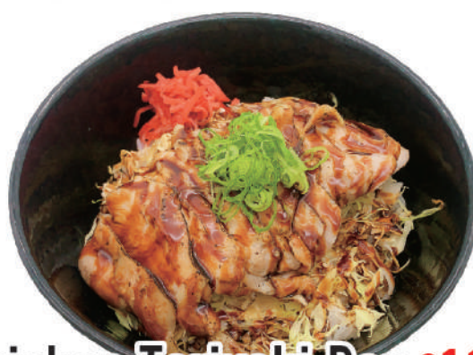
Chicken Teriyaki Don €11,80

Grilled Pork with a garlic Teriyaki sauce