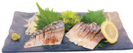
Aburi Mackerel €8,90

Flame seared salmon sashimi on a bed of salad