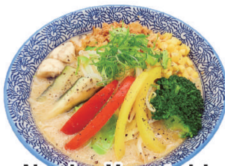
Nouko Vegetable Ramen €13,50