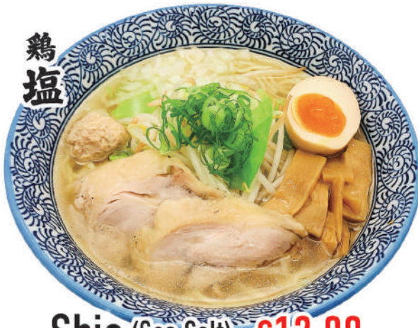
Shio (Sea Salt) €12,90