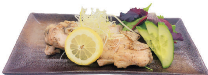
Aburi Tori chashu €7,80