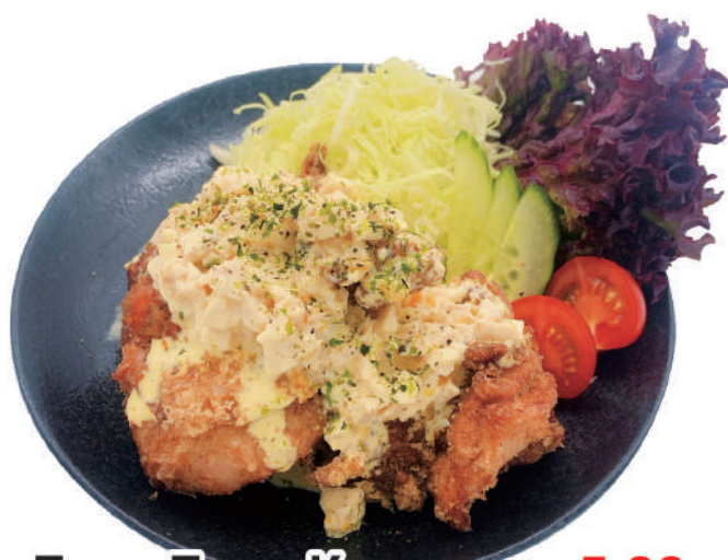
Taru Taru Karaage €7,90

Karaage with tartar sauce (mayo, egg & white onion)