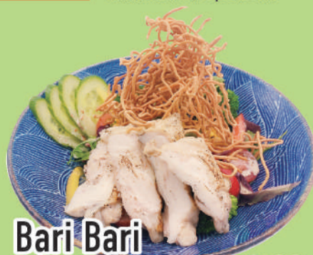
Bari Bari Chicken Salad €9,80