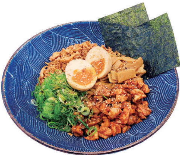
SPICY MAZESOBA €15,00