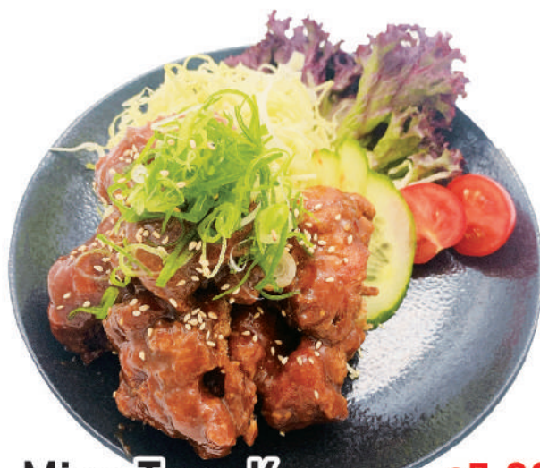
Miso Tare Karaage €7,90