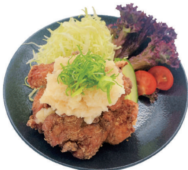
Daikon Oroshi Karaage

Karaage with home made sweet chili sauce