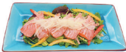
Aburi Salmon €9,80

Flame seared salmon sashimi on a bed of salad