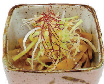
Spicy Menma €4,00