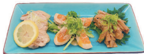
Tapas Trilogy €7,80

Soft boiled marinated eggs with salad topping