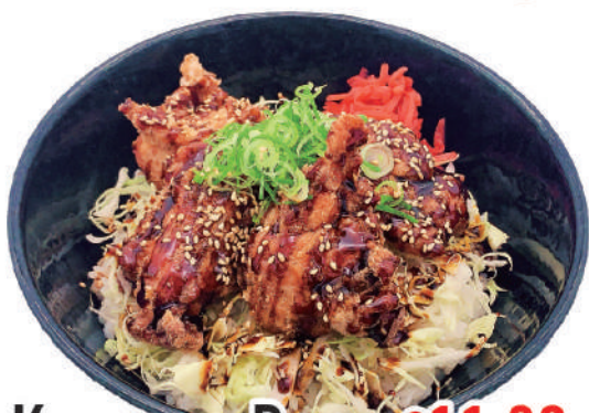
Karaage Don €11,80