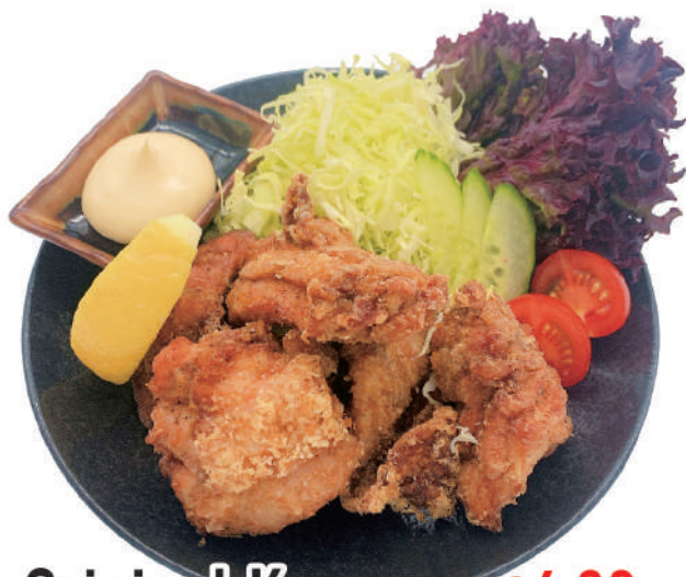
Original Karaage €6,90

Karaage is a dish that is made from marinated pieces of chicken that are fried after being covered in a special flour mix. Very tasty and delicious.