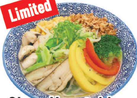
Clear Vegetable Ramen €12,50