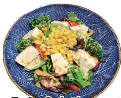
Tofu Salad €8,80