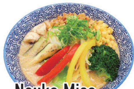
Nouko Miso Vegetable Ramen €14,00