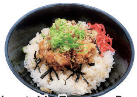
Vegetable Tempura Don €9,80

Vegetable Tempura on a bed of nori and rice with Japanese pickles (Benishoga)