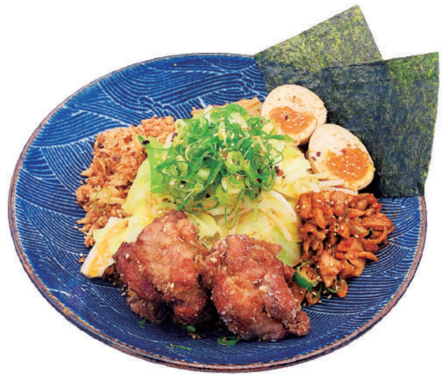
DELUXE SPICY MAZESOBA €17,40