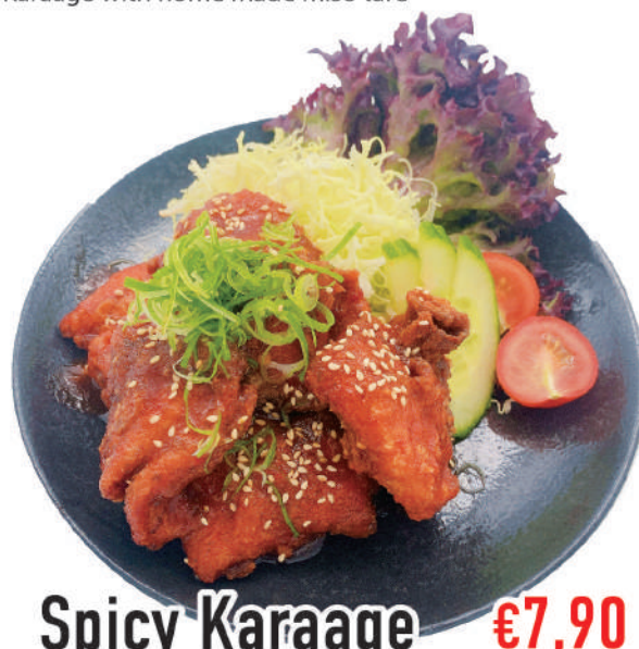
Spicy Karaage €7,90

Karaage with tartar sauce (mayo, egg & white onion)