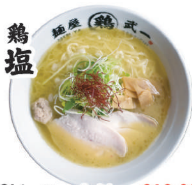
Shio (Sea Salt) €13,80