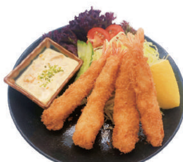
Ebi Fry €8,80