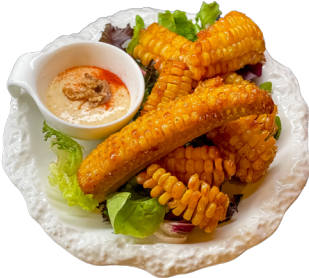
Salt & Pepper Corn Ribs (V) 15 椒鹽玉米配柚子醬 Seasoned corn ribs withYuzu Mayo