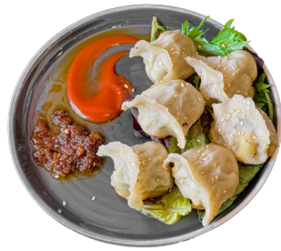
Pan Fried Dumplings(6pcs) (V/VG) 16 (Pork/Eggplant/Veggie) 手工煎餃(豬肉/茄子/蔬菜)