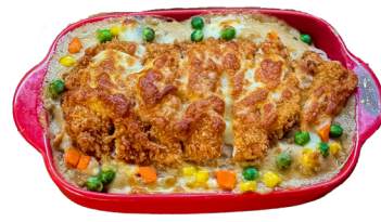
Chicken Katsu Mushroom Baked 25 Rice/Spaghetti Classic Hong Kong baked rice with Chicken Katsu & Mushroom sauce