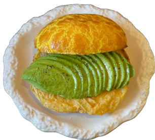
Pineapple Bun with 15 Avo & Scrambled egg 牛油果炒蛋菠蘿包