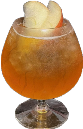
BON APPLE TEA Cointreau, Apple Juice, Black Tea