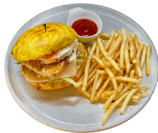
Fried Chicken Pineapple Burger 25 炸雞菠蘿漢堡 Chicken Thigh, sunny side up egg, Cheddar cheese, lettues, fries