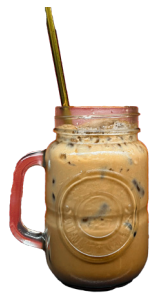
Classic Hong Kong Milk Tea 港式絲襪奶茶