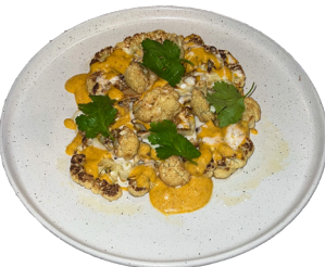
Cauliflower Steak with coconut 24 curry Sauce (V/VG) 葡式咖哩椰菜花 Seasoned Cauliflower Steak, Hong Kong Curry Coconut Sauce