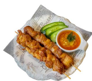
Satay Chicken Skewers(2pcs) 10 沙嗲雞串