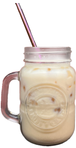
Horlicks 好立克 A malted milk drink that everybody love