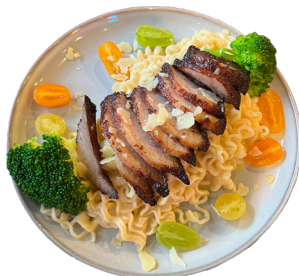
Pork Neck Cheesy Noodle 25 豬頸肉芝士麵 Grilled Pork Neck, Cheese sauce,sunny side up egg, instant noodle