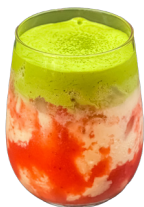
Strawberry Matcha Cloud 10