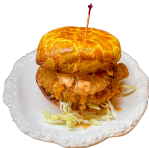
Pork Katsu Pineapple Burger 25 有菠蘿的吉列豬扒菠蘿包 Pork Katsu, Caramelized pineapple , Cabbage, Periperi sauce, fries