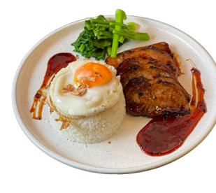
Char Siu Pork Rice 25 黯然銷魂飯 Homemade Char Siu, Chinese broccoli, sunny side up egg