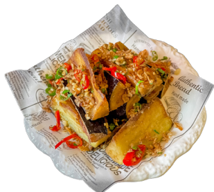
Salt & Pepper Eggplants (V/VG) 16 椒鹽茄子 🌶️