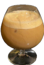
CHAA CHANG TANG Hennessy, Hong Kong Milk Tea