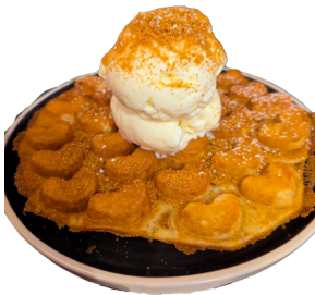
Hong Kong Egg Waffle - Original 12 - Vanilla Ice Cream 14