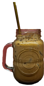
Yuenyeung Milk tea with coffee 鴛鴦