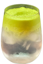
Coconut Matcha Cloud 9