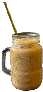
Milk Tea w/ condensed Milk 茶走