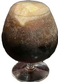
BLACK COW Hennessy, Coke, Vanilla Ice-Cream