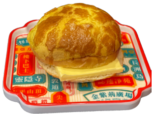
Pineapple Bun with Butter 10 冰火菠蘿油 Crispy & Hot outside, Soft & Cool Butter inside