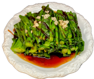
Chinese Broccoli w/ Oyster Sauce 16 蠔油芥蘭 (V/VG)