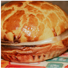
Mochi Pineapple Bun 13 Chewy Mochi, condensed Milk