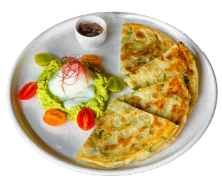
Smashed Avo with Sallot Pancake 22 溫泉蛋牛油果配蔥油餅 (V) 63°C Onsen Egg with Smashed Avo & Homemade Shallot Pancake