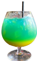
South King Beach 15 Orange juice, Blue curacao, Soda