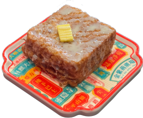
Hong Kong French Toast 12 (Peanut Butter/Nutella/Biscoff) (Mochi + $3) 港式西多士(花生醬/榛子醬/焦糖醬)