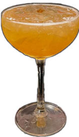
FAFA Cointreau, Osmanthus Honey, Black Tea