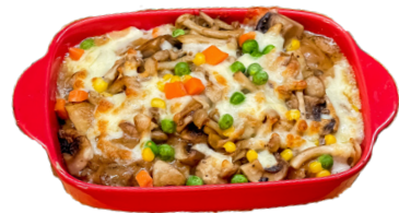
All Mushroom Baked Rice/ 25 Spaghetti(V) For all mushroom lovers, Grilled Mushroom with Mushroom sauce