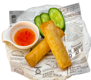
Veggies Spring Rolls (2pcs) (V/VG) 8 素菜春卷