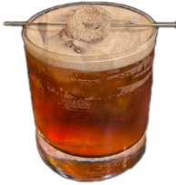
MK MERMORY Plum infused Whiskey, Oolong Tea, Plum syrup