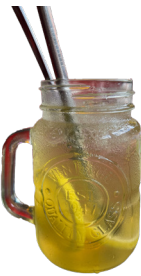
Lemon Honey 檸蜜