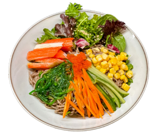
Garlic Cold Noodle Salad 15 港式冷麵 Seaweed Salad, Corns, Crab Sticks, Fish Roe