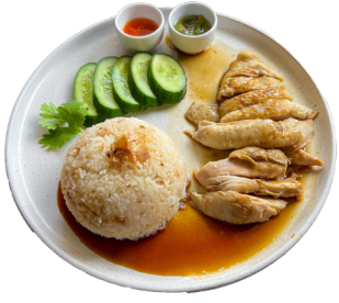
Hai-Nan Chicken Rice 25 海南雞飯 Poached chicken, Chicken oil rice, Chilli & Ginger shallot sauce