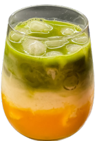
Mango Matcha Latte 10