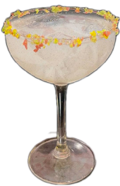
ASIAN FETISH Peach Liquor, Calpis, Soda, Popping Candy