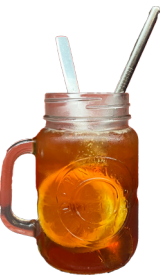
Lemon Tea 檸茶