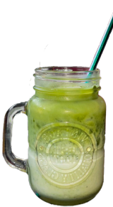
Matcha Latte H 6 | C 7.5