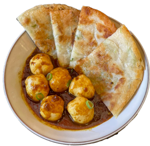
Curry Fish Ball 14 w/ shallot pancake 咖哩魚蛋配蔥油餅 🌶️ Authentic HK street food with handmade Shallot pancake