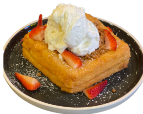
Black and White Toast 18 黑松露白朱古力吐司 Black Truffle, white chocolate, mascarpone, vanilla ice cream, seasonal fruit, maple syrup