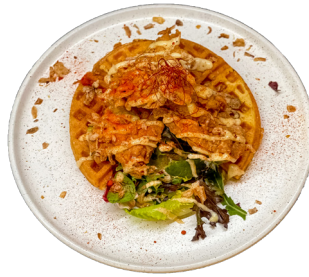
Yuzu Fried Chicken Waffle 24 秘制柚子醬炸雞窩夫 Fried Chicken, mixed salad, Yuzu dressing, Dried shallot, Paprika, Waffle