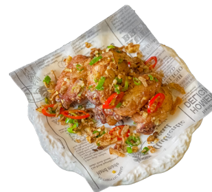
Salt & Pepper Wings (6pcs) 16 椒鹽雞翼 🌶️