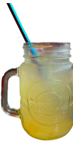
Citron Ginger Honey 柚子蜜