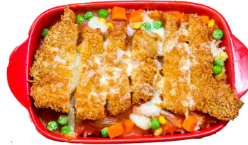
Pork Katsu Tomato Sauce Baked 25 Rice/Spaghetti Classic Hong Kong baked rice with Pork Katsu & Tomato sauce