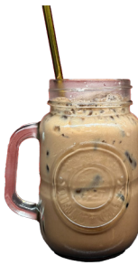
Ovaltine 阿華田 Wait what? It's better than Milo?