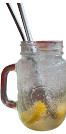
Salted Lemon Soda 咸檸七