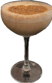
OVALTINE MATINI Baileys, Vodka, Ovaline, Milk