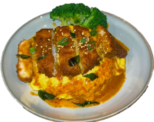
Pork Katsu Curry Don Rice 25 葡式咖哩滑蛋吉列豬扒飯 🌶️ Pork Katsu, Coconut Curry,Scrambled egg, Broccoli