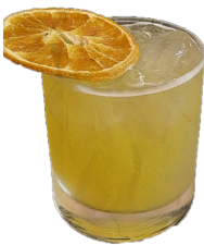
HONEY BABY Whiskey, Lemon, Orange juice, Honey