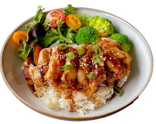
Teriyaki Chicken Don Rice 24 照燒雞扒丼飯 Terriyaki Chicken, Salad, Broccoli