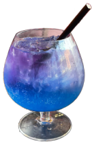
Newtown Galaxy 15 Blue citrus, lemon, Butterfly Pea Flower Tea, Soda