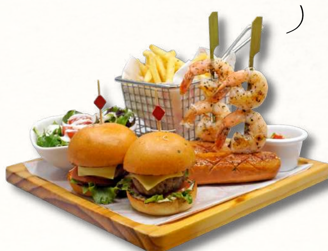
HALF COURSE PLATTER